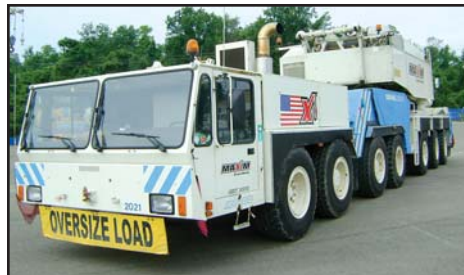
'98 DEMAG AC1300 500 TON