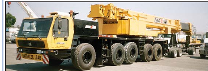
'95 KRUPP KMK5160/5175 175 TON

#2709 1995 KRUPP Model KMK5160/5175, 175 Ton All Terrain Crane , s/n 51608090, powered by Mercedes OM366LA diesel engine, equipped with 43'-161' 5-section hydraulic boom, 108' lattice jib including 33'-59' swing-away jib and (3) 16' inserts, main and auxiliary hoists, Krupp EKS LMI system, Johnson 100 ton 7-sheave hook block, Miller 200# ball, 7-piece 99,200# rear removable counterweight, mounted on 10x6x8 carrier, powered by Mercedes OM442LA diesel engine and Allison automatic transmission, equipped with (4) hydraulic outriggers and 20.5R25 tires. In good condition with very good tires. Equipped with Tri-Axle Boom Dolly with float kit. (Fontana, CA)