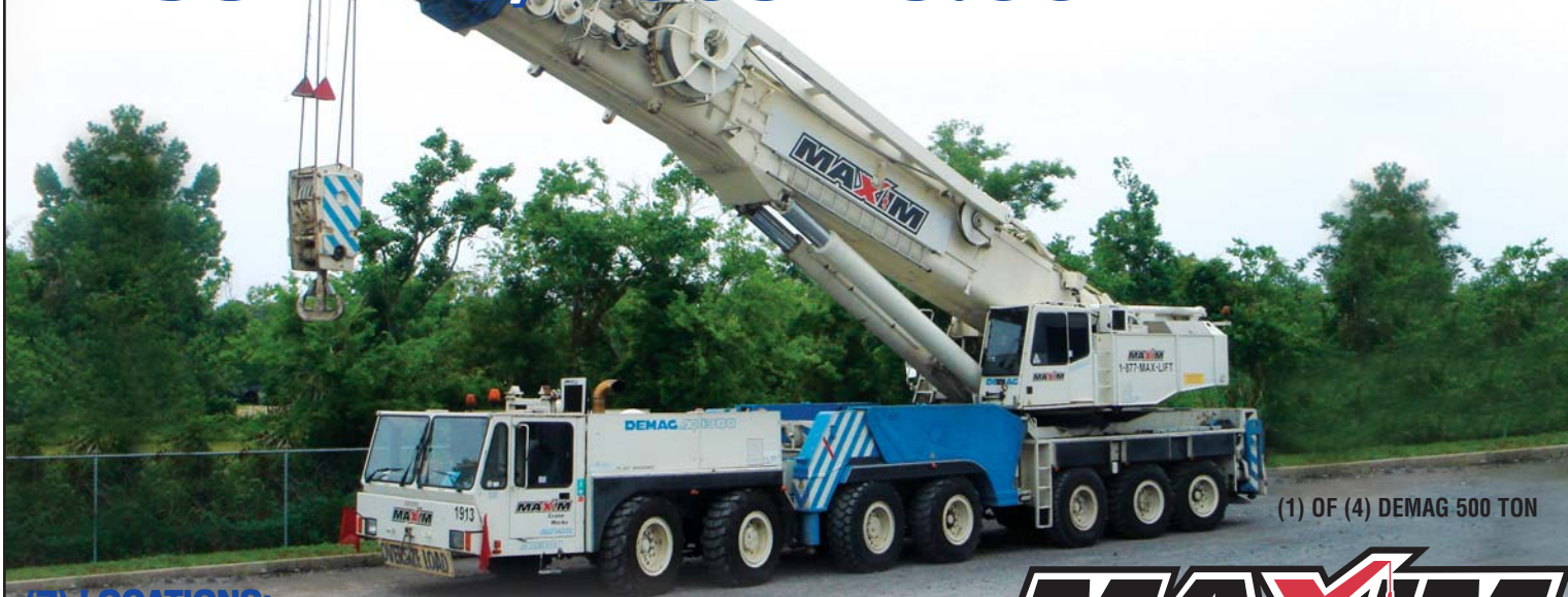
(1) OF (4) DEMAG 500 TON

BID DEADLINE: WEDNESDAY, JULY 29, 2009 - 5:00PM EDT