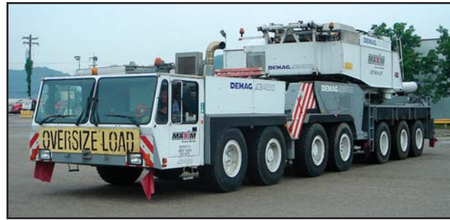
'98 DEMAG AC400/1300 500 TON