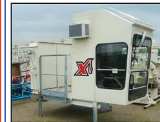
'98 PEINER SK405 22 TON