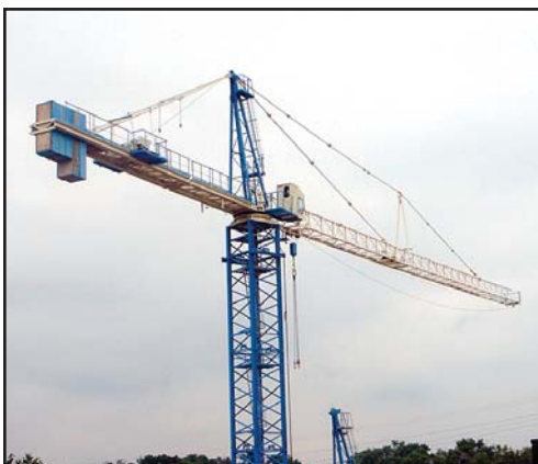
(1) OF (6) TOWER CRANES

PRE-SORTED FIRST CLASS MAIL US POSTAGE PAID HAVERTOWN, PA PERMIT #45