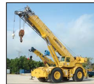
(1) OF (3) GROVE RT9100 100 TON

1440 COWPATH RD. • HATFIELD, PA 19440 215/361-9099 • Fax: 215/361-9212