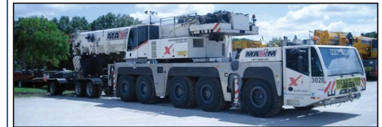
'04 DEMAG AC140 170 TON

#3028 2004 DEMAG Model AC140, 170 Ton All Terrain Crane , s/n 14106, powered by Daimler-Chrysler OM904LA diesel engine, equipped with 41'-197' 6-section hydraulic boom, 29.9'-108.3' folding swing-away jib, main and auxiliary hoists, Demag 1C-1 LMI system, 86,000# rear removable counterweights, mounted on Demag 10x8x8 carrier, powered by Daimler-Chrysler OM502LA diesel engine and ZF automatic transmission, equipped with (4) hydraulic outriggers and 20.5R25 tires. In good condition with fair to good tires. Equipped with 2005 NELSON Model CBC 30WS Tri-Axle Boom Dolly, s/n 1N9G62A3251012931, equipped with 225/70R22.5 tires. (Orlando, FL)