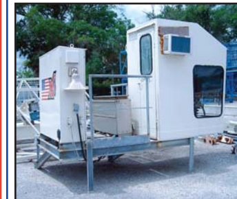
'97 PEINER SK405 22 TON