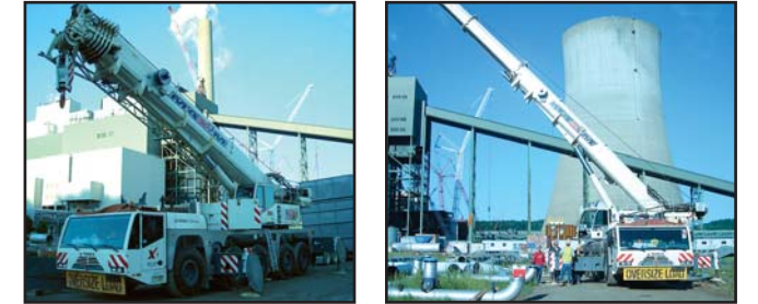
'05 DEMAG AC140 170 TON

#3116 2005 DEMAG Model AC140, 170 Ton All Terrain Crane , s/n 14129, powered by Daimler-Chrysler OM904LA diesel engine, equipped with 41'-197' 6-section hydraulic boom, 29.9'-108.3' folding swing-away jib, main and auxiliary hoists, Demag 1C-1 LMI system, 86,000# rear removable counterweights, mounted on Demag 10x8x8 carrier, powered by Daimler-Chrysler OM502LA diesel engine and ZF automatic transmission, equipped with (4) hydraulic outriggers and 20.5R25 tires. In good condition with good tires. Equipped with NELSON Model CBC 20S, 9'x8' Tandem Axle Boom Dolly, s/n 4464, equipped with 11R22.5 tires. (Wilder, KY)