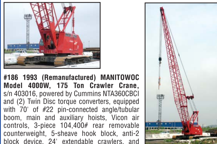
'93 MANITOWOC 4000W 175 TON

#186 1993 (Remanufactured) MANITOWOC Model 4000W, 175 Ton Crawler Crane , s/n 403016, powered by Cummins NTA360CBCI and (2) Twin Disc torque converters, equipped with 70' of #22 pin-connected angle/tubular boom, main and auxiliary hoists, Vicon air controls, 3-piece 104,400# rear removable counterweight, 5-sheave hook block, anti-2 block device, 24' extendable crawlers, and 48" pads. In good condition with good undercarriage. (Baltimore, MD) #180A MANITOWOC Model 4000W Ringer Attachment , s/n 1027, equipped with 4-piece 36" diameter ring assembly. (Not Complete) (Wilders, KY) (6) MANITOWOC Model 4000 Tower Assemblies , s/n 13038, 13206, 13057, 13219, 13227, and 13030, equipped with tower cap, butt sections, (2) 40' inserts, head section, and basic back stay pendants.