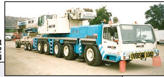
'97 LIEBHERR LTM1160-2 225 TON