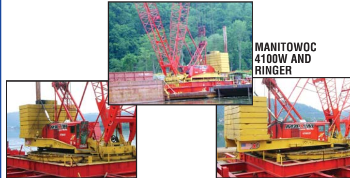
MANITOWOC 4100W AND RINGER

#1380 1988 (Remanufactured) MANITOWOC Model 4100W Series II, 230 Ton Crawler Crane , s/n 413198, powered by Cummins NTA360CBCI and (2) Twin Disc torque converters, equipped with 70' of #22 pin connected angle/tubular boom, main and auxiliary hoists, Vicon air controls, CraneSmart LMI system, 3-piece 122,400# rear removable counterweight, 26'6" extendable crawlers, and 48" pads. In good condition with good undercarriage. (Machine Only Has Series I Counterweights) (In Use With Ringer Attachment - Will Be Offered Separately and As An Entirety) (Steubenville, OH Jobsite) #170a MANITOWOC Model 4100W Series III Ringer Attachment , s/n 10120Z, equipped with 4-piece 36" diameter ring assembly, (4) hydraulic jacks, 275,000# counterweights, and 260' of #27 angle/tubular boom. In good condition. (Ringer In Use With Unit #1380 - Manitowoc 4100W, s/n 413198 - Will Be Offered Separately and As An Entirety) (Steubenville, OH Jobsite)