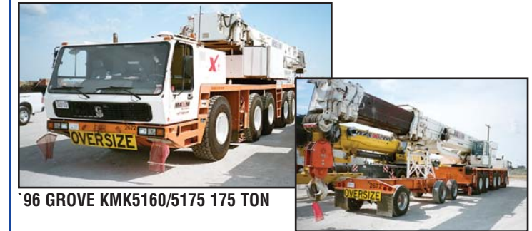
'96 GROVE KMK5160/5175 175 TON

#2672 1996 GROVE Model GMK5160/5175, 175 Ton All Terrain Crane , s/n 51608120, powered by Mercedes OM366A diesel engine, equipped with 43'-161' 5-section hydraulic boom, 141' lattice jib including 33'-59' swing-away jib and (5) 16' inserts, main and auxiliary hoists, Krupp EKS LMI system, 7-piece 99,200# rear removable counterweight, mounted on 10x8x10 carrier, powered by Mercedes OM442LA diesel engine and Allison automatic transmission, equipped with (4) hydraulic outriggers and 20.5R25 tires. In good condition with good to very good tires. Equipped with Tri-Axle Boom Dolly with float kit. (Fontana, CA)