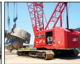
MANITOWOC 4100W II 230 TON