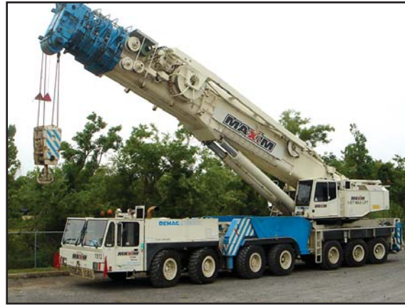
'98 DEMAG AC1300 500 TON