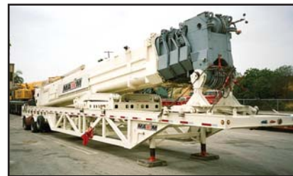
'00 KALYN-SIEBERT BOOM LAUNCHER

#6591 2000 KALYN-SIEBERT Model KDP-4-70 Tandem Axle Boom Launcher Trailer , VIN# 5DDKM5842Y1000670, equipped with hydraulic boom lift. In good condition with good tires. (Fontana, CA)