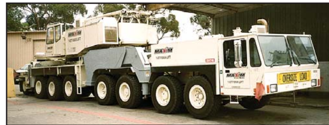
'98 DEMAG AC1300 500 TON

#1858 1998 DEMAG Model AC1300, 500 Ton All Terrain Crane , s/n 79047, powered by Mercedes 366-901 diesel engine, equipped with 49'-190' 5-section hydraulic boom, SuperLift package, 9-piece 256' luffing/177' fixed jib, main and auxiliary hoists, Demag PDC350 LMI system, 14-piece 269,000# rear removable counterweight, hook block, mounted on Demag 14x6x12 carrier with booster axle, powered by Mercedes 442LA diesel engine and 8 speed transmission, equipped with (2) side swing out outriggers and (2) rear hydraulic outriggers, and 17.5R25 tires. In good condition with good tires. (Fontana, CA)