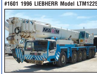
'96 LIEBHERR LTM1225 300 TON

#1601 1996 LIEBHERR Model LTM1225, 300 Ton All Terrain Crane , s/n 0022872, powered by Liebherr D916 diesel engine, equipped with 50'-197' 5-section hydraulic boom, 46'-138' lattice jib, main and auxiliary hoist, Liebherr integrated LMI system, 176,400# rear removable counterweight, Liebherr 125 ton 3-sheave sister hook block, Liebherr 12x6x10 carrier, powered by Liebherr D9408T1 diesel engine and automatic transmission, equipped with (4) hydraulic outriggers, and 20.5R25 tires. In good condition with good to very good tires. Equipped with Boom Dolly. (LaPorte, TX)