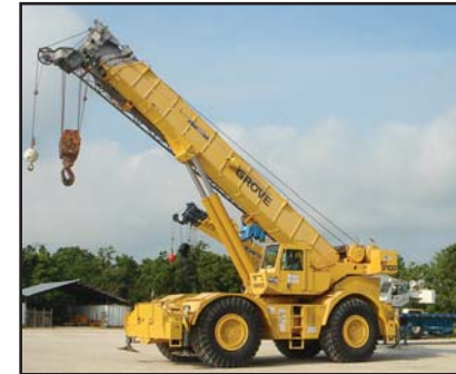
'01 GROVE RT9100 100 TON

#2768 2001 GROVE Model RT9100 , 100 Ton Hydraulic Rough Terrain Crane, s/n 221713, powered by Cummins 6CTA-260 diesel engine ('06 reconditioned) and 3 speed powershift transmission, equipped with 36'-114' 4-section hydraulic boom, 33'-58' telescopic swing-away jib, Grove H030B-26G main and auxiliary hoists, PAT DS350 LMI system, 8-sheave hook block and ball, (4) hydraulic outriggers, and 33.25x35 tires. In good condition with good tires. (LaPorte, TX)