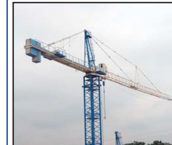
'96 PEINER SK315 13.5 TON