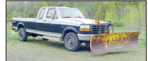
'92 FORD F-250 4X4

1992 FORD Model F-250, 4x4 Extended Cab Pickup Truck , powered by 8 cylinder gas engine and 5 speed transmission, equipped with 8' bed, Fisher 8' angle snowplow with lights and controls, dual fuel tank, and 235/85R16 tires. In fair to good condition with fair to good tires.