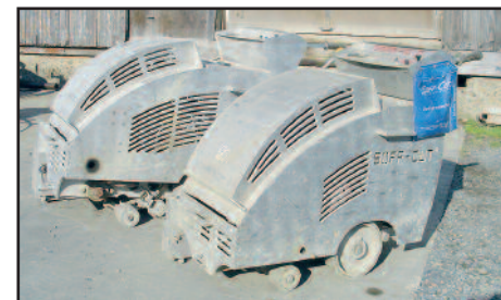
SOFF-CUT GX4000 & G2000