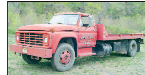
FORD F-600 ROLL-BACK

1979 FORD Model F-600 Single Axle Roll-Back Truck , powered by 8 cylinder gas engine and automatic transmission, equipped with Cambridge 20' body with winch, and 9.00x20 tires. In fair condition with fair tires.