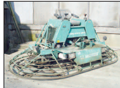
'98 MULTIQUIP-WHITEMAN 5'

engine and hydrostatic transmission, equipped with 18" blades. In good condition. (434 Original Hours) 1998 MULTIQUIP/WHITEMAN Model STH55JDTCSL, 5' Riding Concrete Trowel , s/n 1J60648, powered by John Deere 220, 4 cylinder diesel engine and hydrostatic transmission, equipped with 23" blades. In good condition. (455 Original Hours) 1998 MULTIQUIP/WHITEMAN Model STH55J0TCSL, 5' Riding Concrete Trowel , s/n IF60299, powered by John Deere 220, 4 cylinder diesel engine and hydrostatic transmission, equipped with 23" blades. In good condition. (406 Original Hours) MULTIQUIP/WHITEMAN Model SRT-304-EP-SL, 5' Riding Concrete Trowel , s/n NK32864, powered by Yanmar 3 cylinder diesel, equipped with 24.5" blades. In good condition. 1999 MULTIQUIP/WHITEMAN Model JTN20HTCSL, 3' Riding Concrete Trowel , s/n HI61788, powered by Honda 20HP gas engine. In good condition. (317 Original Hours) 2001 MULTIQUIP/WHITEMAN Model JWN24HTCSL, 3' Riding Concrete Trowel , s/n FG0200873, powered by Honda 20HP gas engine. In good condition. MULTIQUIP/WHITEMAN 4' Riding Concrete Trowel , s/n UNKNOWN, powered by Honda 18HP gas engine, equipped with 18' blades. In fair to good condition. BARTELL Model BTL88, 4' Riding Concrete Trowel , s/n 014, powered by Kohler 20HP gas engine, equipped with 18" blades. In fair condition. BARTELL Model TR88, 4' Riding Concrete Trowel , s/n 027, powered by Kohler Magnum 20 gas engine. In fair condition. BARTELL Model TR88, 4' Riding Concrete Trowel , s/n 002