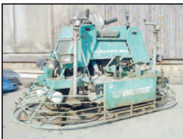
'98 MULTIQUIP-WHITEMAN 4'