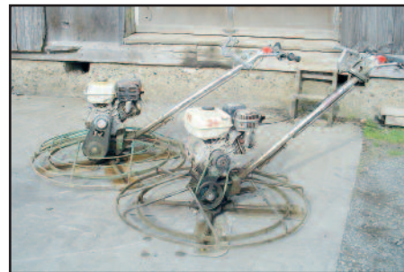
(2) OF (18) WHITEMAN 4'

(5) WHITEMAN 3' Walk-Behind Concrete Trowels , powered by Briggs & Stratton 5HP gas engine (18) WHITEMAN 4' Walk-Behind Concrete Trowel , (7) powered by Honda 8HP and (11) powered by Wisconsin 7HP gas engine. BARTELL 2' Concrete Edger , powered by Honda 4HP gas engine Assorted 4' and 5' Trowel Pans and Finishing Blades