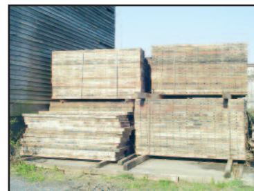
IN EXCESS OF 26,000SF SYMONS CONCRETE FORMS