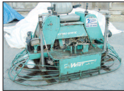
'97 MULTIQUIP-WHITEMAN 4'

engine and hydrostatic transmission, equipped with 18" blades. In good condition. (434 Original Hours) 1998 MULTIQUIP/WHITEMAN Model STH55JDTCSL, 5' Riding Concrete Trowel , s/n 1J60648, powered by John Deere 220, 4 cylinder diesel engine and hydrostatic transmission, equipped with 23" blades. In good condition. (455 Original Hours) 1998 MULTIQUIP/WHITEMAN Model STH55J0TCSL, 5' Riding Concrete Trowel , s/n IF60299, powered by John Deere 220, 4 cylinder diesel engine and hydrostatic transmission, equipped with 23" blades. In good condition. (406 Original Hours) MULTIQUIP/WHITEMAN Model SRT-304-EP-SL, 5' Riding Concrete Trowel , s/n NK32864, powered by Yanmar 3 cylinder diesel, equipped with 24.5" blades. In good condition. 1999 MULTIQUIP/WHITEMAN Model JTN20HTCSL, 3' Riding Concrete Trowel , s/n HI61788, powered by Honda 20HP gas engine. In good condition. (317 Original Hours) 2001 MULTIQUIP/WHITEMAN Model JWN24HTCSL, 3' Riding Concrete Trowel , s/n FG0200873, powered by Honda 20HP gas engine. In good condition. MULTIQUIP/WHITEMAN 4' Riding Concrete Trowel , s/n UNKNOWN, powered by Honda 18HP gas engine, equipped with 18' blades. In fair to good condition. BARTELL Model BTL88, 4' Riding Concrete Trowel , s/n 014, powered by Kohler 20HP gas engine, equipped with 18" blades. In fair condition. BARTELL Model TR88, 4' Riding Concrete Trowel , s/n 027, powered by Kohler Magnum 20 gas engine. In fair condition. BARTELL Model TR88, 4' Riding Concrete Trowel , s/n 002