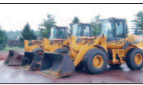
'04 CASE 721D