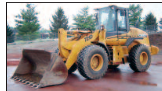
'04 CASE 721D, S/N 135704

2004 CASE Model 721D Rubber Tired Loader , s/n JEE0135704, powered by Iveco 194HP diesel engine and powershift transmission, equipped with ACS 3.25 cubic yard loader bucket with teeth, ACS quick disconnect, auxiliary hydraulics, ride control, enclosed ROPS cab with air conditioning, and 20.5R25 tires. In very good condition with very good tires. (1,051 Original Hours)