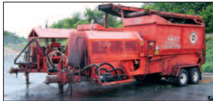
'02 MORBARK 4000P

2003 MORBARK Model 7600A Wood Hog Portable Horizontal Drum Grinder , s/n 185-1050, powered by Cat 3412, 1,000HP diesel engine, equipped with wireless remote control, 76" in-feed opening with 16 cubic yard hopper, 73" hammermill, 60" collecting conveyor, 48" hydraulic folding discharge conveyor with magnetized head pulley, water spray dust suppression system, 6" screen, hydraulic reversing radiator fan, Honda 11HP auxiliary air compressor, mounted on quad-axle trailer with air ride suspension, hydraulic stabilizers, and 255/70R22.5 tires. In very good condition with very good tires. (1,985 Original Hours) (Balance of Cat Engine 5 Year/6,000 Hour Extended Warranty Remaining Through 7/26/08)