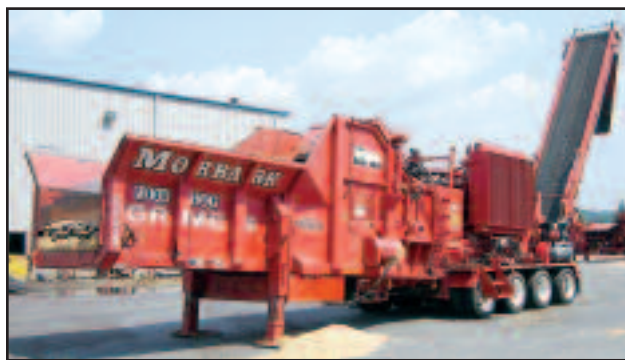
'03 MORBARK 7600A