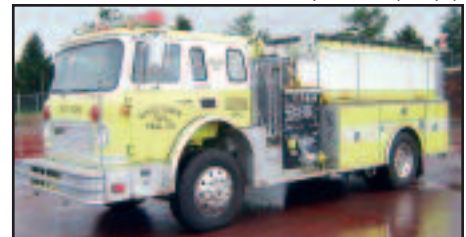
BARTON AMERICAN 750GPM PUMPER

Rotary Salt Spreader, electric, bumper hitch mount (Unused) • (2) FLINK 8' Stainless Steel Tailgate Spreaders • BUYERS 8' Gas Powered Salt Spreader