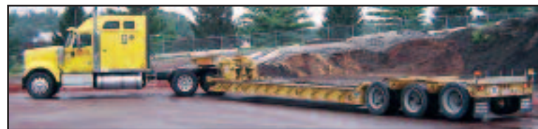
'00 INT'L 9900i AND '00 INTERSTATE 50 TON

2000 INTERNATIONAL Model 9900i Tandem Axle Truck Tractor , powered by Cat 3406, 14.6 liter, 550HP diesel engine and Eaton Fuller 13 speed transmission, equipped with 40,000# rears, 12,000# front axle, 64" walk-in high rise sleeper, wetline kit, 3-stage Jake brake, dual aluminum fuel tanks, 252" wheelbase, air conditioning, cruise control, power windows, locks, and mirrors, aluminum Budd wheels, and 11R24.5 tires. In good condition with good tires.