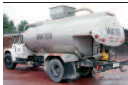
INT'L 1800 WATER TRUCK

1985 FORD Model C800 Single Axle Cab-Over Waste Oil Recovery Truck , powered by V-8 gas engine and 5 speed transmission with 2 speed rear, equipped with Allied 2,200 gallon steel tank, enclosed rear reel and pump compartment, and 153" wheelbase. In fair to good condition with fair to good tires.