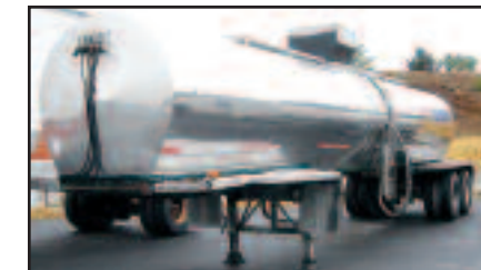
BRENNER WATER TANKER

1974 INTERNATIONAL Model Cargo Star C01950B Single Axle Fire Pumper Truck , powered by Cat 3208 diesel engine and 5 speed transmission with 2 speed rear, equipped with Barton American model E1E750 fire pump body, 750GPM @ 150 PSI, 526GPM @ 200 PSI, 375GPM @ 250 PSI, left, right, and rear discharge valves, center mounted water cannon, station ladder, hoses, work lights, Onan 2500 watt generator, and 11R22.5 tires. In very good condition with very good tires.