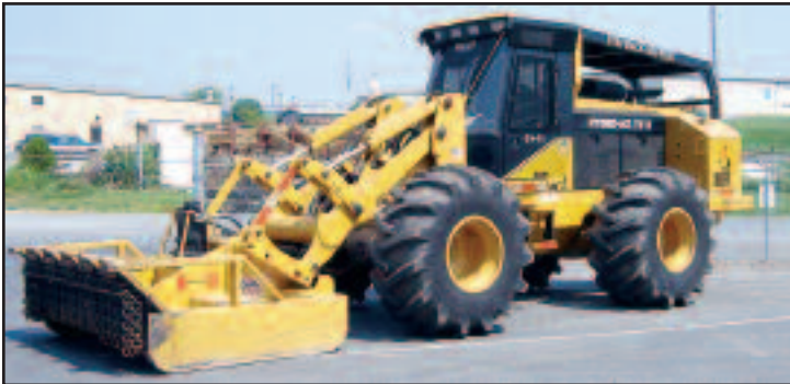
'05 HYDRO-AX 721E

2002 MORBARK Model 4000-P Mulch Coloring System , s/n 173-114, powered by Cummins B3.3, 85HP diesel engine, equipped with 10 cubic yard feed hopper, (3) 20" diameter feed augers, (2) 20" diameter mixing augers, 36" hydraulic folding discharge conveyor, Pacer 5HP 2" liquid dye pump, hydraulic tilt tub, engine enclosures, mounted on tandem axle trailer with hydraulic stabilizer, dual wheels, air brakes, pintle hitch tow, and LT245/75R16 tires. In very good condition with good tires. (1,177 Original Hours)