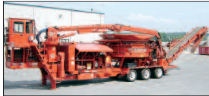
'04 MORBARK 1300

2004 MORBARK Model 1300A Portable Tub Grinder , s/n 571408, powered by Cat 3412, 1,000HP diesel engine, equipped with Morlift model 400, 29' knuckleboom loader with Tarantula 36" grapple with 360° rotation, operator's cab with heat and air conditioning, wireless remote control, 13' tub opening with full hydraulic tilt, mulch color additive system, 40"x28" hydraulic radial and folding discharge conveyor with magnetized head pulley, water spray dust suppression system, 6" screen, hydraulic reversing radiator fan, Honda 11HP auxiliary air compressor, work lights, mounted on tri-axle trailer with air ride suspension and (2) hydraulic stabilizers. In excellent condition. (0,575 Original Hours) (Balance of Cat Engine 5 Year/6,000 Hour Extended Warranty Remaining Through 9/28/09)