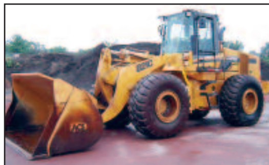
'05 CASE 821C

2005 CASE Model 821C Rubber Tired Loader , s/n JEE0156360, powered by CNH 8.3 liter, 194HP diesel engine and powershift transmission, equipped with ACS 6 cubic yard general purpose loader bucket with bolt-on cutting edge, Dymax quick disconnect, auxiliary hydraulics, ride control, enclosed ROPS cab with air conditioning, and 23.5R25 tires. In excellent condition. (375 Original Hours) (Balance of Case Extended Warranty Remaining Through 12/30/06)