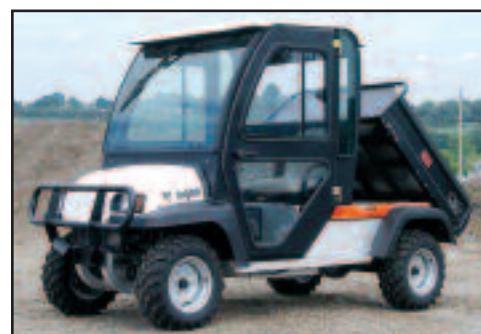
'04 BOBCAT 2200D 4X4

2004 BOBCAT Model 2200D 4x4 Intellitrack Utility Vehicle , s/n 235311230, powered by Kubota D722, 20HP diesel engine and hydrostatic transmission, equipped with hydraulic dump bed, cab with air conditioning, and 23x10.00-12 all terrain tires. In excellent condition. (23 Original Hours) (Balance of Manufacturer Warranty Remaining Through 12/10/05)