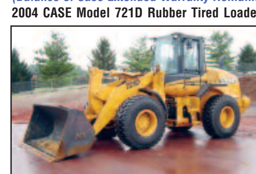
'04 CASE 721D, S/N 137915

conditioning, and 20.5R25 tires. In excellent condition. (167 Original Hours) (Balance of Case Extended Warranty Remaining Through 3/30/07)