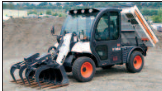
'05 BOBCAT 5600T 4X4X4

2005 BOBCAT Model 5600T Turbo 4x4x4 Tool Cat Utility Vehicle , s/n 424711704, powered by Kubota 56HP diesel engine and hydrostatic transmission, equipped with hydraulic front loader attachment with quick disconnect, Hi-Flow auxiliary hydraulics, hydraulic dump bed, 4-wheel steer, cab with air conditioning and light package, and 27-10.50x15 tires. In excellent condition. (09 Original Hours) (Full Manufacturer's Warranty Begins Day Of Auction)