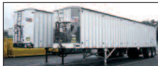
(2) '03 PEERLESS WALKING FLOORS

11R24.5 tires. In very good condition with very good tires. 2003 PEERLESS Model 45-CTSSF, 45' Tandem Axle Walking Floor Trailer , equipped with Keith 3-3/4" aluminum hydraulic walking floor, air ride suspension, Hendrickson weigh-load system, Tru-Sealor dual rear doors, 91" w x 84" h inside dimensions, manual side to side load tarp, 65,000# GVWR, work lights, aluminum Budd wheels, sliding tandems, and Michelin 11R24.5 tires. In very good condition with very good tires.