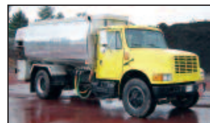
'90 INT'L 4900 FUEL TRUCK

mirrors, and 10R22.5 tires. In very good condition with very good tires. (40,166 Original Miles)