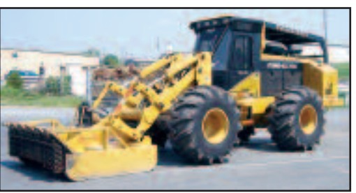
'05 HYDRO-AX 721E

1440 COWPATH RD. • HATFIELD, PA 19440 215/361-9099 • Fax: 215/361-9212