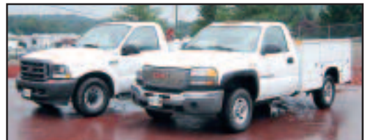
'04 GMC 2500HD 4X4 AND '03 FORD F250XL

2004 GMC Model 2500HD 4x4 Mechanics Truck , powered by Vortec 6.0 liter, V-8 gas engine and automatic transmission, equipped with Knapheide 8' mechanics body, 100 gallon fuel tank with 12 volt pump, air conditioning, and LT245/75R16 tires. In very good condition with good to very good tires. (07,791 Original Miles) (Balance of 3 Year/36,000 Mile Warranty Remaining)