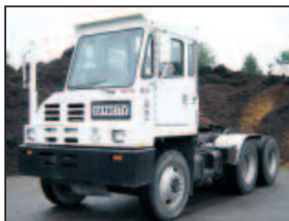
'96 CAPACITY TJ6500

1996 CAPACITY Model TJ6500 Tandem Axle Trailer Jockey , powered by Cummins 8.3 liter diesel engine and Allison automatic transmission, equipped with 40,000# rears, Holland 70,000# 5th wheel, Vista cab, walking beam suspension, 136" wheelbase, and 11R24.5 tires. In good condition with fair to good tires.