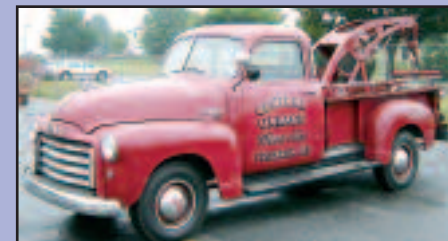
'50 GMC 150 TOW TRUCK

1950 GMC 150 Tow Truck , VIN# FC152254463, powered by 6 cylinder in-line gas engine and 4 speed transmission, equipped with Marquett model 141N Power Tow Crane, s/n L835042, cable operated, and PTO driven tow hook. In very good condition with very good tires. (19,152 Original Miles)