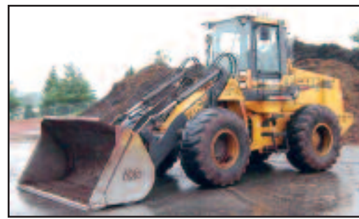
'02 CASE 721C XT

conditioning, and 20.5R25 tires. In very good condition with very good tires. (1,051 Original Hours)