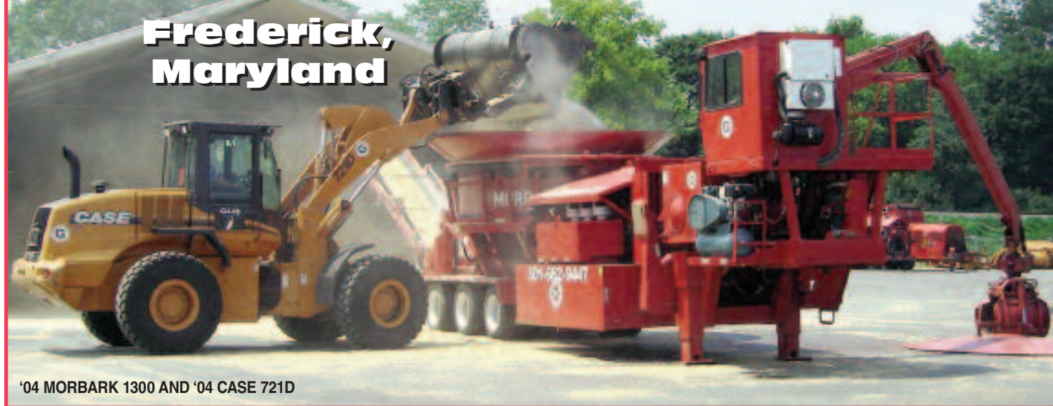
'04 MORBARK 1300 AND '04 CASE 721D