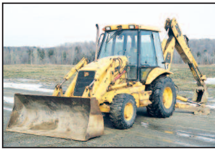
'97 JCB 214, 4X4

1997 JCB Model 214 Series 3, 4x4 Tractor Loader Extend-A-Hoe , s/n SLP214TCWE0468303, powered by Perkins diesel engine and shuttle transmission, equipped with general purpose loader bucket with bolt-on cutting edge, 16" digging bucket, WR quick disconnect, enclosed ROPS cab with light package, 14x17.5 front and 19.5x24 rear tires. In good condition with good tires. (Purchased New)