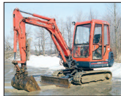
'00 KUBOTA KX91-2

2000 KUBOTA Model KX91-2 Super Series Mini Hydraulic Excavator , s/n 20078, powered by Kubota 4 cylinder diesel engine and hydraulic drive, equipped with articulated boom, 5' dipper stick, 35" cleanup bucket, JRB quick disconnect, manual thumb, hydraulic beyond, 5' backfill blade, enclosed cab with light package, 6'6" crawlers, and 12" street pads. In good condition with good undercarriage. (15" Digging Bucket To Be Sold Separately) (Purchased New)