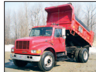
'00 INT'L 4900

2000 INTERNATIONAL Model 4900 Single Axle Dump Truck , powered by International DT466E diesel engine and 6 speed transmission, equipped with Heil 10' steel dump body with chute, air gate, 152" wheelbase, electric brake control, Chelsea PTO, pintle hitch, cruise control, air conditioning, heated mirrors, AM/FM radio, and 11R22.5 tires. In good condition with good tires. (Purchased New)