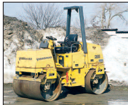
'01 VIBROMAX W265

2001 VIBROMAX Model W265 Vibratory Roller , s/n JKC5303812, powered by Kubota 3 cylinder diesel engine and hydrostatic transmission, equipped with 47" smooth drums, water system, drum cleaners, and roll-bar. In good condition.