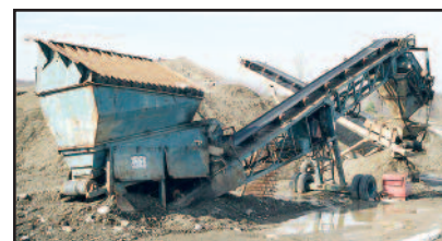
'89 POWER SCREEN MARK II

1989 POWER SCREEN Model Mark II Portable Screening Plant , s/n 2726208, powered by Lister Petter 3 cylinder diesel engine, equipped with 5'x9' feed hopper with grizzly, 24" x 30' feed conveyor, 4'x6' double deck vibrating screen, hydraulic raise and lower, and 7.50x16 tires. In fair to good condition with good tires.