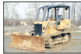
'99 CASE 550G

1998 CATERPILLAR Model D6MXL Crawler Tractor , s/n 4HS00469, powered by Cat 3116 diesel engine and powershift transmission, equipped with 6-way blade with rake brackets, fingertip control, ROPS over enclosed cab with heat, air conditioning, and light package, drawbar, and 22" SBG pads. In good condition with good undercarriage. (Purchased New)