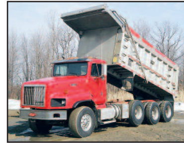
'98 INT'L 5000

1998 INTERNATIONAL Model 5000, Tri-Axle Dump Truck , powered by Cat 3406, 425HP diesel engine and Fuller 8 speed transmission with lo and lo-lo, equipped with Ti-Brook 18.5' aluminum dump body, air tailgate, electric tarp, 20,000# front axle, 44,000# rears, 20,000# airlift 3rd, spring suspension, 3-position engine brake, 222" wheelbase, side mounted hydraulic tank and tool box, air conditioning, cruise control, heated mirrors, aluminum Budd wheels, 425/65R22.5 front and lift and 11R24.5 rear tires. In good condition with good tires. (Purchased New)