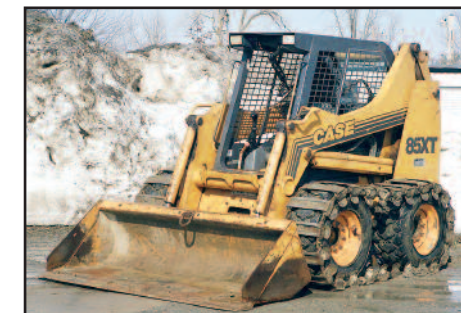
'98 CASE 85XT