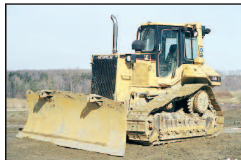
'98 CAT D6MXL