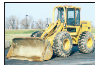
JOHN DEERE 544D

1986 JOHN DEERE Model 544D Rubber Tired Loader , s/n DW544DL512024, powered by John Deere 4 cylinder diesel engine and powershift transmission, equipped with ACS 2.5 cubic yard general purpose loader bucket with bolt-on cutting edge, hydraulic quick disconnect, enclosed cab with roll-bar and light package, and 20.5x25 tires. In good condition with good tires.