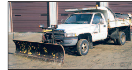
'97 DODGE 3500

air conditioning, AM/FM radio, and 215/75R16 tires. In good condition with good tires. (Purchased New)