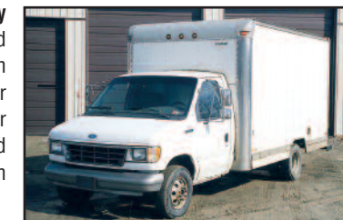
'93 FORD E-350

1993 FORD Model E-350 Van Body Truck , powered by V-8 diesel engine and automatic transmission, equipped with 14' aluminum van body with roll-up rear door, trailer brake control, air conditioning, AM/FM radio, and 225/75R16 tires. In good condition with good tires. (Purchased New)