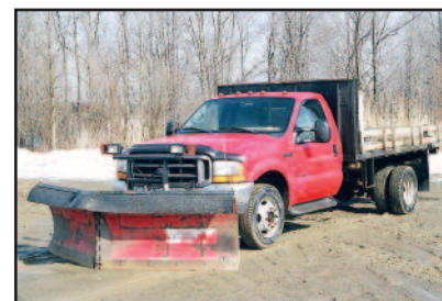
'99 FORD F-550XL

1999 FORD Model F-550XL Super Duty 4x4 Single Axle Flatbed Dump Truck , powered by Powerstroke 7.3L, 8 cylinder diesel engine and automatic transmission, equipped with 12' steel flatbed dump body with stake pockets, Boss RT3, 10' power-V snowplow, tool storage box, approx. 50 gallon aluminum fuel tank with 12-volt pump, air conditioning, AM/FM radio, and 225/70R19.5 tires. In good condition with good tires.