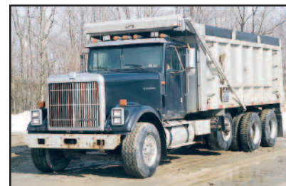
'97 INT'L 9300

wheels front and lift, AM/FM cassette, 385/65R22.5 front and lift and 11R24.5 rear tires. In good condition with good tires. (Purchased New)