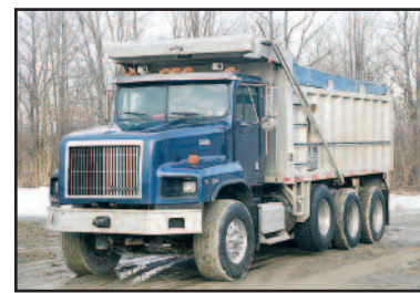
'99 INT'L 5000

aluminum Budd wheels, 425/65R22.5 front and 3rd and 11R24.5 rear tires. In good condition with good tires. (Purchased New)