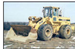
'94 JOHN DEERE 744E

1994 JOHN DEERE Model 744E Rubber Tired Loader , s/n CK744ED000440, powered by John Deere diesel engine and powershift transmission, equipped with general purpose bucket, enclosed ROPS cab with heat, air conditioning, and light package, and 26.5x25 tires. In good condition with good tires.