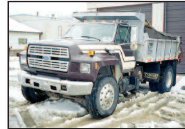
'93 FORD F-800

1993 FORD Model F-800 Single Axle Dump Truck , powered by Cummins 6 cylinder diesel engine and 8 speed transmission with lo, equipped with 10' steel dump body with chute, 8' spreader box, Chelsea PTO, aluminum Budd wheels, and 11R22.5 tires. In good condition with good tires. (Purchased New)