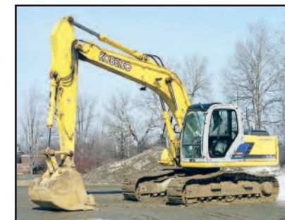
'02 KOBELCO SK160LC