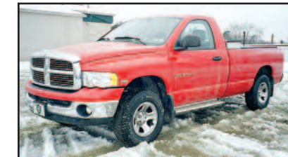
'03 DODGE RAM 1500

good condition with good to very good tires. (Purchased New)