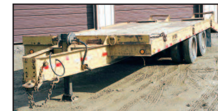
(1) OF (4) TAG-A-LONG TRAILERS

1989 CUSTOM Tandem Axle Tag-A-Long Trailer , equipped with 19' wood level deck, 5' beavertail with 5' ramp, 37,700# GVW, chain dogs, and 9R17.5 tires. In good condition with good tires. (Purchased New)