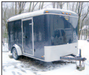
20' 99 CONTINENTAL 7'X12'

with sliding tandems, roll-up rear door, and 10.00x20 tires. In good condition with fair to good tires.