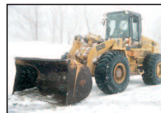
'95 CASE 821B

1994 JOHN DEERE Model 744E Rubber Tired Loader , s/n CK744ED000440, powered by John Deere diesel engine and powershift transmission, equipped with general purpose bucket, enclosed ROPS cab with heat, air conditioning, and light package, and 26.5x25 tires. In good condition with good tires.