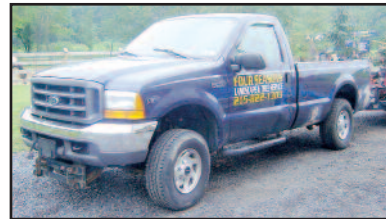
'01 FORD F-250XL 4X4

2001 FORD Model F-250XL Super Duty 4x4 Pickup Truck , powered by Triton 5.4 liter, V-8 gas engine and automatic transmission, equipped with Western 8.5' V-Plow, 8' bed with liner, tow package, air conditioning, and LT265/75R16 tires. In good condition with fair to good tires. (Purchased New)