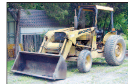
'97 FORD 345D