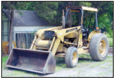
'97 FORD 345D

1997 FORD/NEW HOLLAND Model 345D Utility Tractor , s/n A440584, powered by Ford diesel engine and shuttle transmission, equipped with hydraulic loader attachment, 3-point hitch, PTO, rear wheel counterweights, ROPS canopy with light package, 11L16 front and 16.9x24 rear tires. In good condition with good tires. (Purchased New)