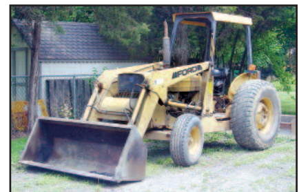
'97 FORD 345D