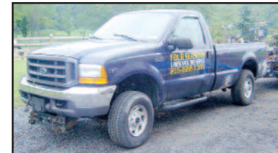
'01 FORD F-250XL 4X4

2001 FORD Model F-250XL Super Duty 4x4 Pickup Truck , powered by Triton 5.4 liter, V-8 gas engine and automatic transmission, equipped with Western 8.5' V-Plow, 8' bed with liner, tow package, air conditioning, and LT265/75R16 tires. In good condition with fair to good tires. (Purchased New) 1987 FORD Model F-250, 4x4 Pickup Truck , powered by Ford 4.9 liter, 6 cylinder gas engine and 4 speed transmission, equipped with Western 7.5' snowplow, 8' bed, dual fuel tanks, tow package, air conditioning, and LT235/85R16 tires. In fair to good condition with fair to good tires.