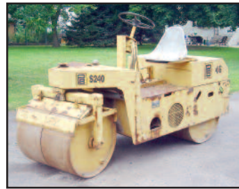
'03 STONE WP3100

2003 STONE/WOLFPAC Model WP3100 Vibratory Roller , s/n 502003357, powered by Honda V-Twin, 18HP gas engine and hydrostatic transmission, equipped with 36" drums and water system. In very good condition. (394 Original Hours) (Purchased New)