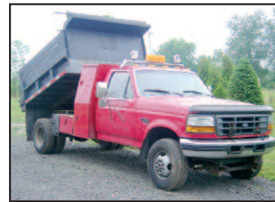
'96 FORD F-350XL 4X4

1996 FORD Model F-350XL, 4x4 Single Axle Dump Truck , powered by Power Stroke 7.3 liter diesel engine and 5 speed transmission, equipped with Fisher 9' snowplow, 8' hydraulic tailgate spreader, central hydraulics, 8' steel dump body with wooden sideboards and manual tarp, cross-body behind cab tool box, dual rear wheels, and LT235/85R16 tires. In good condition with good tires.