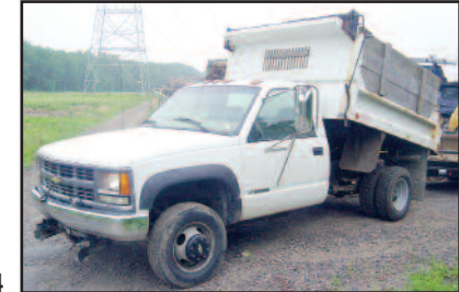
'99 CHEVY 3500 4X4

1999 CHEVROLET Model 3500, 4x4 Dump Truck , powered by Vortec 5.7 liter, V-8 gas engine and automatic transmission, equipped with Western 8' Snow Plow, Crysteel 8' dump body with tailgate and manual tarp, dual rear wheels, tow package, air conditioning, and LT225/75R16 tires. In good condition with good tires. (Purchased New)