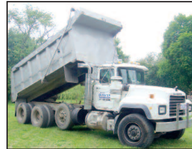
'01 MACK RD688S

2001 MACK Model RD688S Tri-Axle Dump Truck , powered by Mack E7-400, 400HP E-Tech diesel engine and Fuller RTOF14908LL, 8 speed transmission with lo and lo-lo, equipped with J&J 17'6" steel dump body, s/n TS18554, with power tarp and coal chute, 44,000# rears (4:42 ratio), 2-position Jake brake, airlift 3rd axle, double frame, air conditioning, heated mirrors, Budd wheels, 385/65R22.5 front and lift tires, and 11R22.5 rear tires. In good condition with good tires. (061,753 Original Miles) (Purchased New)