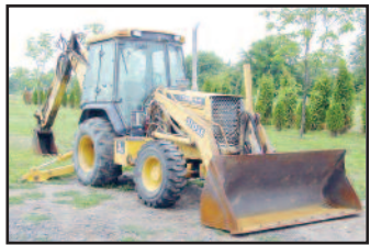
'99 JD 310SE 4X4 EXTEND-A-HOE

1999 JOHN DEERE Model 310SE, 4x4 Tractor Loader Extend-A-Hoe , s/n 876625, powered by John Deere diesel engine and shuttle transmission, equipped with general purpose loader bucket, 14" digging bucket, JRB front hydraulic quick disconnect, front auxiliary hydraulics, Groeneveld auto lube system, 12.5x80-18 front and 19.5Lx24 rear tires. In fair to good condition with (3) very good and (1) poor tire.