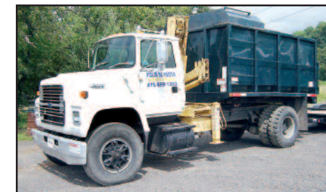
'92 FORD L7000 WITH IMT 30'