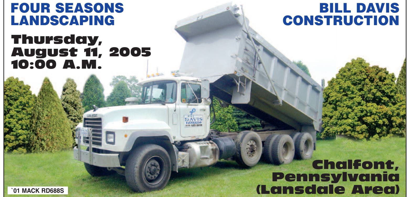
'01 MACK RD688S