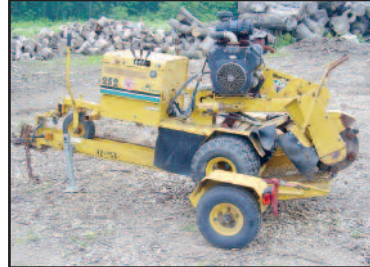
'98 VERMEER SC252

1998 VERMEER Model SC252 Self Propelled Stump Grinder , s/n 1VRN071F7W1002302, powered by Kohler 25HP gas engine and hydrostatic transmission, equipped with 17" carbide tipped grinding wheel, mounted on 1998 Vermeer Single Axle Trailer. In good condition with good tires.