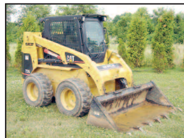
'03 CAT 236