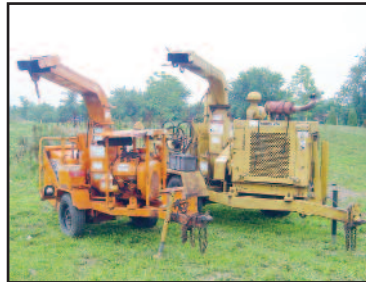
'97 & '94 BRUSH BANDITS

1997 BRUSH BANDIT Model 250XP Portable Chipper , s/n 011803, powered by Cummins B3.9-C, 116HP diesel engine and Rockford PTO, equipped with 12" capacity with hydraulic yoke, auto feed, reverse feed and 12x16.5LT tires. In good condition with good tires.