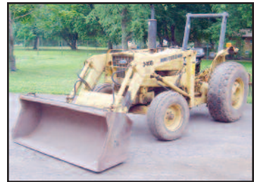
'87 FORD 340B

(Purchased New) FORD Model 2600 Utility Tractor , s/n C650967, powered by Ford 3 cylinder diesel engine and 8 speed direct drive transmission, equipped with Ford loader attachment with general purpose loader bucket, 3-point hitch, rear wheel counterweights, sun canopy, 7x16 front and 13.6x28 rear tires. In good condition with good tires.