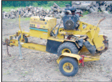
'98 VERMEER SC252

1998 VERMEER Model SC252 Self Propelled Stump Grinder , s/n 1VRN071F7W1002302, powered by Kohler 25HP gas engine and hydrostatic transmission, equipped with 17" carbide tipped grinding wheel, mounted on 1998 Vermeer Single Axle Trailer. In good condition with good tires.