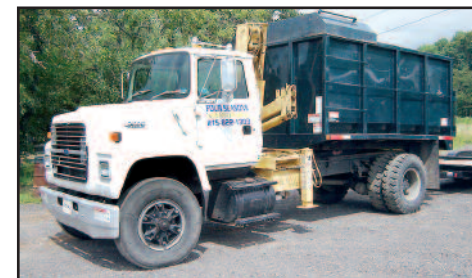
'92 FORD L7000 WITH IMT 30'