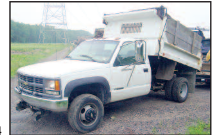
'99 CHEVY 3500 4X4

1999 CHEVROLET Model 3500, 4x4 Dump Truck , powered by Vortec 5.7 liter, V-8 gas engine and automatic transmission, equipped with Western 8' Snow Plow, Crysteel 8' dump body with tailgate and manual tarp, dual rear wheels, tow package, air conditioning, and LT225/75R16 tires. In good condition with good tires. (Purchased New)