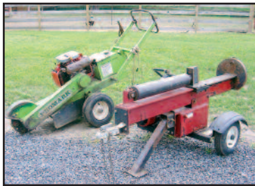
PROMARK STUMP GRINDER & BRAVE LOG SPLITTER

PROMARK Model 940007 Walk Behind Stump Grinder , s/n 000827, powered by Kohler 18HP gas engine. In good condition.