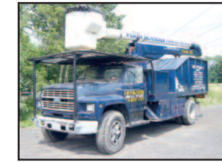
'85 FORD F-700 W/ ALTEC 54'

1985 FORD Model F-700 Single Axle Bucket/Chip Dump Truck , powered by 429-4V, V-8 gas engine and 5 speed transmission with 2 speed rear, equipped with Altec Model AA-650, 54' Aerial Lift, s/n 0385J1103, 60' working height, with 400# single man bucket with auxiliary hydraulic tool outlets, (2) hydraulic outriggers, 11'8" chipper dump body with full body length tool box, underbody tool boxes, electric brakes, tow package, and 10.00x20 tires. In good condition with good tires.