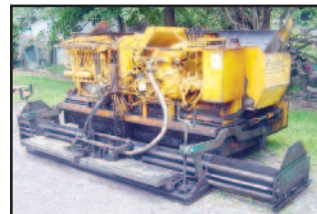
'02 PUCKETT 540

2002 PUCKETT Model 540 Crawler Asphalt Paver , s/n 12430203, powered by Kubota 3 cylinder, 28HP diesel engine and hydrostatic drive, equipped with 8'-12" heated vibratory screed and folding hopper wings. In good condition with good undercarriage. (Purchased New)