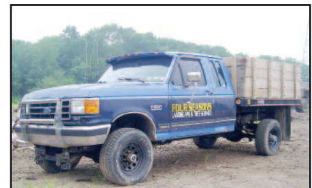
'91 FORD F250XLT 4X4

1991 FORD Model F-250XLT Lariat, 4x4 Extended Cab Flatbed Dump Truck , powered by 5.8 liter, V-8 gas engine and automatic transmission, equipped with Western 8.5' snowplow, Reading 8' flatbed dump body with 30" wooden stake sides, tow package, power windows and locks, dual fuel tanks, air conditioning, and LT265/75R16 tires. In fair to good condition with fair to good tires.