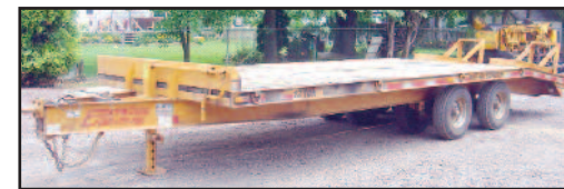
'04 ECONOLINE 12 TON

2004 ECONOLINE Model MP1223DE, 12 Ton Tandem Axle Tag-A-Long Trailer , equipped with 18' level deck, MultiMax suspension, 5' beavertail, 5' ramps, dual wheels, and 8.00x14.5 tires. In good to very good condition with good to very good tires. (Purchased New)