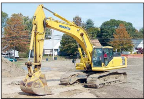
'04 KOMATSU PC300LC-7L