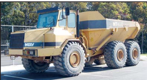
'99 MOXY MT40B

PRE-SORTED FIRST CLASS MAIL US POSTAGE PAID HAVERTOWN, PA PERMIT #45