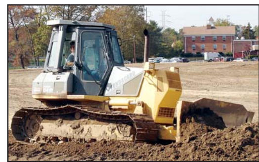
'00 KOMATSU D41P-6