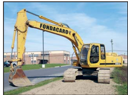
01 JOHN DEERE 200LC

s/n FF0200X501601, powered by John Deere diesel engine and hydraulic drive, equipped with 9'6" dipper stick, Geith 36" digging bucket with 18" thumb attachment, air conditioning, 14'6" crawlers, and 32" TBG pads. In good condition with good undercarriage.