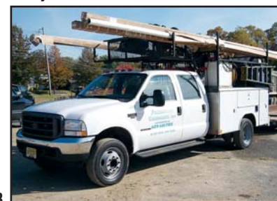
02 FORD F-550 CREW CAB

powered by Power Stroke V-8 diesel engine and automatic transmission, equipped with Reading 9' open mechanics body, ladder rack, dual rear wheels, air conditioning, cruise control, AM/FM stereo, and 225/70R19.5 tires. In good condition with good tires.