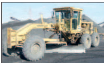
'84 Cat 12G