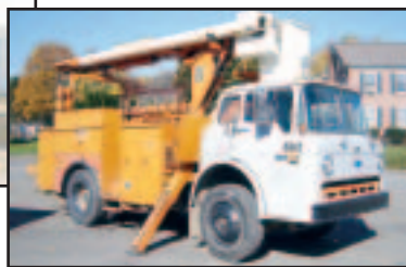
Asplundh 42' Bucket