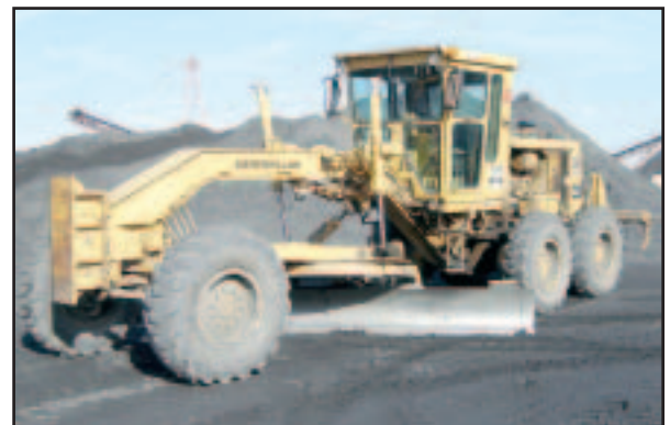
'84 Cat 12G

1984 CATERPILLAR Model 12G Articulated Motor Grader , s/n 61M10471, powered by Cat 3306 diesel engine and powershift transmission, equipped with 12' all hydraulic moldboard, rear mounted multi-shank ripper with (3) shanks, front push block, enclosed ROPS cab with heat, and 14.00x24 tires. In good condition with fair to good tires.