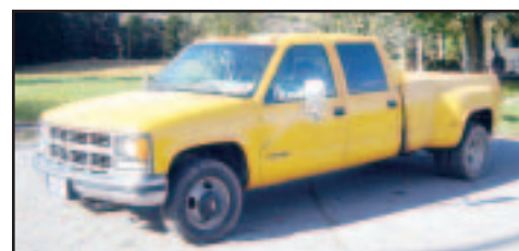
'96 Chevy 3500 Crew Cab