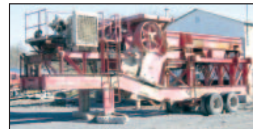
'88 Pioneer 3042 Jaw