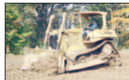
'86 Cat D6H