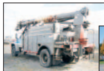
'90 Altec D990

1994 INGERSOLL-RAND Model DD110 Tandem Vibratory Roller , s/n 5418SFD, powered by Cummins diesel engine and hydrostatic transmission, equipped with 77" smooth drums. (Not Running - Engine Seized)