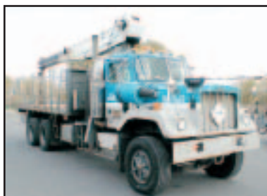
'86 National 12.5 Ton

1986 NATIONAL Model 638A, 12.5 Ton Hydraulic Boom , s/n 18661, equipped with 15'-38' 3-section hydraulic boom, 10 ton Johnson hook block, and dual operation controls, mounted on 1986 Autocar Model DS Tandem Axle Flatbed Truck, powered by Cummins PT240, 240HP diesel engine and automatic transmission, equipped with 44,000# rears, (4) hydraulic outriggers, and 12R22.5 tires. In good condition with good tires.