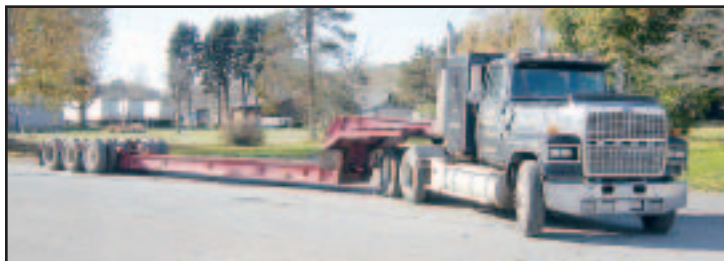
'94 Ford LTL9000 with Talbert 60 Ton Beam

1994 FORD Model LTL9000 Tandem Axle Truck Tractor , powered by Cat 3406, 425HP diesel engine and Fuller 15 speed transmission, equipped with 40,000# rears, Jacobs engine brake, air ride suspension, wetline, airslide 5th wheel, Rest Rite 36" sleeper cab, 150 gallon aluminum saddle tanks, aluminum Budd wheels, aluminum headache rack, and 11R24.5 tires. In good condition with good tires. 1987 TALBERT Model T4DW-50-HRG-RA-1-T1, 50-60 Ton Double Detachable Quad-Axle Lowboy/Beam Trailer , equipped with hydraulic detachable non-ground bearing gooseneck, 24'x8'6" dropside load deck with outriggers, 27'6" 60 ton beam deck, flip-up 4th axle, Neway air ride suspension, and 315/80R22.5 tires. In good condition with good tires. 1973 GENERAL 25 Ton Tandem Axle Lowboy Trailer , equipped with 23' level deck, 5' beavertail with ramps, spring suspension, chain dogs, and 8.25R15TR tires. In good condition with good tires.