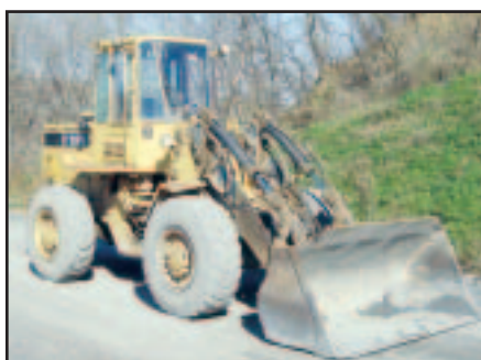
(1) of (2) Cat IT28B

1988 CATERPILLAR Model IT28B Integrated Tool Carrier , s/n 1HF00978, powered by Cat 3204 diesel engine and powershift transmission, equipped with 3rd valve, hydraulic quick disconnect attachment, general purpose loader bucket with bolt on cutting edge, enclosed ROPS cab with air conditioning, and 17.5R25 tires. In good condition with fair tires.