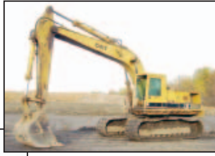
'87 Cat 235B

Plated Compactor , s/n 5279 • 20" Digging Bucket (Cat 235) • 40" Digging Bucket (Cat E120) • 24" Digging Bucket (Int'l 630) • 70" Digging Bucket (Cat 225)