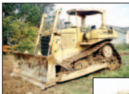
'86 Cat D6H

1986 CATERPILLAR Model D6H Crawler Tractor , s/n 4RC00963, powered by Cat 3306 diesel engine and powershift transmission, equipped with semi-U blade with right side tilt, ROPS canopy, drawbar, and 22" SBG pads. In good condition with good undercarriage. (Rebuilt Engine Installed Aug. '03)