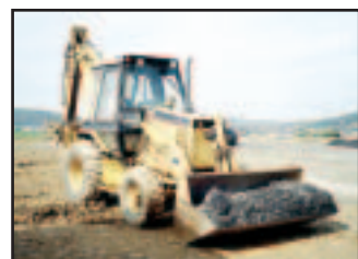
'94 Cat 426B 4x4 Extend-A-Hoe

1994 CATERPILLAR Model 426B, 4x4 Tractor Loader Extend-A-Hoe , s/n 6KL00358, powered by Cat 3054DIT diesel engine and shuttle transmission, equipped with general purpose loader bucket with bolt-on cutting edge, 22" digging bucket, hydraulic beyond, enclosed ROPS cab with light package, 12.5/80 -18 front and 19.5x24L rear tires. In good condition with good tires.