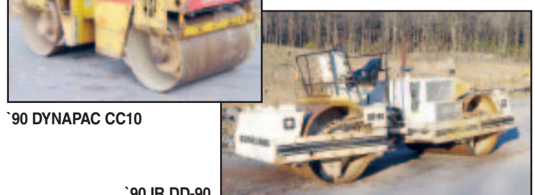
'90 DYNAPAC CC10

1993 DYNAPAC Model CC-102 Vibratory Tandem Roller , s/n 60110378, powered by Deutz diesel engine and hydrostatic transmission, equipped with 38.5" smooth drums and water system. In good condition.