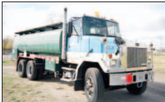
(1) of (2) 4,000 Gallon Fuel Truck

1987 KOEHRING SKYTRACK Model 7038, 7,000# Telescopic Rough Terrain Forklift , s/n 7F0324, powered by Ford diesel engine and powershift transmission, equipped with 38" lift height, 48" forks, 4-wheel drive, 4-wheel steer, carriage tilt, ROPS canopy, and 13.00x24 tires. In fair to good condition with fair to good tires.