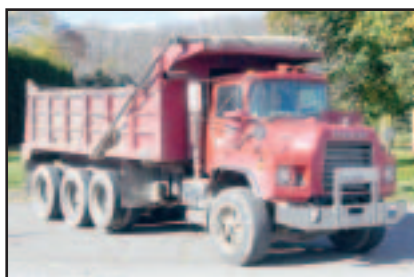
(1) of (2) '91 Mack DM688S