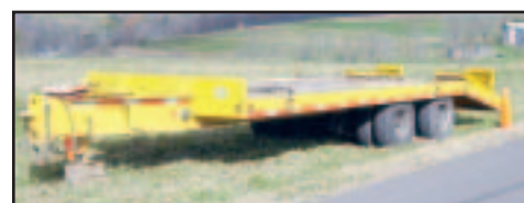
'84 Eager Beaver 20 Ton