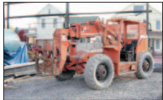
'87 Skytrack 7038

1987 KOEHRING SKYTRACK Model 7038, 7,000# Telescopic Rough Terrain Forklift , s/n 7F0324, powered by Ford diesel engine and powershift transmission, equipped with 38" lift height, 48" forks, 4-wheel drive, 4-wheel steer, carriage tilt, ROPS canopy, and 13.00x24 tires. In fair to good condition with fair to good tires.