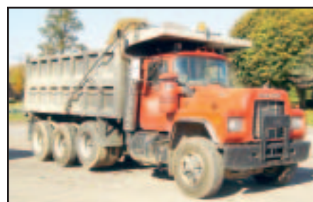
'88 Mack RD690S