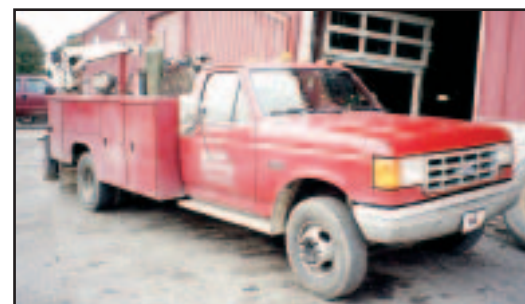
'89 Ford Super Duty

1989 FORD Model F Super Duty Mechanics Truck , powered by Ford 7.3 liter diesel engine and 5 speed transmission, equipped with Reading 11' open mechanics body, Auto Crane model 3203PR, 3,200# 3-section hydraulic boom, Campbell Hausfield 16HP gas powered air compressor, hose reel, manual stabilizers, and LT235/85R16 tires. In fair to good condition with good tires.