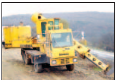
'86 Gradall G660C