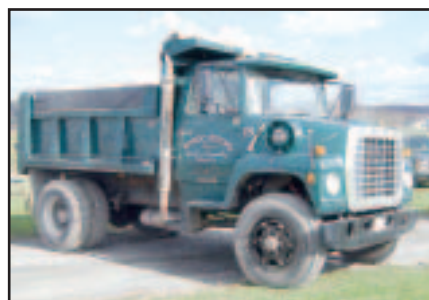
(1) of (2) Ford 8000