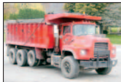
(1) of (3) '94 Mack DM690S

1984 FORD Model 8000 Single Axle Dump Truck , powered by Cat 3208 diesel engine and 5 speed transmission with 2 speed rear, equipped with Galion 10' steel dump body with coal chute, rear air plumbing, and 12R22.5 front and 11.00R20 rear tires. In good condition with good tires.