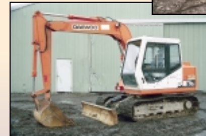
'98 Daewoo Solar 70-III