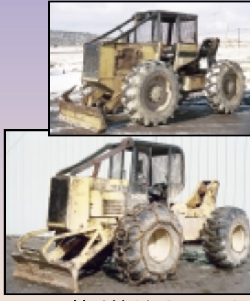
(1) of (3) John Deere 540B's (Chains Sold Separately)