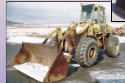
Fiat Allis 645B