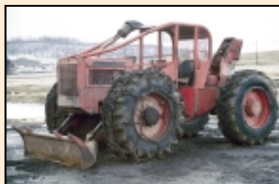
(1) of (5) Timberjack 230's