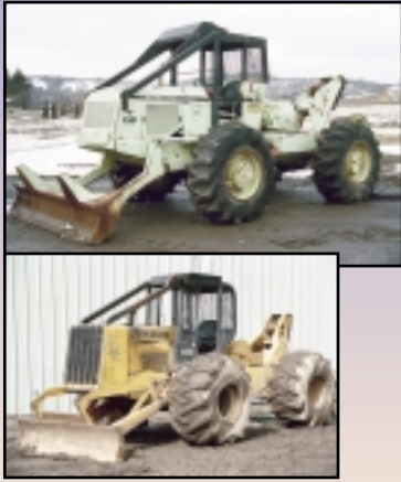
John Deere 640