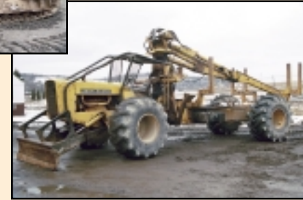
John Deere 540A