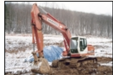
'99 Daewoo Solar 170-III