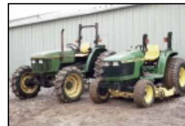
'94 JD 5400 and '99 JD 4600

PRE-SORTED FIRST CLASS MAIL US POSTAGE PAID HAVERTOWN, PA PERMIT #45