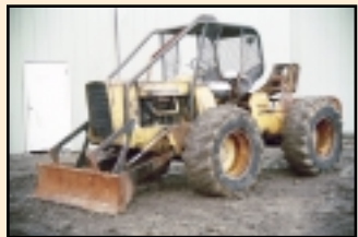
John Deere 440B

Tire Chains • PRENTICE Log Grapple • ESCO Hydraulic Grapple (Parts) • JOHN DEERE Grapple Attachment (John Deere 640 Skidder) • (4) GEARMATIC Model 19 Winches (One For Parts) • JOHN DEERE Model 4000 Winch • (4) JOHN DEERE 3305 Winches • (2) JOHN DEERE 540B or 540D Winches • TIMBERJACK Hercules Winch • JOHN DEERE 3305 Winch • Log Arches • (12) Stacking Blades: (1) 540A, (4) 440A and 440B, (3) 540B, (2) 440C, (1) TREEFARMER C-7: (1) 640