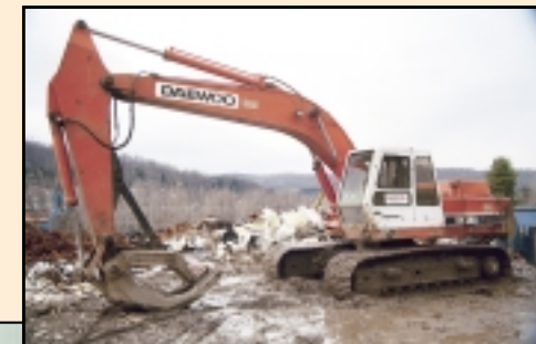
'95 Daewoo DH280 (Grapple Not Being Sold)

90" Loader Bucket • 42" Fork Attachment (Fiat Allis 545) • ROCKLAND Quick Coupler (John Deere 544)