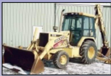
'95 John Deere 310D

4X4 EXTEND-A-HOE 1999 JOHN DEERE Model 310D, 4x4 Tractor Loader Extend-A-Hoe, s/n T0310DG812631, powered by John Deere diesel engine and shuttle transmission, equipped with general purpose loader bucket, 24" digging bucket, enclosed ROPS cab with heat, light package, (2) hydraulic outriggers, 12x16.5 front and 18.4x24 rear tires. In good condition with good tires. (Meter Reads 1,180 Hours) JOHN DEERE Model 410D Extending Dipper Stick