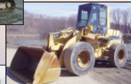
(1) of (2) '96 Komatsu WA 180-1's