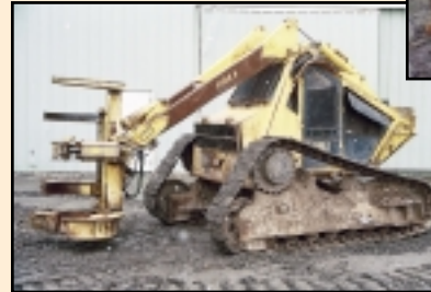
'91 Bell SuperTrack