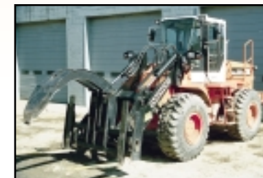
'01 Daewoo Mega MG200TC-III