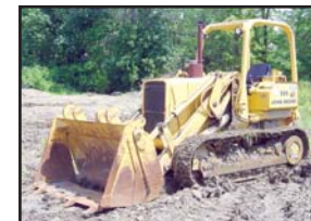
John Deere 555B