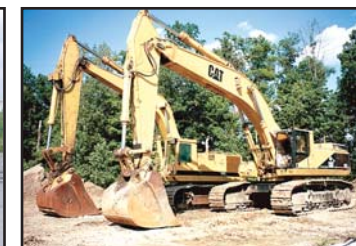
Cat 375L & 245B