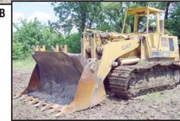
Cat 973 LGP