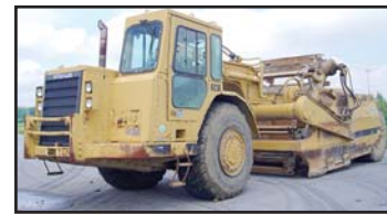
'93 Cat 623E

(2) TEREX Model TS14B Tandem Motor Scrapers , s/n 71715 & s/n 58095, powered by Detroit 4-71 diesel engines (front and rear) and powershift transmission, equipped with bowl s/n 26720 & s/n 23007, ROPS canopy, and 29.5x29 tires. In fair to good condition with fair to good tires.