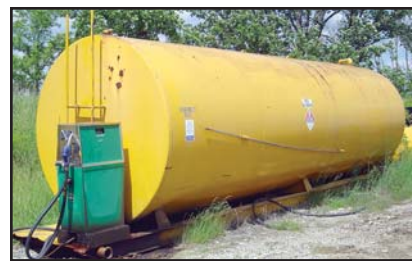
10,000 Gallon Fuel Tank

MOTEL INFORMATION: Marysville - Off Route 33 At Route 36: Holiday Inn Express (937) 642-0300 (Auction Headquarters - Mention That You Are Attending The Auction To Receive A Discounted Rate) • Hampton Inn (937) 642-3777 • AmeriHost Inn (937) 644-0400 Dublin-Post Road/Exit 17A Off Route 270: Marriott Courtyard (614) 764-9393 • Residence Inn (614) 791-0403 • Embassy Suites (614) 790-9000 • Hilton Garden Inn (614) 766-9900 • Red Roof Inn (614) 764-3993 Exit 15 Off Route 270: AmeriSuites (614) 799-1913 • Drury Inn (614) 798-8802 • Baymont Inn • Homewood Suites (614) 792-8300