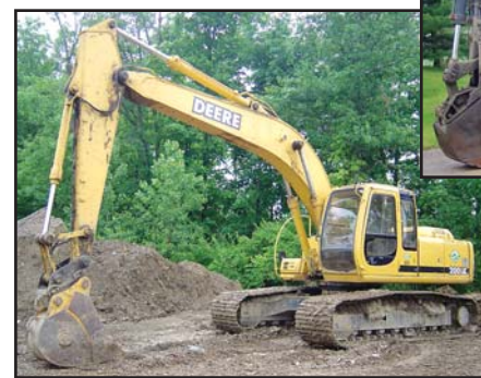
'97 John Deere 200LC

1994 JOHN DEERE Model 550G Crawler Tractor , s/n T0550GH802902, powered by John Deere diesel engine and powershift transmission, equipped with 6-way straight blade, ROPS canopy, light package, and 17.5" SBG pads. In good condition with fair undercarriage.