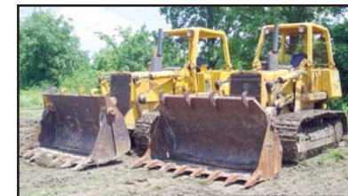
(2) John Deere 755B

Miscellaneous Excavator Attachments: TRAMAC BRH1100 Hydraulic Demolition Hammer, s/n 34703. In fair to good condition • PEMBERTON 13373, 5-Tine Grapple, s/n 2816692 • (2) JB HENDRIX Hydraulic Quick Disconnects • 20' Long Stick with 70" clean-up bucket (Fits Akerman) • THUMPER 496 Concrete Hammer Attachment, s/n B91000020 • Digging Buckets: (#613) 60"; (2) CF 60"; CF 50"; CF 30" • (3) Headache Balls