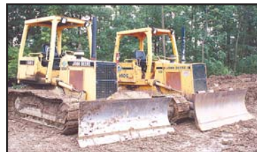
John Deere 650G & 550G

1987 JOHN DEERE Model 772B All Wheel Drive Articulated Motor Grader , s/n 512744, powered by John Deere diesel engine and powershift transmission, equipped with full hydraulic front mounted moldboard, rear mounted ripper, Agtek grade control system, enclosed ROPS cab with heat, light package, and 14.00x24 tires. In good condition with good tires.