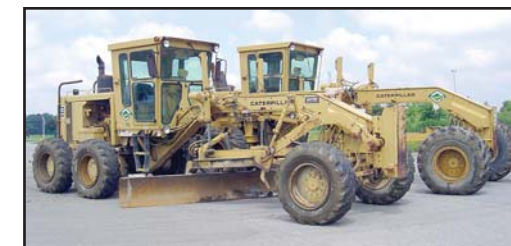
Cat 12G & 14G