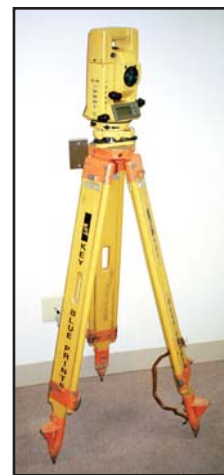
Topcon Total Station