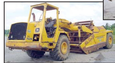
John Deere 862B