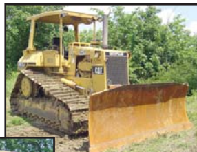
Cat D5H XL