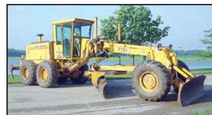
John Deere 772B

CATERPILLAR Model 14G Articulated Motor Grader , s/n 96U04937, powered by Cat diesel engine and powershift transmission, equipped with full hydraulic moldboard with hydraulic tip, rear mounted ripper, Blade-Pro laser system, enclosed ROPS cab with heat, light package, and 20.5x25 tires. In good condition with fair to good tires.