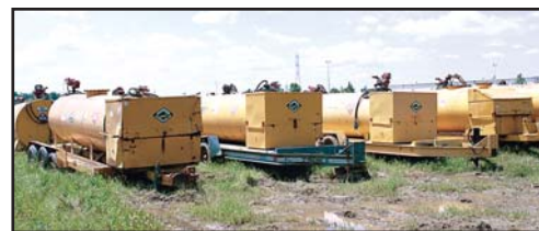
Portable Fuel Tanks