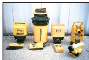
Lasers & Instruments