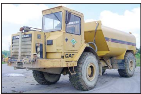
Cat D25C Water Wagon

1988 CATERPILLAR Model D25C, 4x4 Water Wagon , s/n 9YC00777, powered by Cat 6 cylinder diesel engine and powershift transmission, equipped with 1998 Klein model K-500, 5,000 gallon water tank, s/n 7K39440, with front and rear spray bars, hydraulic pump, and 26.5R25 tires. In good condition with fair to good tires.