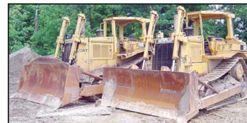
Cat D7H & D8N

PRE-SORTED FIRST CLASS MAIL US POSTAGE PAID HAVERTOWN, PA PERMIT #45