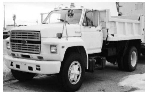
'89 FORD F700

Everything Sells As-Is Where-Is To The Highest Bidder Regardless Of Price!