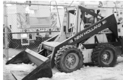
NEW HOLLAND L783

COASTAL 34' Tri Axle Office Trailer , with 8-14.5 tires • CUSTOM Model 400-10K, 5 Ton Tandem Axle Tag-A-Long Trailer • TIGER Model T-3500, 3,500# Capacity Boom , s/n 120536 • MEYERS 9' Snowplow • Arrow Board