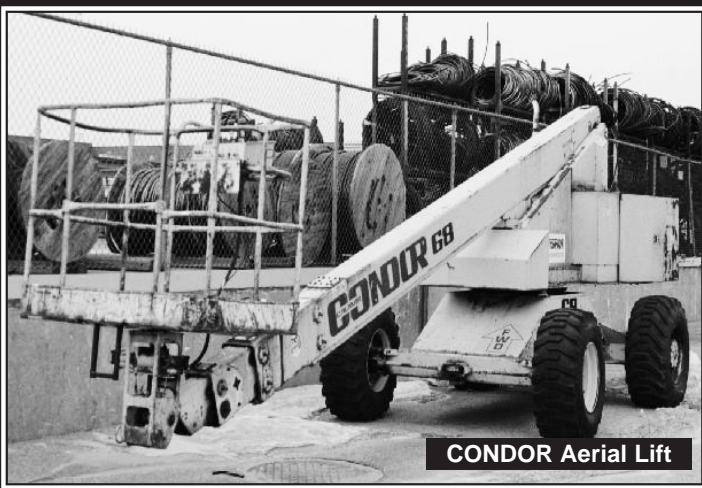
CONDOR Aerial Lift