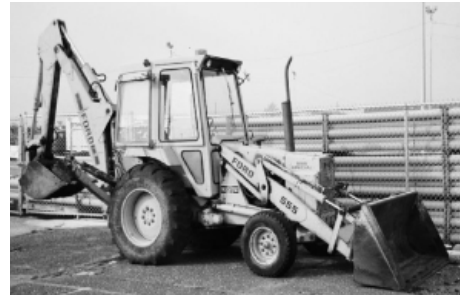
FORD 555 Special Backhoe