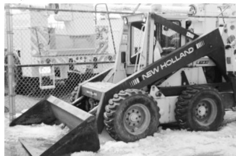
NEW HOLLAND L783

COASTAL 34' Tri Axle Office Trailer , with 8-14.5 tires • CUSTOM Model 400-10K, 5 Ton Tandem Axle Tag-A-Long Trailer • TIGER Model T-3500, 3,500# Capacity Boom , s/n 120536 • MEYERS 9' Snowplow • Arrow Board