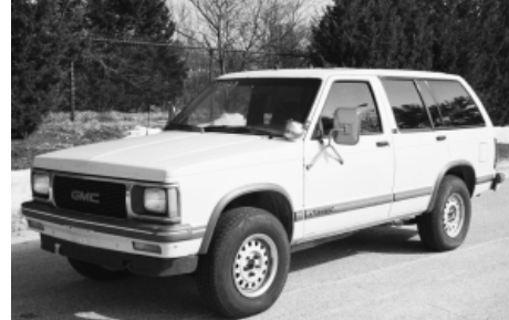
'93 GMC Jimmy 4x4