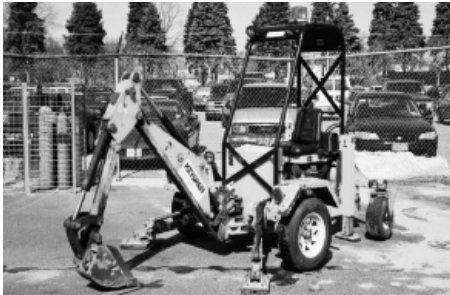
'96 GO-FOR G6FS