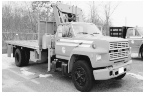
FASSI Knuckleboom on '85 Ford F-800

Saturday, April 5, 2003 — 9:00 a.m. — Hicksville, NY