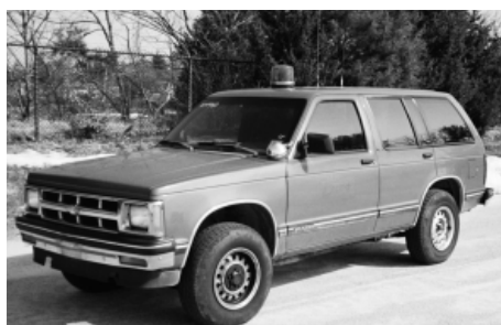
'93 CHEVROLET Blazer 4x4