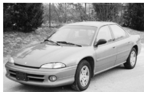
'96 DODGE Intrepid

1983 FORD Model F-700 Flatbed Truck , powered by Detroit 8.2 diesel engine and automatic transmission, equipped with 9'6" bed and 9.00R20 tires.