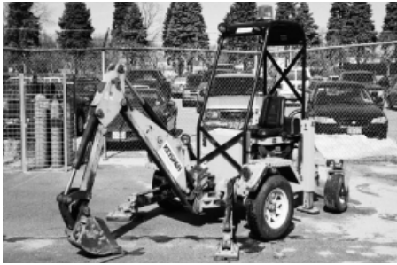
'96 GO-FOR G6FS