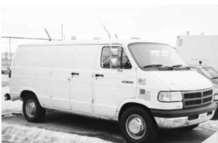
(1) of (15) DODGE Ram 3500 Cargo Vans