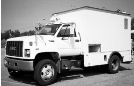
(1) of (8) GMC Topkick Compressor Trucks