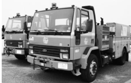
(2) '89 & '88 FORD CF-6000

(2) 1990 CHEVROLET Model 3500 Single Axle Flatbed Trucks , each powered by 8 cylinder gas engine and automatic transmission, equipped with side tool boxes.