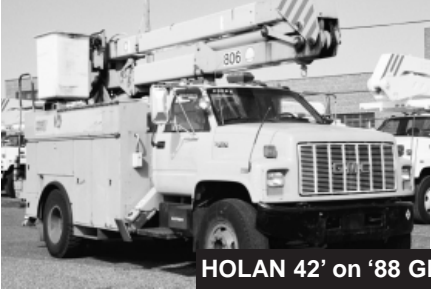
HOLAN 42' on '88 GMC

Saturday, April 5 2003 9:00 a.m. Hicksville, NEW YORK