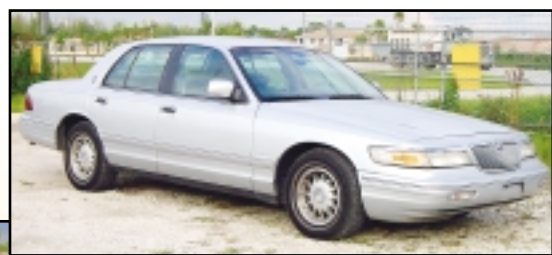
'95 MERCURY GRAND MARQUIS