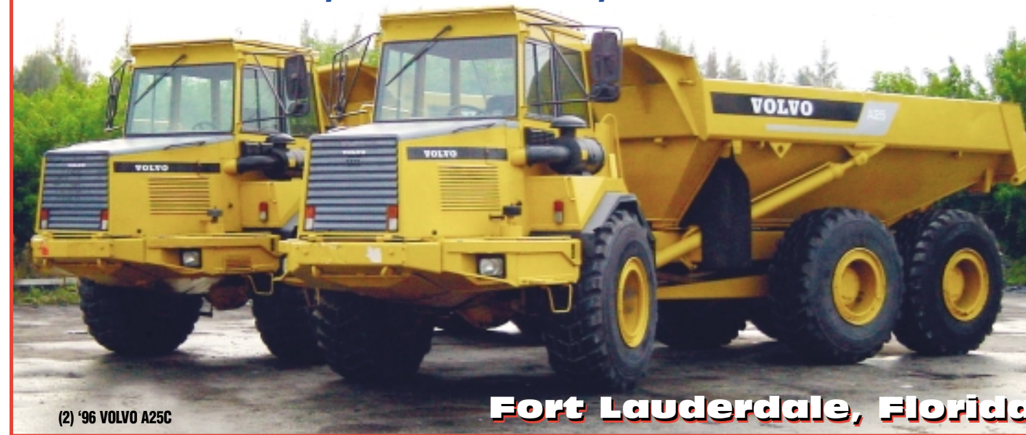
(2) '96 VOLVO A25C