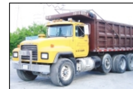
'98 MACK RD688S