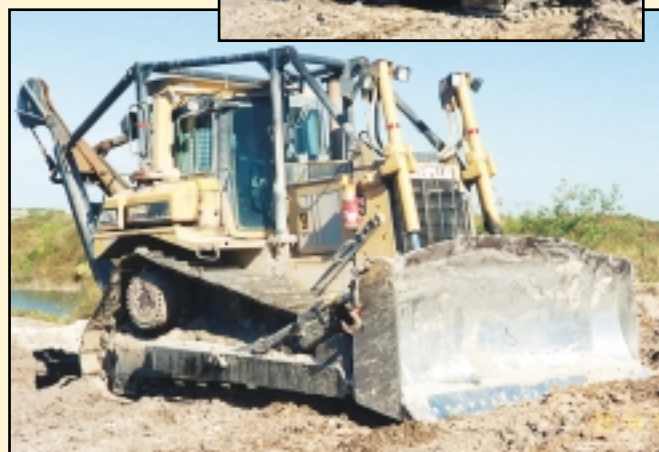
'97 CAT D7R