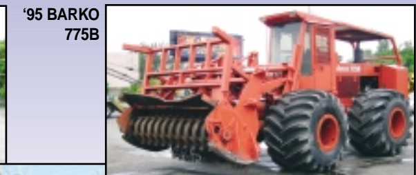
'95 BARKO 775B