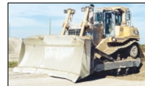
'97 CAT D9R