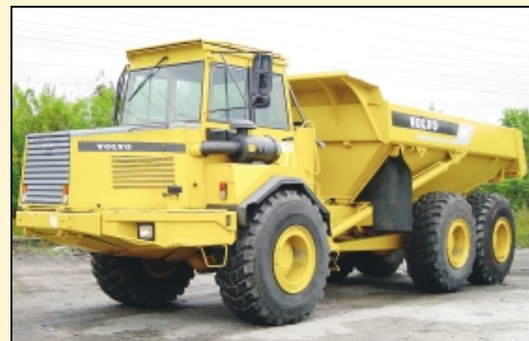
(1) OF (2) '96 VOLVO A25C