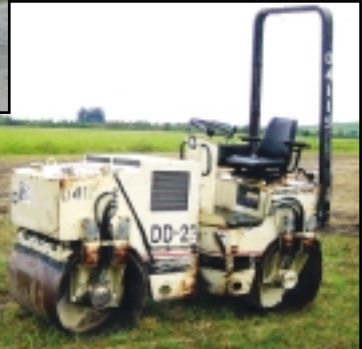
'95 IR DD-22