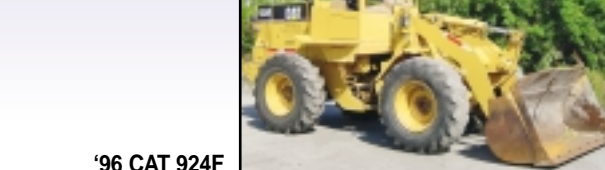
'96 CAT 924F