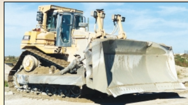
'97 CAT D9R