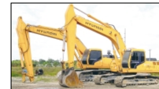
'99 HYUNDAI EXCAVATORS