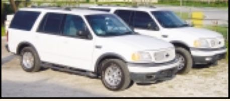
(2) '01 FORD EXPEDITIONS