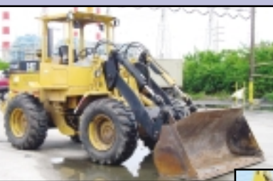
(1) OF (2) '96 CAT IT24F