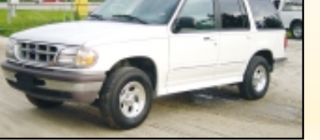
'97 FORD EXPLORER