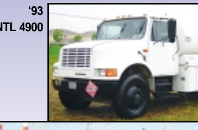
'93 INTL 4900