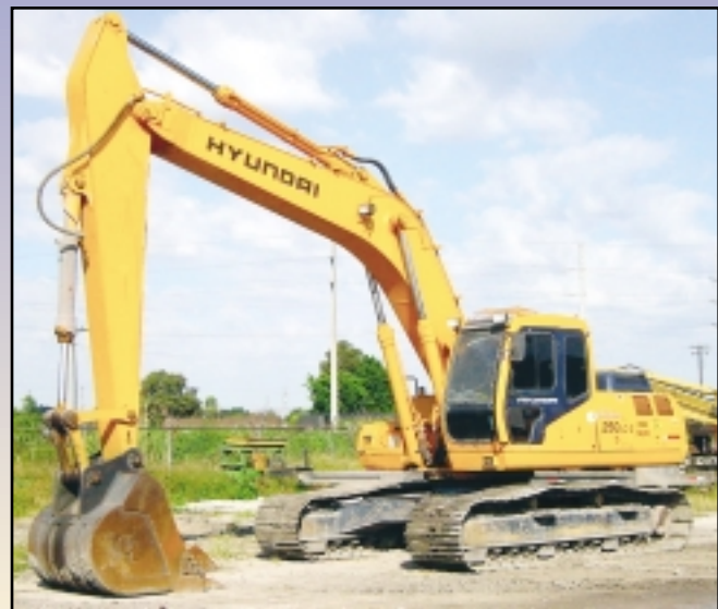
'99 HYUNDAI 250LC-3

1997 CATERPILLAR Model D7R Crawler Tractor , s/n 2EN00479, powered by Cat 3306 diesel engine and powershift transmission, equipped with semi-U blade with single tilt, Mulberry 12-1/2' skidding boom, s/n RH182511H-97, Cat model 58N winch, EVAC system, enclosed ROPS cab with air conditioning, light package, and 27" SBG pads. In good condition with fair to good undercarriage. (Skidding Boom Will Be Sold Separately)