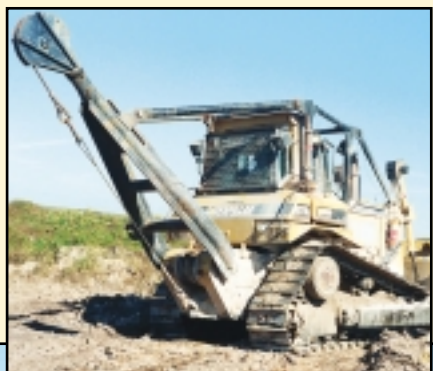
MULBERRY SUPER BOOM