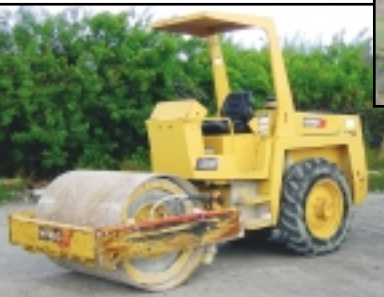
'98 HYPAC C820A