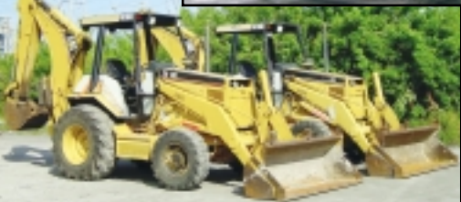
(2) OF (3) '96 CAT 416B 4X4