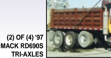
(2) OF (4) '97 MACK RD690S TRI-AXLES