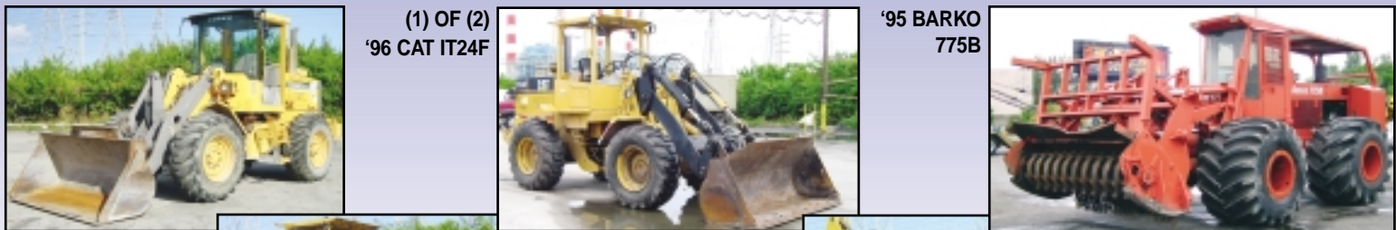
'97 VOLVO L50C