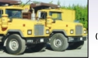
'97 PETERBILT AND (1) OF (2) '99 WITZCO 50 TON