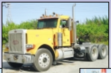
'96 PETERBILT 379