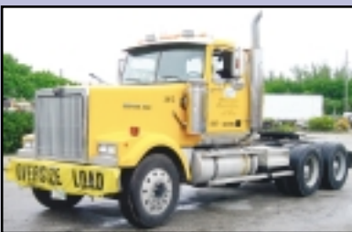
(1) OF (2) '97 WESTERN STAR 4964EX