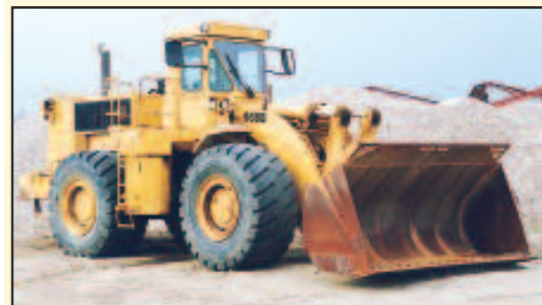
'87 CAT 988B

CATERPILLAR Model 980C Rubber Tired Loader , s/n 13B00379, powered by Cat 3406 diesel engine and powershift transmission, equipped with general purpose loader bucket with teeth, rear bumper counterweight, ROPS over enclosed cab with heat and air conditioning, light package, and 26.5R25 tires. In fair to good condition with fair to good tires.