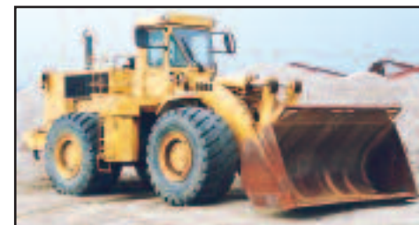
'87 CAT 988B