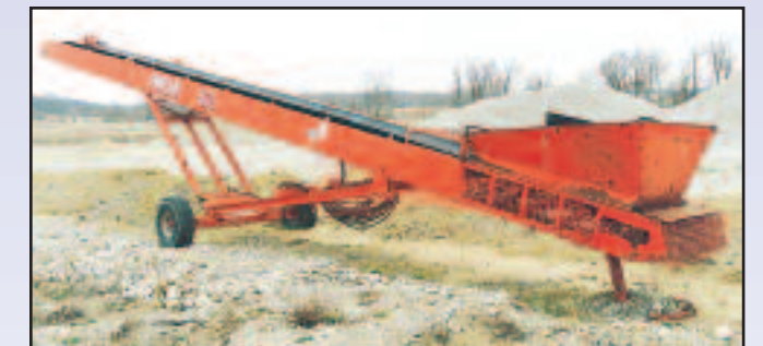
'97 FINLAY 50' RADIAL STACKER

1997 FINLAY Model 530, 30"x50' Radial Stacking Conveyor , s/n FW471936, equipped with hydraulic raise and lower, hydraulic belt drive, rock guards, manual angle wheels, pintle hitch, and 12.5/80x15.3 tires. In good condition with good tires.