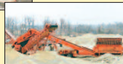
'98 FINLAY 390 PORTABLE SCREEN