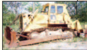
FIAT ALLIS 21C