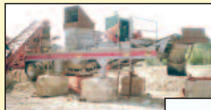
'98 GATOR PEX-1039

1998 FINLAY Model 390 Portable Screening Plant , s/n FG481691, powered by Deutz diesel engine, equipped with 5'x14" feed hopper with hydraulic grizzly and 40" belt feeder, 39"x40' feed belt with cat-walk and rock guards, 5'x10' double deck vibrating screen, hydraulic raise and lower, mounted on tandem axle carrier, with 235/75R17.5 tires. In good condition with good tires.