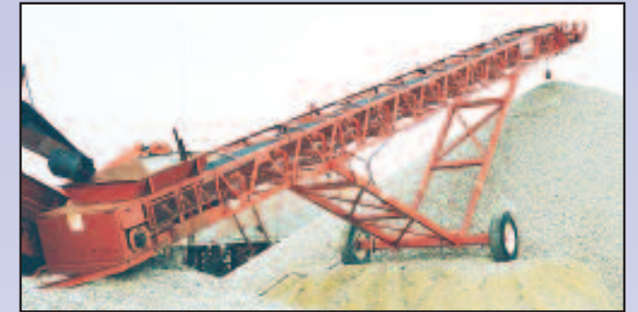
(1) OF (4) '97 SUPERIOR 60' RADIAL STACKERS

1997 FINLAY Model 524, 24"x50' Radial Stacking Conveyor , s/n FA471779, equipped with hydraulic raise and lower, hydraulic belt drive, rock guards, manual angle wheels, pintle hitch, and 12.5/80-15.3 tires. In good condition with good tires.