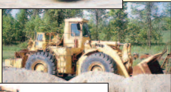
'92 CAT 988B