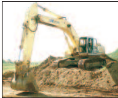
'96 SUMITOMO SH450LHD