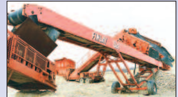
'97 FINLAY 50' RADIAL STACKER