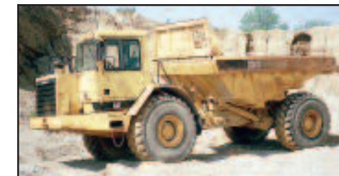
'94 CAT D30D