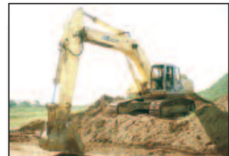
'96 SUMITOMO SH450LHD