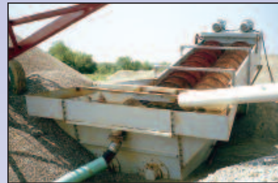
TYLER TY-ROCKET R1206X