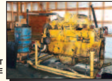
REBUILT CAT D353 ENGINE