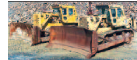
(2) CAT D9H'S