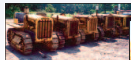
(4) CAT 15'S (1) CAT 22

AC MACK Single Axle Dump Truck , VIN# 53373, powered by gas engine and direct transmission, chain drive, and 11R24.6 tires. (Vintage Approximately 1919)