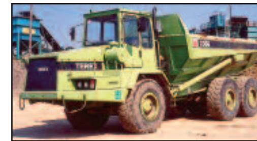
(1) OF (3) '89 TEREX 25 TON