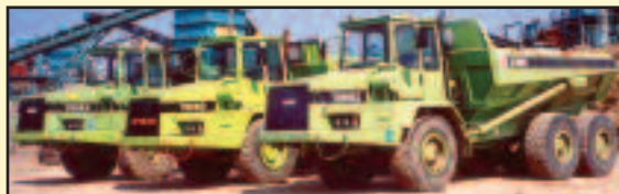
(3) TEREX 25 TON

1986 TEREX Model 2366, 25 Ton 6x6 Articulated End Dump , s/n GA21073, powered by Deutz 6 cylinder diesel engine and powershift transmission, equipped with 25/65R25 tires. In good condition with good tires.