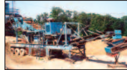
'97 BROWN LENOX 1000CT CONE W/SCREEN