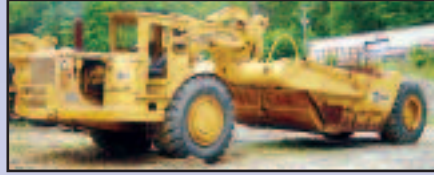
(1) OF (2) CAT 631B

CATERPILLAR Model 631B Motor Scraper , s/n 13G448, powered by Cat diesel engine and powershift transmission, equipped with canopy and 29.5-35 tires. In fair condition with fair tires.