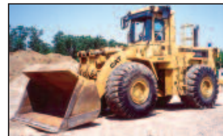
'85 CAT 980C