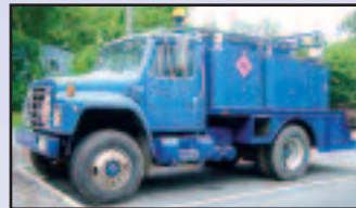
'86 INT'L FUEL/LUBE TRUCK

1986 INTERNATIONAL Model 1900 Fuel/Lube Truck , VIN# 1HSLRTVN2FHA45339, powered by DT466 diesel engine and 6 speed transmission, equipped with 160 gallon motor oil, 160 gallon hydraulic oil, 80 gallon antifreeze, 80 gallon gear lube, 160 waste oil, heated grease barrel, heated hose reels, and 11R22.5 tires. In good condition with good tires.