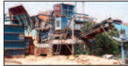
BROWN LENOX 42' X 36"