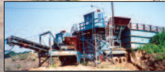
'89 BROWN LENOX