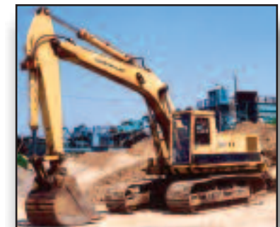
(1) OF (2) CAT 235