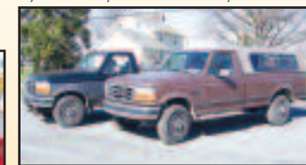
(2) '92 FORD F-250, 4X4'S