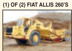
(1) OF (2) FIAT ALLIS 260'S