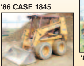
'86 CASE 1845