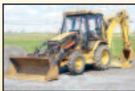
'99 CAT 416C-IT

1996 CATERPILLAR Model 953C Crawler Loader , s/n 2ZN00348, powered by Cat 3116 diesel engine and hydrostatic transmission, equipped with general purpose loader bucket with teeth, enclosed ROPS cab, and light package. In good condition with good undercarriage.