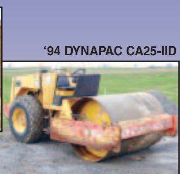
'94 DYNAPAC CA25-IID