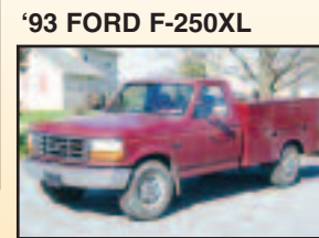
'93 FORD F-250XL

1993 CATERPILLAR Model 963 Crawler Loader , s/n 21Z04688, powered by Cat 3304 diesel engine and hydrostatic transmission, equipped with general purpose loader bucket with teeth, enclosed ROPS cab, and 18" DBG pads. In good condition with good undercarriage.