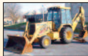
'95 JD 310D, 4X4