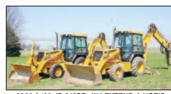
2000 & '99 JD 310SE, 4X4 EXTEND-A-HOE'S