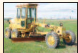
'86 FIAT ALLIS 65-B