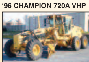
'96 CHAMPION 720A VHP