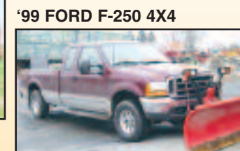
'99 FORD F-250 4X4