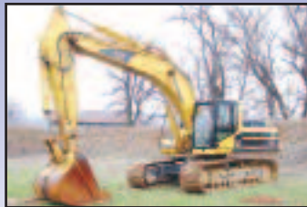
'97 CAT 330BL