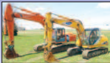
'97 HITACHI EX220LC-3 & SAMSUNG SE130LC