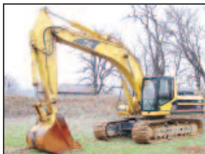
'97 CAT 330BL