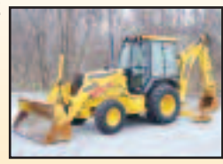
'94 CAT 416B, 4X4