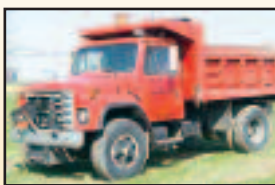
'81 INT'L 1954