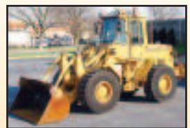
'88 FIAT ALLIS FR12B