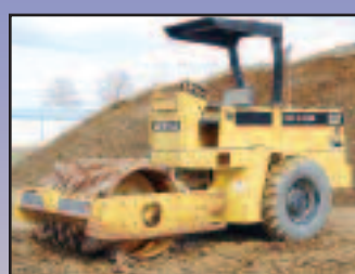
'91 CAT CP-433B

1993 ROSCO Model Rollpac III, s/n 32692, powered by Kohler Magnum 14HP gas engine and hydrostatic transmission, equipped with 28" front split drum, 33" rear drum, and water system. In fair to good condition.