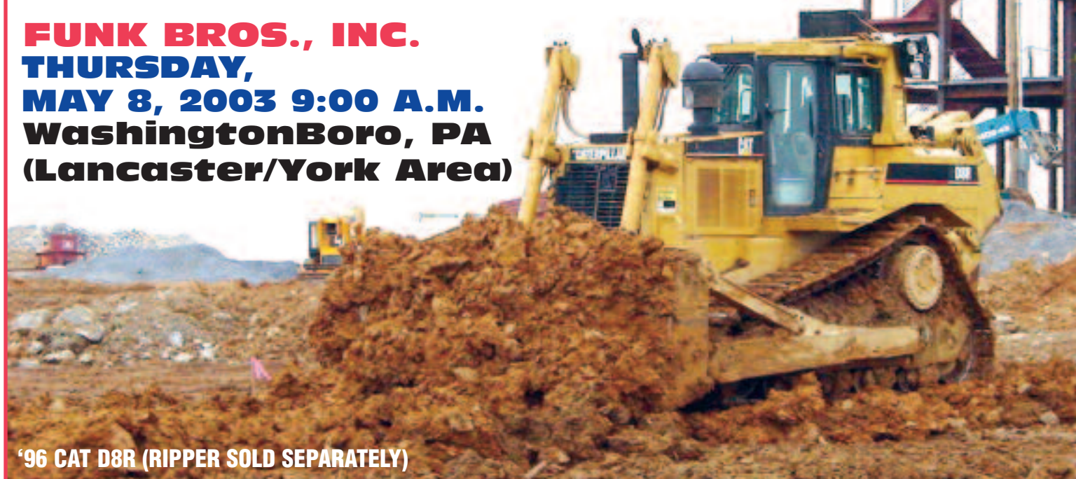
'96 CAT D8R (RIPPER SOLD SEPARATELY)

FUNK BROS., INC. THURSDAY, MAY 8, 2003 9:00 A.M. WashingtonBoro, PA (Lancaster/York Area)