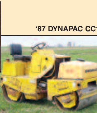
'87 DYNAPAC CC10