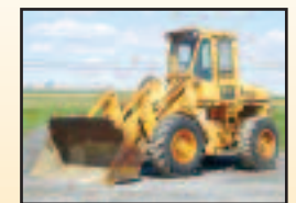
FIAT ALLIS 545B