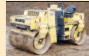
'87 BOMAG BW 151AD

TOW MOTOR Model 46 Solid Tired Forklift, s/n 600805, powered by 4 cylinder gas engine and shuttle transmission, equipped with 2-stage mast and 30" forks. In fair condition with fair tires.