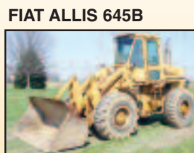
FIAT ALLIS 645B