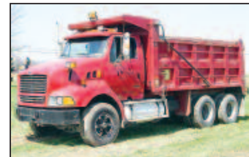
2000 STERLING LT9500