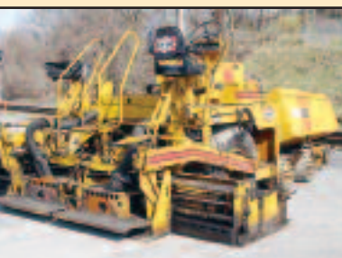
'88 BLAW KNOX PF-115

1988 BLAW KNOX Model PF-115 Rubber Tired Paver, s/n 11510-11, powered by John Deere diesel engine and hydrostatic transmission, equipped with 8'-13' heated and vibratory screed and 14.00x20 tires. In good condition with good tires. (Zero Hours On Clutch Assembly and Drive Ring, Conveyor Pump Shaft Kit)