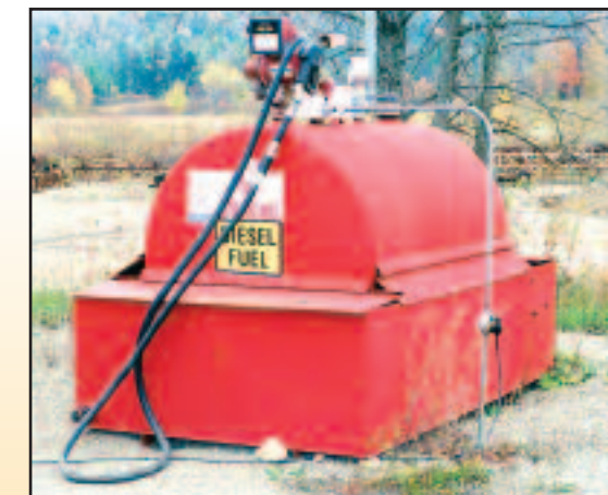
500 GALLON TANK

1958 FWD S750 Fire Truck • 1965 GMC Cab and Chassis • IHC 350 Hay Chopper • BALDERSON General Purpose Bucket • Spadenose Bucket with teeth • Approximately 30'x40' Steel Pole Building, with sheet metal siding and (1) door