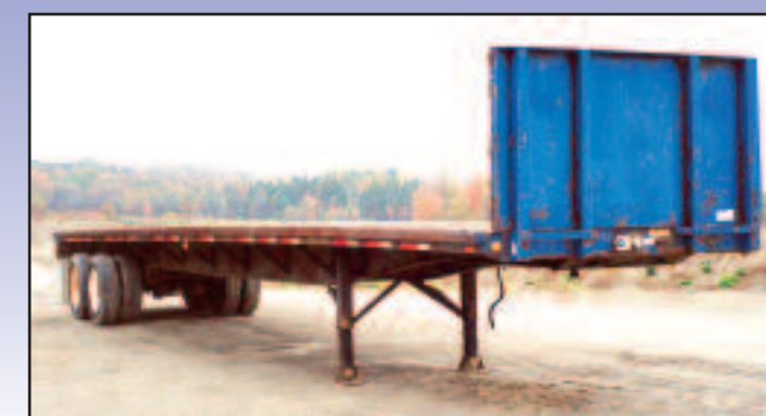
'93 FONTAINE 45'

5'x14' Rotary Scrubber with drive • TYLER 6'x14' Single Deck Vibrating Screen, s/n 1144 • TYLER 5'x14' 3-Deck Vibrating Screen, s/n 20491 • SIMPLICITY 3'x10' Vibrating Plate Feeder, s/n 3810-0FA5B-2605, with grizzly and structure • PULVOMATIC 44' Cage Mill • Miscellaneous Electric Motors • Starters • Disconnects, etc • JAEGER 6" Centrifugal Pump, with 40HP motor • MARLOW 4" Electric Pump • Miscellaneous Conveyor Belting • 6" Discharge Hose and Pipe • Electrical Conductor EAGLE Model BM-D15766 Sand Screw , s/n 9384, powered by 30HP electric motor, equipped with 54"x34" SSFM washer. In fair condition. EAGLE Model BM-D22609 Classifier , s/n 9284, equipped with 40', 3-cell WST with dial split. In fair condition.