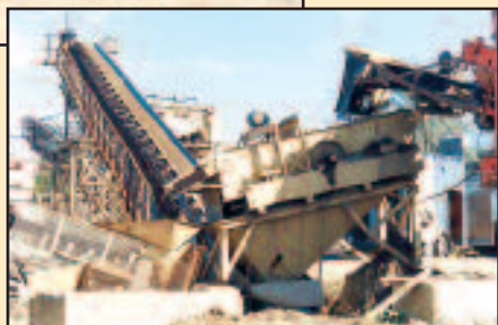
4'X10' SCREEN AND 120' CONVEYOR