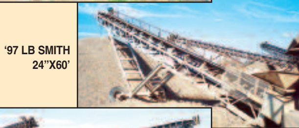
'97 LB SMITH 24"x60'