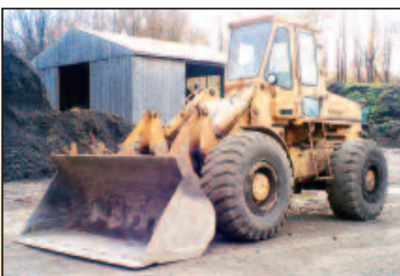
FIAT ALLIS 645B