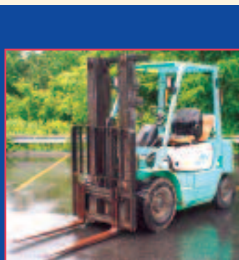
(1) OF (2) '99 MITSUBISHI 5,000#

(2) 1996 HYSTER Model E80XL, 8,000# Cushion Tired, Electric Forklifts , s/n C098D02121T and s/n C098D02478T, powered by electric motor and hydrostatic transmission, equipped with 121" 2-stage mast, mast tilt, 46" forks, operator protection, 22x9x16 front, and 8x7x12-1/8 rear tires. In fair condition with fair to good tires. (Missing Batteries) (First Union)