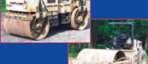
FIAT ALLIS 645B