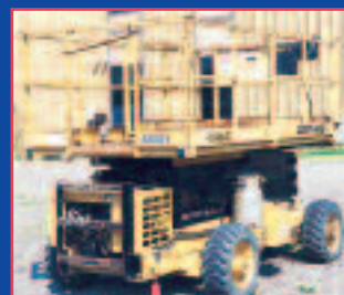
'97 GROVE 32'