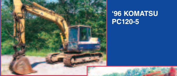
'96 KOMATSU PC120-5