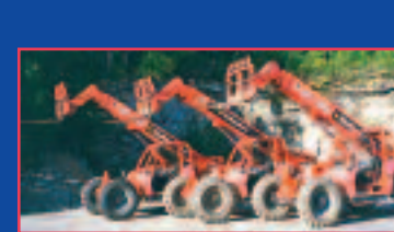
(3) OF (7) '99 SKY TRAK 6,000#