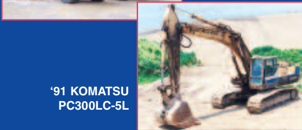
'91 KOMATSU PC300LC-5L