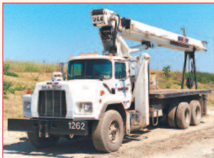
'95 JLG 22.5 TON- '95 MACK RB690S

1995 JLG Model 2250JBT, 22.5 Ton Hydraulic Boom , s/n 0400002982, equipped with 26'-85' 4-section hydraulic boom, 26'-46' extendable swing-away jib, mounted on 1995 Mack Model RB690S Tandem Axle Flatbed Truck, powered by Mack EM7-300, 300HP diesel engine and Maxitorque T2070, 7 speed transmission, equipped with 20'6" flatbed, (4) hydraulic outriggers, 425/65R22.5 front and 11R22.5 rear tires. In good condition with good tires. (Maxim) REACH-ALL Model CR-92, 10 Ton Boom Truck , equipped with 3-section hydraulic boom, mounted on 1985 FORD Model F-800 Single Axle Flatbed Truck, powered by V-8 gas engine and 5 speed transmission with 2 speed rear, equipped with 20' flatbed, and (4) hydraulic outriggers. In fair to good condition with fair to good tires.