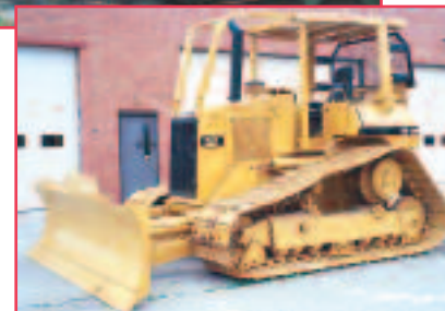
'96 CAT D4H LGP Series III