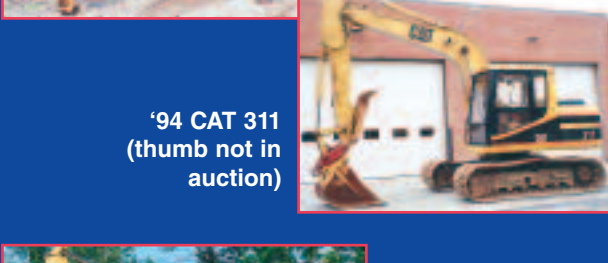
'94 CAT 311 (thumb not in auction)