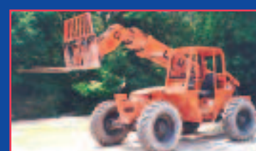
(1) OF (15) LULL 6,000#