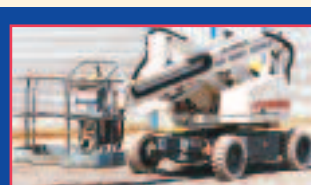
(1) OF (2) '98 TEREX 50'