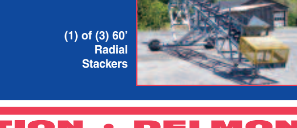
(1) of (3) 60" Radial Stackers

transmission, equipped with Ti-Brook 20" aluminum dump body, 44,000# rear axles, airlift 3rd axle, set-back front axle, and hi-floatation front tires. In good condition with good tires.