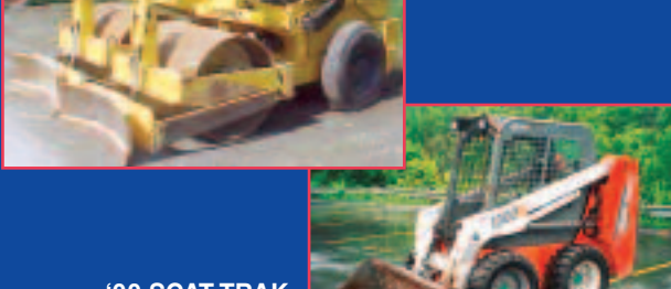
'94 IR SD-100D