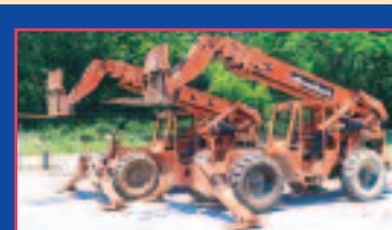
(2) OF (5) '99 LULL 10,000#