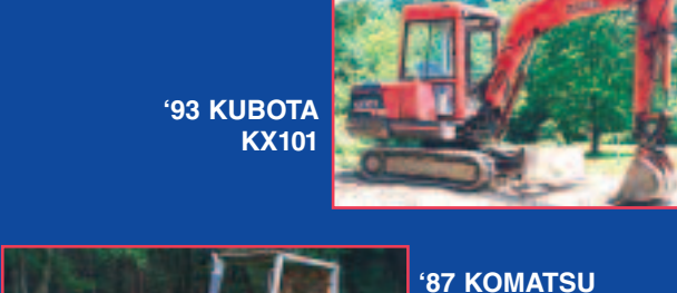
'93 KUBOTA KX101