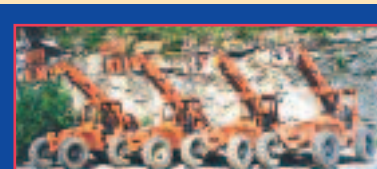
(4) OF (15) '99 LULL 6,000#