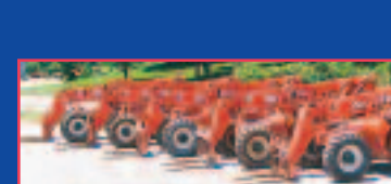
(5) OF (10) '99 SKY TRAK 8,000#