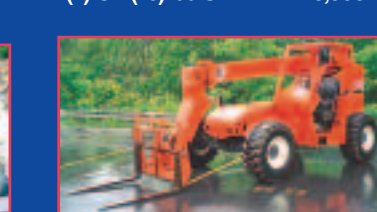
'99 SKY TRAK 5,000#