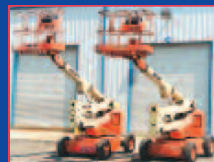
(2) '97 JLG 45'