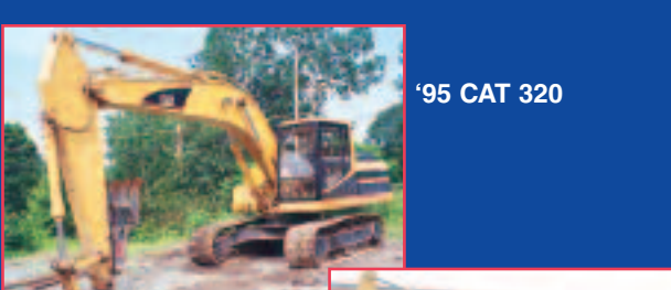
'95 CAT 320