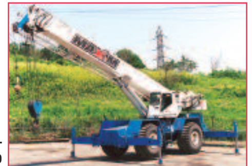
'92 LINK-BELT HSP8050

PRE-SORTED FIRST CLASS MAIL U.S. POSTAGE PAID HAVERTOWN, PA PERMIT #45