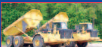
(2) of (3) '99 CAT D350E

1995 FORD Model LTS9000 Tri Axle Dump Truck, powered by Cat 3406, 375HP diesel engine and 10 speed