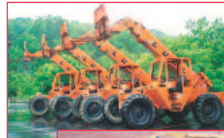
(4) of (43) Telescopic Forklifts

PRE-SORTED FIRST CLASS MAIL U.S. POSTAGE PAID HAVERTOWN, PA PERMIT #45