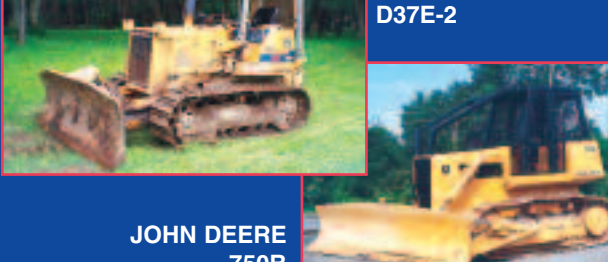
'87 KOMATSU D37E-2