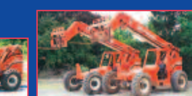
(2) OF (10) '99 SKY TRAK 8,000#