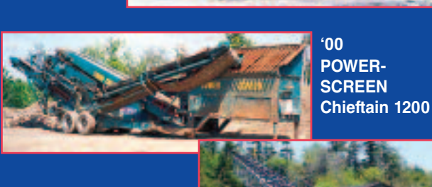
'00 POWER-SCREEN Chieftain 1200