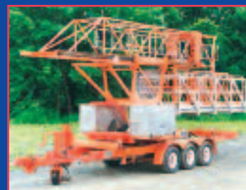
'00 HYDRA-PLATFORM HP-32