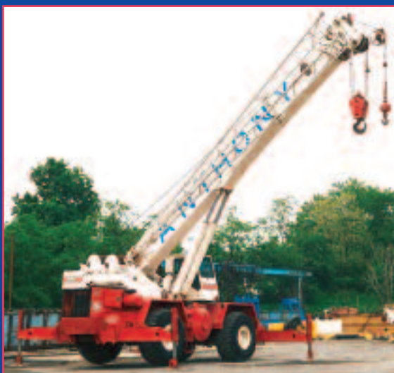
'92 LINK-BELT HSP8040