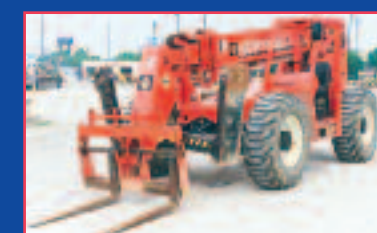
(1) OF (3) '99 SKY TRAK 10,000#