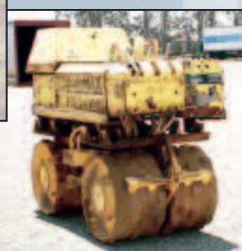
(1) OF (2) MQ TRENCH COMPACTORS

(13) 1999 MULTIQUIP Model Whisperwatt DCA45SIUII, 36KW Portable Generators , s/n 7201664; 7201665; 7201666; 7201661; 7201662; 7201668; 7201583; 7201698; 7201699; 7201703; 7201696; 7201701; 7201587, powered by Isuzu B-4BG1, 4 cylinder diesel engine, equipped with 45KVA, 60Hz, and tandem axle trailer with ST175/80D13 tires. In good condition with good tires.