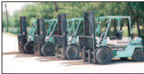
'99 MITSUBISHI 9,000#