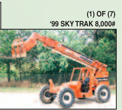
(1) OF (7) '99 SKY TRAK 8,000#