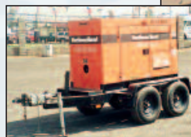
(1) OF (13) '99 MULTIQUIP 36KW