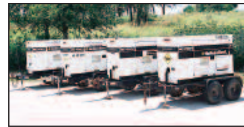
'99 MULTIQUIP 56KW