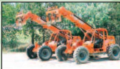
(2) OF (3) '99 SKY TRAK 3606-1

(10) 1999 SKY TRAK Model 5028-1, 5,000# 4x4 Telescopic Rough Terrain Forklifts , s/n 9519; 9521; 9522; 9664; 10580; 10514; 10517; 10652; 10654; 10653, powered by Cummins B3.9-C, 4 cylinder diesel engine and powershift transmission, equipped with 28' lift height, 2-section hydraulic boom, 48" forks, frame leveling, ROPS canopy, and 15x19.5 tires. In good condition with good tires.