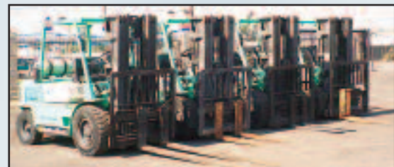
(4) '99 MITSUBISHI 9,000#

(8) 1999 MITSUBISHI Model FG25, 5,000# Pneumatic Tired Forklifts , s/n AF17B05476; AF17B05024; AF17B05025; AF17B05026; AF17B05027; AF17B90640; AF17B90642; AF17B90643, powered by Mitsubishi 4 cylinder LP gas engine and shuttle transmission, equipped with 190" 3-stage mast, 42" forks, sideshift, ROPS canopy, 7.00x12 front and 6.00x9 rear tires. In good condition with good tires.