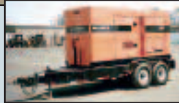
(1) OF (4) '99 MULTIQUIP 176KW