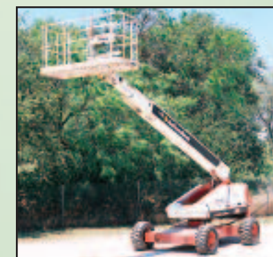
'99 SNORKEL 42'

(17) 1999 MULTIQUIP Model Whisperwatt DCA-45SIUII, 36KW Portable Generators , s/n 7201374; 7201588; 7201621; 7201635; 7201382; 7201590; 7201577; 7201377; 7201392; 7201394; 7201586; 7201585; 7201571; 7201574; 7201578; 7201725; 7201581, powered by Isuzu B-4BG1, 4 cylinder diesel engine, equipped with 45KVA, 60hz, and tandem axle trailer with 205/75D14 tires. In good condition with good tires.