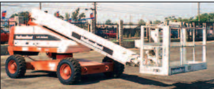
(1) OF (3) '99 SNORKEL 42'

1999 SNORKEL Model TBA42RDZ, 42' Aerial Lift , s/n 993998, powered by Deutz 4 cylinder diesel engine and hydrostatic transmission, equipped with 500# 2-man basket and 12x16.5 tires. In good condition with good tires.