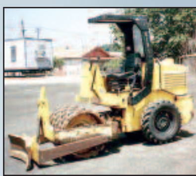
'99 MULTIQUIP 35" PADFOOT