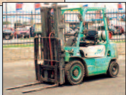
(1) OF (8) '99 MITSUBISHI 5,000#