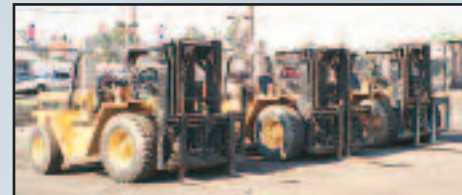
(3) '99 EAGLE PICHER 6,000#

mission, equipped with 120" 3-stage mast, 48" forks, sideshift, ROPS canopy, and 15x19.5 tires. In good condition with good tires.