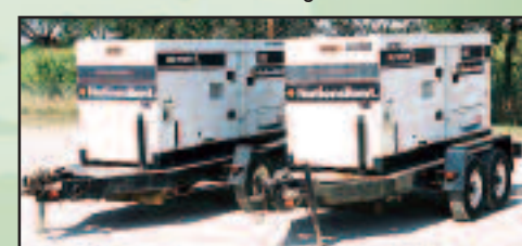
(2) OF (3) '99 MULTIQUIP 120KW

(18) 1999 MULTIQUIP Model Whisperwatt DCA-70SSJU, 56KW Portable Generators , s/n 7301601; 7301612; 7301602; 7301551; 7301568; 7301867; 7301919; 7301623; 7301566; 7301705; 7301689; 7301703; 7301706; 7301687; 7301688; 7301701; 7301714; 7301707, powered by John Deere 4045TF, 4 cylinder diesel engine, equipped with 70KVA, 60Hz, and tandem axle trailer with 205/75D14 tires. In good condition with good tires.