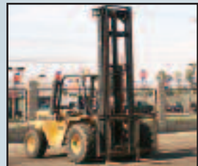
(1) OF (3) EAGLE PICHER 10,000#

(6) 4X4 ROUGH TERRAIN FORKLIFTS (3) 1999 EAGLE PICHER Model R-80-10K, 10,000# 4x4 Rough Terrain Forklifts , s/n 49A03633; 49A03634; 49A03635, powered by Perkins 4 cylinder diesel engine and shuttle transmission, equipped with 29'6" 3-stage mast, 48" forks, sideshift, ROPS canopy, and 18R-19.5XF tires. In good condition with good tires.