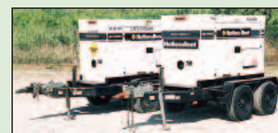
(2) OF (17) '99 MULTIQUIP 36KW

(17) 1999 MULTIQUIP Model Whisperwatt DCA-45SIUII, 36KW Portable Generators , s/n 7201374; 7201588; 7201621; 7201635; 7201382; 7201590; 7201577; 7201377; 7201392; 7201394; 7201586; 7201585; 7201571; 7201574; 7201578; 7201725; 7201581, powered by Isuzu B-4BG1, 4 cylinder diesel engine, equipped with 45KVA, 60hz, and tandem axle trailer with 205/75D14 tires. In good condition with good tires.