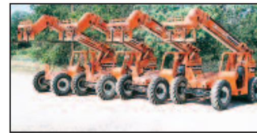
'99 SKY TRAK 8,000#

IRVING, TEXAS (DALLAS/FT WORTH) THURSDAY AUGUST 28, 2003 - 10:00 AM