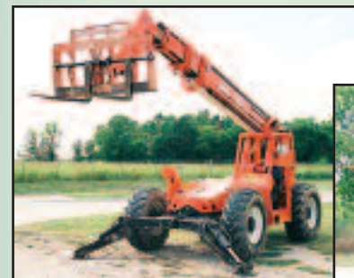
'99 SKY TRAK 10,000#