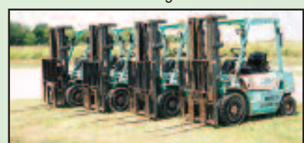
(4) OF (10) '99 MITSUBISHI 5,000#

(8) 1999 MITSUBISHI Model FD40, 9,000# Pneumatic Tired Forklifts , s/n AF19B00489; 00490; 00477; 00480; 00468; 00478; 00487; 00488, powered by Mitsubishi 6 cylinder diesel engine and shuttle transmission, equipped with 132" 2-stage mast, side shift, 42" forks, operator protection, light package, 3.00x15 front and 7.00x12 rear tires. In good condition with good tires.