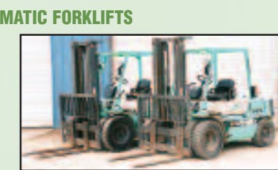
(2) OF (8) '99 MITSUBISHI 9,000#