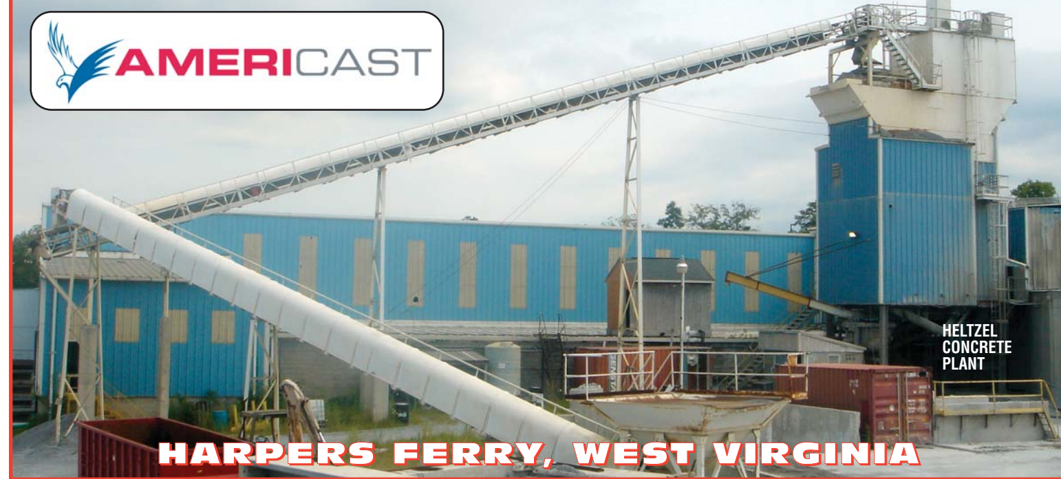
HELZEL CONCRETE PLANT