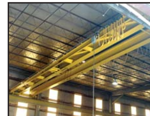
ACCO WRIGHT 5 TON

ACCO WRIGHT 5 Ton Double Girder Top Running Bridge Crane , powered by 480-volt electric motor, equipped with 2 speed 5 ton hoist, pendant and hoist festoon, and approx. 48' span. In good condition. SHAW BOX 5 Ton Double Girder Top Running Bridge Crane , powered by 480-volt electric motor, equipped with Abus 2 speed 5 ton hoist, pendant and hoist festoon, and approx. 47' span with 38' electrified craneway. In good condition. ABUS 5 Ton Single Girder Top Running Bridge Crane , powered by 480-volt electric motor, equipped with Abus 2 speed 5 ton hoist, pendant and hoist festoon, and approx. 48' span. In good condition. P&H 5 Ton Double Girder Top Running Bridge Crane , s/n 10780, powered by 480-volt electric motor, equipped with Abus 2 speed 5 ton hoist, pendant festoon, maintenance catwalk, safety rail, and approx. 72' span. In good condition. P&H 15 Ton Double Girder Top Running Bridge Crane , s/n 12536, powered by 480-volt electric motor, equipped with Abus 2 speed 15 ton hoist, pendant and hoist festoon, maintenance catwalk, safety rail, and approx. 72' span. In good condition. (192') of Electrified Crane Rail , with 60# rail (Total Approx. 384') (190') of 10 Ton Electrified Craneway , with 40# rail (Total Approx. 380') (Welded)