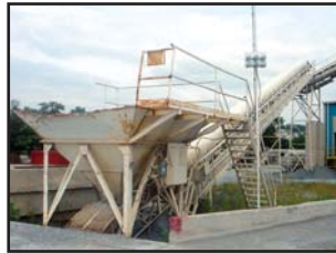
15 TON AGG. HOPPER

(Note: The Plant Will Be Offered With The Noted Components Offered Separately and By The Entirety) (Buyer is Responsible For Dismantlement and Loadout)