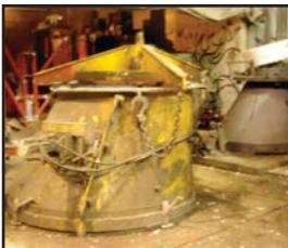
ECCENTRIC CONE MOLD & CORE