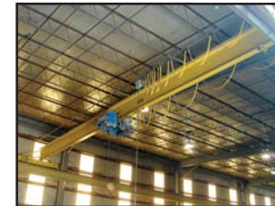
ABUS 5 TON