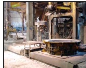
CLECO VIBRATION TABLES