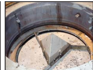
CLECO RETRACTING CORE