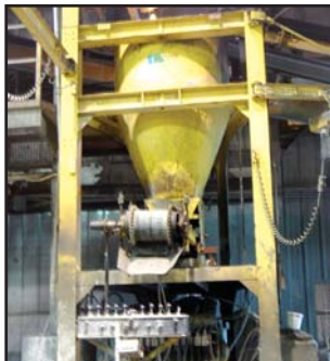
CLECO FEEDER & CONTROL STATION

(Note: The Machine and Molds Will Be Offered Separately and Together)