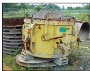
CLECO MONO BASE

1984 CLECO/CVSI Model CVSI-6048-78-2, 2-Station Dry Cast Manhole Machine , s/n 84004, powered by electro/hydraulic power unit, equipped with (1) production station with retracting core for 48" diameter risers and (1) production station for 48" diameter cones and flat tops, operators console, 2.5 cubic yard material hopper with oscillating discharge conveyor, and (2) jib cranes with 1 ton electric hoists. In good condition. (Buyer Must Dismantle and Loadout) CLECO Dry Cast Manhole Molds : Risers: 48" diameter x 1'4"; 2'8"; and 4'0" high • Eccentric Cone : 48-24 x 2'8" high • Mono Base: 2'8" • (1) Flat Top Approximately (65) 48" Single Offset Joint Cast Steel Pallets • Various Mechanical and Pneumatic Core Extruders and Lifters Kiln Cars (Buyer Must Dismantle and Loadout): (18) 12'x18' Steel Frame and Decked Kiln Cars with heavy duty wheels • (2) Transfer Cars with electric drive, cable reels, and (3) pneumatic winches • (2) Hydraulic Pusher Rams with hydraulic power unit and reservoir.