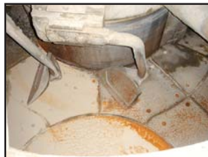
2 CUBIC YARD PAN MIXER