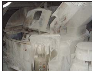
2 CUBIC YARD PAN MIXER