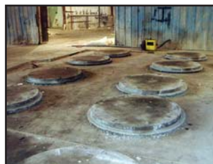
PALLETS & KILN CARS