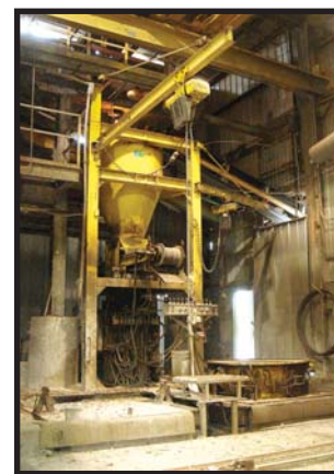
CLECO DRY CAST MACHINE

PRE-SORTED FIRST CLASS MAIL US POSTAGE PAID HAVERTOWN, PA PERMIT #45