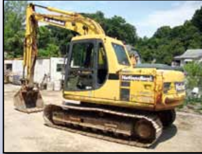
'98 KOMATSU PC120-6

1998 KOMATSU Model PC120-6 Hydraulic Excavator , s/n 60927, powered by 6 cylinder diesel engine and hydrostatic drive, equipped with 10' dipper stick, WB quick coupler, hydraulic plumbing, stiff arm bracket, light package, and 11'6" crawlers, 23.5" TBG pads. In fair to good condition with fair to good undercarriage.