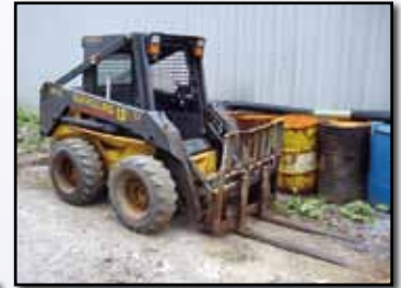
'01 NEW HOLLAND LS 170 HI-FLOW

2001 NEW HOLLAND Model LS170 Skid Steer Loader , s/n 171935, powered by Kubota 4 cylinder diesel engine and hydrostatic drive, equipped with 66" loader bucket with teeth, Hi-Flow auxiliary hydraulics, light package, and 12x16.5 tires. In good condition with fair tires.