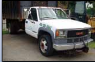
'98 GMC 3500 FLATBED DUMP

1998 GMC Model 3500HD SL Single Axle Flatbed Dump Truck , powered by 6.5L turbo diesel engine and automatic transmission, equipped with 13'6" steel flatbed, 42" steel solid stake sides, Blizzard plow frame and controls, dual rear wheels, and 225/70R19.5 tires. In fair to good condition with fair to good tires.