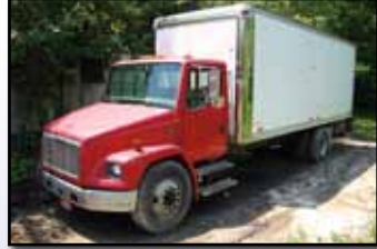
'01 FREIGHTLINER FL60

2001 FREIGHTLINER Model FL 60 Single Axle Van Body Truck , powered by Cat 3126 diesel engine and 6 speed transmission, equipped with 22' van body with lift gate, 25,550# GVWR and 11R22.5 tires. In good condition with good tires.