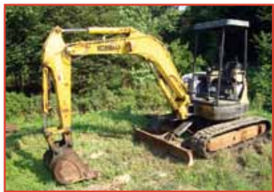
'02 KOBELCO SK35SP