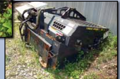
ROCK HOUND 60B