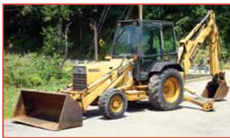
'91 FORD 655C 4X4