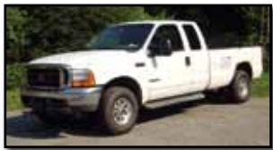
'01 FORD F250XL 4X4

2001 FORD Model F-250XL Super Duty 4x4 Quad Cab Pickup Truck , powered by Powerstroke diesel engine and automatic transmission, equipped with 8' bed, liner, tow package, power windows, locks and mirrors, 8'6" Western Unimount snow plow, and 265/75R16 tires. In good condition with good tires.