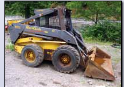
'99 NEW HOLLAND LS 180

1999 NEW HOLLAND Model LS180 Skid Steer Loader , s/n 181765, powered by 4 cylinder diesel engine and 2 speed hydrostatic drive, equipped with 77" loader bucket, auxiliary hydraulics, light package, and 12x16.5 tires. In good condition with (2) good and (2) poor tires.