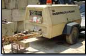
INGERSOLL RAND 185CFM

DITCH WITCH Model 100SX Walk Behind Cable Plow , s/n 4J0199, powered by Honda 11HP gas engine.