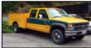
'98 CHEVY 3500 4X4

1994 FORD Model F-350 Single Axle Stake Body Truck , powered by 5.8L gas engine and automatic transmission, equipped with 12' stake body, side tool boxes, and 265/75R16 tires. In good condition with good tires.