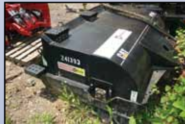
CAT BP15B BROOM

ATTACHMENTS: CATERPILLAR BP15B Hydraulic Broom • ROCK HOUND 60B Landscape Rake • BOBCAT Sweeper 60 Broom Attachment • (2) Hydraulic Preparator Attachments • BRADCO C1825 Hydraulic Auger Attachment , with 12" and 30" augers • CARETREE Hydraulic Tree Ball Carrier • (2 Sets) 14" Steel Grouser Tracks