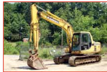
'98 KOMATSU PC120