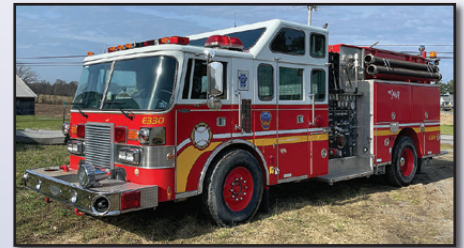
PIERCE E4057 FIRE TRUCK

powered by diesel engine and automatic transmission, equipped with 1,750 GPM pump capacity, water cannon, rider cab, 24,000# rear and 16,200 front axle, 40,200# GVWR, and 315/80R22.5 tires. In good condition with good tires. (Odometer Reads 058,809 Miles) (Meter Reads 027,354 Hours)