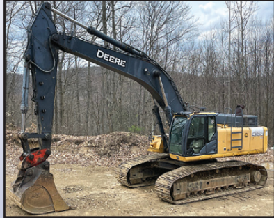
'13 JOHN DEERE 470G LC

2013 JOHN DEERE Model 470G LC Hydraulic Excavator , s/n 470400, powered by JD 6 cylinder diesel engine and hydraulic drive, equipped with 12'6" dipper stick, TAG 60" digging bucket, Esco hydraulic coupler, auxiliary hydraulics, rearview camera, counterweight removal system, pattern changer, heated seat, enclosed ROPS cab with heat, and 35.5" TBG pads. In good condition with good undercarriage. (Meter Reads 6,690 Hours) (Less Than 250 Hours on NEW Injector Pump, Injectors, and Fuel Lines) (Auxiliary Hydraulic Piping Removed)