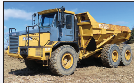
00 JOHN DEERE 250C

Articulated End Dump , s/n BE250CT00010, powered by Mercedes 6 cylinder diesel engine and Allison push button automatic transmission, equipped with lined bed, exhaust brake, hydraulic retarder, companion seat, enclosed ROPS cab with heat and air conditioning, and 23.5R25 tires. In good condition with good tires. (Meter Reads 5,889 Hours)