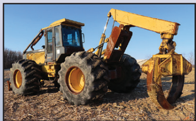
'01 JOHN DEERE 648G-III

2001 JOHN DEERE Model 648G-III Dual Arch Grapple Skidder , s/n X581539, powered by JD 6 cylinder diesel engine and powershift transmission, equipped with 7'2" push blade, hydraulic winch, 60" rotating grapple, enclosed ROPS cab with sweeps, heat and air conditioning, and foam filled tires. In good condition with good tires. (Meter Reads 18,504 Hours) (Zero Hours on Reman Engine)