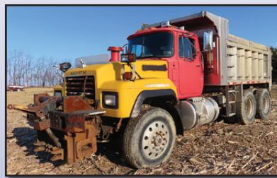
'00 MACK RD688S

and hydraulic outlets, aluminum wheels, stainless steel tailgate spreader, 11' hydraulic angle snow plow, and 11R24.5 tires. In good condition with good tires. (Odometer Reads 177,375 Miles) (Meter Reads 2,921 Hours)