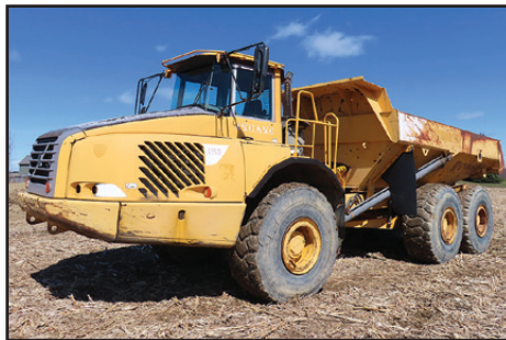
03 VOLVO A35D

, s/n A35DV71083, powered by Volvo 6 cylinder diesel engine and 4 speed automatic transmission, equipped with heated and lined bed, enclosed ROPS cab with heat and air conditioning, and 26.5R25 tires. In good condition with good tires. (Approximately 18,000 Hours – Clock Not Operating) (Odometer Reads 010,168 Miles) (Bed Relined Approximately 200 Hours Ago)