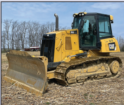
14 CAT D6K XL

Crawler Tractor , s/n WMR00631, powered by Cat diesel engine and push button powershift transmission, equipped with 6-way folding straight blade, joystick steering, drawbar, GPS ready, enclosed ROPS cab with heat and air conditioning, and 22" SBG pads. In good to very good condition with good to very good undercarriage. (Meter Reads 1,445 Hours) (NEW Injector Pump and Supply Pump)