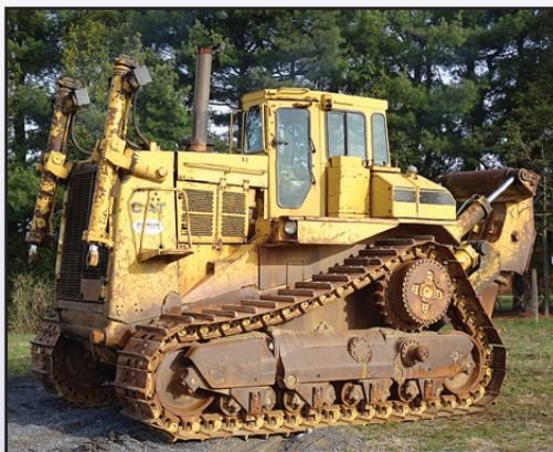
88 CAT D10N

Crawler Tractor , s/n 2YD00448, powered by Cat 3412 diesel engine and powershift transmission, equipped with U-blade with twin tilt, 4-barrel, single shank ripper, s/n 1XH00247, ROPS over enclosed cab with heat and air conditioning, and