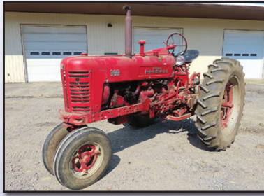
'56 IH MCCORMICK FARMALL 300

Utility Tractor , s/n 26563SJ, powered by 4 cylinder, 42HP diesel engine and 4 speed transmission, equipped with 3-point hitch, PTO, auxiliary hydraulics, inner and outer rear wheel weights, 6.00x16 front and 13.6x38 rear tires. In good condition with good tires. (Meter Reads 4,318 Hours)