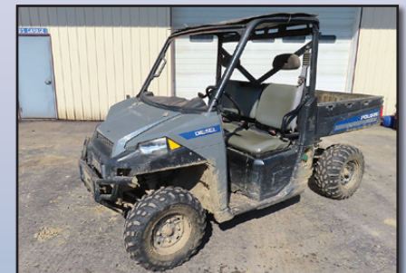
POLARIS BRUTUS 4X4

POLARIS Brutus 4x4 Side by Side , powered by Yanmar 3 cylinder diesel engine and 2 speed hydrostatic transmission, equipped with manual dump bed, tow package, ROPS canopy, and 25x11x12 NHS tires. In good condition with good tires. (Odometer Reads 1,070 Miles)