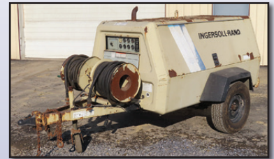
'96 IR 185CFM