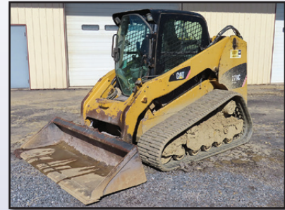
'09 CAT 279C

JD 36" Digging Bucket (JD 310SG) • JD 12" Digging Bucket (JD 310SG) • Hydraulic Plate Compactor (JD 310SG) 2009 CATERPILLAR Model 279C Crawler Skid Steer Loader , s/n MBT00747, powered by Cat C3.4 diesel engine and 2 speed hydrostatic transmission, equipped with 80" general purpose loader bucket with bolt-on cutting edge, hydraulic coupler, auxiliary hydraulics, rearview camera, enclosed ROPS cab with heat and air conditioning, and 17.5" rubber tracks. In good condition with good tracks. (Meter Reads 2,977 Hours)