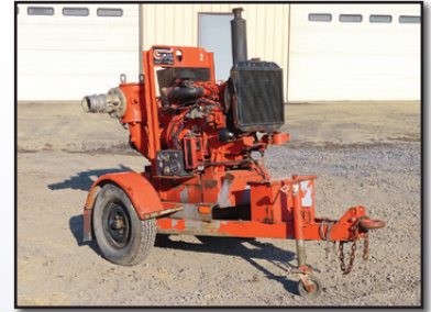
'92 GODWIN CD100

OVER-LOWE Model TM3A4DC/LW Portable Light Plant/Generator , s/n 835023, powered by Lombardini 2 cylinder diesel engine, equipped with manual raise, (4) lights, Dyna 8,000 watt generator, and 325/75R15 tires. In fair to good condition with good tires. (Meter Reads 2,059 Hours) 4" Suction and Discharge Hose