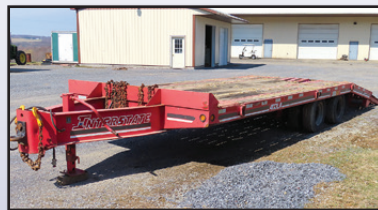
'99 INTERSTATE 40DLA

1999 INTERSTATE Model 40DLA, 20 Ton Tandem Axle Tag-A-Long Trailer , equipped with 19' level deck, 6' beavertail, 5' ramps, 102" width, manual adjustable pintle hitch, spring suspension, air brakes, and 215/75R17.5 tires. In good condition with good tires.