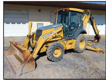
'01 JOHN DEERE 310SG 4X4 E-HOE

2001 JOHN DEERE Model 310SG, 4x4 Tractor Loader Extend-A-Hoe , s/n 895944, powered by JD 4 cylinder diesel engine and shuttle transmission, equipped with general purpose loader bucket with bolt-on cutting edge, 24" digging bucket, rear auxiliary hydraulics, enclosed ROPS cab with heat, 12.5/80-18 front and 19.5Lx24 rear tires. In good condition with good tires. (Meter Reads 3,758 Hours)