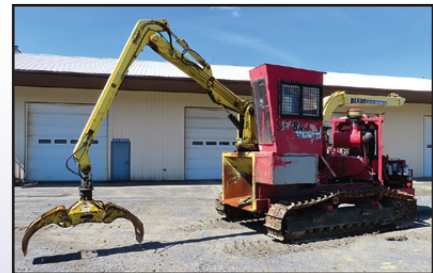
'91 BANDIT 1900

1991 BANDIT Model 1900 Crawler Whole Tree Disc Chipper , s/n 1026, powered by Cummins 855 diesel engine and hydraulic drive, equipped with 8'6" boom, 19" diameter capacity, 18" x 6' hydraulic rotating grapple, 24" feed rollers, joystick controls, foot travel controls, enclosed ROPS cab with heat and air conditioning, and 20" SBG pads. In good condition with very good undercarriage. (Meter Reads 2,631 Hours In Cab) (Zero Hours on Rebuilt Engine; All Hoses Replaced with Metal Plumbing)