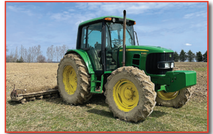
'09 JOHN DEERE 6430