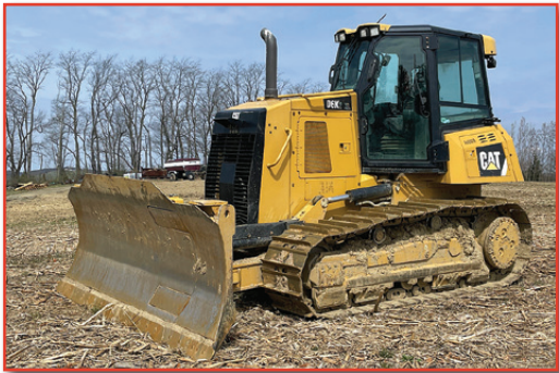
'14 CAT D6K XL

PRE-SORTED FIRST CLASS MAIL US POSTAGE PAID UPPER DARBY, PA PERMIT #45