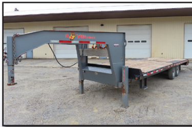
'18 B WISE THDG-2416

2018 B WISE Model THDG-2416 Tandem Axle Gooseneck Trailer , equipped with 24' level deck, 20" folding ramp, 98" deck width, 102" overall width, stake pockets, chain dogs, electric brakes, spring suspension, 7,000# axles, 16,800# GVWR, and 235/80R16 tires. In good condition with good tires.