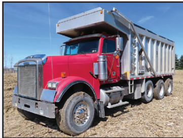
'07 FREIGHTLINER 120 CLASSIC

2007 FREIGHTLINER Model 120 Classic Tri-Axle Dump Truck , powered by Detroit Series 60, 515HP diesel engine and Fuller 18 speed transmission, equipped with Trail King ADB19-676+4, 19'6" aluminum dump body with chute and pneumatic tarp, 46,000# rears, 18,740 front and lift axles, 83,480 GVWR, block beam suspension, 2-stage engine brake, pintle hitch with air and electric, aluminum wheels, heated mirrors, power passenger mirrors, cruise control, air conditioning, 385/65R22.5 front and lift and 11R24.5 rear tires. In good condition with good tires. (Odometer Reads 435,219 Miles) (Engine and Transmission Rebuilt by Penn Diesel at Approximately 200,000 Miles)