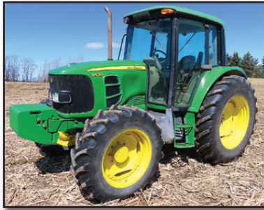
'09 JOHN DEERE 6430

2009 JOHN DEERE Model 6430, 4x4 Utility Tractor , s/n L06430H619314, powered by JD 4.5L, 115HP diesel engine and shuttle transmission, equipped with 3-point hitch, PTO, dual hydraulic outlets, (14) front pocketbook counterweights, enclosed ROPS cab with heat and air conditioning, 340/85R28 front and 460/85R38 rear tires. In very good condition with very good tires. (Hour Meter Not Operating)