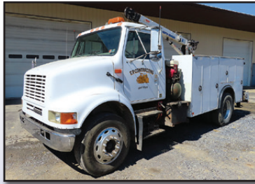
'00 INTERNATIONAL 8100

2000 INTERNATIONAL Model 8100 Single Axle Service Truck , powered by Cat C-10 diesel engine and Rockwell 10 speed transmission, equipped with Auto Crane Titan 11' open service body with 24" work bumper with vise, Auto Crane 8406H service boom with wireless remote, Miller Trail Blazer 325 diesel welder/generator, s/n MF020298R (0,278 hours), 2-stage air compressor, Honda GX390 gas engine, tow package with electric, 3-stage engine brake, air brakes, aluminum wheels, (2) manual outriggers, cruise control, air conditioning, 275/80R22.5 front and 11R22.5 rear tires. In very good condition with good tires. (Odometer Reads 235,358 Miles)