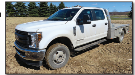
'19 FORD F-350XL 4X4

2019 FORD Model F-350XL, 4x4 Crew Cab Flatbed Truck , powered by Powerstroke 6.7L diesel engine and automatic transmission, equipped with CM 9'6" aluminum flatbed with 5th wheel pin, storage bins and stake pockets, tow package, running boards, power windows, locks, and mirrors, dual rear wheels, cruise control, air conditioning, and 245/75R17 tires. In good condition with good tires. (Odometer Reads 091,911 Miles)