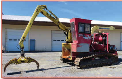
'91 BANDIT 1900

1440 COWPATH RD. • HATFIELD, PA 19440 215/361-9099 • Fax: 215/361-9212 www.hunyady.com