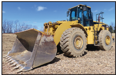
'99 CAT 980G

1999 CATERPILLAR Model 980G Rubber Tired Loader , s/n 2KR03263, powered by Cat 3406 diesel engine and powershift transmission, equipped with general purpose loader bucket with teeth and weld-on segments, Micro Load 300 bucket scale, fingertip controls, enclosed ROPS cab with heat, and 29.5R25 tires. In good condition with good front and fair rear tires. (Meter Reads 47,268 Hours)