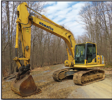
'13 KOMATSU PC160LC-8

2013 KOMATSU Model PC160LC-8 Hydraulic Excavator , s/n 25515, powered by Komatsu EC03, 6 cylinder diesel engine and hydraulic drive, equipped with 8'6" dipper stick, Lemac 42" digging bucket, JRB hydraulic coupler, auxiliary hydraulics, rearview camera, enclosed ROPS cab with heat and air conditioning, and 23.5" TBG pads. In good condition with good undercarriage. (Meter Reads 04,675 Hours)