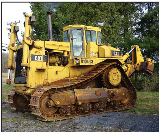
90 CAT D10N

Crawler Tractor , s/n 2YD01385, powered by Cat 3412 diesel engine and powershift transmission, equipped with U-blade with twin tilt, 4-barrel, multi shank ripper with (1) shank, s/n 1WH00407, ROPS over enclosed cab with heat and air conditioning, and 27.75" SBG pads. In good condition with good undercarriage. (Less Than 500 Hours on 200 Hour Rebuilt Running Takeout Engine – No Documentation)