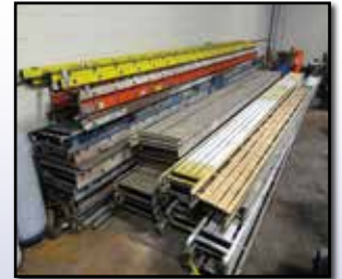
LADDERS AND PIC BOARDS

(12) GRACO and TITAN Electric Airless Paint Sprayers • (4) GRACO Gas Powered Sprayers • GRACO Textured Coating Sprayers • HVLP and Double Diaphragm Paint Pots • (2) Sandblast Pots • (2) EMGLO Gas Powered Air Compressors • (2) Electric Air Compressors • (3) Generators • (4) Gas Powered Pressure Washers • Gang Boxes • (17+/-) 6'-12' Step Ladders • (30+/-) 16'-40' Extension Ladders • (15+/-) Scaffolding Sets, with castors • (20+/-) 7'-30' Aluminum Pic Boards • Portable Space Heaters • 500 Gallon Fuel Tank, with pump • 1,500 Poly Water Tank • Pallet Jacks and Platform Carts • Traffic Control Barricades and Cones • Truck Accessories: 8' Pickup Bid (GMC 3/4 Ton, 4x4) • 11'5" and 8' Material Racks • Toolboxes • RICOH Aficio MP2851 Copier/Fax/Scanner • CANON IPF605 Image Prograph 24" Printer • Phone System, with (5) desk phones • Drafting Table • Receptionist Desk • Desks, Chairs, File Cabinets