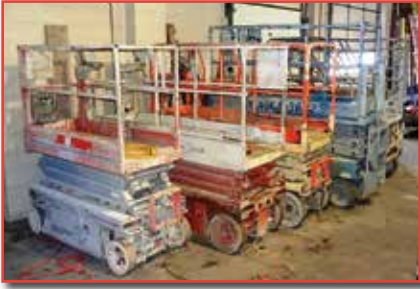
(6) SCISSORS LIFTS