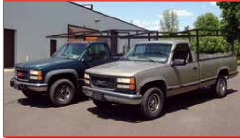
(2) GMC PICKUPS