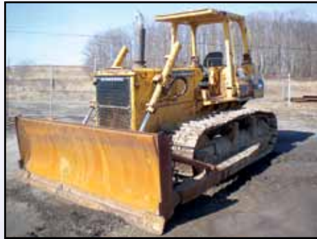
'87 KOMATSU D63E-1

1987 KOMATSU Model D63E-1 Crawler Tractor , s/n 01031, powered by Komatsu diesel engine and powershift transmission, equipped with straight blade with tilt, ROPS canopy, and 20" SBG pads. In fair condition with good undercarriage.