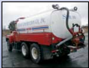
'71 MACK R785

1971 MACK Model R685 Tandem Axle Water Truck , powered by Mack 237HP diesel engine and 5 speed transmission, equipped with 3,000 gallon aluminum body, 4" pump (missing engine), (2) rear spray heads, front air actuated spray head, double fame, and 10.00x20 tires. In good condition with good tires. (Odometer Reads 284,941 Miles)