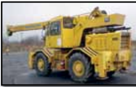
GROVE RT60S, 18 TON

Model 644B-42, 4x4 6,000# Telescopic Forklift , s/n 98Z24N21552, powered by Cummins B3.9-C diesel engine and powershift transmission, equipped with 31.5' 3-section hydraulic boom, 42' fork height, 48" forks, fork tilt and rotation, house leveling, enclosed ROPS cab, and 13.00-24 tires. In good condition with good tires.