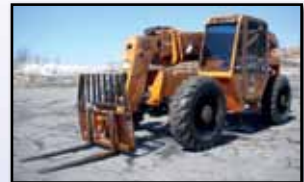
98 LULL 644B-42, 6,000#