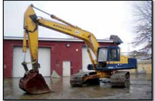
'87 KOMATSU PC220LC-3

Attachments: 1991 STANLEY MB3900 Hydraulic Demolition Hammer • TRAMAC Badger PC200 Hydraulic Plate Compactor • 1992 ROCKLAND 42" Compaction Wheel • Digging Buckets: PC150: 24" and 19" • PC220: 24" • PC400: 66" • 2001 EFFICIENCY 7.5 Cubic Yard Stone Box