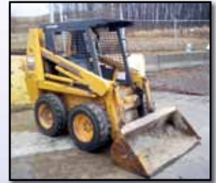
95 CASE 1840

2001 CASE Model 1845C Skid Steer Loader , s/n JAF0333305, powered by Case diesel engine and hydrostatic transmission, equipped with 72" loader bucket, auxiliary hydraulics, ROPS canopy, and 12-16.5 tires. In good condition with good tires.