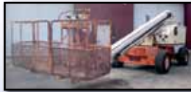
'90 JLG 60H

1990 JLG Model 60H Self-Propelled Aerial Lift , s/n 0309013497, powered