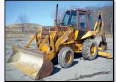
'85 CASE 680K

1985 CASE Model 680K Tractor Loader Backhoe , s/n 9158051, powered by Case diesel engine and shuttle transmission, equipped with general purpose loader bucket, 24" digging bucket, enclosed ROPS cab, and 11.00-16 front and 19.5LR24 rear tires. In fair to good condition with fair tires.