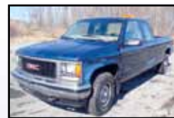
'98 GMC 1500SL 4X4

(2) 1998 GMC Model 1500SL, 4x4 Extended Cab Pickup Trucks , powered by Vortec 5.0L gas engine and 5 speed transmission, equipped with 8' bed, air conditioning, and 245/75R16 tires. In fair condition with fair to poor tires. (One Not Running)