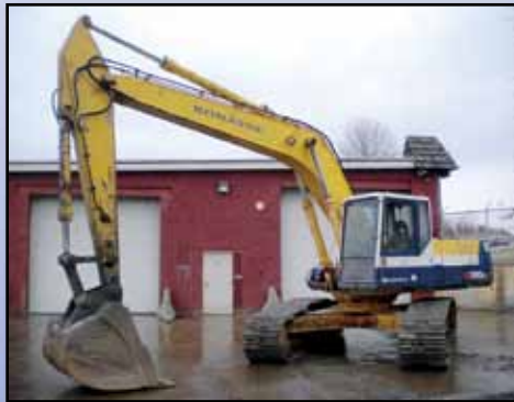
'90 KOMATSU PC220LC-5L