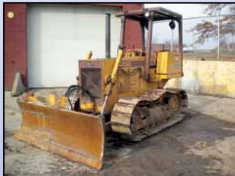
'86 CASE 450C

1986 CASE Model 450C Crawler Tractor , s/n 3078336, powered by Case diesel engine and powershift transmission, equipped with 6-way blade, ROPS canopy, and 16" SBG pads. In fair to good condition with fair undercarriage.