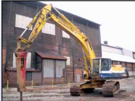
'90 KOMATSU PC300LC-5L (HAMMER SOLD SEPARATELY)