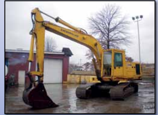
'85 CAT 225LC