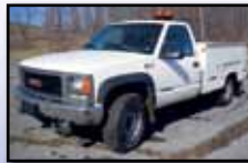
'97 GMC 3500SL 4X4

1997 GMC Model 3500SL, 4x4 Utility Truck , powered by Vortec 5.7L gas engine and automatic transmission, equipped with Knapheide 8' utility body and 235/85R16 tires. In good condition with good tires.