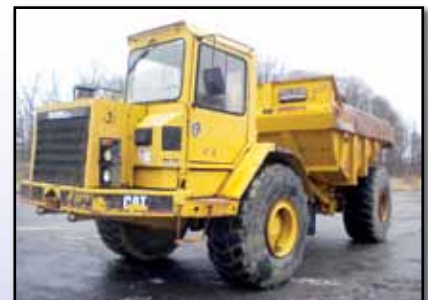
'88 CAT D30C, 30 TON

1988 CATERPILLAR Model D30C, 30 Ton 4x4 Articulated End Dump , s/n 7ZC000229, powered by Cat 3306, 257HP diesel engine and powershift transmission, equipped with lined bed and 29.5R25 tires. In good condition with good tires. (Less Than 1,000 Hours on Rebuild Engine With New Long Block; Rebuilt Hydraulic Pump and Injector Pump – Performed At Cat Dealer)