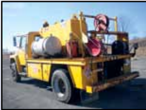
'88 INT'L 1900

1988 INTERNATIONAL Model 1900 Single Axle Lube Truck , powered by International diesel engine and automatic transmission, equipped with IMT model Lube 502, 12' lube body, 235 gallon fuel tank, 295 gallon fuel tank, (2) 105 gallon product tanks, double diaphragm pneumatic fuel pump, 2-stage hydraulic air compressor, Stanley 120/240 volt hydraulic generator, self-winding hose reels, under body storage boxes, and 11R22.5 tires. In good condition with good tires.