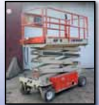
'93 JLG CM-2546

1993 JLG Model CM-2546 Self-Propelled Scissor Lift , s/n C003767 0200010112, powered by 24 volt electric and electric drive, equipped with 42"x96" platform, 6' extension, 750# capacity, 25' platform height, on-board charger, and solid tires. In good condition with good tires.