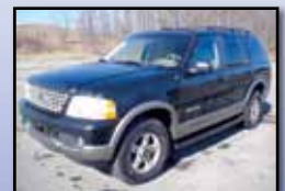
'02 FORD EXPLORER 4X4

2002 FORD Model Explorer Eddie Bauer Edition 4x4 Sport Utility Vehicle , powered by 4.0L gas engine and automatic transmission, equipped with leather interior, power package, air conditioning, cruise control, and 255/70R16 tires. In good condition with good tires.