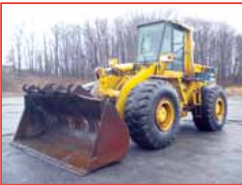
'87 KOMATSU WA420-1