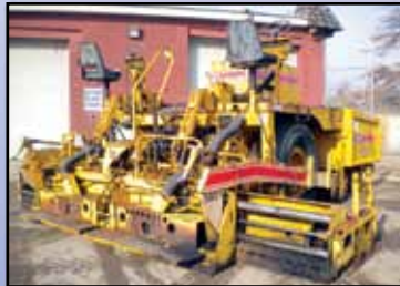
BLAW KNOX PF120H

CHAMPION Model 715 Motor Grader , s/n 715-14-45-10568, powered by Detroit 4-71 diesel engine and powershift transmission, equipped with 12' hydraulic moldboard, rear mounted ripper/scarifier with (6) scarifier shanks, enclosed ROPS cab, and 13.00-24 tires. In fair to good condition with good tires.