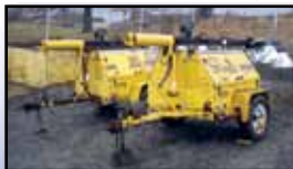
(2) 98 WACKER LT4

(2) 1998 WACKER LT4 Portable Light Plants , Kubota diesel engine, Marathon 6KW generator, (4) lights, and manual raise • PROTECT-O-FLASH Solar Powered Arrowboard • (2) INGERSOLL-RAND 175 CFM Portable Air Compressors , Deutz diesel (Not Running)