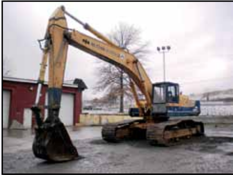
'88 KOMATSU PC400LC-3

1988 KOMATSU Model PC400LC-3 Hydraulic Excavator , s/n A12440, powered by Komatsu diesel engine and hydraulic drive, equipped with 10' dipper stick, 44" digging bucket, 18' crawlers, and 35.5" TBG pads. In fair condition with fair undercarriage. (Bad Hydraulic Pump Seals)