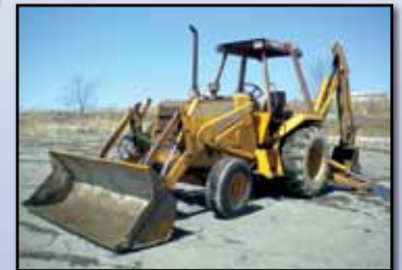
'87 CASE 580 SUPER E

1987 CASE Model 580 Super E Tractor Loader Backhoe , s/n 17045434, powered by Case diesel engine and shuttle transmission, equipped with general purpose loader bucket, 24" digging bucket, ROPS canopy, and 11L-16 front and 17.5L-24 rear tires. In fair condition with fair to poor tires.