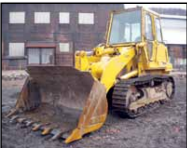
'85 CAT 953

1985 CATERPILLAR Model 953 Crawler Loader , s/n 77Y01331, powered by Cat 3204 diesel engine and hydrostatic transmission, equipped with general purpose loader bucket with teeth, enclosed ROPS cab, and 15" DBG pads. In good condition with fair undercarriage. (Less Than 4,500 Hours on extensive Rebuild Performed at Cat Dealer – Contact Auction Company For Specifics)