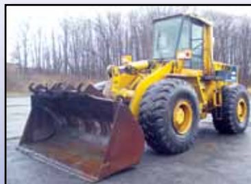
'87 KOMATSU WA420-1

1985 CATERPILLAR Model 953 Crawler Loader , s/n 77Y01331, powered by Cat 3204 diesel engine and hydrostatic transmission, equipped with general purpose loader bucket with teeth, enclosed ROPS cab, and 15" DBG pads. In good condition with fair undercarriage. (Less Than 4,500 Hours on extensive Rebuild Performed at Cat Dealer – Contact Auction Company For Specifics)