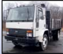
'93 FORD CARGO 7000

1980 INTERNATIONAL Model 1754 Single Axle Flatbed Truck , powered by International diesel engine and 5 speed transmission with 2 speed rear, equipped with 10' wood flatbed, 33" weld-on sides, and 9.00x20 tires. In fair condition with fair tires.