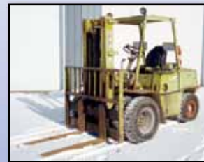
CLARK C500YS80, 5,000#

1994 CASE Model 586E, 4x4 6,000# Rough Terrain Forklift , s/n JJG0213540, powered by Case diesel engine and shuttle transmission, equipped with 21' 3-stage mast, side shift, 48" forks, ROPS canopy, and 19.5L-24 front and 12-16.5 rear tires. In good condition with fair tires.