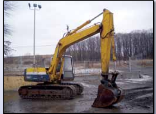
'90 KOMATSU PC150LC-5