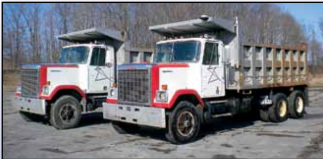
(2) 85 GMC GENERAL DUMPS

1985 GMC Model General Tandem Axle Dump Truck , powered by Detroit 6V-92 diesel engine and 8LL, 10 speed transmission, equipped with 16' steel dump body, 2-way gate, cab protector, Jacobs 2-stage engine brake, 46,000# rears, 18,000# front axle, and 11R22.5 tires. In good condition with fair to poor tires. (Less than 10,000 Miles on In-Frame Engine Rebuild - Performed At Penn Diesel)