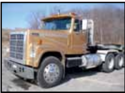
'84 INT'L F4370

1984 INTERNATIONAL Model F4370 Tandem Axle Truck Tractor , powered by Cummins NTC400 diesel engine and Fuller 15 speed transmission, equipped with 3-stage engine brake, wetline, air slide 5th wheel, Pro Tech aluminum headache rack, aluminum front wheels, heated mirrors, power passenger window, air conditioning, spring suspension, 186" wheelbase, and 11R24.5 tires. In good condition with good to very good tires.