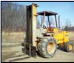
94 CASE 586E, 6,000#

CLARK Model C500YS80, 5,000# Rough Terrain Forklift , s/n Y685-12-4845, powered by 6 cylinder gas engine and shuttle transmission, equipped with 2-stage mast, 48" forks, FOPS canopy, 7.50x15 front and 7.00x12 rear tires. In good condition with good tires.