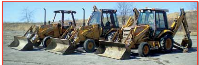
(3) OF (5) TRACTOR LOADER BACKHOES