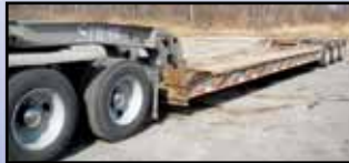
'93 INTERSTATE 50 TON

1985 GENERAL/EAGER BEAVER 35 Ton Tandem Axle Lowboy Trailer , equipped with hydraulic detachable ground bearing gooseneck, 19'9"x96" level deck, 2' transition, 8' over tandems (including 3' beavertail), chain dogs, outriggers, and 255/70R22.5 tires. In fair condition with fair tires.