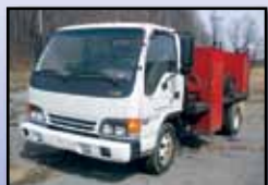
'00 ISUZU NPR

tires. In good condition with good tires. 2000 ISUZU Model NPR Cab Over Single Axle Welder Truck , powered by Isuzu turbo diesel engine and automatic transmission, equipped with 12' steel flatbed, Lincoln model G8000 welder/generator, Onan 16HP gas engine, Wilton vise, material boxes, air conditioning, and 215/85R16 tires. In good condition with good tires.