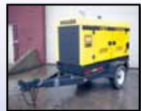
'01 KOHLER 55KW

1999 WACKER Model G50, 41KW Portable Generator , s/n 5027101, powered by John Deere diesel engine, equipped with 51 KVA, 208/480 volt, 142/62 amp, 3-phase, with (3) 50 amp and (2) 20 amp breakers, mounted on single axle trailer, with 225/75R15 tires.