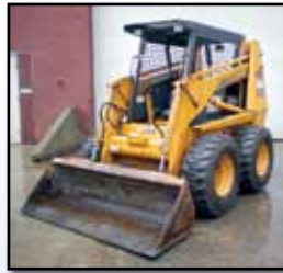
01 CASE 1845C

Case diesel engine and hydrostatic transmission, equipped with 62" loader bucket, auxiliary hydraulics, ROPS canopy, and 10-16.5 tires. In fair to good condition with poor tires.