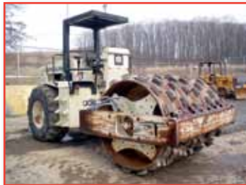
'88 IR SD-100F