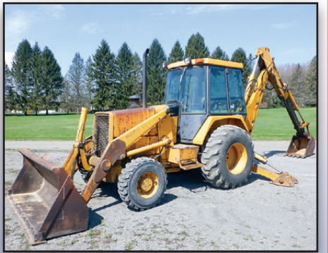
90 JD 410C 4X4

s/n T0410CG770348, powered by JD 4 cylinder diesel engine and shuttle transmission, equipped with general purpose loader bucket with bolt-on cutting edge, 24" digging bucket, rear auxiliary hydraulics, enclosed ROPS cab with heat, 12x16.5 front and 21Lx24 rear tires. In good