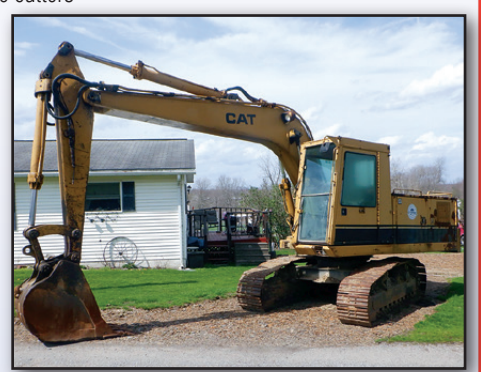
`89 CAT 215C LC

s/n 4HG02336, powered by Cat 3304 diesel engine and hydraulic drive, equipped with 7' dipper stick, 28" digging bucket, auxiliary hydraulics, enclosed ROPS cab with heat, and 19.5" TBG pads. In fair to good condition with fair undercarriage. (Hammer Sold Separately)