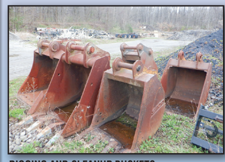
DIGGING AND CLEANUP BUCKETS