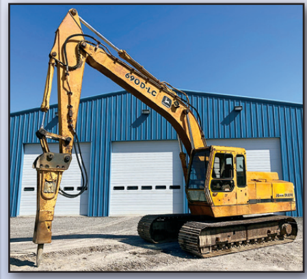
87 JD 690D LC (HAMMER SOLD SEPARATELY)

CAT 215C LC Attachments: ALLIED 750 Hydraulic Demolition Hammer. In good condition • CAT 54" Diaging Bucket