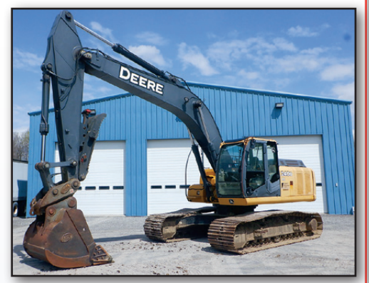
06 JD 240D LC

s/n FF240DX605145, powered by JD 6 cylinder diesel engine and hydraulic drive, equipped with 10' dipper stick, Geith 48" digging bucket with side cutters, hydraulic coupler, WB 24" mechanical thumb, enclosed ROPS cab with heat and air conditioning, and 31.5"