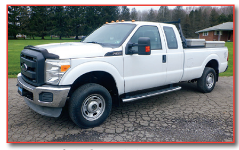
`12 FORD F-350 XL 4X4

PRE-SORTED FIRST CLASS MAIL US POSTAGE PAID