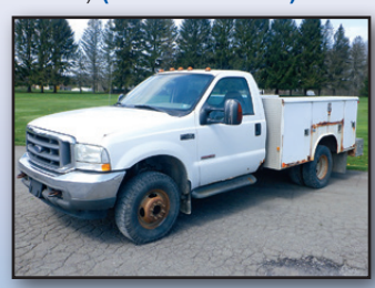
04 FORD F-350 XLT 4X4