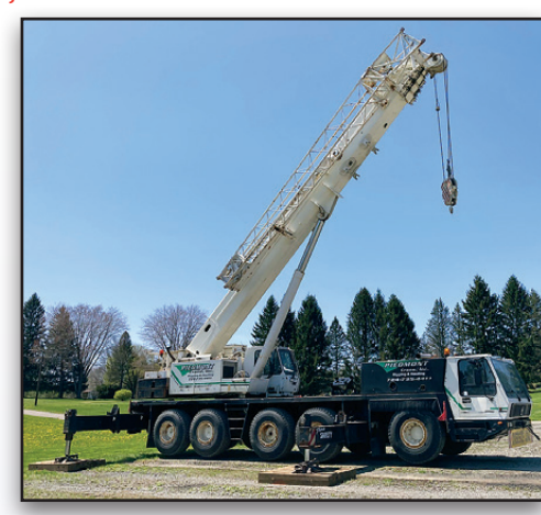
94 KRUPP KMK5120, 150 TON

1994 KRUPP Model KMK5120, 150 Ton Hydraulic All Terrain Crane. s/n 51208103. powered by Mercedes 6 cylinder diesel engine upper and Mercedes V8 diesel engine lower and Allison automatic transmission, equipped with 43.5' to 165.7' 4-section hydraulic boom, 32.8' to 52.5' swing away bifold lattice jib with (1) insert to 78.7', main and auxiliary hoists, hydra pneumatic suspension,