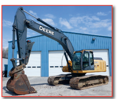
`06 JD 240D LC