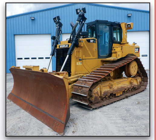
14 CAT D6T XW

s/n RCW01490, powered by Cat C-9 diesel engine and powershift transmission, equipped with 6-way straight blade, drawbar, differential steering. wired for GPS, System 1 undercarriage, enclosed ROPS cab with heat and air conditioning, and 28" SBG pads. In good to very