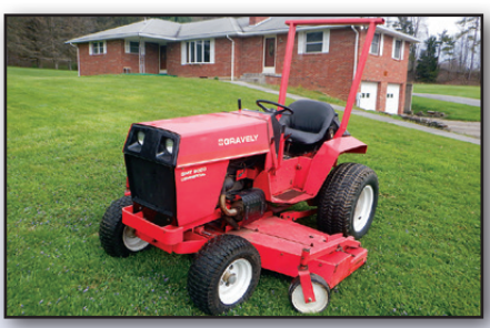
GRAVELY GMT 9000

1980 GRAVELY Model GMT 9000 Commercial Mower, s/n 00520052, powered by Continental 4 cylinder gas engine and shuttle transmission, equipped with 72" hydraulic mower deck, towbar, 20x8.00-10 front and 29x12.00-15 rear tires. In good condition with good tires. (0,082 Hours)