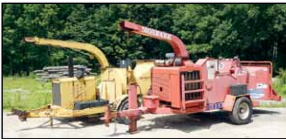
05 MORBARK 2400XL AND 99 GRAVELY PRO CHIP

2005 MORBARK 2400XL Hurricane, 18" Portable Drum Chipper, s/n 4S8SZ191X5W050905, Cat diesel engine, auto feed, 360° chute, hydraulic trailer jack, work lights, electric brakes, and 235/75R17.5 tires. In good condition with good tires. (692 Hours)