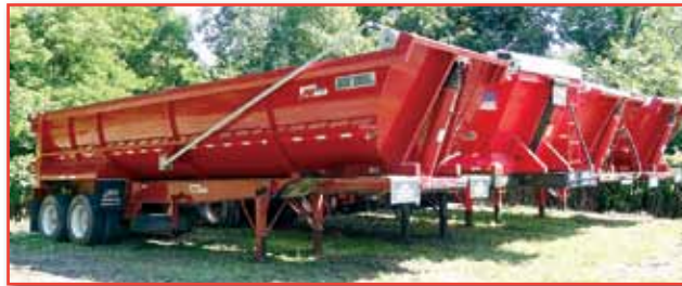
JMH AND TRAILSTAR 32'