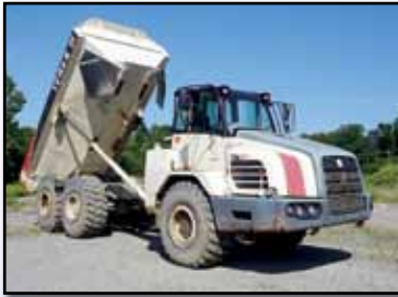
'05 TEREX TA27, 27 TON

2003 TEREX TA27 Generation 7, 27 Ton 6x6 End Dump , s/n A8501074, Cummins diesel engine and ZF semi-automatic trans., retarder, A/C, and 23.5R25 tires. In good condition with good tires. (4,285 Hours)