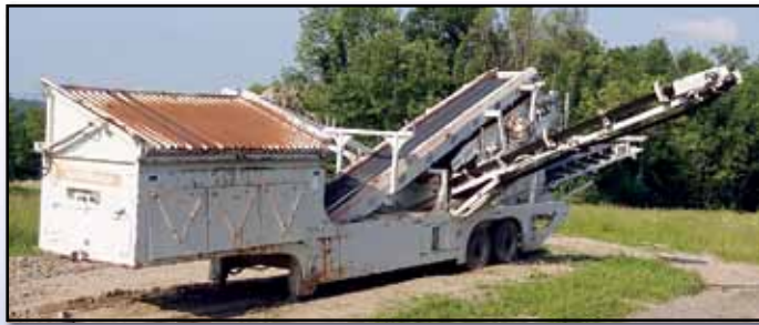
01 NORDBERG SW351

2006 POWERSCREEN MX85, 30"x60' Folding Radial Stacking Conveyor, s/n 6103222, Cummins B3.3, 85HP diesel engine, hydraulic raise and lower, 5th wheel, pintle tow, and 10R17.5 tires. In very good condition with very good tires. (296 Hours)