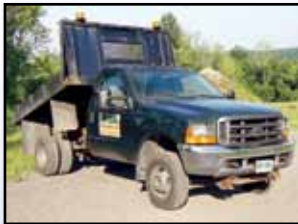
'01 FORD F-350XL

2001 FORD F-350XL Super Duty Flatbed/Dump Body, Triton 5.4L, V-8 gas engine and automatic trans., Iroquois 9' flatbed/dump body, Fisher Minn Mount 9' snow plow, dual rear wheels, tow package, and 235/85R16 tires. In good condition with very good tires. (079,384 Miles) (Wired For Fisher Spreader) (Recently Installed New Electric Motor & Valves For Dump Hoist and OEM Transfer Case)