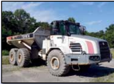
'03 TEREX TA27, 27 TON

2003 TEREX TA27 Generation 7, 27 Ton 6x6 End Dump , s/n A8501074, Cummins diesel engine and ZF semi-automatic trans., retarder, A/C, and 23.5R25 tires. In good condition with good tires. (4,285 Hours)