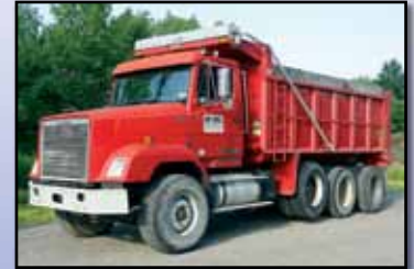
'87 FREIGHTLINER FL112

2005 MACK Granite CV713 Tri-Axle Dump Truck, Mack AI-400, 400HP diesel engine and Maxitorque T310M/MLR, 10 speed trans. with multi-speed rear, Ox 16" steel dump body, electric tarp, 44,000# rears, 18,000# front axle, 18,000# airlift 3rd axle, 2-position engine brake, tow package with air, A/C, cruise control, 385/65R22.5 front, and 11R22.5 rear tires. In very good condition with good to very good tires. (43,114 Miles) (2,159 Hours)