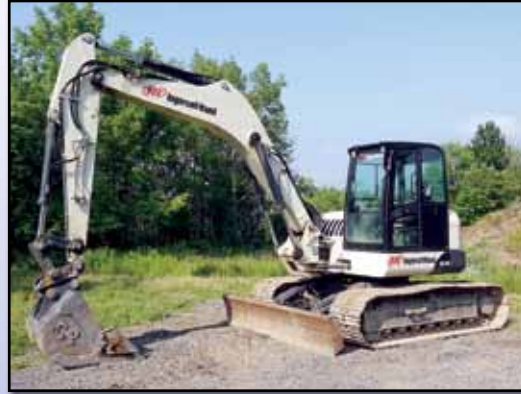
'05 INGERSOLL-RAND ZX-125

2005 INGERSOLL-RAND ZX-125 Midi Hydraulic Excavator , s/n 120542A97, Deutz liquid cooled diesel engine and hydraulic drive, 7'9" dipper stick, swing boom, zero tail swing, 24" digging bucket, Geith hydraulic quick coupler, 8'6" backfill blade, enclosed cab with heat and A/C, 10'11" crawlers, and 24" TBG pads. In very good condition with very good undercarriage. (437 Hours) (Purchased Used With Less Than 100 Hours)