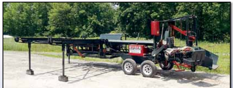
07 BUILT-RITE 30SCP