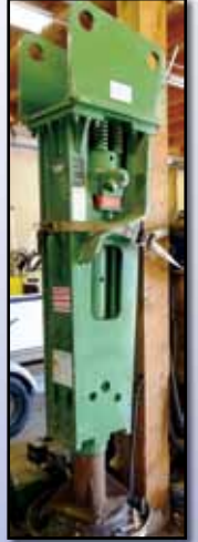
'09 ROCKRAM 778RTK (UNUSED)

Ingersoll-Rand ZX-125 Attachments: UNUSED ATLAS COPCO HC920 Hydraulic Plate Compactor • UNUSED GEN-TEC Hydraulic Thumb Attachment • CP 50" Digging Bucket . In good condition.