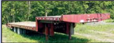
'04 TOWMASTER 25 TON HYDRAULIC TAIL

2004 TOWMASTER T-50RGHT, 25 Ton Tandem Axle Hydraulic Tail Trailer, 8'6"x10' upper deck, 20' fixed deck, 8'4" folding deck, 48" tail, heavy duty pull-out ramps, Ramsey 800, 25,000# hydraulic winch, spring suspension, chain dogs, under deck tool box, 68,380# GVWR, and 215/75R17.5 tires. In good condition with good tires.