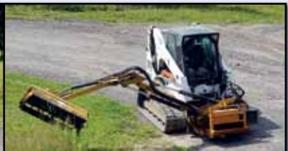
03 BOBCAT T300 (FLAIL MOWER SOLD SEPARATELY)