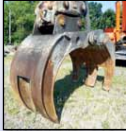
GEITH HEAVY DUTY 5-TINE

2006 HITACHI ZX330LC Hydraulic Excavator , s/n 35528, Isuzu diesel engine and hydraulic drive, 10'6" dipper stick, 60" digging bucket, JRB hydraulic quick coupler, enclosed cab with heat and A/C, 16'3" crawlers, and 31.5" TBG pads. In good to very good condition with good undercarriage. (2,087 Hours) (Purchased Used With Less Than 100 Hours)