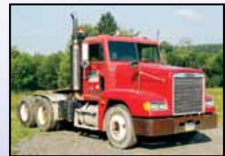
'99 FREIGHTLINER FL120

1992 (Glider) MACK RW700GK Superliner Tandem Axle Truck Tractor , Cummins NTC-300, 300HP diesel engine and Fuller 13 speed trans., 44,000# rears, 14,000# front axle, Jacobs 2-stage engine brake, 2-line wetline with dump valve, Mack camelback suspension, 206" wheelbase, stationary 5th wheel, tarp controls, Protech headache rack with work lights, aluminum front wheels, and 11R24.5 tires. In good condition with good to very good tires. (132,716 Miles) (Recently Installed New Steer Tires, Front Shocks & Batteries)