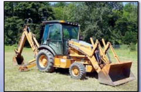
'03 CASE 580 SUPER M 4X4 EXTEND-A-HOE

2003 CASE 580 Super M, 4x4 Tractor Loader Extend-A-Hoe , s/n JJG0374419, diesel engine and shuttle trans., general purpose loader bucket with bolt-on cutting edge, 24" digging bucket, rear hi/low auxiliary hydraulics, front auxiliary hydraulics, ride control, controls and plumbed for hydraulic 4-in-1 loader bucket, enclosed ROPS cab with heat, and 12-16.5 front and 19.5L-24 rear tires. In good condition with good tires. (01,358 Hours) (Purchased New)