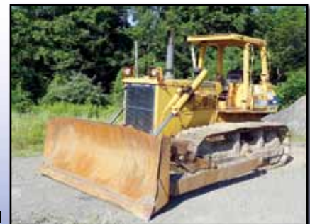
'89 KOMATSU D68E-1