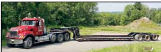
'03 MACK GRANITE CV713 AND '05 TALBERT 55 TON (OFFERED SEPARATELY AND AS ENTIRETY)

2003 MACK Granite CV713 Tri-Axle Truck Tractor , Mack E7-460, 460HP diesel engine and Maxitorque ES18, 18 speed trans., 46,000# rears, 20,000# steerable airlift 3rd axle, 18,000# front axle, 2-line wetline with dump valve, 2-position engine brake, air ride suspension, 217" wheelbase, differential and inter-axle lock, tarp controls, aluminum headache rack, wheels and fuel tanks, full stainless steel fenders, work lights, full gauge package, heated and power mirrors, A/C, cruise control, power windows and door locks, and 385/65R22.5 front, 315/80R22.5 lift, and 11R24.5 rear tires. In good to very good condition with good tires. (152,524 Miles) (7,684 Hours) (Recently Installed New Intercooler & New Batteries) (Combo Tare Weight is 45,500#)