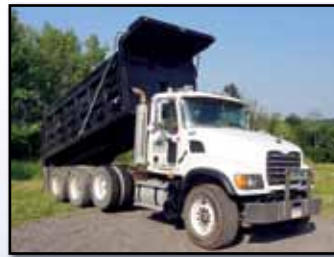
'05 MACK GRANITE CV713

1987 FREIGHTLINER FL112 Tri-Axle Dump Truck, Cat 3406B, 350HP diesel engine and Eaton Fuller 8LL, 10 speed trans., Bibeau 17'6" steel dump body, 2-way tailgate, Roll-Rite electric tarp, 44,000# rears, 18,000# front axle, 18,000# airlift 3rd axle, Jacobs 2-stage engine brake, tow package with air, 425/65R22.5 front and 11R24.5 tires. In good condition with good tires. (292,110 Miles) (Body Was Installed New In 2006)