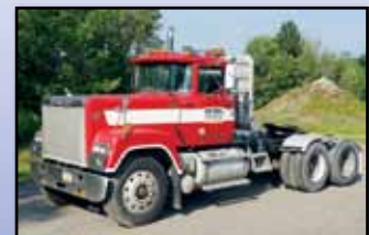
'92 MACK RW700K