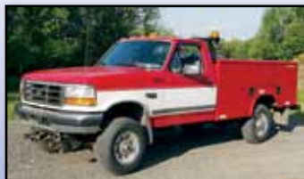
'96 FORD F-350XLT 4X4

1996 FORD F-350XLT, 4x4 Utility Truck, V-8 gas engine and automatic trans., Reading 9' utility body, Fisher 8'6" snow plow, cab protector, dual fuel tanks, tow package, A/C, cruise control, power windows and door locks, and 235/85R16 tires. In good condition with good tires. (67,923 Miles) (Installed Snow Plow Winter Of 2010/2011)