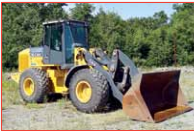
'06 JOHN DEERE 544J

WEDNESDAY, AUGUST 17, 2011 - 9:00AM Clarks Summit, Pennsylvania (Scranton Area)