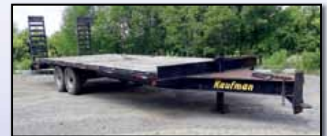
'04 KAUFMAN 7 TON

2004 KAUFMAN 7 Ton Tandem Axle Tag-A-Long Trailer, 8'x24' level deck, 5' beavertail, 5' ramps, frame mounted tool box, electric brakes, 14,000# GVWR, 3,500# empty weight, and 235/85R16 tires. In good condition with good tires. (Purchased New)