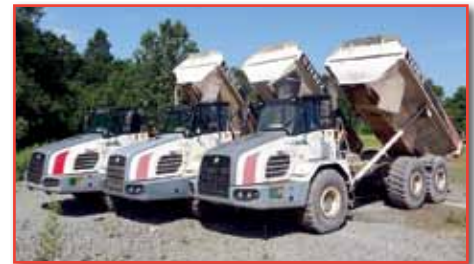
'05 AND '03 TEREX 27 TON