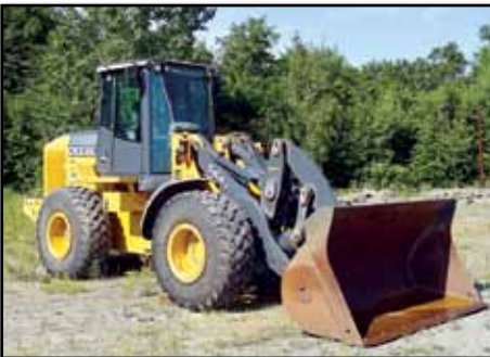
'06 JOHN DEERE 544J

Case 580 Super M Attachments: 1996 INDECO MES621 Hydraulic Demo Hammer. In good condition. • ALLIED Hydraulic Plate Compactor • 12" Digging Bucket. In good condition. • Used 12-16.5 Tire