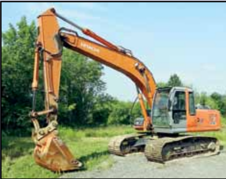
'04 HITACHI ZX200

2004 HITACHI ZX200 Hydraulic Excavator , s/n AUJ-007556, Isuzu diesel engine and hydraulic drive, 10' dipper stick, 48" digging bucket, JRB hydraulic quick coupler, 2-way hi/low auxiliary hydraulics, enclosed cab with heat and A/C, 13'8" crawlers, and 31.5" TBG pads. In good condition with good undercarriage. (2,958 Hours) (Purchased Used With Less Than 100 Hours)