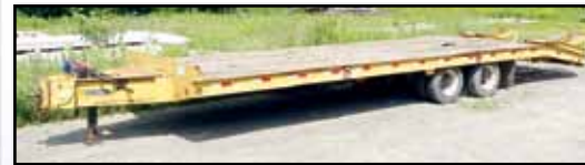
'01 KEIFER 15 TON

chain dogs, 30,000# GVWR, 7,800# empty weight, and 215/75R17.5 tires. In good condition with good tires. (Purchased New)