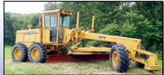
JOHN DEERE 770