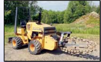
'96 CASE 360 4X4

1996 UPRIGHT LX41, 4x4 Scissor Lift , s/n 1167, Kubota WG750 dual fuel gas/LP gas engine and hydrostatic trans., 6'x12' platform with 3' extension and 10-16.5 tires. In good condition with good tires.