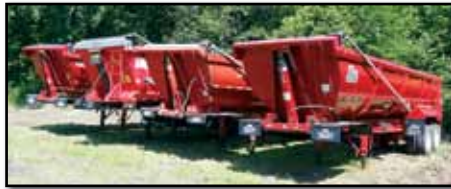
(2) '06 JMH, '05 TRAILSTAR, AND '98 JMH 32'

2006 JMH M3260DDABH, 32' Tandem Axle Half Round Steel Dump Trailer, 2-way air operated tailgate with coal chute, Hardox AR450 3/8" steel tub, Roll-Rite electric tarp, air ride suspension, 70,000# GVWR, steel Budd wheel (outside hub piloted), front and rear access ladders, fenders, spare tire, and 11R24.5 tires. In very good condition with very good tires. (Purchased New) (Current PA Inspection)