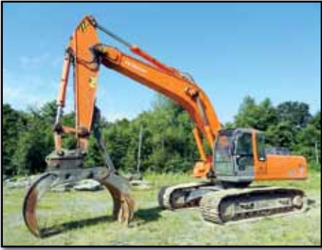
'06 HITACHI ZX330LC (GRAPPLE SOLD SEPARATELY)

Hitachi ZX330LC Attachments: GEITH 5-Tine Heavy Duty Grapple • CF 30" Digging Bucket