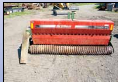
BRILLION GRAIN DRILL

BOBCAT B950 Demo Hammer • BOBCAT 72" Hydraulic Sweeper Attachment • BOBCAT 72" Sweeper • (3) Skid Steer Forks • HOWARD 60" Rototiller • 10' Landscape Drag • BRILLION SLP8, 8' Grain Drill , s/n 186458, 3-point hitch. In good to very good condition • GRADEMASTER 7' Box Scraper , 3-point hitch, with rear float wheels