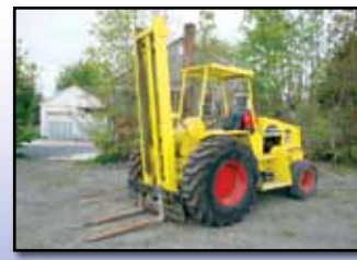
ALLIS CHALMERS 700D

ARROW 90CE60, 42"-139" 13,000#/3,000# Forklift Boom (NEW) • (2) WRIGHT Self-Dumping Hoppers