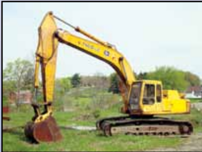
JOHN DEERE 790DLC

1990 JOHN DEERE Model 790DLC Hydraulic Excavator , s/n FF790DL008228, powered by John Deere diesel engine and hydraulic drive, equipped with 11'6" dipper stick, 46" digging bucket, 15'6" crawlers, and 32" TBG pads. In good condition with good undercarriage. (Weak Hydraulic Pump)