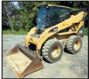
'05 CAT 262B

MELROE/INGERSOLL-RAND Model Sweeper 60 Hydraulic Broom • MELROE/INGERSOLL-RAND Model LR5B Rock Hound • BOBCAT 84" Hydraulic Angle Broom • JOHN DEERE 48" Fork Attachment • GROUSER 84" 6-Way Blade • 3-Point Hitch Mounting Plate, with Gill model 20A200, 72" pulverizer • 7" Lifting Boom • Receiver Hitch Mounting Plate • (6) 12-16.5 Tires and (5) Rims • 15" Steel Tracks