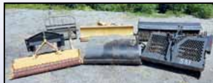
SKID STEER ATTACHMENTS

CLARK Model C500YS80, 8,000# Pneumatic Tired Forklift , s/n Y6851043051, powered by 6 cylinder propane engine and shuttle transmission, equipped with 2-stage mast, 60" forks, ROPS canopy, 3.25-15 front and 7.00-12 rear tires. In good condition with very good tires.