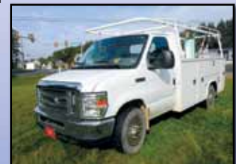
'08 FORD E-350 SUPER DUTY