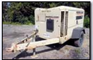
'98 IR 375CFM

1998 INGER-SOLL-RAND Model P375WCU, 375CFM Portable