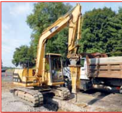
'95 CAT 307

WEDNESDAY, OCTOBER 5, 2011 - 9:00AM Ellwood City, Pennsylvania (New Castle/Butler Area)