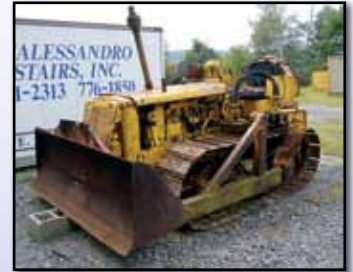
'54 CAT D2

1954 CATERPILLAR Model D2 Crawler Tractor , s/n 05U14694 Restored, powered by Cat 4 cylinder diesel engine and 2 cylinder gas Pony motor and 5 speed transmission, equipped with hydraulic angle blade, auxiliary hydraulics to rear, drawbar, and 16" SBG pads. In good condition with good undercarriage.