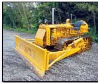
'54 CAT D2

1954 CATERPILLAR Model D2 Crawler Tractor , s/n 05U14102, powered by Cat 4 cylinder diesel engine with 2 cylinder gas Pony motor and 5 speed transmission, equipped with straight blade, Hyster D2N winch, s/n KRN83280, and 16" SBG pads. In fair condition with fair undercarriage. (Complete Parts Machine-Not Running)