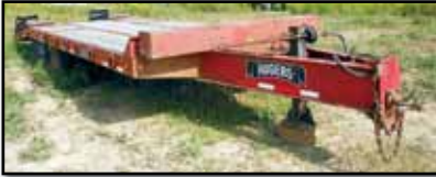
'02 ROGERS 20 TON

2002 ROGERS Model TAG20-25/102/2XS, 20 Ton Tandem Axle Tag-A-Long Trailer , equipped with 19'x102" deck with 6' beavertail, 6' ramps, air brakes, chain dogs, and 215/75/15 tires. In good condition with good tires.