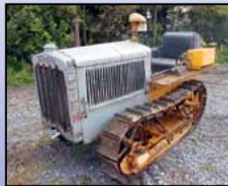
'29 CAT 10

1929 CATERPILLAR Model 10 Crawler Tractor , s/n PT1880, powered by 4 cylinder gas engine and 3 speed manual transmission, equipped with auxiliary hydraulics in rear, drawbar, and 8" SBG pads. In good condition with good undercarriage. (Serial Number Owner Supplied)