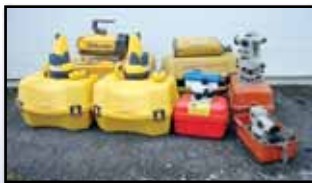
PIPELINE SURVEY EQUIPMENT

DITCH WITCH Hydraulic Horizontal Boring Machine, gas powered hydraulic power unit, 70' of 4" auger • REX 464530, 400PSI Portable Pneumatic Test Pump, Honda 5.5HP gas • Pneumatic Test Pump, Briggs & Stratton 5HP gas • MUELLER B100 Tap Machine • CHARLES MACHINE WORKS PP Hydraulic Pipe Pusher/Puller, s/n 190906 • TOPCON TPL3A Pipe Laser • SPECTRA PHYSICS Dialgrade Pipe Laser • (2) ROBOTOOLZ RT7210-1 Rotating Laser Levels • LEITZ BT20 Level Transit • GEOTOP G-24C Automatic Level • LASER ALIGNMENT Variable Speed, 12 Volt Electric Blower • HERCO 9HP Gas Powered Manhole Blower • HOMELITE 3HP Gas Powered Manhole Blower • MOFFATT Ultrasonic Leak Detector • Pipe Mandrills • Test Balls