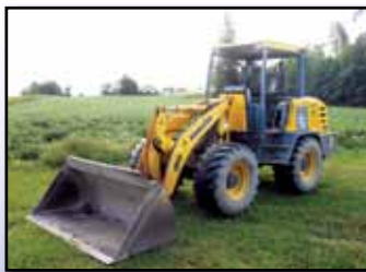
'05 KOMATSU WA75-3H

purpose loader bucket with bolt-on cutting edge, enclosed cab with air conditioning and 335/80R20 tires. (Parts Only) 60" Fork Attachment • 48" Fork Attachment