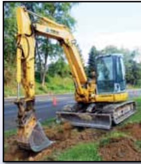
'05 KOMATSU PC78MR-6

2005 KOMATSU Model PC78MR-6 Mini Excavator , s/n KMTPC029A01001956, powered by Komatsu 4 cylinder diesel engine and hydraulic drive, equipped with 7'4" dipper stick with EM quick attachment, hydraulic plumbing, 24" digging bucket, zero tail swing, 91" push blade, enclosed cab with heat and air conditioning, and 18" bolt-on rubber pads, and 9'6" crawlers. In good condition with good to very good undercarriage. (02,325 Original Hours) (Purchased From Rental Fleet With Low Hours)