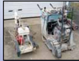
TARGET AND PECO WALK BEHIND SAWS

TARGET Econoline II Walk Behind Concrete Saw , s/n 335840, powered by Honda 20HP gas engine, equipped with 24" blade capacity. In good condition.