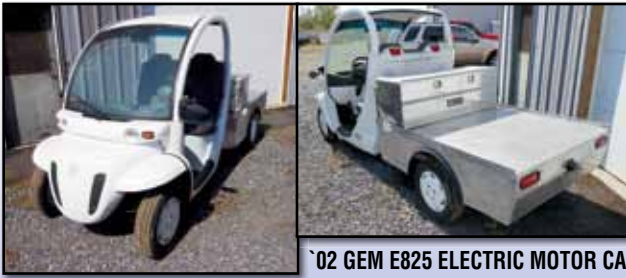
'02 GEM E825 ELECTRIC MOTOR CAR

2002 GEM Model E825 Electric Motor Car , powered by DC electric motor and hydrostatic transmission, equipped with 6'x4' diamond plate flatbed, diamond plate cross box, and 165/70R12 tires. In very good condition with very good tires.