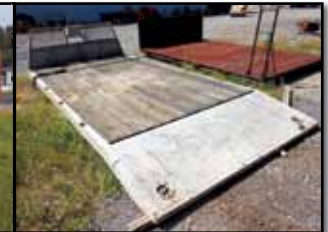
WACK HOOK LIFT BODIES (SOLD SEPARATELY)

1995 CHEVROLET Model Kodiak Single Axle Hook-Lift Truck , powered by Cat 3116 diesel engine and 5 speed manual transmission with 2 speed rear, equipped Swap Industries model 125 hook lift system, auxiliary hydraulic outlets, tow package with air and electric, and 11R22.5 tires. In good condition with fair to good tires.