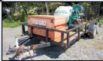
'01 TOP BRAND 7,000# (SPRAYER SOLD SEPARATELY)

2007 APPALACHIAN 5 Ton Tandem Axle Tag-A-Long Trailer , equipped with 17' level deck, 4' beavertail, stake pockets, and 225/75D15 tires. In good condition with good tires.