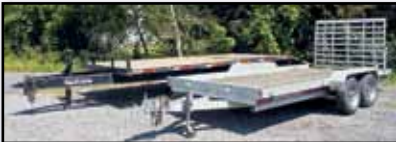
'07 APPALACHIAN 5 TON AND '00 TRITON 7,000#

2002 ROGERS Model TAG20-25/102/2XS, 20 Ton Tandem Axle Tag-A-Long Trailer , equipped with 19'x102" deck with 6' beavertail, 6' ramps, air brakes, chain dogs, and 215/75/15 tires. In good condition with good tires.