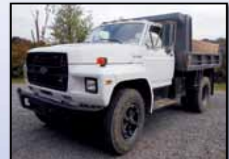
'88 FORD F-700

2008 FORD Model E-350 Super Duty Utility Truck , powered by 5.4L gas engine and automatic transmission, equipped with Knapheide 10'9" open utility body with material rack, cruise control, air conditioning, and 245/75R16 tires. In good condition with good tires. (10,650 Original Miles) (Purchased New)