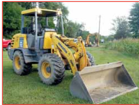
'05 KOMATSU WA75-3H