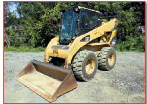
'05 CAT 262B