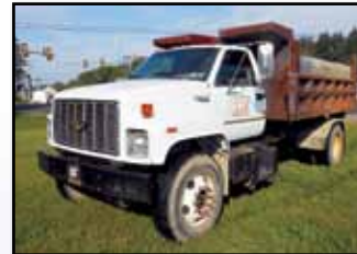
'95 CHEVY KODIAK HOOK LIFT (DUMP BODY SOLD SEPARATELY)