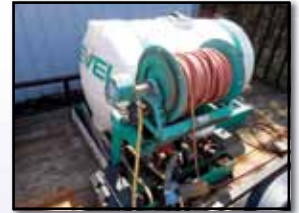
LESCO 300 GALLON

2-Man Post Hole Digger , powered by Tecumseh 1 cylinder gas engine, equipped with stand and 6" and 8" augers.