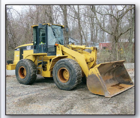
04 CAT 938G SERIES II

2004 CATERPILLAR Model 938G Series II Rubber Tired Loader, s/n CRD01251, powered by Cat diesel engine and powershift transmission, equipped with general purpose loader bucket with bolt-on cutting edge, Cat hydraulic coupler, front auxiliary hydraulics, enclosed ROPS cab with air conditioning, and 20.5R25 tires. In good condition with good tires. (Meter Reads 11.467 Hours)