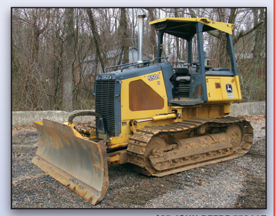
05 JOHN DEERE 550J LT

s/n 114400, powered by JD diesel engine and hydrostatic transmission, equipped with 6-way blade, ROPS canopy with heat, and 18" SBG pads. In good condition with good undercarriage. (Meter Reads 8,826 Hours)