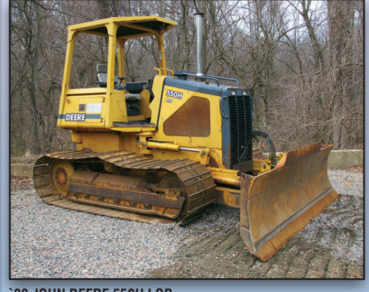
99 JOHN DEERE 550H LGP