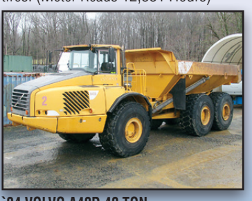
04 VOLVO A40D 40 TON

2004 VOLVO Model A40D. 40 Ton, 6x6 End Dump, s/n A40DV11077, powered by Volvo diesel engine and powershift transmission, equipped with retarder, supplemental steering, tailgate, bedliners, enclosed ROPS cab with air conditioning, heated operator seat, and 29.5R25 tires. In good condition with fair to good tires. (Meter Reads 12,331 Hours)