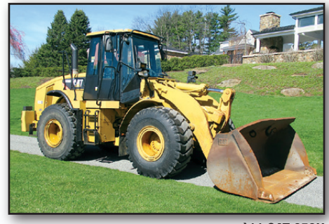
11 CAT 950H

K5K03263, powered by Cat C7 Acert diesel engine and powershift transmission, equipped with general purpose loader bucket with bolt-on cutting edge, Cat hydraulic coupler, 3rd valve with front auxiliary hydraulics, Cat integrated