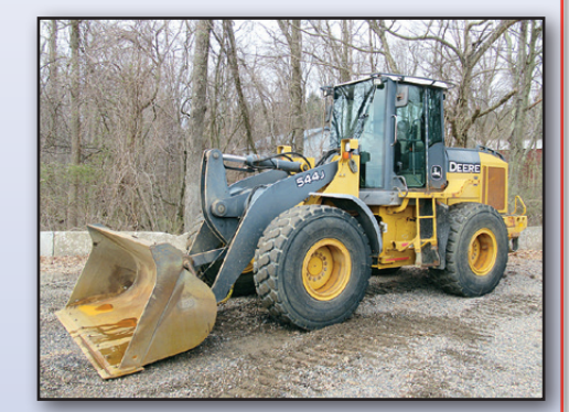
`05 JOHN DEERE 544J

s/n 596233, powered by JD diesel engine and powershift transmission, equipped with general purpose loader bucket, JRB hydraulic coupler, front auxiliary hydraulics, ride control, enclosed ROPS cab with air conditioning, and 20.5R25 tires. In good