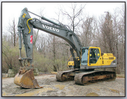
05 VOLVO EC330BLC