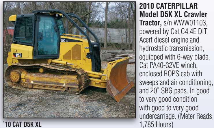
10 CAT D5K XL