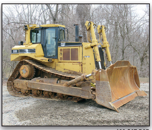
98 CAT D8R

1998 CATERPILLAR Model D8R Crawler Tractor, s/n 7XM2714. powered by Cat 3406 diesel engine and powershift transmission, equipped with semi-U blade with tilt, 3rd valve, plumbed for ripper, differential steer, and enclosed ROPS cab with air conditioning. In good condition with fair undercarriage. (Meter Reads 10,447 Hours)