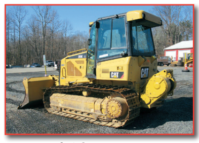
`10 CAT D5K XL (1,785 HOURS)