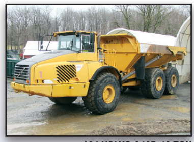
04 VOLVO A40D 40 TON

2004 VOLVO Model A40D, 40 Ton, 6x6 End Dump, s/n A40DV11115, powered by Volvo diesel engine and powershift transmission, equipped with retarder, supplemental steering, tailgate, bed liners, enclosed ROPS cab with air conditioning, heated operator seat, and 29.5R25 tires. In good condition with good tires. (Meter Reads 12,181 Hours) (Odometer Reads 25.193 Miles)