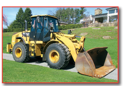
`11 CAT 950H (4,153 HOURS)