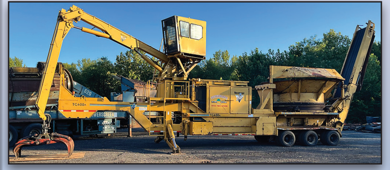
`98 VERMEER TG400A-AL

2000 MORBARK Model 1500 Portable Tub Grinder, s/n 575-049, powered by Cat 3508DITA, 1,000HP diesel engine, equipped with 39.5" rear discharge conveyor, wireless remote, diesel powered preheater, removable safety roof, mounted on tri-axle carrier with (2) hydraulic stabilizers, spring suspension, and 255/70R22.5 tires. In good condition. (Rebuilt Engine With New OEM Crank Shaft, Pistons, Rods, and Heads, New Clutch, Rebuilt Gear Box and New Drive Shaft – Less Than 1,000 Hours)