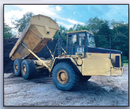
95 CAT D250E, 25 TON