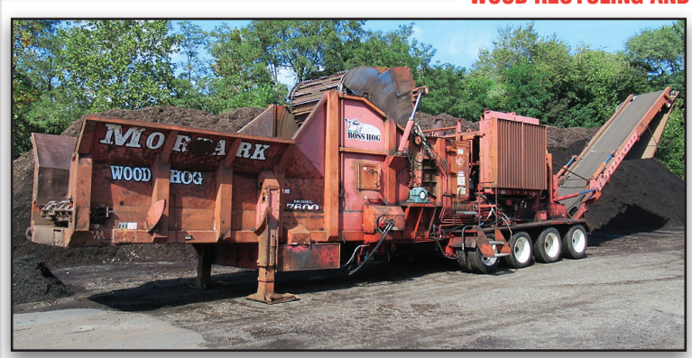
`02 MORBARK 7600 WOOD HOG

2002 MORBARK Model 7600 Wood Hog Portable Horizontal Grinder, s/n 185-1041, powered by Cat 3412E, 1,000HP diesel engine, equipped with 5-chain feed conveyor, 54" width drum, 44" hydraulic folding discharge conveyor, wireless remote, mounted on quad axle carrier with air ride suspension and (2) hydraulic stabilizers, and 255/70R22.5 tires. In good condition with good tires. (Mill Replaced Approximately 2,000 Hours Ago; (4) Hydraulic Cylinders Repacked and (2) New Cylinders; (5) New Feed Chains within 500 Hours; New Conveyor Motor – Zero Hours)