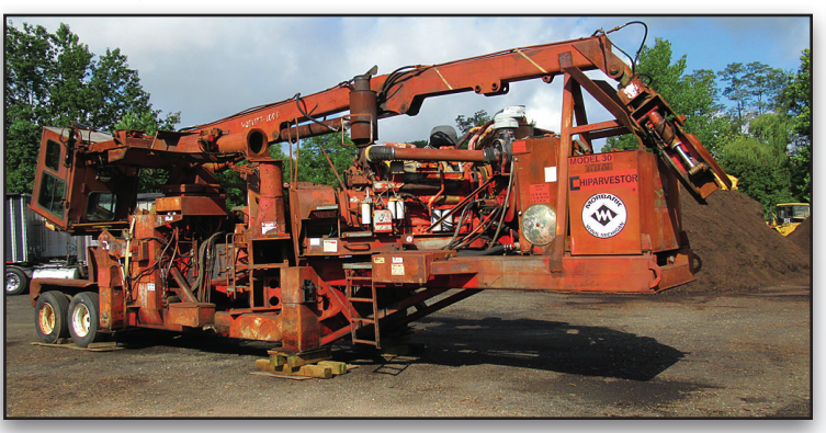
`96 MORBARK 30 TOTAL CHIPARVESTER

1998 VERMEER Model TG400A/AL, 10' Portable Tub Grinder, s/n 1VRN462T6W1000477, powered by Cat 3406, 400HP diesel engine, equipped with log loader with rotating grapple and operators cab, 30" rear folding discharge conveyor, mounted on tri-axle trailer with (2) hydraulic outriggers and 215/75R17.5 tires. In good condition. (05,946 Original Hours) (Engine Rebuild 2017 – Less Than 200 Hours) (Purchased New March 2003)