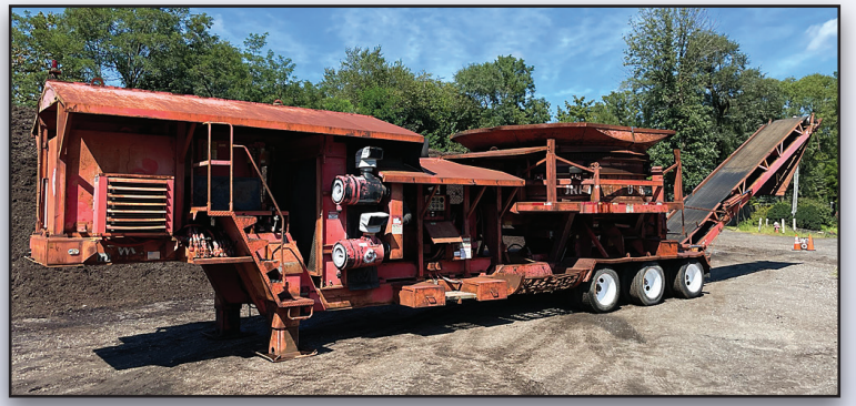
`00 MORBARK 1500

2002 MORBARK Model 7600 Wood Hog Portable Horizontal Grinder, s/n 185-1041, powered by Cat 3412E, 1,000HP diesel engine, equipped with 5-chain feed conveyor, 54" width drum, 44" hydraulic folding discharge conveyor, wireless remote, mounted on quad axle carrier with air ride suspension and (2) hydraulic stabilizers, and 255/70R22.5 tires. In good condition with good tires. (Mill Replaced Approximately 2,000 Hours Ago; (4) Hydraulic Cylinders Repacked and (2) New Cylinders; (5) New Feed Chains within 500 Hours; New Conveyor Motor – Zero Hours)