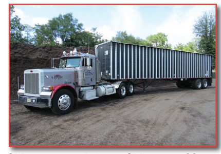
`06 PETERBILT 379 AND `03 PEERLESS 45'

PRE-SORTED FIRST CLASS MAIL US POSTAGE PAID