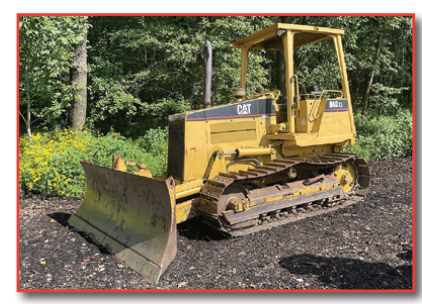
98 CAT D4C XL