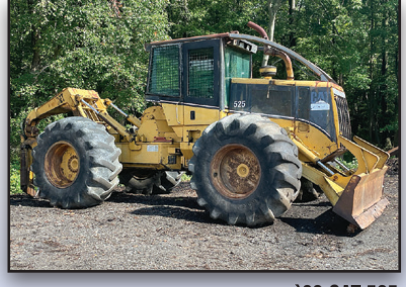
99 CAI 525

1999 CATERPILLAR Model 525 Grapple Skidder, s/n 1DN01725, powered by Cat 3304 diesel engine and powershift transmission, equipped with single arch grapple boom, Esco rotating grapple, hydraulic winch, 8'1" stacking blade, enclosed ROPS cab with sweeps, side screens, and air conditioning. In fair to good condition with fair tires.