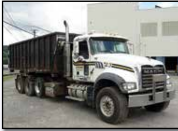
'07 MACK CTP713

Granite Tri-Axle Roll-Off Truck , powered by Mack MP7, 370HP diesel engine and Maxitorque T310, 10 speed transmission, equipped with 2008 Wastequip model O/R, 75,000# 22' roll-off body, s/n 95060, electric tarp, 44,000# rears and 18,000# front axle, camelback suspension, 2-stage engine brake, air lift 3rd axle, aluminum front wheels, air conditioning, cruise control, 62,000# GVWR, 385/65R22.5 front, 255/70R22.5 lift, and 11R22.5 rear tires. In good condition with good tires.