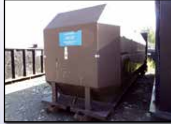
40 CUBIC YARD COMPACTOR