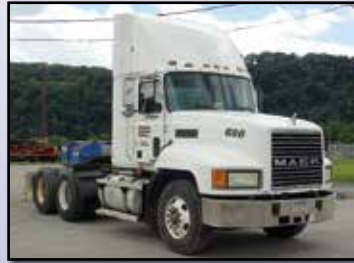
'00 MACK CH613

#738 2000 VOLVO Model WNL64T610 Tandem Axle Sleeper Truck Tractor, powered by Detroit Series 60, 430HP-500HP diesel engine and Eaton Fuller 10 speed transmission, equipped with 38,000# rears and 12,349# front axle, integral 48" walk-in sleeper, air ride suspension, 2-stage engine brake, air slide 5th wheel, aluminum wheels, power passenger window and locks, air conditioning, cruise control, 216" wheelbase, 50,349# GVWR, and 11R24.5 tires. In good condition with good tires. (No A/C Belt)