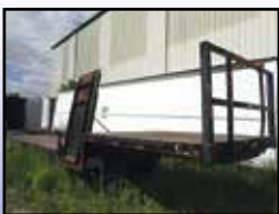
'96 FONTAINE 48'

#FB4803 1998 TRAILMOBILE 48' Spread Axle Step Deck Trailer , equipped with 32' lower deck, 11' upper deck, 10'5" axle spread, 4' center mounted shop made forklift carrier, air ride suspension, 65,000# GVWR, and 255/70R22.5 tires. In fair to good condition with good tires.