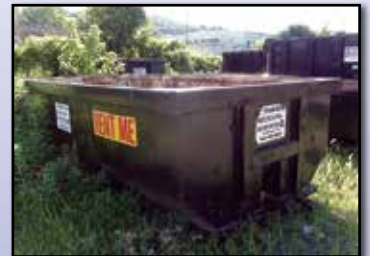
15 CUBIC YARD