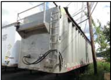
'04 MAC 45'

#WF50001 1999 J&J Model ALF-04, 50' Tandem Axle Aluminum Hydraulic Walking Floor Trailer, equipped with 105" sides, manual side tarp, swing rear door, 80,000 GVWR, and mixed tires. In fair to good condition with good tires. (Floor In Poor Condition)