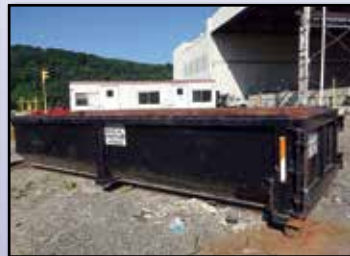
20 CUBIC YARD