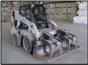
'09 BOBCAT S175

#LT206 2010 TOYOTA Model 8FDU25, 4,850# Solid Tired Forklift, s/n 30264, powered by Toyota 1DZ-III diesel engine and shuttle transmission, equipped with 189" 3-stage mast, 36" forks, ROPS canopy, 7.00-12/5.00 front and 6.00-9/4.00 rear tires. In good condition with good tires.