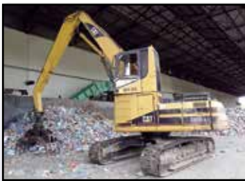
'00 CAT 320BMH

#MH02 2000 CATERPILLAR Model 320B LL/320B MH Material Handling Hydraulic Excavator , s/n 6LS00360, powered by Cat 3066 diesel engine and hydraulic drive, equipped with 19' dipper stick, dual function auxiliary hydraulics, Pemberton 7' 9-tine rotating grapple, 21' boom (40' overall reach), elevated cab with heat and air conditioning, and 24" TBG pads. In good condition with fair to good undercarriage.