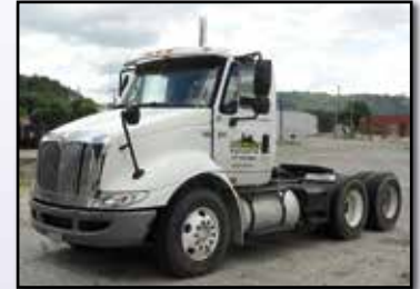
'05 IHC 8600

#778 2008 MACK Model CXU613 Pinnacle Tandem Axle Truck Tractor, powered by Mack MP8-445C, 445HP diesel engine and Eaton Fuller 10 speed transmission, equipped with 40,000# rears and 12,000# front axle, air ride suspension, fixed 5th wheel, 2-stage engine brake, aluminum front wheels, heated mirrors, air conditioning, cruise control, 176" wheelbase, 52,000# GVWR, and 11R22.5 tires. In good condition with good tires.