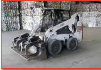
'09 BOBCAT S175