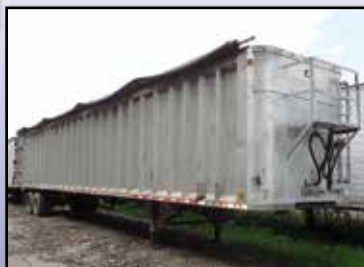
'99 J&J 50'

#WF50001 1999 J&J Model ALF-04, 50' Tandem Axle Aluminum Hydraulic Walking Floor Trailer, equipped with 105" sides, manual side tarp, swing rear door, 80,000 GVWR, and mixed tires. In fair to good condition with good tires. (Floor In Poor Condition)