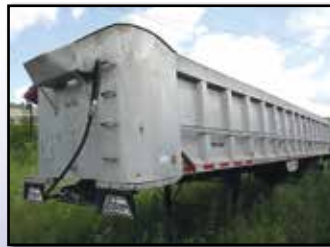
'95 COBRA 40'

1984 EAST 40' Tandem Axle Aluminum Frameless Dump Trailer, equipped with manual tarp, air ride suspension, 80,000# GVWR, and 11R24.5 tires. In good condition with fair tires.