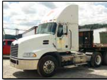
'08 MACK CXU613

#748 2005 INTERNATIONAL Model 8600 Tandem Axle Truck Tractor, powered by Cummins ISM 6 cylinder diesel engine and Eaton Fuller 10 speed transmission, equipped with 40,000# rears and 12,000# front axle, air ride suspension, air slide 5th wheel, heated mirrors, air conditioning, cruise control, 161" wheelbase, 52,000# GVWR, and 11R22.5 tires. In good condition with good tires.