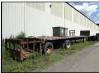
'94 FONTAINE 48'

#FB4801 1994 FONTAINE 48' Spread Axle Flatbed Trailer , equipped with 10'2" axle spread, rear shop made forklift carrier, air ride suspension, aluminum deck, ratchet straps, and 285/75R24.5 tires. In fair to good condition with fair tires.