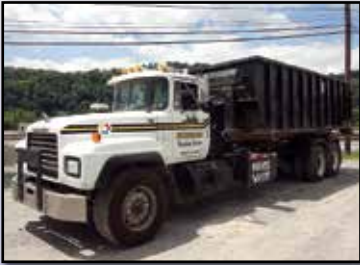
'00 MACK RD688S

Tandem Axle Roll-Off Truck , powered by Mack E7-350, 350HP diesel engine and Fuller 8LL, 10 speed transmission, equipped with 2000 McClain model MMH60T-OR, 22' 60,000# roll-off body, s/n 602022 with electric tarp, 44,000# rears and 18,000# front axle, (4:17) ratio, camelback suspension, 2-stage engine brake, heated mirrors, air conditioning, cruise control, 385/65R22.5 front and 11R22.5 rear tires. In good condition with good tires.