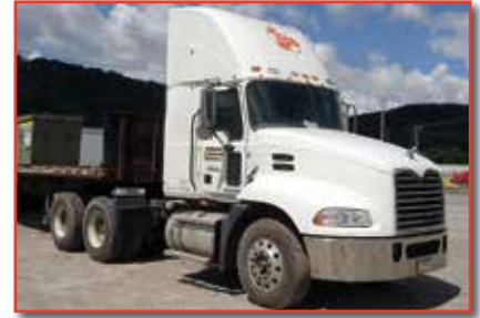
'08 MACK CXU613