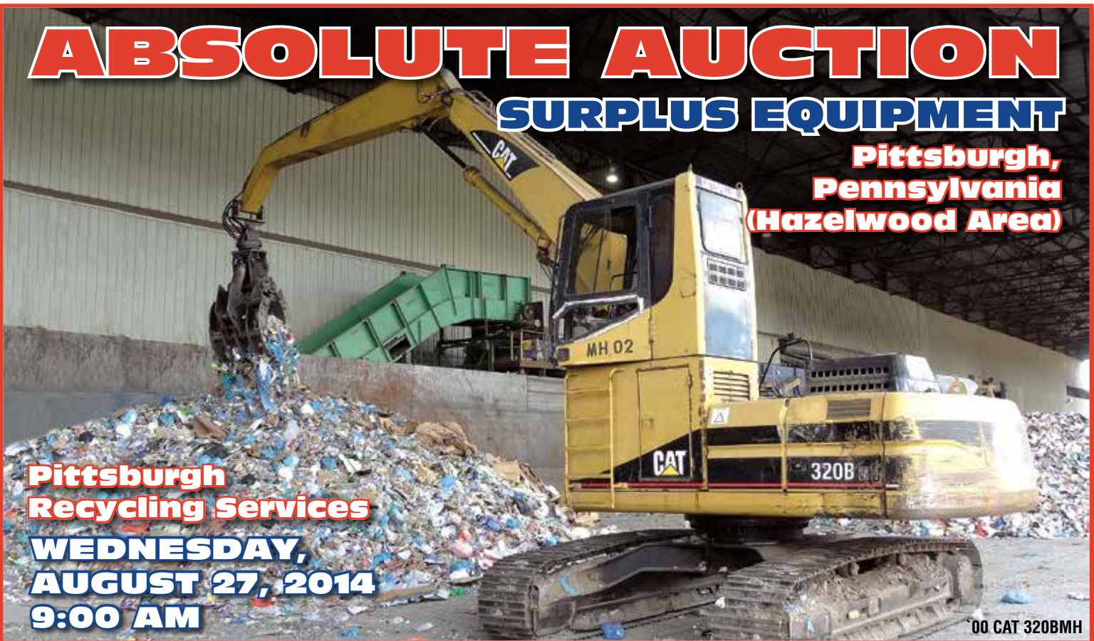
'00 CAT 320BMH

Pittsburgh Recycling Services WEDNESDAY, AUGUST 27, 2014 9:00 AM