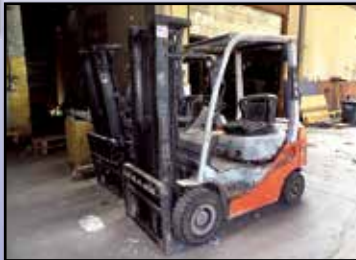
(2) TOYOTA 4,800#

#LT185 2007 TOYOTA Model 8FDU15, 4,800# Solid Tired Forklift, s/n 10044, powered by Toyota 1DZ-II diesel engine and shuttle transmission, equipped with 3-stage mast, 6.50-10/5.00 front and 5.00-8 rear tires. In fair to good condition with good to very good tires. (No Forks)