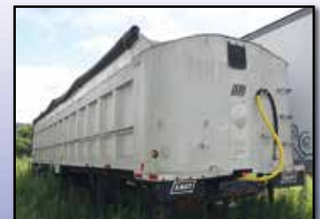
'84 EAST 40'

1995 COBRA 40' Tandem Axle Aluminum Frameless Dump Trailer, equipped with manual tarp, 2-way tailgate with single chute, air ride suspension, aluminum wheels, 80,000# GVWR, and 11R24.5 tires. In good condition with fair tires.