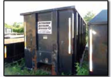
40 CUBIC YARD

(4) 40 YD Roll-Offs – (3) In good condition; (6) 40-42 YD Compactors Boxes. In good condition • (43) 30 YD Roll-Offs – (14) In good condition • (1) 30 YD Compactor Box. In good condition • (11) 20 YD Roll-Offs – (10) In good condition • (12) 15 YD Roll-Offs – (9) In good condition • (1) 10 YD Roll-Off. In good condition. (40+) Rear Load Containers, with lids (Some With Castors) • Approximately (400+/-) 95 Gallon Toters (Some Are NEW With Keys)