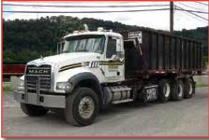
'07 MACK CTP713