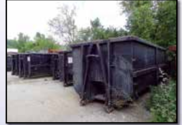
30 CUBIC YARD