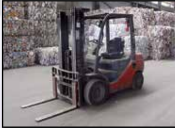
'10 TOYOTA 4,850#

#LT206 2010 TOYOTA Model 8FDU25, 4,850# Solid Tired Forklift, s/n 30264, powered by Toyota 1DZ-III diesel engine and shuttle transmission, equipped with 189" 3-stage mast, 36" forks, ROPS canopy, 7.00-12/5.00 front and 6.00-9/4.00 rear tires. In good condition with good tires.