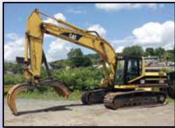
'01 CAT 325BL (GRAPPLE SOLD SEPARATELY)

s/n 2JR03089, powered by Cat 3116 diesel engine and hydraulic drive, equipped with 10'6" dipper stick, auxiliary hydraulics, enclosed ROPS cab with heat and air conditioning, and 31.5" TBG pads. In good condition with good to very good undercarriage. (Grapple Sold Separately)