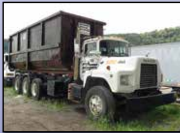
'95 MACK DM690S

Tri-Axle Roll-Off Truck , powered by Mack EM7-300, 300HP diesel engine and Mack T2070B, 7 speed transmission, equipped with 1995 Galbreath model UT-10-174, 60,000# roll-off body, s/n H9997, 44,000# rears and 20,000# front axle, (5:32) ratio, camelback suspension, Jacobs 2-stage engine brake, airlift 3rd axle, 315/80R22.5 front, 10.00R22.5 lift, and 11R22.5 rear tires. In good condition with fair to good tires.