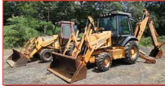
'99 & '86 CASE 4x4 EXTEND-A-HOES