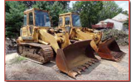
'88 & '86 CAT 953 LOADERS