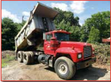
'93 MACK RD690S