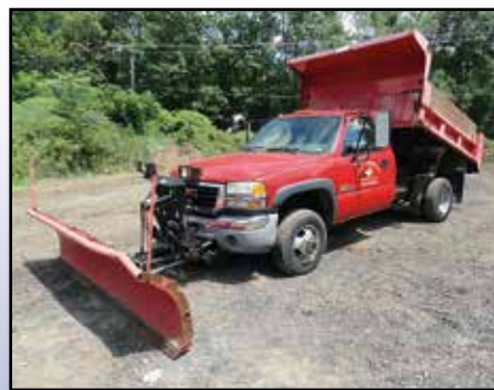
04 GMC 3500

1993 MACK RD690S Tandem Axle , Mack EM7-300 and Fuller 8LL, 46,000# rears, 14' heated dump body, camelback suspension, tow package with air, AC. In good condition with good tires.