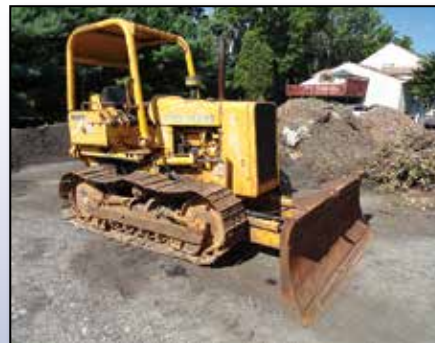
86 JD 450E

1986 JOHN DEERE 450E Crawler Tractor , s/n 730140, 6-way blade, ROPS canopy, and 15" DBG pads. In fair condition with poor undercarriage.