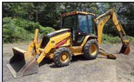
05 CAT 420D

1986 CASE 580 Super E , s/n 17040140, gp loader bucket, 24" digging bucket, plumbed for rear hydraulics, 4-stick backhoe controls, EROPS. In fair condition with fair to good tires.