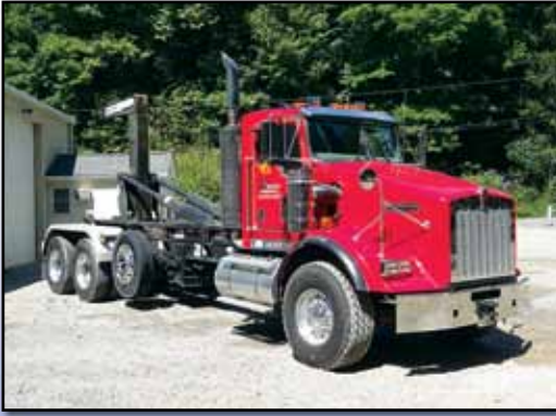
09 KENWORTH T800

2009 KENWORTH Model T800 Tri Axle Hook Lift Truck , powered by Cat C-13 Acert, 470HP diesel engine and Fuller RT016908LL 10 speed transmission, equipped with 2008 Galbreath U5-HK-176, 50,000# Capacity Hook Lift Body, s/n 13H30445, 3-stage engine brake, cruise control, air conditioning, 18,710# front axle, 46,000# rears, 13,200# steerable airlift 3rd axle, beam suspension, and 425/65R22.5 front and 11R24.5 rear and lift tires. In very good condition with good to very good tires. (13,200# Steerable Airlift 4th Axle Removed and Will Be Sold Separately) (1,233 Hours) (17,621 Miles) (Remaining Warranty)