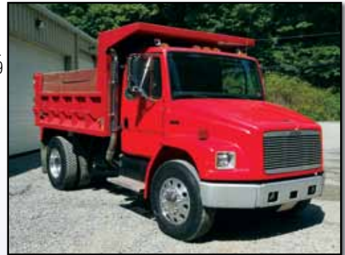
'00 FREIGHTLINER FL80

2004 FREIGHTLINER Model Business Class M2 Tandem Axle Dump Truck , powered by Mercedes-Benz 450HP diesel engine and Fuller 8LL 10 speed transmission, equipped with OX 16', 17-19 yard steel dump body with 2-way gate, electric tarp and cab protector, 46,000# rears, 20,000# front axle, 2-stage engine brake, aluminum wheels, dual 100 gallon aluminum fuel tanks, rear glad hands, heated mirrors, underbody job box, cruise control, air conditioning, 425/65R22.5 front, 11R24.5 rear, and 385/65R22.5 airlift tires. In good to very good condition with good to very good tires. (1/4" T1 Floor and Sides in Body) (Purchased New)