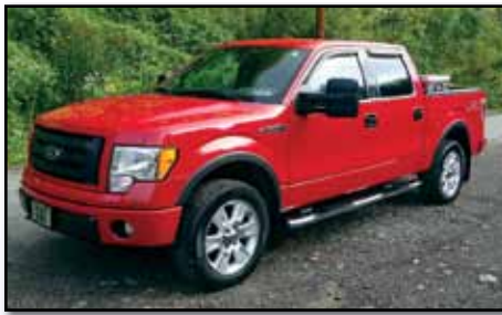
'10 FORD F-150 4X4

powered by Triton V-8 gas engine and automatic transmission, equipped with power windows, locks, mirrors and seats, 6' bed, bed liner, bed extender, cross tool box, tow package with electric, aluminum alloy wheels, running boards, cruise control, air conditioning, and tires. In very good condition with good tires. (41,912 Miles) (Purchased New)