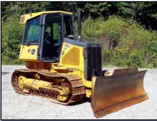
'05 JOHN DEERE 650J XLT

2005 JOHN DEERE Model 650J XLT Crawler Tractor , s/n 113034, powered by John Deere 6 cylinder diesel engine and hydrostatic transmission, equipped with 6-way blade, differential steering, enclosed ROPS cab with A/C and light package, tow pin, and 18" SBG pads. In good condition with fair to good undercarriage. (2,707 Hours)