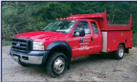
'06 FORD F-550XL 4X4

2006 FORD Model F-550XL Super Duty 4x4 Quad Cab Utility Dump Truck , powered by Powerstroke 6L diesel engine and automatic transmission, equipped with 9' utility/dump body with manual tarp, 115 gallon fuel tank with electric pump, tow package with electric, VanAir under hood air compressor, Powerverter 3000 Watt power inverter, air conditioning, and 225/70R19.5 tires. In very good condition with good tires. (2,893 Hours) (064,790 Miles) (Purchased New)