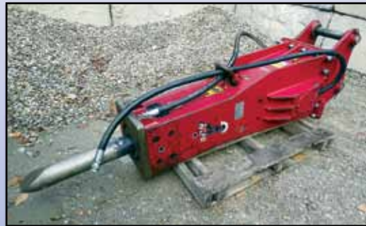
'08 ALLIED 110BU

2000 TAKEUCHI Model TB145 Mini Hydraulic Excavator , s/n 14510343, powered by Yanmar 4 cylinder diesel engine and hydraulic drive, equipped with 68" dipper stick, swing boom, manual quick coupler, enclosed ROPS cab with heat, hydraulic plumbing, 24" digging bucket, 72" backfill blade, light package, 8' crawlers, and 18" pads with bolt on street pads. In good condition with good undercarriage. (07,106 Hours) (Purchased New)