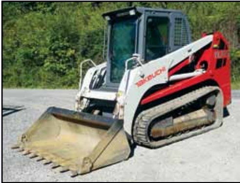
'08 TAKEUCHI TL250

2008 TAKEUCHI Model TL250 Crawler Skid Steer Loader , s/n 22500056, powered by Kubota 4 cylinder diesel engine and hydrostatic drive, equipped with 80" loader bucket with teeth, auxiliary hydraulics, hydraulic quick disconnect, enclosed cab with heat and air conditioning, light package, and 17"x7" rubber crawlers. In good condition with good undercarriage. (02,447 Hours) (Purchased New)