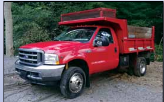
'03 FORD F-550XL 4X4

2006 FORD Model F-550XL Super Duty 4x4 Quad Cab Utility Dump Truck , powered by Powerstroke 6L diesel engine and automatic transmission, equipped with 9' utility/dump body with manual tarp, 115 gallon fuel tank with electric pump, tow package with electric, VanAir under hood air compressor, Powerverter 3000 Watt power inverter, air conditioning, and 225/70R19.5 tires. In very good condition with good tires. (2,893 Hours) (064,790 Miles) (Purchased New)