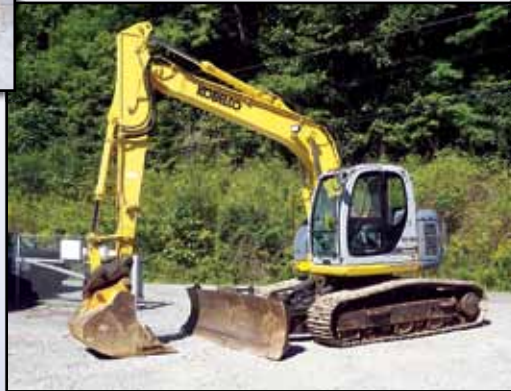
'05 KOBELCO ED-150-1E BLADE RUNNER

2006 KOBELCO Model SK115SRDZ-1E Hydraulic Excavator , s/n YY04-07931, powered by Isuzu 4 cylinder diesel engine and hydraulic drive, equipped with 8' dipper stick, Geith hydraulic quick disconnect, hydraulic plumbing, 36" digging bucket, 102" backfill blade, enclosed ROPS cab with heat and air conditioning, light package, 23.5 TBG pads, and 11'10" crawlers. In very good to good condition with good undercarriage. (03,363 Hours) (Purchased New)