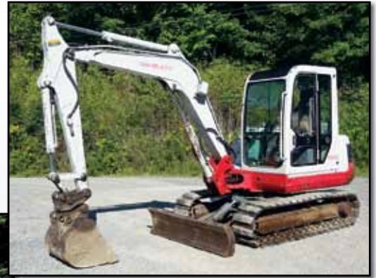
'02 TAKEUCHI TB145

2005 KOBELCO Model ED-150-1E Blade Runner Hydraulic Excavator , s/n YL05-00669, powered by Isuzu BB-4BGIT diesel engine and hydraulic drive, equipped with 9'6" dipper stick, hydraulic quick disconnect, hydraulic plumbing, 42" digging bucket, 8'2" 6-way straight blade with 13" fold away extensions, enclosed ROPS cab with heat and air conditioning, light package, 11'9" crawlers, and 24" TBG pads. In good condition with good undercarriage. (03,230 Hours) (Purchased New)