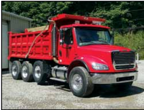
'07 FREIGHTLINER M2

2004 FREIGHTLINER Model Business Class M2 Tandem Axle Dump Truck , powered by Mercedes-Benz 450HP diesel engine and Fuller 8LL 10 speed transmission, equipped with OX 16', 17-19 yard steel dump body with 2-way gate, electric tarp and cab protector, 46,000# rears, 20,000# front axle, 2-stage engine brake, aluminum wheels, dual 100 gallon aluminum fuel tanks, rear glad hands, heated mirrors, underbody job box, cruise control, air conditioning, 425/65R22.5 front, 11R24.5 rear, and 385/65R22.5 airlift tires. In good to very good condition with good to very good tires. (1/4" T1 Floor and Sides in Body) (Purchased New)