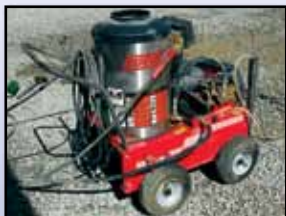
HOTSY STEAM CLEANER

Shopmade Service Skid with 115 gallon fuel tank with electric pump, Emglo gas powered air compressor/generator, Foreman toolbox, and parts basket • CLARK 2,000# Solid Tired Forklift, 4 cyl. gas, shuttle transmission, 132" 2-stage mast with 40" forks • HOTSY Portable Electric Steam Cleaner, oil fired burner • LANDA Portable Pressure Washer, Honda 13HP gas • HUSKY 1800 PSI Electric Pressure Washer • CRAFTSMAN Rolling Tool Chest with tools • HILTI TE76 Hammer Drill • BOSCH 11236V5 Hammer Drill • BENNER DC20XH Electric Rebar Cutter • NAPA 1" Impact Wrench • IR 1/2" Impact Wrench • (21 Piece) 3/4" Socket Set • LINCOLN 225 Amp Electric Welder • Torch Set with cart • SCHUMACHER Battery Charger • DEWALT 18 Volt Cordless Tool Set • MILWAUKEE 14" Electric Chop Saw • MILWAUKEE Reciprocating Saw • SKIL Jig Saw • 7-1/4" Circular Saw • MANSFIELD 18 Volt Cordless Dual Drill • 1/2" Electric Drill • DEWALT 3/8" Electric Drill • DEWALT Drywall Screw Gun • DEWALT Screw Shooter • (2) Angle Grinders • (3)