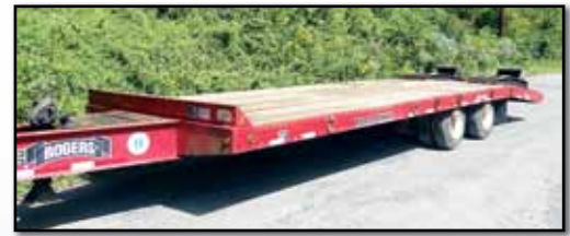
'08 ROGERS 20 TON

equipped with 48,810# GVWR, 22' level deck, 6' beavertail, 6' ramps, 102" width, air brakes, and 215/75R17.5 tires. In good condition with good to very good tires. (Purchased New)