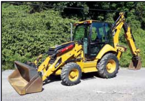
'07 CAT 420EIT 4X4

2007 CATERPILLAR Model 420EIT 4x4 Tractor Loader Extend-A-Hoe , s/n KMW02003, powered by Cat 4 cylinder diesel engine and shuttle transmission, equipped with general purpose bucket with bolt-on cutting edge, front hydraulic quick disconnect, auxiliary hydraulics, rear manual quick disconnect, 24" digging bucket, hydraulic plumbing, front counterweight, enclosed ROPS cab with heat and air conditioning, light package, 12.5/80x18 front and 19.5Lx24 rear tires. In good to very good condition with fair to good tires. (1,807 Hours) (Purchased New)