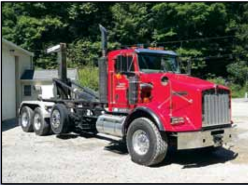
'09 KENWORTH T800

2009 KENWORTH Model T800 Tri Axle Hook Lift Truck , powered by Cat C-13 Acert, 470HP diesel engine and Fuller RT016908LL 10 speed transmission, equipped with 2008 Galbreath U5-HK-176, 50,000# Capacity Hook Lift Body, s/n 13H30445, 3-stage engine brake, cruise control, air conditioning, 18,710# front axle, 46,000# rears, 13,200# steerable airlift 3rd axle, beam suspension, and 425/65R22.5 front and 11R24.5 rear and lift tires. In very good condition with good to very good tires. (13,200# Steerable Airlift 4th Axle Removed and Will Be Sold Separately) (1,233 Hours) (17,621 Miles) (Remaining Warranty)