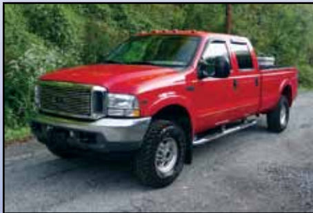
'03 FORD F-350 4X4

powered by Triton V-10 gas engine and automatic transmission, equipped with 8'6" bed, 105 gallon fuel tank with electric pump, cross tool box, bed liner, power windows, locks and mirrors, power heated seats, FX4 off road package, cruise control, air conditioning, running boards, and 285/75R16 tires. In good condition with good tires. (Purchased New)