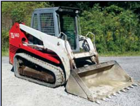
'03 TAKEUCHI TL140

2003 TAKEUCHI Model TL140 Crawler Skid Steer Loader , s/n 21400151, powered by Isuzu diesel engine and hydrostatic transmission, equipped with 77" loader bucket with teeth, auxiliary hydraulics, enclosed ROPS cab with heat and light package, and 17"x6" rubber crawlers. In good condition with good undercarriage. (03,421 Hours) (Purchased New)