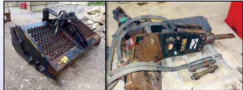
SKID LOADER ATTACHMENTS

2007 TAKEUCHI Model TL150 Crawler Skid Steer Loader , s/n 21504898, powered by Yanmar diesel engine and hydrostatic transmission, equipped with 80" loader bucket with teeth, auxiliary hydraulics, enclosed ROPS cab with heat and air conditioning, light package, and 7"x18" rubber crawlers. In good condition with good undercarriage. (02,638 Hours) (Purchased New)