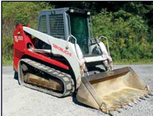
'07 TAKEUCHI TL150

2007 TAKEUCHI Model TL150 Crawler Skid Steer Loader , s/n 21504898, powered by Yanmar diesel engine and hydrostatic transmission, equipped with 80" loader bucket with teeth, auxiliary hydraulics, enclosed ROPS cab with heat and air conditioning, light package, and 7"x18" rubber crawlers. In good condition with good undercarriage. (02,638 Hours) (Purchased New)