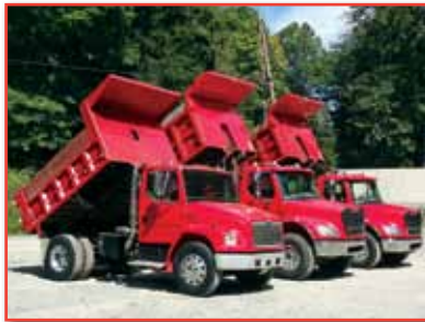
FREIGHTLINER DUMP TRUCKS