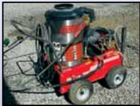
HOTSY STEAM CLEANER

Shopmade Service Skid with 115 gallon fuel tank with electric pump, Emglo gas powered air compressor/generator, Foreman toolbox, and parts basket • CLARK 2,000# Solid Tired Forklift, 4 cyl. gas, shuttle transmission, 132" 2-stage mast with 40" forks • HOTSY Portable Electric Steam Cleaner, oil fired burner • LANDA Portable Pressure Washer, Honda 13HP gas • HUSKY 1800 PSI Electric Pressure Washer • CRAFTSMAN Rolling Tool Chest with tools • HILTI TE76 Hammer Drill • BOSCH 11236V5 Hammer Drill • BENNER DC20XH Electric Rebar Cutter • NAPA 1" Impact Wrench • IR 1/2" Impact Wrench • (21 Piece) 3/4" Socket Set • LINCOLN 225 Amp Electric Welder • Torch Set with cart • SCHUMACHER Battery Charger • DEWALT 18 Volt Cordless Tool Set • MILWAUKEE 14" Electric Chop Saw • MILWAUKEE Reciprocating Saw • SKIL Jig Saw • 7-1/4" Circular Saw • MANSFIELD 18 Volt Cordless Dual Drill • 1/2" Electric Drill • DEWALT 3/8" Electric Drill • DEWALT Drywall Screw Gun • DEWALT Screw Shooter • (2) Angle Grinders • (3)