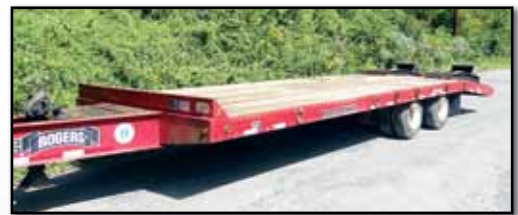
'08 ROGERS 20 TON

equipped with 48,810# GVWR, 22' level deck, 6' beavertail, 6' ramps, 102" width, air brakes, and 215/75R17.5 tires. In good condition with good to very good tires. (Purchased New)