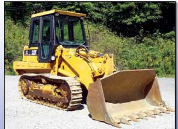
'05 CAT 953C

2005 CATERPILLAR Model 953C Crawler Loader , s/n BBX02012, powered by Cat 3126 diesel engine and hydrostatic drive, equipped with GP loader bucket with teeth, 15" DBG pads, enclosed ROPS cab, air conditioning, and light package. In very good condition with very good undercarriage. (5,020 Hours) (Approximately 386 Hours On Complete Undercarriage)