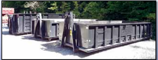
HOOK LIFT BODIES

19' Steel Flatbed with ramps and headboard • 30 Yard Roll-off Body with swing gate • 20 Yard Roll-off Body with swing gate • 18 Yard Roll-off Body with 2-way gate