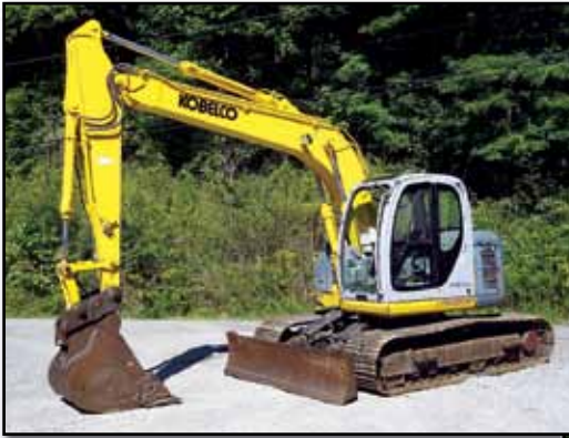
'06 KOBELCO SK115SRDZ-1E

2006 KOBELCO Model SK115SRDZ-1E Hydraulic Excavator , s/n YY04-07931, powered by Isuzu 4 cylinder diesel engine and hydraulic drive, equipped with 8' dipper stick, Geith hydraulic quick disconnect, hydraulic plumbing, 36" digging bucket, 102" backfill blade, enclosed ROPS cab with heat and air conditioning, light package, 23.5 TBG pads, and 11'10" crawlers. In very good to good condition with good undercarriage. (03,363 Hours) (Purchased New)