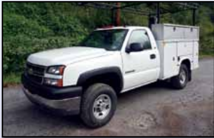
'05 CHEVY 2500HD

powered by Vortec 6L gas engine and automatic transmission, equipped with 8' utility body, side tool boxes, material rack, Auto Crane Econo-Ton II electric pedestal crane, air conditioning, and 265/75R16 tires. In good condition with good to very good tires.