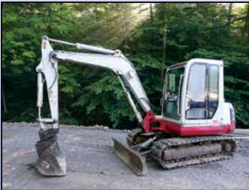
'00 TAKEUCHI TB145

2002 TAKEUCHI Model TB145 Mini Hydraulic Excavator , s/n 14511725, powered by Yanmar 4 cylinder diesel engine and hydraulic drive, equipped with 70" dipper stick, swing boom, WB manual quick disconnect, enclosed ROPS cab with heat, hydraulic plumbing, 24" digging bucket, 72" backfill blade, light package, 16" DBG pads with street pads, and 97" crawlers. In good condition with good undercarriage. (05,178 Hours) (Purchased New)