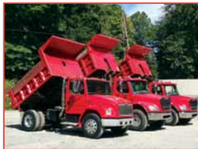
FREIGHTLINER DUMP TRUCKS