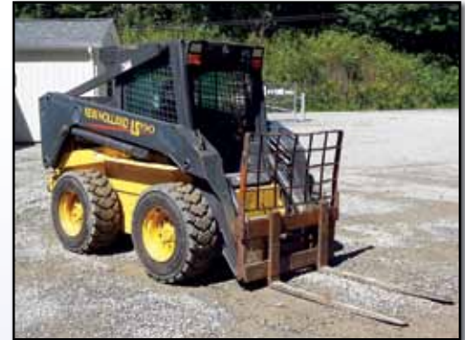
'04 NEW HOLLAND LS190

2004 NEW HOLLAND Model LS190 Skid Steer Loader , s/n LMU018583, powered by New Holland CNH 4 cylinder diesel engine and 2 speed hydrostatic transmission, equipped with Super Boom, 80" loader bucket with bolt-on Rezloh cutting edge, enclosed ROPS cab with heat, light package, and 12x16.5 foam filled tires. In good condition with good to very good tires. (1,694 Hours) (Purchased New)