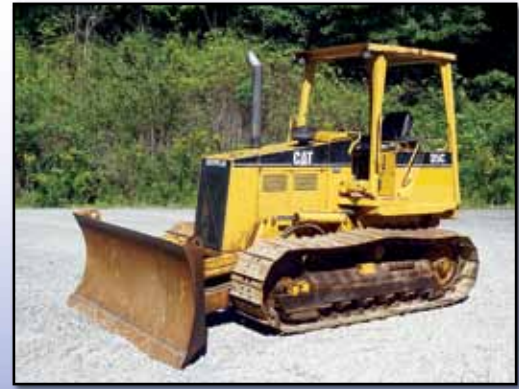
'95 CAT D5C SERIES III

1995 CATERPILLAR Model D5C Series III Crawler Tractor , s/n 9DL01058, powered by Cat 6 cylinder diesel engine and powershift transmission, equipped with 6-way blade, tow pin, 20" SBG pads, ROPS canopy, heater, soft cab, and light package. In good condition with fair undercarriage.