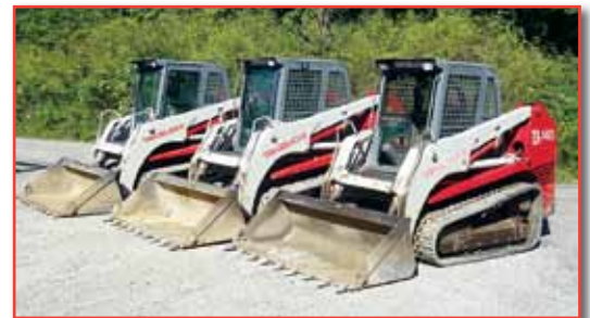
TAKEUCHI SKID STEERS