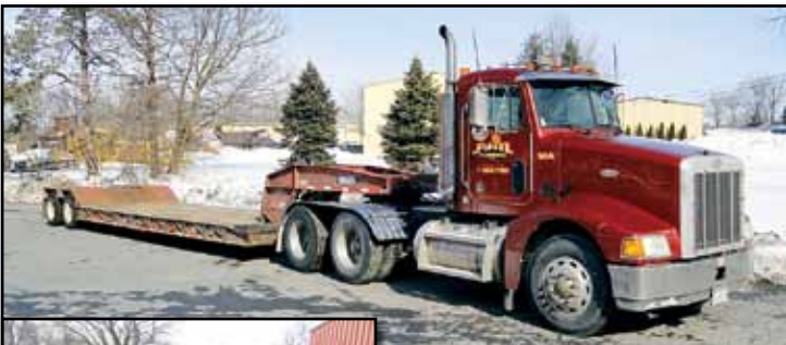
'97 PETERBILT 385 WITH '99 ROGERS 35 TON

1997 PETERBILT Model 385 Tandem Axle Truck Tractor , powered by Cat C-12, 395HP diesel engine and Eaton Fuller 10 speed transmission, equipped with 38,000# rears, 12,000# front axle, wetline system, 3-stage Jake brake, air slide 5th wheel, single frame, air ride suspension, air rid cab, aluminum Budd wheels, 120 gallon aluminum fuel tank, aluminum fenders, cruise control, air conditioning, heated mirrors, and 11R22.5 tires. In good condition with good tires. (Unit #804)