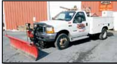
'00 FORD F-450XL 4X4

2000 FORD Model F-450 XL Super Duty 4x4 Utility Truck , powered by Powerstroke 7.3 liter diesel engine and 6 speed transmission, equipped with Reading 9' open utility body, Western 9' Pro snowplow package, 100 gallon fuel tank with 12 volt pump, dual rear wheels, tow package with electric, air conditioning, and 225/70R19.5 tires. In good condition with good tires. (Unit #819) (Purchased New)