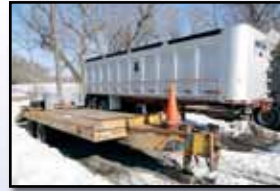
GENERAL 15 TON

1978 GENERAL 15 Ton Tandem Axle Tag-A-Long Trailer , equipped with 17'x8' load deck, 5' beavertail with ramps, air brakes, chain dogs, and 8.25R15TR tires. In good condition with good tires.