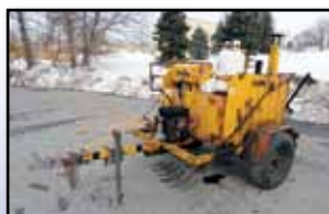
'95 LEEBOY L250

propane heat, and ST205/75R15 tires. In good condition. (Purchased New)