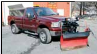
'05 FORD F-350 XLT 4X4 (SPREADER SOLD SEPARATELY)

2005 FORD Model F-350 XLT Super Duty, 4x4 Pickup Truck , powered by Powerstroke 6.0L diesel engine and automatic transmission, equipped with Western 8'6" MVP V-plow package, 8' bed, tow package with electric, power windows and locks, cruise control, air conditioning, AM/FM CD, and LT275/70R18 tires. In good condition with good tires. (46,174 Original Miles)