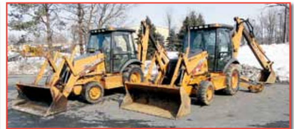
'05 AND '01 CASE 4X4 EXTEND-A-HOES