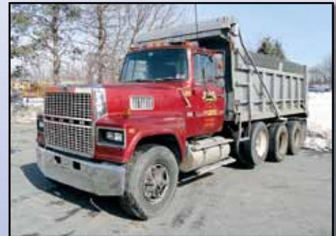
'88 FORD LTL9000 (UNIT #801)

1994 FORD Model LTL9000 Tri-Axle Dump Truck , powered by Cat 3406B, 14.6L diesel engine and Eaton Fuller RT1170-8LL, 10 speed transmission, equipped with J&J 17'6" heated aluminum dump body (heat not plumbed) with Aero power tarp, air gate, single chute, 46,000# rears, 18,000# front axle, airlift 3rd axle with dual wheels, spring suspension, engine brake, 73,280# GVWR, 385/65R22.5 front and 11R24.5 rear and lift tires. In good condition with good tires. (Less Than 100,000 Miles on Rebuilt Transmission) (Unit #806) (Purchased New)