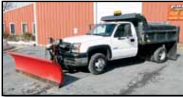
'03 CHEVY 3500 4X4

2003 CHEVROLET Model Silverado 3500, 4x4 Mason Dump Truck , powered by Vortec 6.0L gas engine and automatic transmission, equipped with 8'6" mason dump body with manual tarp, dual rear wheels, Western 9' Pro plow package, tow package, and LT215/85R16 tires. In good to very good condition with good tires. (17,635 Original Miles)