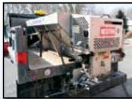
(1) OF (3) ALUMINUM SPREADERS

Snow Maintenance Equipment: WESTERN 8' Poly Plow with Ultra-Mount frame, lights, and controls • (1) BUYERS Stainless Steel Salt Spreader with gas engine and cab controls • (2) WESTERN Stainless Steel Salt Spreaders with gas engines and cab controls