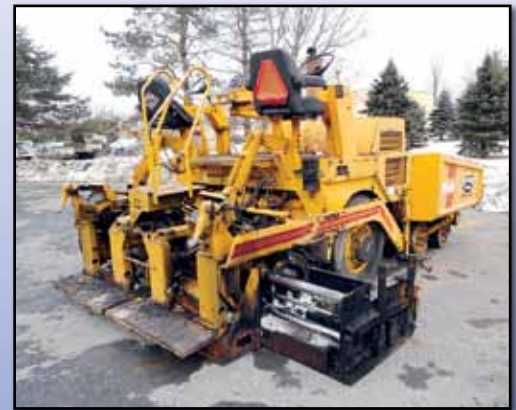
'94 BLAW KNOX PF-161

2005 INGERSOLL RAND/BLAW-KNOX Model PF2181 Rubber Tired Paver , s/n 181318, powered by Cummins 5.9 liter diesel engine and hydrostatic transmission, equipped with Ultimat 8'-16' heated vibratory screed with (2) 12" bolt-on extensions to 18' paving width, hydraulic strike-off tunnels, bogie drive assist, Blaw-Kontrol II model AGS7.5 electronic slope and grade controls (un-used),