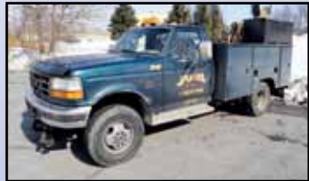
'97 FORD F-350 XL 4X4

1997 FORD Model F-350 XL, 4x4 Utility Truck , powered by Powerstroke 7.3 liter diesel engine and automatic transmission, equipped with Reading 9' open utility body, Western 9' snowplow package, 100 gallon fuel tank with 12 volt pump, air conditioning, and 235/85R16 tires. In good condition with good tires. (Unit #818) (Purchased New)