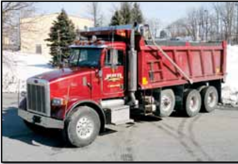
'06 PETERBILT 357 (UNIT #827)

2006 PETERBILT Model 357 Tri-Axle Dump Truck , powered by Cat C-13 Acert 430HP diesel engine and Eaton Fuller 8LL, 10 speed transmission, equipped with Heil 18' steel dump body with bed vibrator, 2-way air gate, single chute, Aero power tarp, 46,000# rears, 20,000# front axle, 22,000# lift axle, air ride suspension, aluminum Budd wheels, 2-stage engine brake, cruise control, power windows and locks, heated power mirrors, tow package with air, 425/65R22.5 front and lift, and 11R24.5 rear tires. In good to very good condition with good tires. (Odometer Reads 90,170 Miles) (Unit #827) (Purchased New)