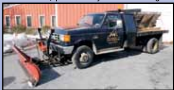
'90 FORD F-350 4X4

1990 FORD Model F-350, 4x4 Flatbed Truck , powered by 7.5 liter V-8 gas engine and 5 speed transmission, equipped with 9' flatbed body with stake pockets, Western 9' snowplow package, behind cab thru-tool boxes, dual rear wheels, air conditioning, and LT235/85R16 tires. In fair to good condition with fair to good tires. (Unit #805)