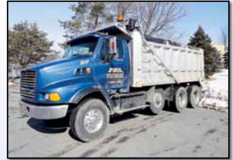
'97 FORD LOUISVILLE 9500 (UNIT #817)

2006 PETERBILT Model 357 Tri-Axle Dump Truck , powered by Cat C-13 Acert 430HP diesel engine and Eaton Fuller 8LL, 10 speed transmission, equipped with Heil 18' steel dump body with bed vibrator, 2-way air gate, single chute, Aero power tarp, 46,000# rears, 20,000# front axle, 22,000# lift axle, air ride suspension, aluminum Budd wheels, 2-stage engine brake, cruise control, power windows and locks, heated power mirrors, tow package with air, 425/65R22.5 front and lift, and 11R24.5 rear tires. In good to very good condition with good tires. (Odometer Reads 90,170 Miles) (Unit #827) (Purchased New)