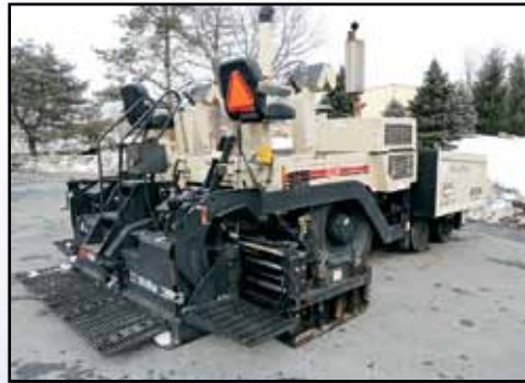
'05 IR-BLAW KNOX PF2181

power crown control, joint matching ski, and 16.00x24TG tires. In good to very good condition with good tires. (Meter Reads 2,138 Hours) (Purchased New)