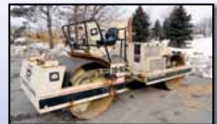
'96 IR DD-90

1996 INGERSOLL RAND Model DD-90 Tandem Vibratory Roller , s/n 145504, powered by Cummins 3.9 liter turbo diesel engine and hydrostatic transmission, equipped with 66" smooth drums, spray system with front and rear spray, 2-frequency vibration, and ROPS post roll-bar. In good condition. (Rental Purchase) BOMAG Model BW100AD Tandem Vibratory Roller , s/n 150124433, powered by Deutz diesel engine and hydrostatic transmission, equipped with 38.5" smooth drums and water system with front and rear spray. In good condition. (Cosmetically Fair)