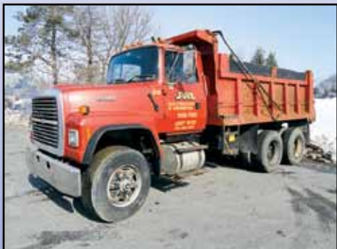
'95 FORD LT9000 (UNIT #815)

1988 FORD Model LTL9000 Tri-Axle Dump Truck , powered by Cat 3406B diesel engine and Roadranger RTO1170-8LL, 10 speed transmission, equipped with 16' steel dump body with electric tarp, single chute, 44,000# rears, 16,000# front axle, 2-stage engine brake, tow package with air and electric, air conditioning, heated mirrors, 315/80R22.5 front and 11R22.5 rear and lift tires. In good condition with good tires. (Unit #801) (Purchased New)