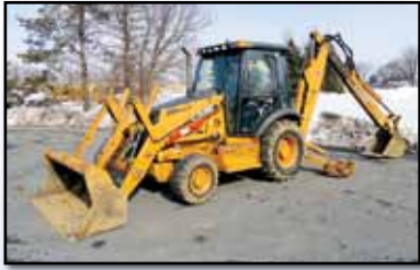
'05 CASE 580 SUPER M SERIES II, 4X4

2001 CASE Model 580 Super M 4x4 Tractor Loader Extend-A-Hoe , s/n JJG0279198, powered by Case diesel engine and shuttle transmission, equipped with general purpose loader bucket, 24" digging bucket, ride control, 4-lever backhoe controls, enclosed ROPS cab with air conditioning, 12x16.5NHS foam filled front and 19.5Lx24 rear tires. In good condition with poor front and good rear tires. (Meter Reads 06,527 Hours) (Purchased New)