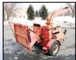
'93 GRAVELLY PRO-CHIP

good condition with good tires. (Meter Reads 707 Hours) (Purchased New) 1993 INGERSOLL RAND Model DX70 Walk Behind Vibratory Roller , s/n AD7136, powered by Kubota diesel engine and hydrostatic transmission. In good condition.