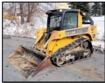
'07 JOHN DEERE CT322

2003 JOHN DEERE Model 270 Series II Skid Steer Loader , s/n 919678, powered by John Deere Powertech 4.5 liter diesel engine and hydrostatic transmission, equipped with 76" general purpose loader bucket, Hi-Flow auxiliary hydraulics, standard auxiliary hydraulics, foot controls, side counterweights, ROPS canopy, and 14/17.5 tires. In good condition with fair to good tires. (Meter Reads 3,421 Hours) (Rental Purchase) Skid Steer Attachments To Include: JOHN DEERE Model CP24 Worksite Pro 24" Hydraulic Cold Planer, with side shift control • CONEQTEC/UNIVERSAL Model AP300, 12" Cold Planer • SWEEPSTER Model ZBDC62M, 62" Hydraulic Sweeper, with dump hopper