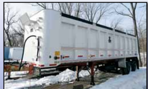
'86 COBRA 30' ALUMINUM

1986 COBRA 30' Tandem Axle Aluminum Dump Trailer , equipped with air tailgate and single chute, spring suspension, 18,000# GAWR, 73,280# GVWR, and 11R24.5 tires. In good condition with good tires. (Unit #804T)