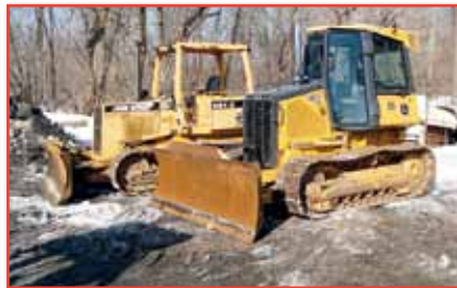
'05 JD 650J XLT AND '96 JD 450G LT