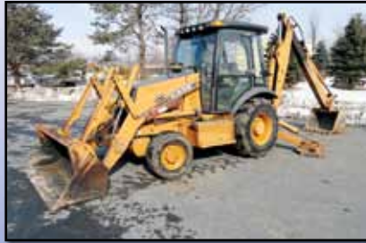
'01 CASE 580 SUPER M 4X4

2001 CASE Model 580 Super M 4x4 Tractor Loader Extend-A-Hoe , s/n JJG0279198, powered by Case diesel engine and shuttle transmission, equipped with general purpose loader bucket, 24" digging bucket, ride control, 4-lever backhoe controls, enclosed ROPS cab with air conditioning, 12x16.5NHS foam filled front and 19.5Lx24 rear tires. In good condition with poor front and good rear tires. (Meter Reads 06,527 Hours) (Purchased New)