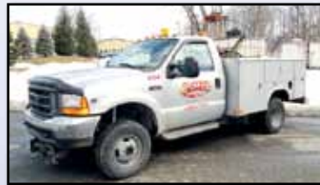
99 FORD F-350 XL 4X4

1999 FORD Model F-350 XL Super Duty 4x4 Utility Truck , powered by Triton V-10 gas engine and automatic transmission, equipped with Reading 9' open utility body, Western 9' Pro snowplow package, 100 gallon fuel tank with 12 volt pump, tow package with electric, dual rear wheels, air conditioning, and 235/85R16 tires. In good condition with good to very good tires. (Unit #824)