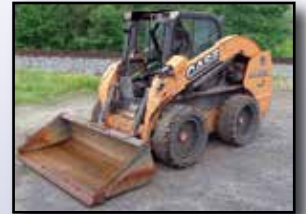
'12 CASE SV250

2012 CASE Model SV250 Skid Steer Loader , s/n JAFSV250VCM460645, powered by Case 4 cylinder diesel engine and hydrostatic transmission, equipped with 72" loader bucket with bolt on cutting edge, high flow auxiliary hydraulics, ride control, auxiliary electric, enclosed ROPS cab with heat, and 33x12-20 cushion tires. In good condition with good tires. (985 Hours) (Missing Door)