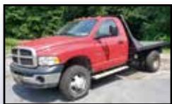
'05 RAM 3500 4X4

2005 RAM Model 3500, 4x4 Single Axle Flatbed Truck , powered by Cummins 6 cylinder diesel engine and 6 speed transmission, equipped with 8'6" steel flatbed, dual rear wheels, running boards, cruise control, air conditioning, and 245/75R17 tires. In good condition with good tires. (121,541 Miles)