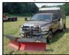
'08 RAM 3500HD SLT 4X4

2008 RAM Model 3500HD SLT, 4x4 Crew Cab Utility Truck , powered by Cummins 6.7L diesel engine and automatic transmission, equipped with 9' walk-in utility body, approx. 100 gallon fuel tank with electric pump, Western 8'6" V-plow with Ultra Mount, dual rear wheels, tow package, power windows, locks, mirrors, and seats, cruise control, air conditioning, and 235/80R17 tires. In good condition with good tires. (126,055 Miles) (Missing Plow Parts)