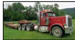
'96 PETERBILT 379 AND PHELAN 35 TON

1996 PETERBILT Model 379 Tri Axle Truck Tractor , powered by Cat 3406 diesel engine (475HP turned up to 525HP) and Fuller 18 speed transmission, equipped with 46,000# rears, 12,000# front and 25,000# lift axle, air ride suspension, wetline, 260" wheelbase, air slide 5th wheel, 3-stage engine brake, aluminum headache rack and wheels, heated power mirrors, pneumatic passenger window, air conditioning, and 315/80R22.5 front and 295/75R22.5 rear tires. In good condition with good tires.