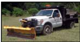
'13 FORD F-350XL 4X4

2013 FORD Model F-350XL Super Duty 4x4 Single Axle Dump Truck , powered by 6.2L gas engine and automatic transmission, equipped with 9' steel dump body, Fisher 8'6" snowplow with Sno Foil and Minute Mount II, Buyers Salt Dogg 8' stainless steel salt spreader with 10.5HP gas engine, dual rear wheels, tow package, power windows, locks, and mirrors, cruise control, air conditioning, and 265/70R17 tires. In good condition with good tires. (56,320 Miles)