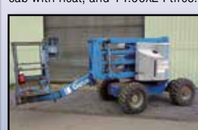
'97 GENIE Z45 45'

CLARK Model 301, 6x6 Motor Grader , s/n 618A046K, powered by Detroit V-6 diesel engine and powershift transmission, equipped with 14' moldboard, all wheel steer, enclosed ROPS cab with heat, and 14.00x24 tires. In fair condition with fair tires.