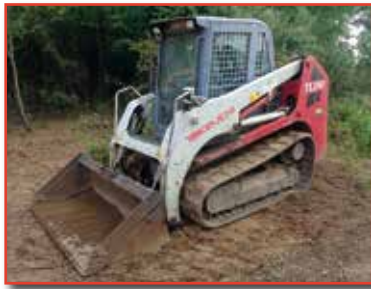
'11 TAKEUCHI TL240

1440 COWPATH RD. • HATFIELD, PA 19440 215/361-9099 • Fax: 215/361-9212 www.hunyady.com