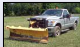
'11 FORD F-250XL 4X4

2011 FORD Model F-250XL Super Duty 4x4 Pickup Truck , powered by 6.2L gas engine and automatic transmission, equipped with 8' bed with crossbox, 100 gallon fuel tank with electric pump, Fisher 8' snowplow, Buyers salt spreader controls, tow package, running boards, power windows, locks, and mirrors, cruise control, air conditioning, and 265/70R17 tires. In good condition with good tires. (128,471 Miles)