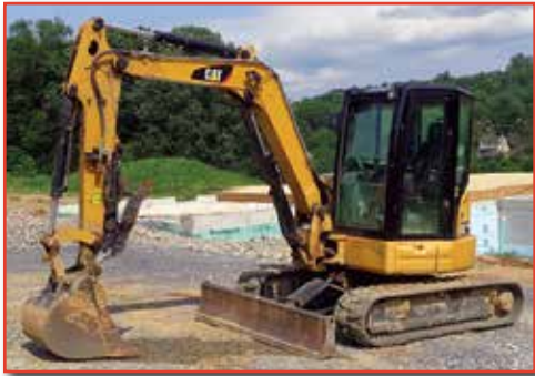
'15 CAT 305E2 CR

PRE-SORTED FIRST CLASS MAIL US POSTAGE PAID HAVERTOWN, PA PERMIT #45