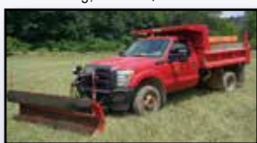
'11 FORD F-350XL 4X4

2011 FORD Model F-350XL Super Duty 4x4 Single Axle Dump Truck , powered by 6.2L diesel engine and automatic transmission, equipped with 9' steel dump body, Western 8'6" snowplow with Ultra Mount, Buyers Salt Dogg 8' steel salt spreader with 10.5HP gas engine, dual rear wheels, tow package, cruise control, air conditioning, and 265/70R17 tires. In good condition with good tires. (84,283 Miles)