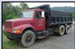
'90 INT'L 4900

1990 INTERNATIONAL Model 4900 Tandem Axle Dump Truck , powered by Int'l 6 cylinder diesel engine and 5 speed transmission with 2 speed rear, equipped with 15' steel dump body with single chute and manual tarp kit, airlift 2nd axle with 9.00x20 tires, and 12R22.5 front and 11R22.5 rear tires. In good condition with fair tires.