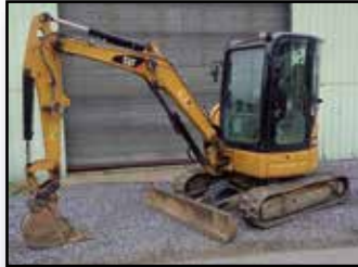
'14 CAT 303.5E

2014 CATERPILLAR Model 303.5E Hydraulic Mini Excavator , s/n RKY04111, powered by Cat C1.8 diesel engine and hydraulic drive, equipped with swing boom, 62" dipper stick, Cat 12" digging bucket, Wedglock coupler, auxiliary hydraulics, 70" backfill blade, enclosed ROPS cab with heat and air conditioning, and 12" rubber crawlers. In good condition with good undercarriage. (879 Hours)