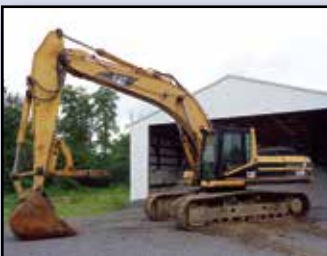
'00 CAT 330BL

2000 CATERPILLAR Model 330BL Hydraulic Excavator , s/n 6DR03975, powered by Cat 3306 diesel engine and hydraulic drive, equipped with 12' dipper stick, 44" digging bucket, thumb attachment, enclosed ROPS with heat and air conditioning, and 34" TBG pads. In good condition with good undercarriage.