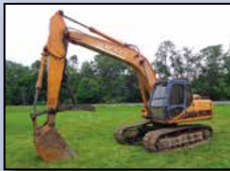
'99 CASE 9020B

1999 CASE Model 9020B Hydraulic Excavator , s/n DAC0202618, powered by Isuzu 4 cylinder diesel engine and hydraulic drive, equipped with 10' dipper stick, 35" digging bucket, thumb attachment, enclosed ROPS cab with heat, and 24" TBG pads. In fair condition with fair undercarriage.