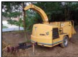
'04 VERMEER BC1000XL

2004 VERMEER Model BC1000XL Portable Chipper , s/n 1VRU111AX41004374, powered by 4 cylinder diesel engine, equipped with 54" feed chute, 18" feed drum, trailer mounted with 225/75R15 tires. In good condition with good tires. (1,384 Hours) HESTON Model 90-90 Utility Tractor , s/n 242718, powered by 5 cylinder diesel engine and shuttle transmission, equipped with 3-point hitch, PTO, drawbar, hydraulic outlets, sun canopy, 10.00x16 front and 18.4x34 rear tires. In fair condition with good tires.