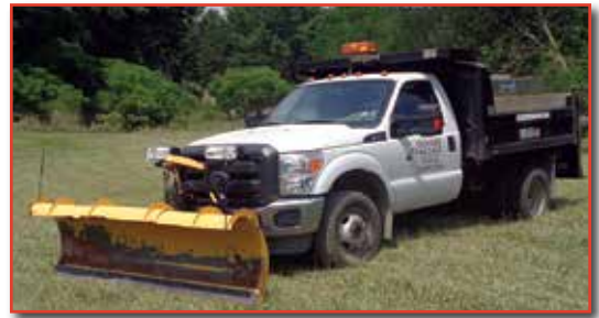
'13 FORD F-350XL 4X4