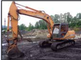
'05 CASE CX160

2005 CASE Model CX160 Hydraulic Excavator , s/n DAC162050, powered by Case 4 cylinder diesel engine and hydraulic drive, equipped with 8'6" dipper stick, Case 36" digging bucket, auxiliary hydraulics, Esco manual thumb attachment, enclosed ROPS cab with heat, and 24" TBG pads. In good condition with good undercarriage.