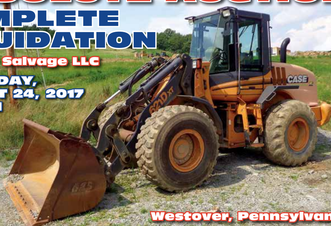
'06 CASE 621DXT