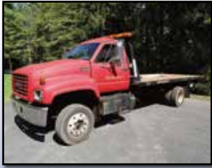
'01 GMC C6500 ROLLBACK

2001 GMC Model C6500 Single Axle Rollback , powered by Cat 3126 7.2L 246 HP diesel engine and 6 speed transmission, equipped with Jerr-Dan 18' rollback with Ramsey winch, 10,000 lb. deck capacity, wood floor, caution light bar, aluminum wheels, spring suspension, hydraulic brakes, air conditioning, and 23,100 lb. GVWR. In good condition with good to very good tires. (051,729 Original Miles)