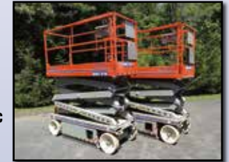
'08 AND '07 SKYJACK 20'

2008 SKYJACK Model SJIII 3220 DC Electric Scissor Lift, s/n 60000843, powered by 24 volt system and hydrostatic transmission, equipped with 20' platform height, 7'-10' extending platform with electric tool outlets, 900 lb. platform capacity, pothole protection package, and non-marking solid tires. In good condition with good tires.