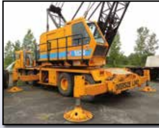
'02 AMERICAN 75 TON

2002 AMERICAN Model 5530, 75 Ton Conventional Truck Crane, s/n 0204AD10040 (Rebuilt), powered by Cummins 6TC5-3-C diesel engine and Twin Disc 3-stage torque convertor, equipped with 160' model 47H pin connected tubular boom consisting of 40' basic, (3) 30', (1) 20', and (1) 10' insert, 60' model 7HL jib, air controls, power down on (1) drum, PAT model E165 LMI, 26,500 lb. (3) piece counterweight, McKissick 75 ton 4-sheave and single sheave hook block, overhaul ball, and enclosed cab with air conditioning, mounted on 8x4x4 Carrier, powered by Detroit 6V-71 diesel engine and 5 speed transmission with 4 speed auxiliary, equipped with (4) hydraulic outriggers and 14.00R20 tires. In good condition with good tires. (Current OSHA Certification • Northwest has owned and operated this crane since complete rebuild • Last Job = August, 2015) (SOLD IN ABSENTIA-LOCATED IN PHILADELPHIA) (Contact Auction Company to Arrange Inspection)