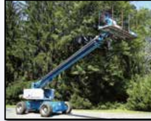
'97 GENIE 80' 4X4

1997 GENIE Model S-80, 4x4 Aerial Lift, s/n 457, powered by Deutz diesel engine and hydrostatic transmission, equipped with 80' 3-section telescopic boom, 8'x3' self leveling and rotating platform with electric tool outlet, extending front and rear axles, and 15-22.5 tires. In good to very good condition with good to very good tires.