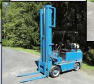
'86 CLARK 8,000 LB

1986 CLARK Model C500-S80, 8,000 lb. Cushion Tired Forklift, s/n 685-0162-5955FA, powered by LP gas engine and shuttle transmission, equipped with 123" 3-stage mast, 42" forks, 10'5" retracted height, and FOPS canopy. In fair to good condition with fair to good tires.