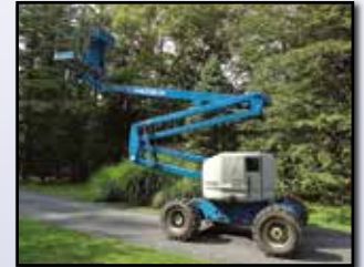
'01 GENIE 45' 4X4

2001 GENIE Model Z-45/25, 4x4 Aerial Lift, s/n Z4525-17225, powered by Deutz diesel engine and hydrostatic transmission, equipped with 45' articulated boom, 25' horizontal reach, 6'x13' self leveling and rotating platform with electric tool outlets, zero tail swing, and 14-17.5 tires. In good condition with good tires.