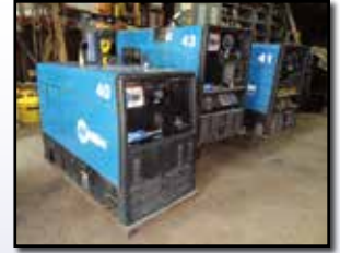
(3) OF (6) MILLER TRAILBLAZERS

2004 MILLER Trailblazer 300 Amp DC CC/CV, AC/DC Welder/10,000 Watt Generator , s/n LE184635, gas powered