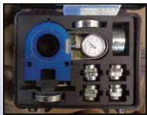
BOLT TENSION CALIBRATOR

Electric Impact Wrenches • 1" & 3/4" Impact Sockets • (10+/-) Sawsalls • MILWAUKEE Right Angle Drill • BOSCH 1530, 14 Gauge Electric Nibbler • (3) Electric Sheet Metal Shears • MILWAUKEE Angle Grinder • (6) Rigid 48" & 36" Pipe Wrenches