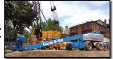
'99 GENIE 80' 4X4

1999 GENIE Model S-80, 4x4 Aerial Lift, s/n 1249, powered by Deutz diesel and hydrostatic transmission, equipped with 80' 3-section telescopic boom, 8'x3' self leveling and rotating platform with electric tool outlet, extending front and rear axles, and 15-22.5 tires. In good condition with good tires.