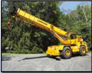
'81 LORAIN 27.5 TON

1981 LORAIN Model LRT-275, 27.5 Ton Hydraulic Rough Terrain Crane, s/n 90002, powered by Detroit 6V-53 diesel engine and powershift transmission, equipped with 32'-81' (3) section telescopic boom, 32'-49' telescopic swing away jib, auxiliary winch, Crane Smart System LMI and ATB, (4) hydraulic outriggers, 27.5 ton 3-sheave hook block and overhaul ball, and 23.5x25 tires. In good condition with good tires. (Current OSHA Certification) (Rebuilt With New Cab)