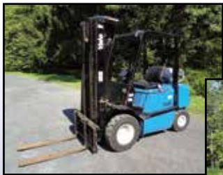
'95 YALE 5,000 LB

1995 YALE 5,000 lb. Cushion Tired Forklift, s/n B177B078195, powered by LP gas engine and shuttle transmission, equipped with 252" 3-stage mast, side shift, 42" forks, and FOPS canopy. In good condition with good tires. (Reserved For Use During Loadout thru Thursday, 9/24/15 @ Noon)