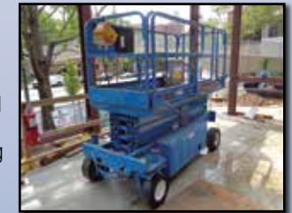
'96 JLG 20'

1996 JLG Model CM2033 Commander DC Electric Scissor Lift, s/n 0200025082, powered by 24 volt system and hydrostatic transmission, equipped with 20' platform height, 8'-11' extending platform with electric tool outlet, 750 lb. platform capacity, and solid tires. In good condition with good tires. (No Pothole Protection)