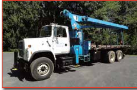
'96 MANITEX 17 TON