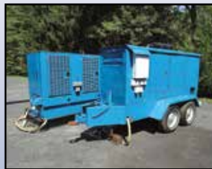
'99 ONAN 60KW & '90 WINCO 100KW

1999 ONAN Model 60DGC8 Skid Mounted Generator , s/n A990849461, powered by Cummins 4BT3.9-G4 diesel engine, equipped with 3-phase standby rating 60KW/75KVA, single phase rating 40.2 KW/KVA. In good condition.