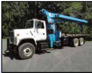
'96 MANITEX 17 TON

T&S EQUIPMENT CO. Crane Pallet Forks, 43" Forks, s/n 5232615