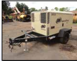
'11 IR 375CFM

2011 INGERSOLL-RAND/DOOSAN Model XP375WJD-T3, 375CFM Portable Air Compressor , s/n 425579UDVC48, powered by John Deere diesel engine, equipped with 125PSI operating pressure, electric brakes, pintle tow, galvanized steel enclosure, with 225/75R15 tires. In very good condition with very good tires. (0,776 Hours) (SALES TAX) (ELEMENT)