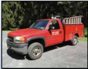
'01 GMC 2500HD

2001 GMC Model 2500HD Utility Truck , powered by Vortec 6.0L gas engine and automatic transmission, equipped with Stahl 8' open utility body with material rack, air conditioning, power windows and locks, and 245/75R16 tires. In good condition with good tires.