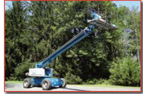
(1) OF (2) GENIE 80' 4X4