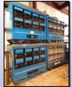
MILLER 8-PACK WELDERS

1996 MILLER Mark IV Express 4-Pack Multiple Operator , 200 Amp Constant Current DC Welding Power Source, s/n KG123716