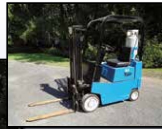
'97 YALE 2,000 LB

1997 YALE 2,000 lb. Solid Tired Forklift, s/n P309389, powered by LP gas engine and shuttle transmission, equipped with 106" 2-stage mast, 36" forks, and FOPS canopy. In good condition with good tires. (Reserved For Use During Loadout thru Thursday, 9/24/15 @ Noon)