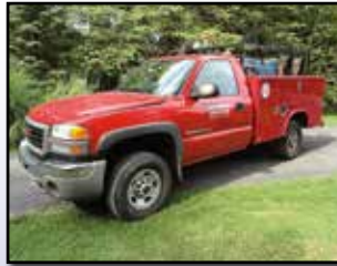
'04 GMC 2500HD

2004 GMC Model 2500HD Utility Truck , powered by Vortec 6.0L gas engine and automatic transmission, equipped with Reading 8' open utility body with material rack, tow package, air conditioning, and 245/75R16 tires. In good condition with good tires.