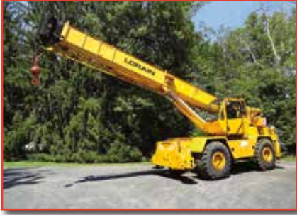
'81 LORAIN 27.5 TON