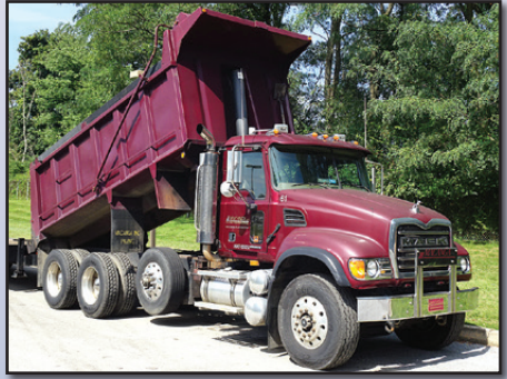
`06 MACK GRANITE CV713

2006 MACK Model Granite CV713 Tri-Axle Dump Truck, powered by Mack Al-427, 427HP diesel engine and Allison automatic transmission, equipped with Beau-Roc 17'6" heated steel dump body with bed vibrator, electric tarp, and single chute, 46,000# rears, 18,000# front axle, 20.000# lift axle. double frame. 2-stage engine brake, tow package with