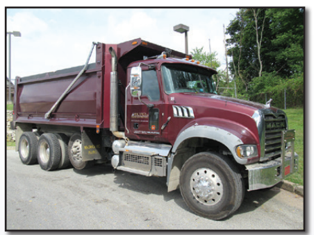
18 MACK GRANITE GU713

camelback suspension, aluminum wheels, power windows and locks, power heated mirrors, cruise control, air conditioning, 315/80R22.5 front and lift tires, and 11R24.5 rear tires. In very good condition with good tires. (Odometer Reads 57.653 Miles) (Meter Reads 4.743 Hours) (Purchased New)