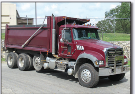
`15 MACK GRANITE GU713

camelback suspension, aluminum wheels, power windows and locks, power heated mirrors, cruise control, air conditioning, 315/80R22.5 front and lift tires, and 11R24.5 rear tires. In very good condition with good tires. (Odometer Reads 57.653 Miles) (Meter Reads 4.743 Hours) (Purchased New)