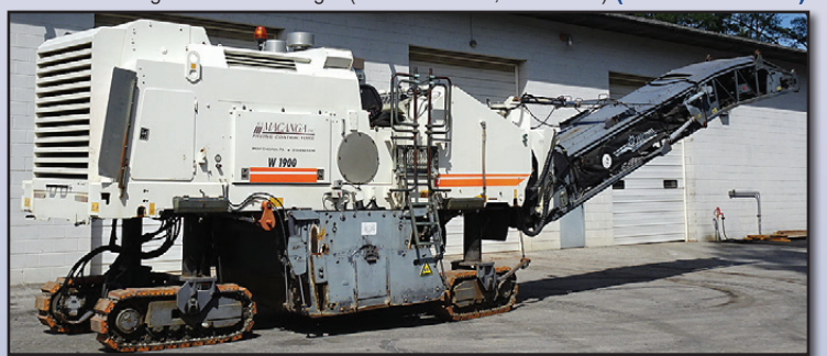
05 WIRTGEN W1900

2019 WEILER Model P385B Crawler Asphalt Paver. s/n HJB002701. powered by Cat C3.4B diesel engine and 3 speed hydrostatic transmission, equipped with 8' - 15' 8" electric heated vibratory screed, dual operator positions, Topcon grade control ready, and manual crown control. In good to very good condition with good undercarriage. (Meter Reads 1,545 Hours) (Purchased New)