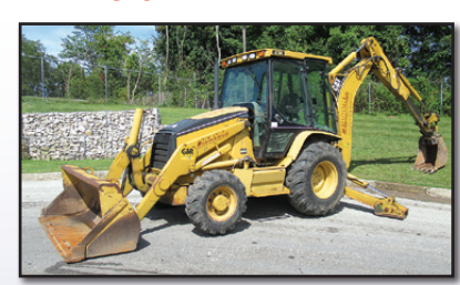
04 CAT 420D 4X4 E-H0E

digging bucket, enclosed ROPS cab with heat, 12-16.5 front and 19.5-24 rear tires. In good condition with fair front and very good rear tires. (Meter Reads 8,837 Hours) (Purchased New) 36" and 18" Digging Buckets (Cat 420) • 36", 18", and 12" Digging Buckets