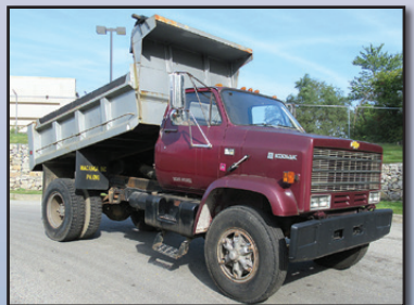
`86 CHEVY KODIAK 70

utility box, dual rear wheels, tow package, power windows, locks, and mirrors, cruise control, air conditioning, and 225/70R19.5 tires. In good condition with good tires. (Odometer Reads 42,398 Miles) (Purchased New)