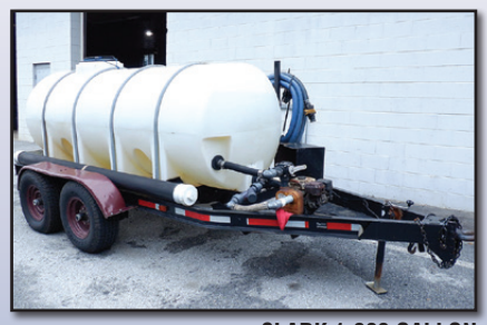
CLARK 1,000 GALLON

TOWMOTOR Solid Tired Forklift, powered by 4