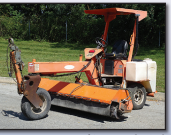
07 LAY-MOR 8HC

12' all hydraulic moldboard, front scarifier (no teeth), and enclosed ROPS cab.