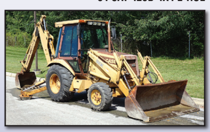
90 CASE 580K 4X4 E-HOE