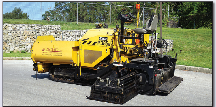
19 WEILER P385B

2017 VOLVO Model PF4410 Crawler Asphalt Paver, s/n 6378085, powered by Deutz TCD-2013, 158HP diesel engine and hydraulic drive, equipped with Ultimat 8/16, 8' – 16' electric heated vibratory screed, s/n 1123, (4) 1' heated extensions, power crown controls, Topcon ready, rear work lights, and (2) screed extension remote control sets. In very good condition with good undercarriage. (Meter Reads 01,085 Hours) (Purchased New)