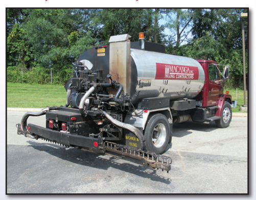
02 ROSCO MAXIMIZER ON FREIGHTLINER FL70

2002 FREIGHTLINER Model FL70 Single Axle Distributor Truck, powered by Cummins 5.9L. 205HP diesel engine and 5 speed transmission with 2 speed rear, equipped with 2002 ROSCO Maximizer 1,900 gallon hydrostatic distributor body, s/n 38127, upper and lower burners, 8' - 16'hydraulic positioning rear spray bar, Roscoe EZ-3S cab controls, spring suspension, aluminum wheels, 23,000 lb