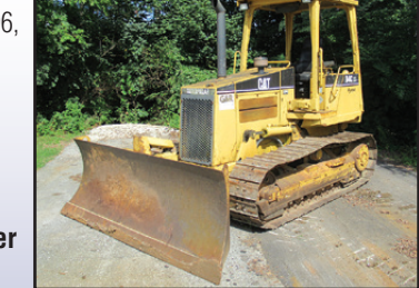
00 CAT D4CXL SERIES III

2000 CATERPILLAR Model D4CXL. Series III Crawler Tractor, s/n 8CS00996 powered by Cat 3046 diesel engine and hydrostatic transmission, equipped with 6-way straight blade, ROPS canopy with heat, tow pin, and 18" SBG pads. In good condition with good undercarriage. (Meter Reads 06,093 Hours) (Purchased New) 1979 KOMATSU Model D57S-1 Crawler Loader, s/n 07547, powered by Komatsu diesel engine and powershift transmission,