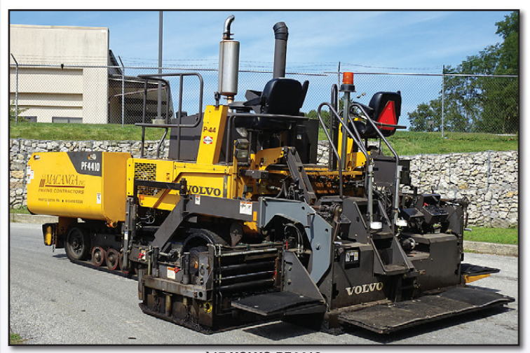
17 VOLVO PF4410

2017 VOLVO Model PF4410 Crawler Asphalt Paver, s/n 6378085, powered by Deutz TCD-2013, 158HP diesel engine and hydraulic drive, equipped with Ultimat 8/16, 8' – 16' electric heated vibratory screed, s/n 1123, (4) 1' heated extensions, power crown controls, Topcon ready, rear work lights, and (2) screed extension remote control sets. In very good condition with good undercarriage. (Meter Reads 01,085 Hours) (Purchased New)