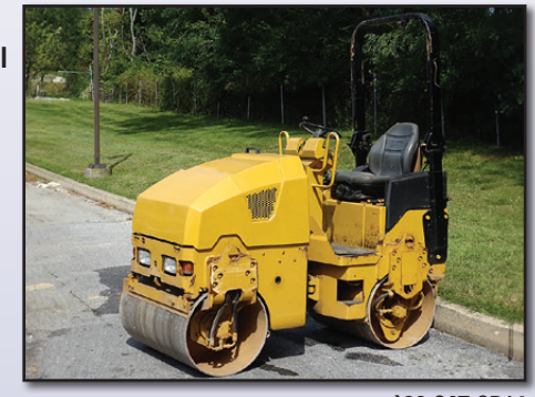
08 CAT CB14

2008 CATERPILLAR Model CB14 Vibratory Tandem Roller, s/n DST00230, powered by Cat C1.1 diesel engine and hydrostatic transmission, equipped with 35" front and 31" rear smooth drums, water system, and folding ROPS post. In good condition. (Meter Reads 874 Hours - Replaced @ 2,597 Hours) (Purchased New)