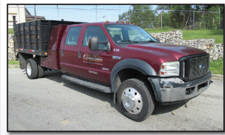
`06 FORD F-550XLT

2006 FORD Model F-550XLT Super Duty Crew Cab Stake Body