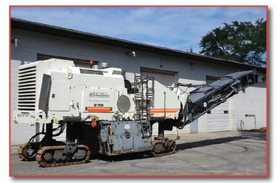
`05 WIRTGEN W1900