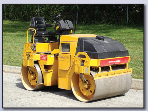
98 DYNAPAC CC122 12 SERIES

1998 DYNAPAC Model CC122, 12 Series Vibratory Tandem Roller.