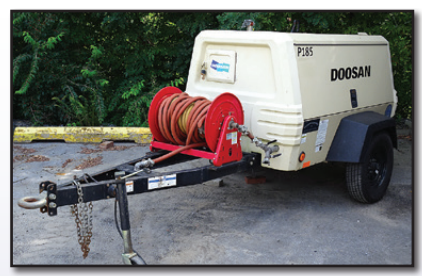
16 DOOSAN 185CFM

185CFM Portable Air Compressor, s/n 130789U82957, powered by JD diesel engine. In fair condition. (Meter Reads 3,065 Hours) (Not Running)