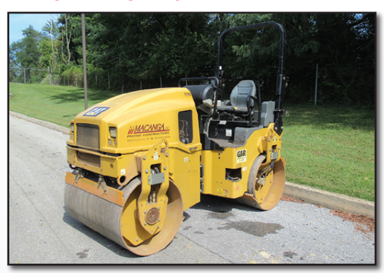
15 CAT CB34B

2015 CATERPILLAR Model CB34B Vibratory Tandem Roller, s/n 42300278, powered by Cat C2.2 diesel engine and hydrostatic transmission, equipped with 50.5" smooth drums, drum selector. water system, and folding ROPS post. In good condition. (Meter Reads 2,988 Hours) (Purchased New)