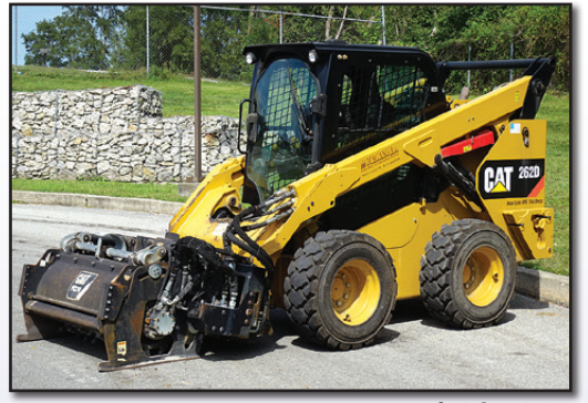
16 CAT 262D (MILLING ATTACHMENT SOLD SEPARATELY)

s/n DTB04840, powered by Cat 3.3B diesel engine and 2 speed hydrostatic transmission, equipped with Cat 74" general purpose loader bucket with bolt-on cutting edge, hydraulic coupler, high flow XPS auxiliary hydraulics, 9-pin electrics, enclosed ROPS cab with air conditioning.