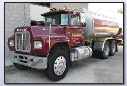
79 MACK R686ST

1979 MACK Model R686ST Tandem Axle Water Truck, powered by Mack ENDT-676, 283HP diesel engine and 5 speed transmission, equipped with 2,900 gallon aluminum tank, Honda 2" centrifugal pump, hose reel, Mack camelback suspension, Jacobs engine brake, aluminum front wheels, and