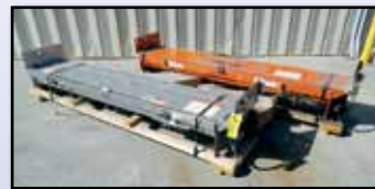
(2) OF (12) SWENSON TAILGATE SPREADERS - UNUSED

SWENSON STCC Under Tailgate Hydraulic Cross Conveyor Spreader 14" rubber conveyor, 102" wide, and tail light package • (5) SWENSON SBD-9S, Stainless Steel Hydraulic, 96" length • SWENSON SAG-SS Stainless Steel Hydraulic, 96" length • (4) SWENSON SAG Steel Hydraulic, 96" length • (2) SWENSON SIDS 304SS Stainless Steel, 96" length • SNOWEX SP-2200 V-Maxx Poly Electric, 96" length • (2) SNOWEX SP-2400 V-Maxx Poly Electric, 84" length