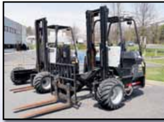
(2) OF (3) PALFINGER PIGGYBACKS

Forklift Attachments: Fork Rotator • Truss Boom • Fork Extensions