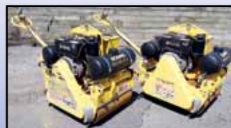
'04 BOMAG BW65S-2

2004 BOMAG BW65S-2 Walk-Behind Vibratory Roller , s/n 101100012040, powered by Hatz diesel engine, equipped with 25.5" smooth drum and water system. In good condition.