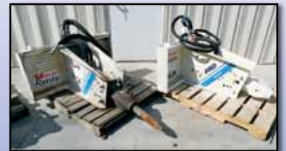
(2) KENT KF5 - ONE UNUSED

BRADCO 611 Backhoe Attachment , s/n 8611X5907, 18" bucket, operators seat, and outriggers • 2010 KENT KF5 Demolition Hammer s/n 9620 (UNUSED) • 2008 KENT KF5 Demolition Hammer s/n 9300-1 Additional Attachments To Include: Brooms • Grapples • Post Hole Diggers • Buckets • Steel Tracks • Tires