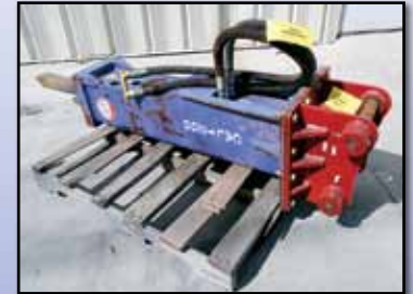
'00 CAL 1200

2005 KOBELCO SK35SR-3 Mini Excavator , s/n PX1211494, powered by Yanmar diesel engine and hydraulic drive, equipped with 4'4" dipper stick with hydraulic beyond, swing boom, zero tailswing, backfill blade, ROPS canopy, and 12" rubber tracks. In good condition with good undercarriage.