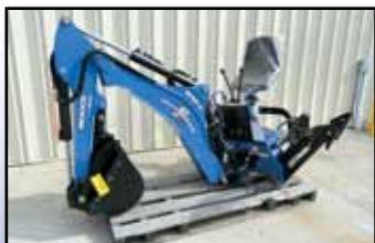
(1) OF (2) BACKHOE ATTACHMENTS - UNUSED

Utility Tractor and 3-Point Hitch: WOODS BH80X Backhoe Attachment, 8' reach, 16" bucket with mechanical thumb, operators seat, and outriggers (UNUSED) • NEW HOLLAND 910GH Backhoe Attachment, 12" bucket, outriggers, frame mount (UNUSED) • US MOWER FM270A Front Mount Knuckleboom Mower (No Mower Deck) • (2) WOODS BSE4 4' Box Scraper, with scarifier kit (UNUSED) • LANDPRIDE PD25 Post Hole Digger (UNUSED) • LANDPRIDE PD15 Post Hole Digger (UNUSED) • LANDPRIDE (2) 18" & 12" Auger Bits (UNUSED) • FFC LAF3505 Soil Preparator • WOODS LRC60 60' Landscape Rake • Tires with Rims (UNUSED) Loader, Excavator, and Skid Steer: 4-In-1 Buckets • GP Loader Buckets • Moldboard Blades • Fork Attachments • Quick Couplers • Various Size Digging Buckets