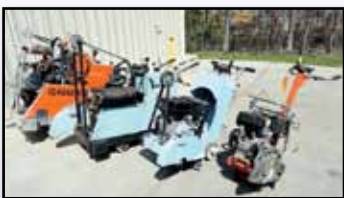
(4) OF (16) CONCRETE SAWS

Concrete Saws: HUSQVARNA FS3500G 26", 35HP gas, hydrostatic • STONE CSP3 20 20", 20HP gas, hydrostatic • (2) TARGET ECII 24H 20", Honda 24HP, hydrostatic • (5) HUSQVARNA FS 513 18", Honda 13HP, hydrostatic (Some UNUSED) • TARGET PACIV 18", Honda 13HP, hydrostatic • (2) TARGET PC18 18", Honda 13HP • 2010 EDCO SK14 14", Honda 13HP (UNUSED) • HUSQVARNA FS309 14", Honda 9HP • (2) STONE CS1 14 14", Honda 13HP • PLUS Qty of UNUSED and Used Diamond Saw Blades (various sizes)