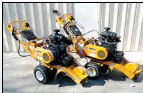
(2) UNUSED OF (5) BANDIT HB20SP

Stump Grinders: (3) 2010 BANDIT HB20SP Walk-Behind, Kohler 27HP, hydrostatic (UNUSED and Used) • 2009 BANDIT HB20SP Walk-Behind, Kohler 27HP, hydrostatic • 2008 BANDIT HB20SP Walk-Behind, Kohler 27HP, hydrostatic