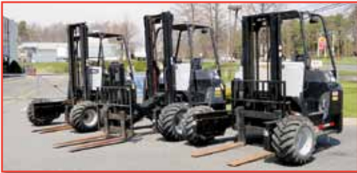
PALFINGER PIGGYBACK FORKLIFTS

Wednesday, May 25, 2011 - 9:00 AM Farmingdale, New Jersey