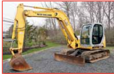
'07 NEW HOLLAND E80MSR MIDI