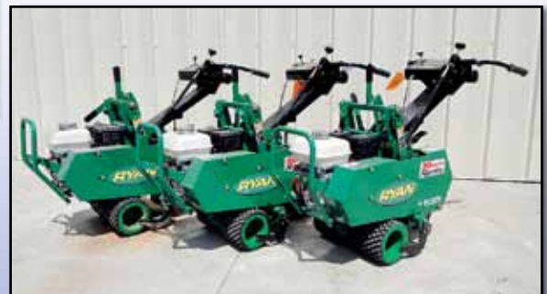
3 OF 10 RYAN JR SOD CUTTERS - UNUSED

UNUSED STIHL Landscape Tools; String Trimmers; Chain Saws; Hedge Clippers