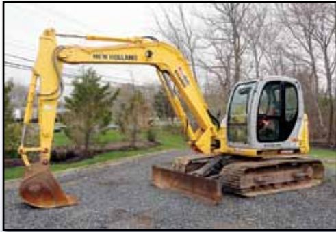
'07 NEW HOLLAND E80MSR

2007 NEW HOLLAND E80MSR Midi Excavator , s/n N7TA18103, powered by Isuzu diesel engine and hydraulic drive, equipped with 6'9" dipper stick with hydraulic beyond, 24" digging bucket, 8'2" backfill blade, swing boom, zero tailswing, enclosed ROPS cab with air conditioning, 23.5 TBG pads, and 9'4" crawlers. In good to very good condition with good to very good undercarriage. (0,425 Hours)