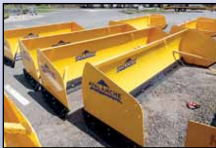
AVALANCHE SNOW PUSHERS

V-Box Spreaders (UNUSED): (2) SWENSON EV100-1050, 10' Hydraulic, 5.5 cu yd • (2) SWENSON MDV944EST, 9' Steel, 3.0 to 4.5 cu yd, B&S 10.5HP • (7) SWENSON PV358ESTS, 8' Stainless Steel, 1.8 to 2.0 cu yd, B&S 10.5HP • (2) SNOWEX SP-9500 V-Maxx 9' Poly, control package, 4.0 cu yd, electric 12V DC • (3) SNOWEX SP-7550 V-Maxx 6' Poly, control package, 1.4 cu yd, electric 12V DC • (2) SNOWEX SP-6000 Vee Pro 4' Poly, control package, 1.0 cu yd, electric 12V DC