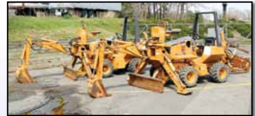
'02 AND '01 CASE 460

Combination Trencher/Backhoe , s/n JAF0348262, powered by Kubota 35HP diesel engine and hydrostatic transmission, equipped with Case D100 backhoe attachment with outriggers, 5' trencher bar with dirt chain, 60" 6-way backfill blade, 4-wheel drive, 4-wheel steer, ROPS post, and 26x12-12 tires. In good condition with good tires. (1,239 Hours)