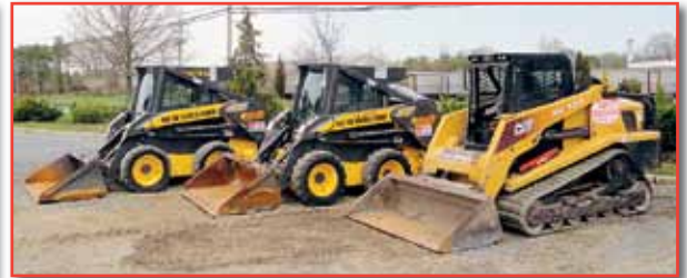
(3) OF (4) SKID STEERS