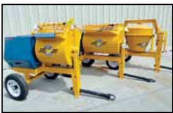
UNUSED STONE MIXERS

Concrete Saws: HUSQVARNA FS3500G 26", 35HP gas, hydrostatic • STONE CSP3 20 20", 20HP gas, hydrostatic • (2) TARGET ECII 24H 20", Honda 24HP, hydrostatic • (5) HUSQVARNA FS 513 18", Honda 13HP, hydrostatic (Some UNUSED) • TARGET PACIV 18", Honda 13HP, hydrostatic • (2) TARGET PC18 18", Honda 13HP • 2010 EDCO SK14 14", Honda 13HP (UNUSED) • HUSQVARNA FS309 14", Honda 9HP • (2) STONE CS1 14 14", Honda 13HP • PLUS Qty of UNUSED and Used Diamond Saw Blades (various sizes)