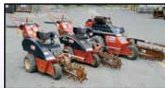
'07 DITCH WITCH 1820 AND 1030

2007 DITCH WITCH 1820 Walk Behind Trencher , s/n CMW182HEH70000877, powered by Honda 18HP gas engine and hydrostatic transmission, equipped with 36"x6" trencher bar and rock chain. In good condition. (226 Hours)