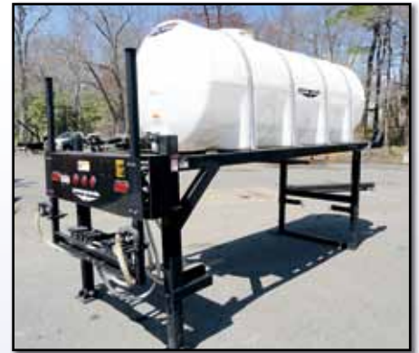
SWENSON 1,000 GALLON BRINE SPRAY SYSTEM - UNUSED

SWENSON DI-ICER Brine Spray System, 1,000 gallon poly tank, electric pump, spray bar, mounted on 12' steel frame with stand • SWENSON EVRGHSS Stainless Steel Gas Powered Hydraulic Power Pack • SWENSON EVRGH Gas Powered Hydraulic Power Pack • SWENSON LSSHV-SS Pre-Wet Spray System, (2) 135 gallon tanks • SNOWEX PWS-175 75 Gallon Pre-Wetting/Anti Icing Sprayer System