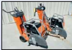
UNUSED HUSQVARNA FS513

Concrete Core Drills with Vacuum Pumps and Stands: DEWALT DW195 • DEWALT DW194 • MILWAUKEE 4096 • BLACK & DECKER 748 • DEWALT • (2) MILWAUKEE • PLUS Qty of UNUSED and Used Diamond Core Drill Bits (various sizes)