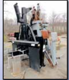
STEELMASTER BLOCK UN-LOADERS

2005 STEELMASTER 6000-25TC 3-Stage Telescopic Brick/Block Boom Un-Loader , s/n 222051664 3-stage hydraulic telescopic boom, 6,000# capacity @ 20', 5,000# @ 26', 430° limited rotation, automatic constant hook level, and (2) hydraulic stabilizers. In good condition. (Unused/Un-Mounted-For Rear Truck Body Mount)