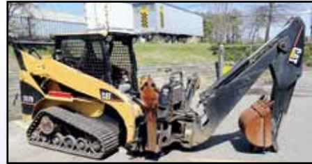
'05 CAT 257B (BACKHOE SOLD SEPARATELY)

2007 NEW HOLLAND L170 Skid Steer Loader , s/n N7M471536, powered by New Holland 53HP diesel engine and hydrostatic transmission, equipped with 66" low profile general purpose bucket, hydraulic quick connect, enclosed ROPS cab with heat, foot controls, and 10x16.5 tires. In good condition with good tires. (0,278 Hours) (Super Boom)