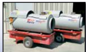
FROST FIGHTER 500,000 BTU HEATERS

(2) 2008 FROST FIGHTER IDF500 Indirect Fired 500,000 BTU Oil Fired Heating Units • GROUND SPECIALTIES THAW DAWG 18"x54" Ground Thaw Heater, propane • (5) SURE FLAME FN-20 20" Air Mover Floor Fan, 5,000 CFM • NATIONAL RIVERSIDE 150FAS Torpedo Heater