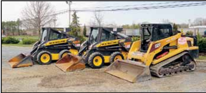
(3) OF (4) SKID STEERS

2007 NEW HOLLAND L175 Skid Steer Loader , s/n N7M470374, powered by New Holland 60HP diesel engine and hydrostatic transmission, equipped with 66" low profile general purpose bucket, hydraulic quick coupler, enclosed ROPS cab with heat and air conditioning, pilot controls, and 10x16.5 tires. In good condition with good tires. (0,474 Hours)