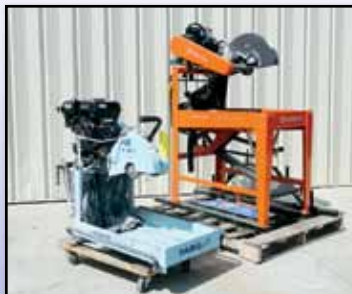
(2) OF (5) MASONRY BRICK-BLOCK SAWS

HUSQVARNA TS510, elect, 5HP, with stand (UNUSED) • (2) HUSQVARNA TS355, Honda gas, table mount (One UNUSED) • TARGET PS1455, Honda 5.5HP, table mount