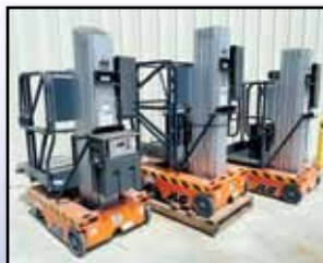
GENIE MATERIAL LIFTS - UNUSED

2007 GENIE IWP20S-DC 20' Electric Personnel Lift , 300# capacity s/n IWP07-7531 (UNUSED)