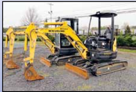
(2) OF (3) NEW HOLLAND E27B

2008 NEW HOLLAND E27B Mini Excavator , s/n N8TN41543, powered by Yanmar diesel engine and hydraulic drive, equipped with 44" dipper stick with hydraulic beyond, 12" digging bucket, swing boom, zero tailswing, 60" backfill blade, ROPS canopy, and 10" rubber tracks. In good to very good condition with good undercarriage. (0,271 Hours)