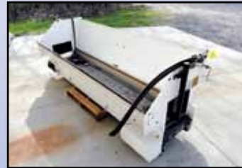
SWENSON STCC TAILGATE CONVEYOR SPREADER - UNUSED