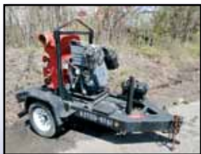
MULTIQUIP 6 INCH DIESEL TRASH PUMP

WB20X 2" Centrifugal Pump, gas • STOW CP210H 2" Centrifugal Pump, gas • (6) MULTIQUIP ST-2037 2" Submersible Pumps, elect, 2/3HP (UNUSED)