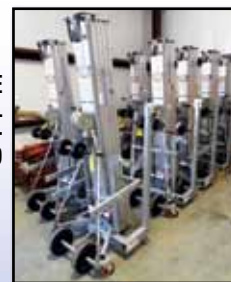
(3) OF (7) JLG STOCK PICKERS - UNUSED

Electric Stock Pickers (UNUSED): (6) JLG 15SP 15' • (1) JLG 12SP 12' Hand Crank Material Lifts (UNUSED): (5) GENIE SLC24, 24', 650# capacity • (5) GENIE SLC18, 18', 650# capacity • (3) GENIE GL-12, 12', 650# capacity • GENIE GL-10, 10', 350# capacity (Used) • GENIE HL4.5, 4.5', 650# capacity (Used)