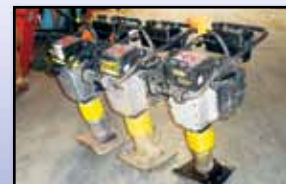
BOMAG FOOT COMPACTORS