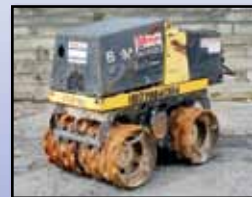
'04 BOMAG BMP851

2001 CASE 460 Combination Trencher/Backhoe , s/n JAF0348248, powered by Kubota 35HP diesel engine and hydrostatic transmission, equipped with Case D100 backhoe attachment with outriggers, 5' trencher bar with dirt chain, 60" 6-way backfill blade, 4-wheel drive, 4-wheel steer, ROPS post, and 26x12-12 tires. In good condition with good tires. (0,950 Hours)