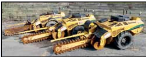
(2) '10 AND '04 VERMEER RT-200

2010 VERMEER RT-200 Walk Behind Trencher , s/n 1VRX081FXA1001622, powered by Kohler 23HP gas engine and hydrostatic transmission, equipped with 36"x6" trencher bar and rock chain. In very good condition. (52 Hours)