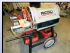
RIDGID 1224 PIPE THREADER

RIDGID 1224 Pipe Threader, 1/2"-4", with stand • RIDGID 700 Pipe Threader Power Drive • RIDGID R12 Pipe Threader Dies • (4) BOMAG BT60/4 Foot Compactors • (4) JET 206 Pneumatic Backfill Tampers • (2) APT 5240 90# Pneumatic Breakers • APT 5235 60# Pneumatic Breaker • APT 17529 Pneumatic Chipping Hammer • JET CD30 Pneumatic Clay Digger • Rotary Hammer Drills • Demo Saws • 9" Grinders • Manhole Blower • SCOTLAND GA72CD Digital Magnetic Locator