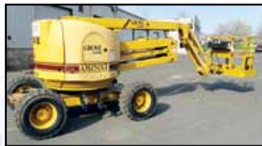
'98 GROVE AMZ51XT

1998 GROVE AMZ51XT 45' Aerial Lift , s/n 46901, powered by Ford dual fuel gas/LP engine and hydrostatic transmission, equipped with 4WD, 45' articulated boom, 500# 2-man rotating basket, and 12x16.5 tires. In good condition with good tires. (1,695 Hours)