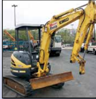
'05 KOBELCO SK35SR-3

2007 NEW HOLLAND E27SR Mini Excavator , s/n N7TN41408, powered by Yanmar diesel engine and hydraulic drive, equipped with 44" dipper stick with hydraulic beyond, 24" digging bucket, sing boom, zero tailswing, 60" backfill blade, enclosed ROPS cab, and 10" rubber tracks. In good to very good condition with good undercarriage. (0,256 Hours)