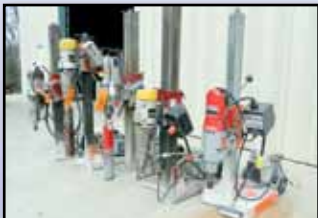
CONCRETE CORE DRILLS

Concrete Core Drills with Vacuum Pumps and Stands: DEWALT DW195 • DEWALT DW194 • MILWAUKEE 4096 • BLACK & DECKER 748 • DEWALT • (2) MILWAUKEE • PLUS Qty of UNUSED and Used Diamond Core Drill Bits (various sizes)