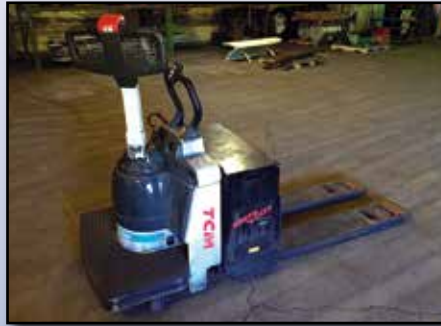
'14 TCM 6,000LB WITH CHARGER

2014 TCM TCM-ER60, 6,000 lb Walkie/Rider Forklift , s/n 2W26-9317747, 24 volt battery, with charger. In good condition. (415 Hours)