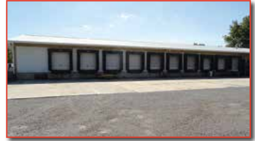
2.54 ACRES WITH COLD STORAGE