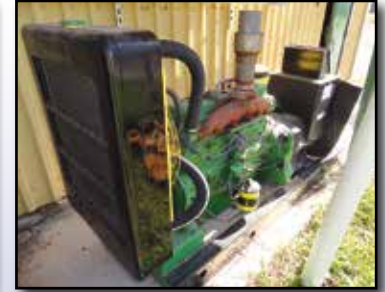
KOHLER 60KW GENERATOR

QUINCY 15HP Horizontal Air Compressor, 3-phase • DEVAIR 15HP Horizontal Air Compressor, 3-phase • KOHLER 60KW Skid Mounted Generator, 6 cylinder natural gas engine (New Generator End of 2013-Never Uses) (480/3-Phase Voltage) • REZNOR Waste Oil Heater, with (2) 275 gallon tanks • JOHN DEERE Hydro 185 Lawn Tractor, Kawasaki gas, hydrostatic, 46" mower deck • (3) String Trimmers • (2) 8'x40' Storage Containers (1 Wired with Electric and Lights)