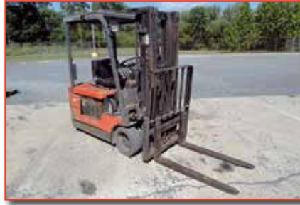
(1) OF (2) TOYOTA 3,000LB