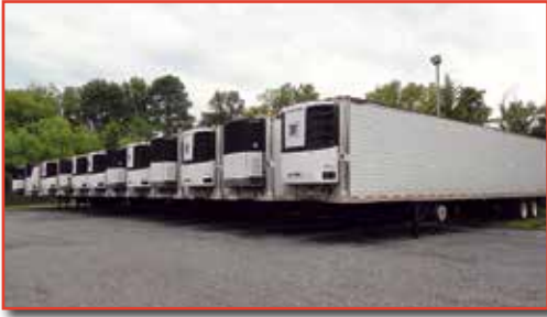
(12) GREAT DANE REEFERS