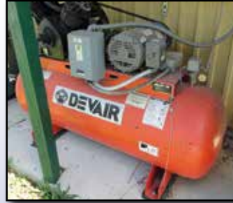
(1) OF (2) AIR COMPRESSORS