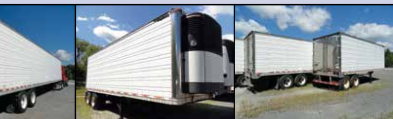
GREAT DANE '01 GREAT DANE 28' PUP GREAT DANE 28' AND 40'

2001 GREAT DANE 28'x96" Tandem Axle Reefer Trailer , Carrier Ultra X2100 refer unit, Kubota diesel engine (7,708 hours), 50 gallon fuel tank, 90" inside opening, 12'6" overall height, solid aluminum floor, 22" wall scuff plated, lined and insulated, and 285/80R24.5 tires. In good condition with good tires. (New Front Axle; Brake Drums; Slack Adjusters; Cams and Bushings; Air Bags and Shocks; Rear Bumper – 1 Year Ago)