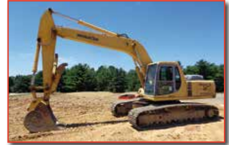
'01 KOMATSU PC220LC-6LE