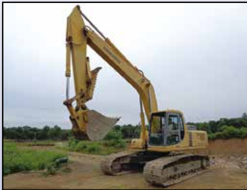
'01 KOMATSU PC220LC-6LE

s/n A85221, powered by Cummins 5.9L diesel engine and hydraulic drive, equipped with 10' dipper stick, CP 48" digging bucket, 24" mechanical thumb, enclosed ROPS cab with heat and air conditioning, and 31.5" TBG pads. In good condition with fair to good undercarriage.