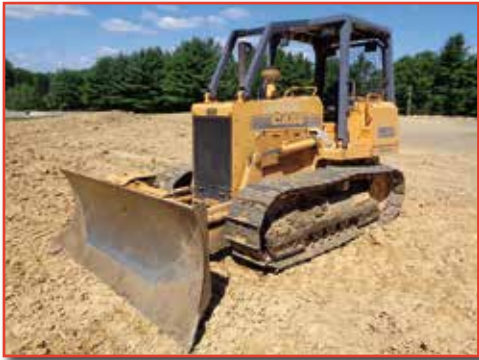
'97 CASE 850G

PRE-SORTED FIRST CLASS MAIL US POSTAGE PAID HAVERTOWN, PA PERMIT #45