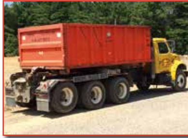
'95 IHC 4900 HOOK-LIFT

1440 COWPATH RD. • HATFIELD, PA 19440 215/361-9099 • Fax: 215/361-9212 www.hunyady.com