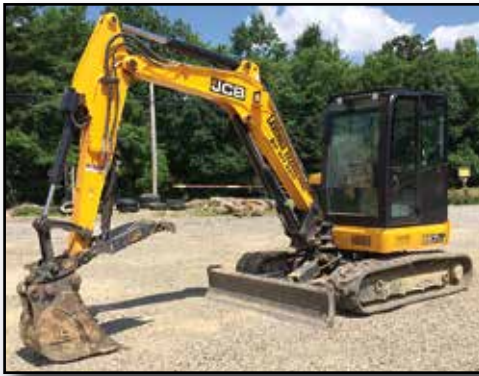
'17 JCB 57C-1

2017 JCB Model 57C-1 Mini Hydraulic Excavator , s/n 1HH1926661, powered by Kohler 3 cylinder diesel engine and hydraulic drive, equipped with 6' dipper stick, WB 18" digging bucket, 78" backfill blade, WB manual coupler, auxiliary hi-flow hydraulics, WB 14" hydraulic thumb, swing boom, electronic pattern control, enclosed ROPS cab with heat and