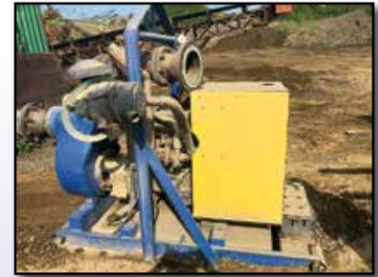
GORMAN RUPP 8 INCH PUMP

GORMAN RUPP 8" Skid Mounted Centrifugal Pump , diesel engine • INGERSOLL RAND 2340, 2-Stage, 5HP Electric Shop Air Compressor • Tire Machine • JET HVBS-7MW Portable Metal Cutting Band Saw • BIG JOE PDI24-T09 Electric Pallet Jack • LIFT-RITE 6,000# Hydraulic Pallet Jack • RYOBI 300 PSI Portable Gas Powered Pressure Washer • JET JDP-17MF Electric Drill Press • 100# Sandblast Pressure Pot • 2-Ton Portable Engine Hoist • Portable Engine Stand • P&H Bug Portable Welder , Onan 1 cylinder gas engine • 20-Ton Floor Jack • 20"x22" Plate Compactor, Honda 5HP gas engine • GENERAC 3500 Watt Portable Generator , 6.5HP gas engine • Oxygen Acetylene Torch Set, with cart (Bottles Not Included) • 12 Ton Hydraulic Pipe Bender • (4) Jack Stands • (5) Bottle Jacks • Small Quantity 18" and 24" Sonotube • INDUSTRIAL AIR 2-Stage Air Compressor , Honda 11HP gas engine • Tire Spreader • 44"x26" Steel Welding Bench, with vise • DEWALT DW705, 12" Electric Chop Saw , with stand • (2) Banding Carts • (2) Shop Vacs • (1 Pallet) Safe-T-Salt • Vertical Hydraulic Log Splitter (ram and power pack not viewed) • Pumps and Gas Motors (Parts) • FRETOTH 6"x9" Belt and Disc Sander • Electric Nibbler • Portable Hydraulic Log Splitter, Predator 212CC gas engine • Hitch Plate (Skid Steer) • (6) Scrap Bins