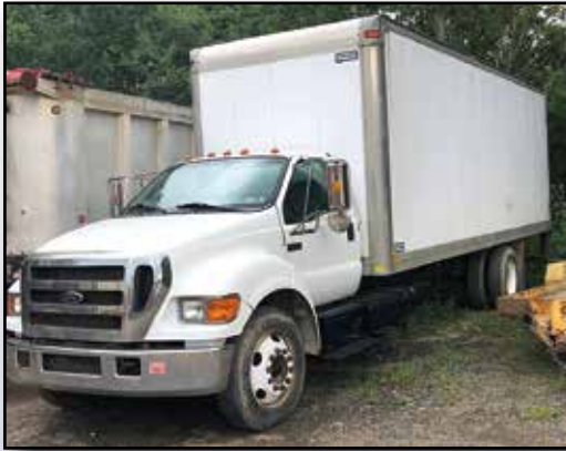
'04 FORD F-650XLT SINGLE AXLE

powered by Cat C-7 diesel engine and 7 speed transmission, equipped with 26' aluminum van body with rollup rear door, spring suspension, power windows and locks, heated mirrors, air conditioning, 26,000# GVWR, 245/75R22.5 front and 11.00R22.5 rear tires. In good condition with good tires.