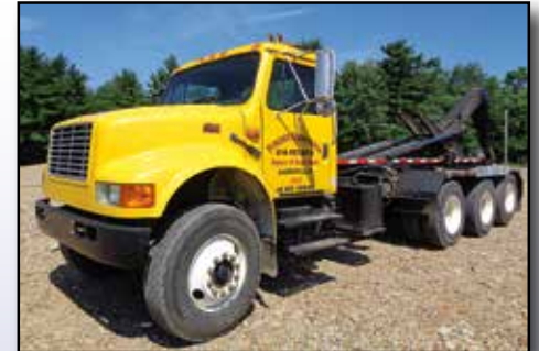
'95 IHC HOOK LIFT

1995 INTERNATIONAL Model 4900 Tri-Axle Hook-Lift Truck , powered by Int'l DT466, 250HP diesel engine and Fuller 8LL, 10 speed transmission, equipped with 20', 60,000# capacity hook-lift body, 40,000# rears, 13,600# front and 25,000# lift axle, pintle hitch with air and electric, and 11R22.5 tires. In good condition with good to very good tires. (Odometer Reads 107,505 Miles) (Flood Reconstructed Title)