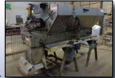
MEYER STAINLESS STEEL

MEYER M8164238 Stainless Steel Salt Spreader , s/n 0112-48750, Honda 1 cylinder gas engine • MEYER Electric Tailgate Spreader • BUYERS Salt Dogg Electric Salt Spreader • WESTERN Pro-Flo 2 Electric Salt Spreader • 8' Snow Pusher