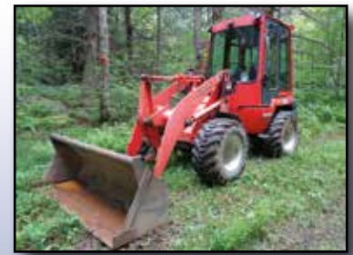
'14 KUBOTA R520ST

2014 KUBOTA Model R520ST Rubber Tired Loader , s/n R520S-21562, powered by Kubota diesel engine and hydrostatic transmission, equipped with general purpose loader bucket, hydraulic coupler, enclosed ROPS with heat, and 15.5/60-18 tires. In very good condition with very good tires. (Meter Reads 0,686 Hours) (48" Fork Attachment Sold Separately)