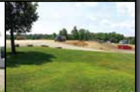
TWO TIER YARD