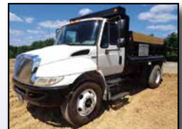
'09 IHC 4300 DURA STAR

2009 INTERNATIONAL 4300 Dura Star Single Axle Dump Truck , powered by Int'l Maxiforce DT diesel engine and Fuller 6 speed transmission, equipped with Godwin 300U, 12' steel dump body with chute, 21,000# rear and 12,000# front axle, 33,000# GVWR, pintle hitch with electric, double frame, heated mirrors, cruise control, air conditioning, and 11R22.5 tires. In good condition with good to very good tires.