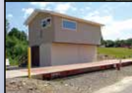
SCALE AND SCALE HOUSE