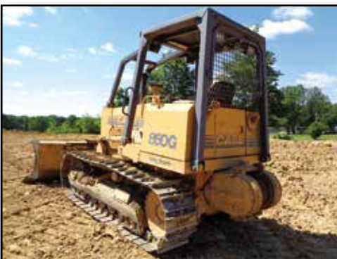
'97 CASE 850G

1997 CASE Model 850G Crawler Tractor , s/n JJG0253488, powered by Cummins 6 cylinder diesel engine and powershift transmission, equipped with 6-way blade, rear mounted winch, ROPS canopy with sweeps, and 18" SBG pads. In good condition with very good undercarriage. (Approximately 300 Hours on New Undercarriage)