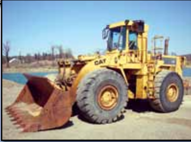
'89 CAT 980C

1987 CATERPILLAR Model 980C Rubber Tired Loader , s/n 63X07824, powered by Cat 3406 diesel engine and powershift transmission, equipped with general purpose loader bucket with bolt-on cutting edge, ROPS over enclosed cab, light package, air conditioning, and 26.5x25 tires. In good condition with good tires.