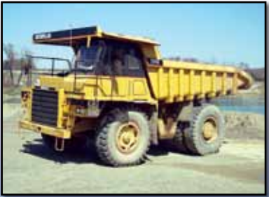
'81 CAT 769C

CATERPILLAR Model 769C Haul Truck , s/n 01X02319, powered by Cat 3408DITA diesel engine and powershift transmission, equipped with heated dump body, steel liner, supplemental steering, retarder, air conditioning, light package, and 18.00x33 tires. In good condition with good tires.