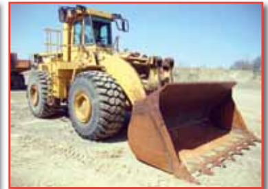
'94 CAT 980F