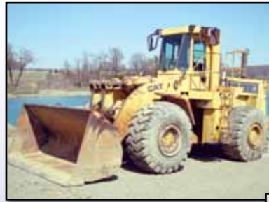
'87 CAT 980C

1994 CATERPILLAR Model 980F Rubber Tired Loader , s/n 8CJ01366, powered by Cat 3406 diesel engine and powershift transmission, equipped with general purpose loader bucket with teeth, ROPS over enclosed cab with air conditioning, joystick controls, and 29.5R25 tires. In good condition with very good tires.