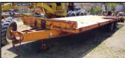
'92 ECONOLINE 12 TON