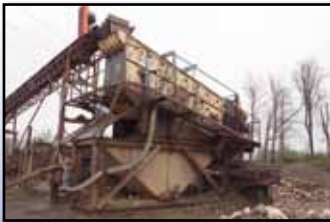
TYLER WET TOWER