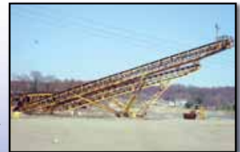
CONVEYORS #12 AND #11

(Conveyor #14) SMALIS 24"x60' Radial Stacker , 10HP electric motor, Dodge TXT3 gear reducer, oscillating wheels, swivel plate, catwalk, manual raise and lower. In good condition. With good tires.