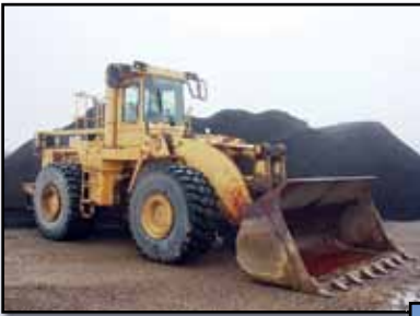
'94 CAT 980F

1994 CATERPILLAR Model 980F Rubber Tired Loader , s/n 8CJ01366, powered by Cat 3406 diesel engine and powershift transmission, equipped with general purpose loader bucket with teeth, ROPS over enclosed cab with air conditioning, joystick controls, and 29.5R25 tires. In good condition with very good tires.