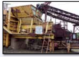
EAGLE CRUSHER AND ARMADILLO FEEDER

Crushing Tower Including: 11'x13' Feed Hopper , (Feed #2) ARMADILLO 44"x16' Vibrating Grizzly Feeder (6' bars) powered by 30HP electric motor, EAGLE 22"x36" Jaw Crusher powered by 50HP electric motor with starter box, (Conveyor #4) 36"x50' Channel Under Crusher Discharge Conveyor, 5HP and Barber Greene gear reducer, mounted on structural steel support. In good condition. (To Be Sold As A Unit) (Feed #1) Shopmade 10'x12' Feed Hopper with grizzly bars , equipped with 48"x20' belt feeder powered by 10HP electric motor, equipped with hydraulic gate, mounted on structural steel support tower. In fair to good condition.