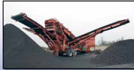
'95 EXTEC 5000

1995 EXTEC Model 5000 Portable Screening Plant , s/n 4028, powered by Deutz 4 cylinder diesel engine, equipped with 6'x12' feed hopper, hydraulic grizzly, 40"x34' feed conveyor, 4'6"x6'4" double deck screen, (2) 27"x32' folding side discharge conveyors, and 385/65R22.5 tires. In good condition with good tires.