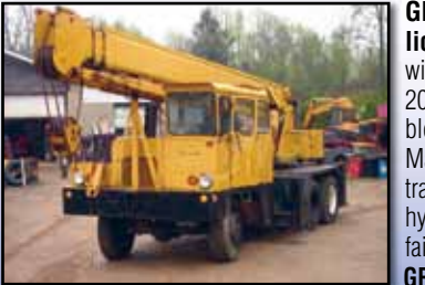
GROVE 15 TON

GROVE Model TD150, 15 Ton Hydraulic Truck Crane , s/n 672106, equipped with 3-section 24' to 60' telescopic boom, 20' A-frame folding jib, 3-sheave hook block, mounted on 6x6 carrier, powered by Mack 6 cylinder diesel engine and 3 speed transmission with 2 speed auxiliary, (4) hydraulic outriggers, and 10.00x20 tires. In fair condition with fair tires.