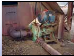
6' X 7' SLURRY PUMP

(Screen #1) 1993 TYLER Ty Rocket 5'x16' 3-Deck Inclined Vibrating Wet Screen , s/n 50-3365, powered by 25HP electric motor, equipped with water manifold and spray bars, mounted on structural steel support tower with collecting tank. In good condition.