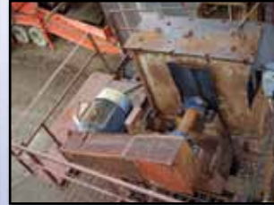
STEDMAN CAGE MILL

Crushing Tower Including: 11'x13' Feed Hopper , (Feed #2) ARMADILLO 44"x16' Vibrating Grizzly Feeder (6' bars) powered by 30HP electric motor, EAGLE 22"x36" Jaw Crusher powered by 50HP electric motor with starter box, (Conveyor #4) 36"x50' Channel Under Crusher Discharge Conveyor, 5HP and Barber Greene gear reducer, mounted on structural steel support. In good condition. (To Be Sold As A Unit) (Feed #1) Shopmade 10'x12' Feed Hopper with grizzly bars , equipped with 48"x20' belt feeder powered by 10HP electric motor, equipped with hydraulic gate, mounted on structural steel support tower. In fair to good condition.