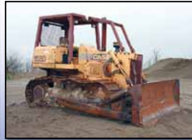
'88 CASE 1550

1988 CASE Model 1550 Crawler Tractor , s/n JAK0010567, powered by Case 6 cylinder diesel engine and powershift transmission, equipped with straight blade with tilt, multi-shank ripper, ROPS canopy with sweeps, and 24" SBG pads. In good condition with good undercarriage. (Rebuilt Transmission-New Cutting Edge)