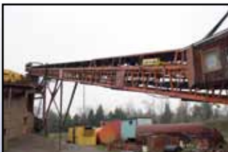
CONVEYOR #6 WITH SCALE

(Conveyor #2) 30"x205' Lattice Conveyor , 20HP electric motor, Dodge TXT6A gear reducer. In good condition.