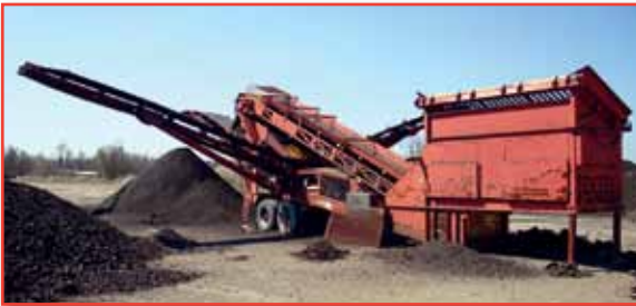
'95 EXTEC 5000