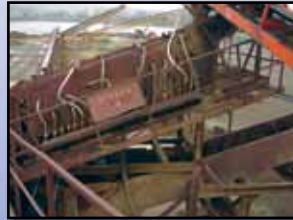
PORTABLE WET SCREEN AND SCREW

'94 KOLBERG SAND SORT inclined vibrating wet screen, powered by 10HP electric motor, with water manifold and spray bars, mounted on tandem axle carrier with 10.00x20 tires. In fair to good condition with fair tires.