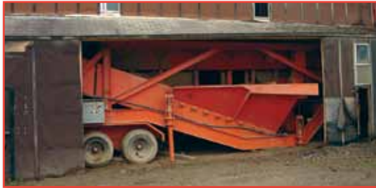
'94 KOLBERG SAND SORT