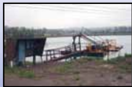
DELAVAL 8" X 10"