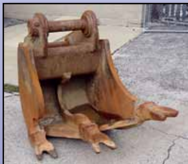
(1) OF (3) LEADING EDGE ROCK RIPPING BUCKETS

(PC308/270/220/228/200): ESCO 26" digging • (2) ESCO 24" digging • 66" Cleanup • Asphalt Cutter