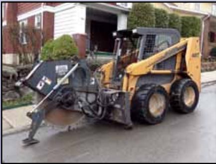
03 CASE 60XT (SAW NOT IN AUCTION)

2003 CASE Model 60XT Skid Steer Loader , s/n JAF0367523, powered by Case diesel engine and hydrostatic transmission, equipped with 72" general purpose loader bucket, hi-flow hydraulics, ROPS canopy, and 12-16.5 tires. In good condition with fair tires. (Purchased New)