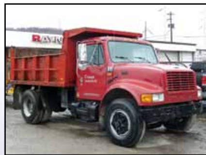
'95 INT'L 4900

1995 INTERNATIONAL Model 4900 Single Axle Dump Truck , powered by Int'l DT466 diesel engine and Spicer 7 speed transmission (fresh rebuild), equipped with 10'6" steel dump body, tow package with air, air brakes, air conditioning, and 11R22.5 tires. In fair to good condition with good tires.