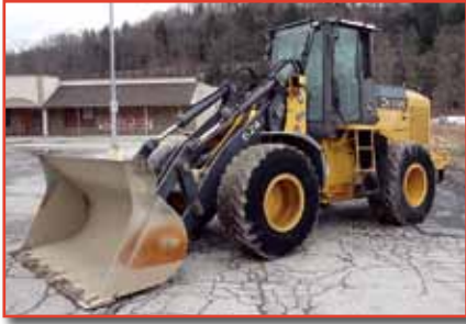
'04 JOHN DEERE 624J