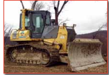
'05 KOMATSU D61EX-15