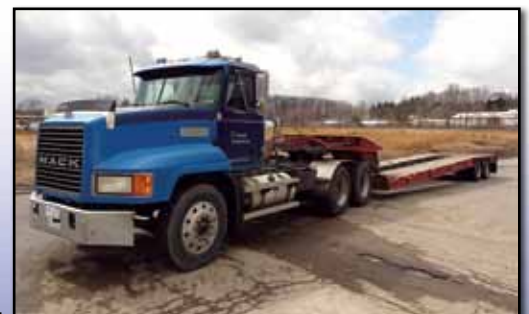
95 MACK CH613 AND 88 ROGERS 35 TON PAVER SPECIAL

1988 ROGERS Model CTH35SSF33.7-57-R20RL, 35 Ton Paver Special Lowboy Trailer , equipped with Paver Special 22'6"x8' main deck, 11'6" deck over wheels, ground bearing, hydraulic detachable, spring suspension, and 255/70R22.5 tires. In good condition with good tires.