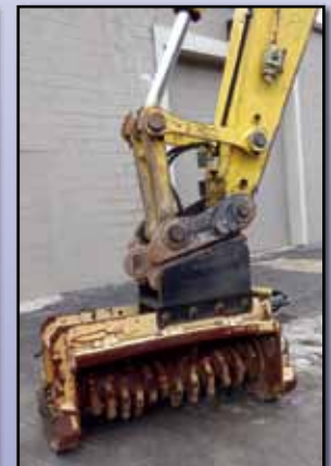
'07 BERTI BRUSH MULCHER

2005 TRAMAC V56 Hydraulic Demolition Hammer , s/n 164252, equipped with 12,000 ft lb impact energy. In good condition. (Additional Cap For PC400 Mounting will be sold separately) (Purchased In 2009 From Tramac Dealer as a Complete Rebuild) (PC300) 1994 NPK H10XB Hydraulic Demolition Hammer , s/n 42217, equipped with 3,000 ft lb impact energy. In good condition. (PC308) 2007 BERTI EFX/SB140 Hydraulic Brush Mulcher , s/n N.32654 (Fits PC300) ACS Hydraulic Quick Coupler , with fittings and hardware (PC120/138)