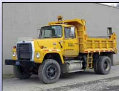
'85 FORD 8000

1985 FORD Model 8000 Single Axle Dump Truck , powered by Cat 3208 diesel engine and 7 speed transmission, equipped with 10' steel dump body, central hydraulic system, tow package with air, air brakes, and 11R22.5 tires. In good condition with good tires.