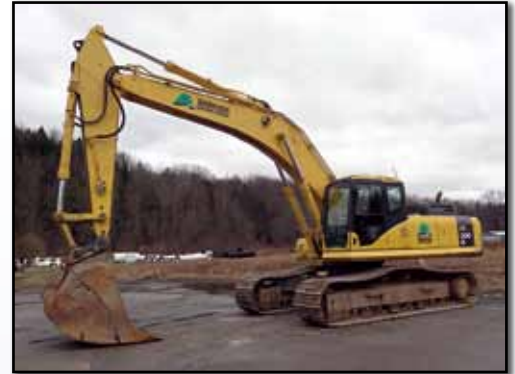
'07 KOMATSU PC300LC-7EO

2011 KOMATSU PC490LC-10 , s/n A40037, powered by Komatsu diesel engine, equipped with 13'1" dipper stick with hydraulic coupler, Esco 54" digging bucket, hydraulic coupler, backup camera, air conditioning, and 35.5" TBG pads. In very good condition with very good undercarriage. (2,518 Hours) (Purchased New)