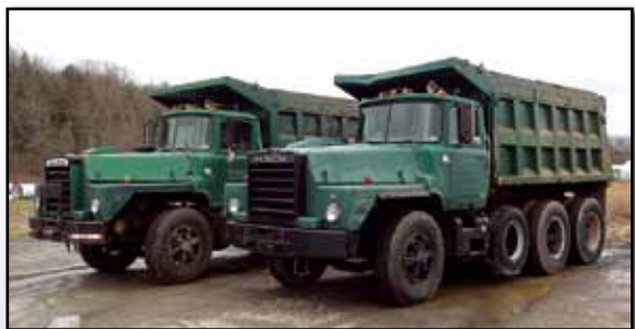
'87 MACK DM886SX

1987 MACK Model DM886SX Tri-Axle Dump Truck , powered by Mack ENDT285HP diesel engine and Mack extended range 7 speed transmission, equipped with 14' steel dump body, 65,000# rears and 20,000# front axle, triple frame, triple scope hoist, camelback suspension, and 12R24 tires. In fair to good condition with fair to good tires.