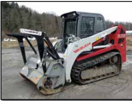
13 TAKEUCHI TL250 (MULCHER SOLD SEPARATELY)

2013 TAKEUCHI Model TL250 Crawler Skid Steer Loader , s/n 225001598, powered by Kubota diesel engine and hydrostatic transmission, equipped with 80" general purpose loader bucket, power coupler, hi-flow hydraulics, enclosed ROPS cab with air conditioning, and 18" rubber tracks. In very good condition with very good undercarriage. (407 Hours) (Purchased New)