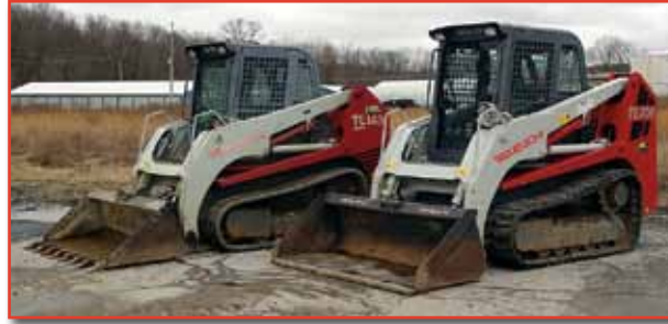
'13 TAKEUCHI TL250 AND '06 TL140