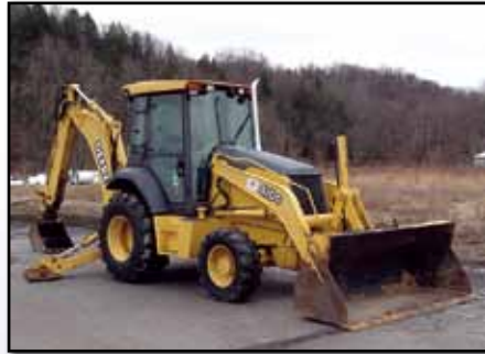
'03 JD 410G 4X4 EXTEND-A-HOE

2003 JOHN DEERE Model 410G, 4x4 Extend-A-Hoe , s/n 924469, powered by John Deere diesel engine and powershift transmission, equipped with general purpose loader bucket, 24" digging bucket, manual rear coupler, rear hydraulics, ride control, enclosed ROPS cab with air conditioning, 12.5/80-18 front and 21L-24 rear tires. In good condition with fair tires. (6,324 Hours) (Purchased New)