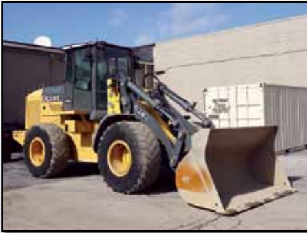
'04 JOHN DEERE 624J

2004 JOHN DEERE Model 624J Rubber Tired Loader , s/n 594193, powered by John Deere diesel engine and powershift transmission, equipped with JRB general purpose bucket, JRB hydraulic coupler, auxiliary hydraulics, ride control, enclosed ROPS cab with air conditioning, and 20.5R25 tires. In good condition with fair to good tires. (7,296 Hours) (Purchased New)