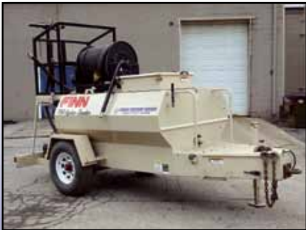
'09 FINN T60 HYDRO SEEDER (100 HOURS)

2009 FINN Model T60T-27B Portable Hydro Seeder , s/n SBA-2226, powered by Kohler 25HP gas engine, equipped with 600 gallon tank, agitator, hose reel with power wind, and topside gun, trailer. In very good condition. (100 Hours) (Purchased New)