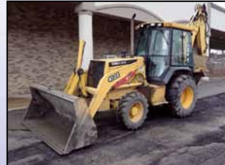
'98 JD 410E 4X4 EXTEND-A-HOE

1998 JOHN DEERE Model 410E, 4x4 Extend-A-Hoe , s/n 852086, powered by John Deere diesel engine and shuttle transmission, equipped with general purpose loader bucket, 24" digging bucket, rear hydraulics, enclosed ROPS cab, 12.5/80-18 front and 21L-24 rear tires. In good condition with good tires (new front tires). (4,752 Hours) (Purchased New)