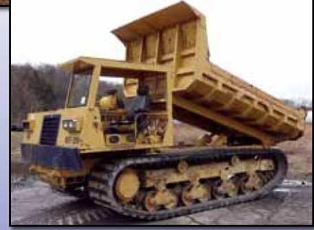
'91 MOROOKA MST2200

1991 MOROOKA Model MST2200 Flex Track Dumper , s/n 22506, powered by Cat 3306 diesel engine and 2 speed hydrostatic transmission, equipped with tailgate and 30" rubber tracks. In good condition with good undercarriage. (5,385 Hours)