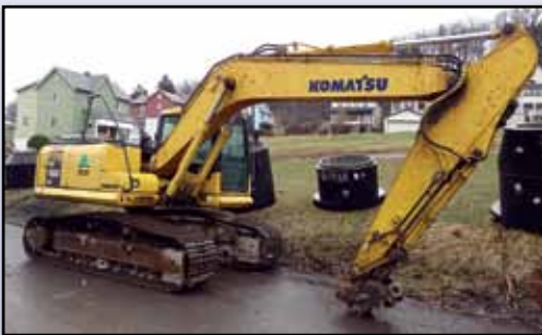
'06 KOMATSU PC160LC-7KA

2005 KOMATSU PC308USLC-3 , s/n 20244, powered by Komatsu diesel engine, equipped with 10' dipper stick with hydraulic beyond and JRB hydraulic coupler, Esco 48" digging bucket, zero swing, air conditioning, and 33.5 TBG pads. In good condition with good undercarriage. (7,966 Hours) (Purchased New)