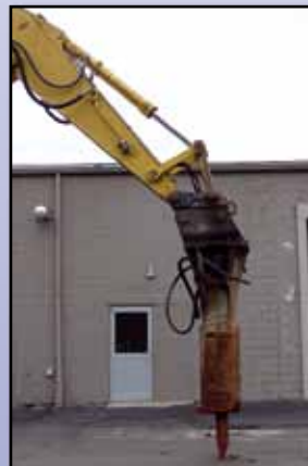
'05 TRAMAC V56, 12,000 FT LB