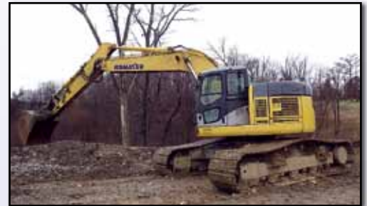
'05 KOMATSU PC308USLC-3

2007 KOMATSU PC308USLC-3EO , s/n 30084, powered by Komatsu diesel engine, equipped with 10' dipper stick with hydraulic beyond and JRB hydraulic coupler, Esco 48" digging bucket, zero swing, air conditioning, and 33.5" TBG pads. In good condition with good undercarriage. (7,064 Hours) (Purchased New)