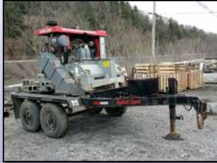
'05 ASPHALT ZIPPER AZ-480HD

2005 ASPHALT ZIPPER Model AZ-480HD Milling Attachment , s/n 48HD0198, powered by John Deere 6068 diesel engine and Twin Disc PTO, equipped with 48" milling head, spray system, and remote controls, with 2006 Williamson tandem axle transport trailer. In good condition. (240 Hours) (Purchased New)