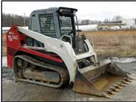
06 TAKEUCHI TL140

2006 TAKEUCHI model TL140 Crawler Skid Steer Loader , s/n 21404094, powered by Isuzu diesel engine and hydrostatic transmission, equipped with 75" general purpose loader bucket with teeth, joystick controls, standard hydraulics, enclosed ROPS cab with air conditioning, and 18" rubber tracks. In good condition with fair undercarriage. (2,857 Hours) (Purchased New)