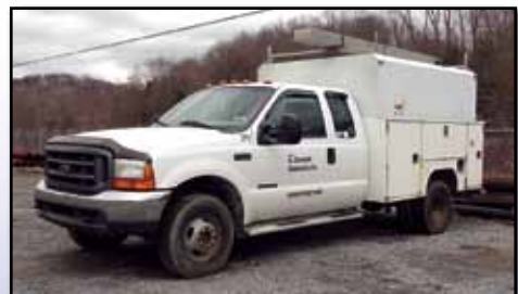
'00 FORD F-350XL 4X4

2000 FORD Model F-350XL Super Duty 4x4 Quad Cab Utility Truck , powered by 7.3L diesel engine and automatic transmission, equipped with 9' enclosed utility body, dual rear wheels, air conditioning, and 235/85R16 tires. In fair to good condition with fair to good tires.