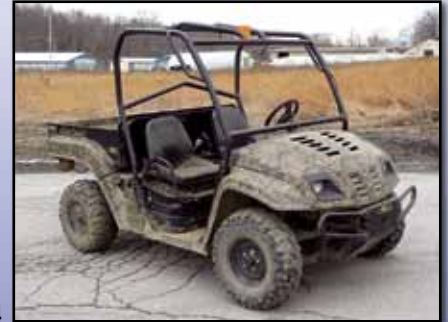
06 CUB CADET 4X4

2006 CUB CADET 4x4 Utility Vehicle , s/n 1E166G40010, powered by Cat diesel engine, equipped with manual dump, roll cage. In good condition with good tires. (268 Hours)