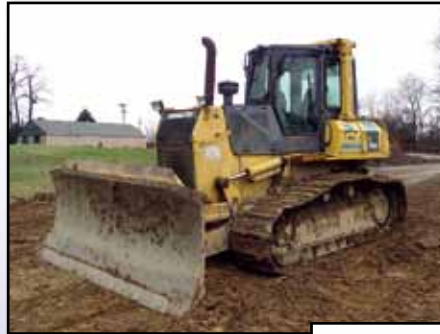
'05 KOMATSU D61EX-15

2005 KOMATSU Model D61EX-15 Crawler Tractor , s/n B40398, powered by Komatsu diesel engine and hydrostatic transmission, equipped with 6-way straight blade, drawbar, and enclosed ROPS cab with air conditioning. In good condition with good undercarriage. (6,950 Hours)