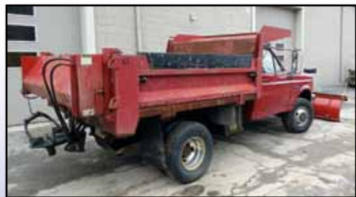
'95 FORD F-350XL 4X4

1995 FORD Model F-350XL, 4x4 Mason Dump Truck , powered by 7.3L diesel engine and 5 speed transmission, equipped with 8' steel dump body with folding sides, Western 7'6" plow, hydraulic tailgate spreader, central hydraulics, locking hubs, dual rear wheels, and 235/85R16 tires. In good condition with good tires.