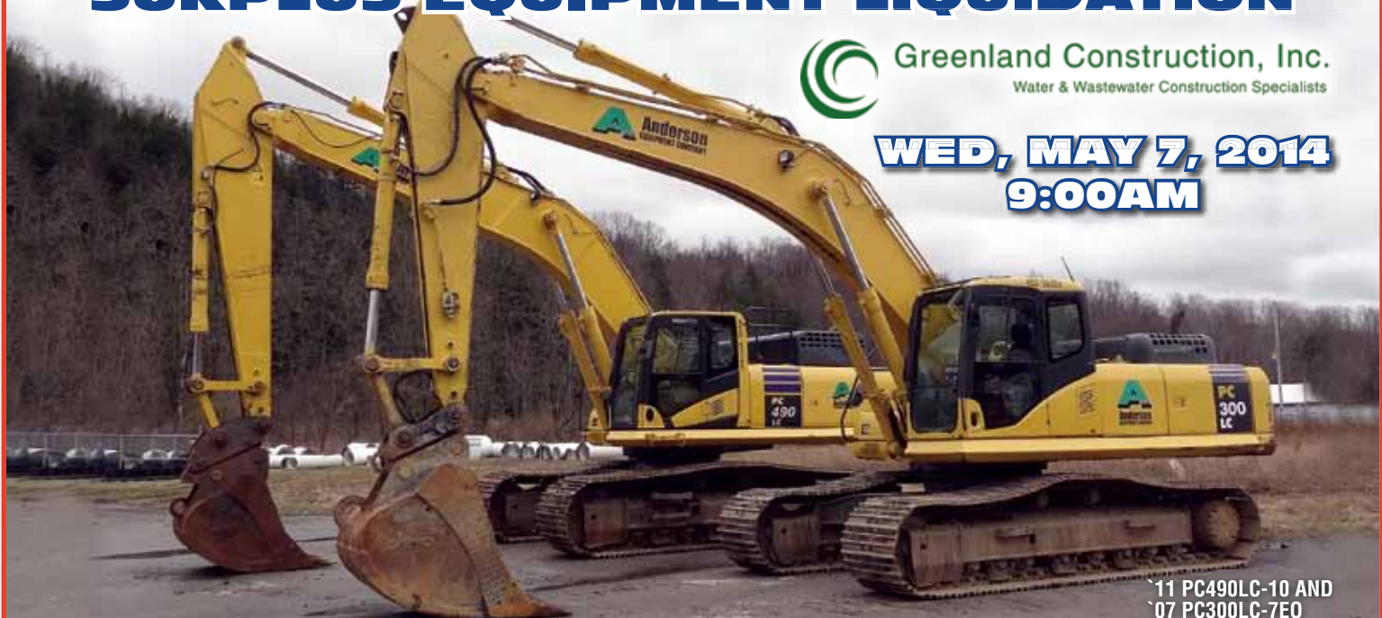
'11 PC490LC-10 AND '07 PC300LC-7EO