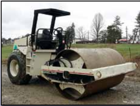
'94 IR SD100D

1994 INGERSOLL RAND Model SD100D Pro Pac Vibratory Compactor , s/n 10408SBD, powered by Cummins diesel engine and hydrostatic transmission, equipped with 84" smooth drum, drum drive, 2-frequency vibration, ROPS canopy, and 23.1-26 tires. In good condition with good tires. (4,543 Hours)