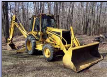
'89 CAT 436 4X4 EXTEND-A-HOE

1989 CATERPILLAR Model 436, 4x4 Extend-A-Hoe , s/n 5KF00505, powered by Cat diesel engine and shuttle transmission, equipped with general purpose loader bucket, 24" digging bucket, rear hydraulics, enclosed ROPS cab, 10.5-20 front and 16.9-28 rear tires. In good condition with good tires. (6,453 Hours) (Purchased New)