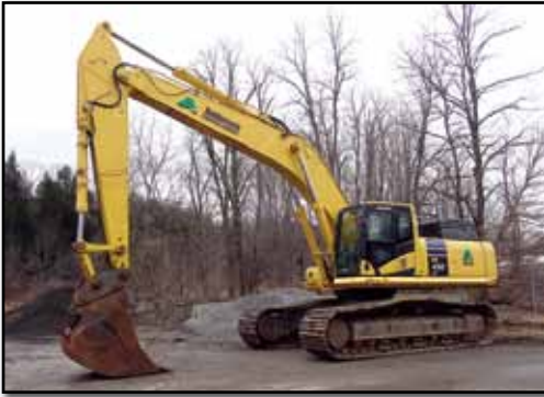
'11 KOMATSU PC490LC-10

2011 KOMATSU PC490LC-10 , s/n A40037, powered by Komatsu diesel engine, equipped with 13'1" dipper stick with hydraulic coupler, Esco 54" digging bucket, hydraulic coupler, backup camera, air conditioning, and 35.5" TBG pads. In very good condition with very good undercarriage. (2,518 Hours) (Purchased New)