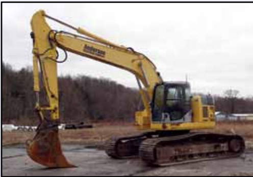
'07 KOMATSU PC308USLC-3EO

2007 KOMATSU PC300LC-7EO , s/n A88938, powered by Komatsu diesel engine, equipped with 10'6" dipper stick with hydraulic beyond and JRB hydraulic coupler, Esco 54" digging bucket, air conditioning, and 33.5" TBG pads. In good condition with good undercarriage. (5,135 Hours)