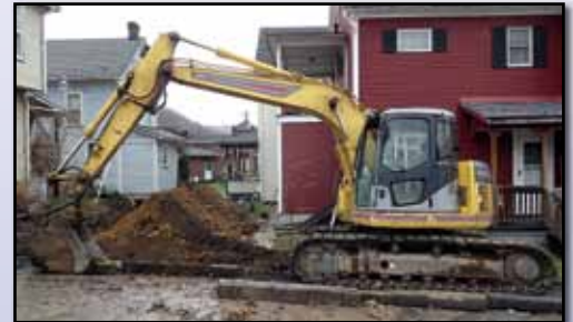
'05 KOMATSU PC138USLC-2EO

2006 KOMATSU PC160LC-7KA , s/n K41009, powered by Komatsu diesel engine, equipped with 8'6" dipper stick with hydraulic beyond and JRB hydraulic coupler, Esco 24" digging bucket, air conditioning, and 23.5 TBG pads. In good condition with good undercarriage. (6,848 Hours) (Purchased New)