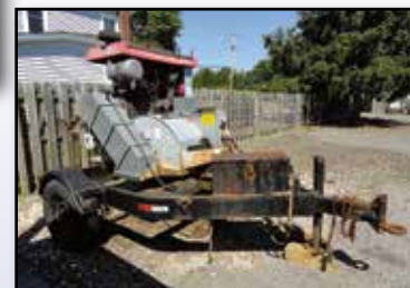
'04 ASPHALT ZIPPER AZ360

2004 ASPHALT ZIPPER AZ360 , 36" Asphalt Mill, s/n 36000179, powered by JD diesel engine, equipped with umbilical cab controls, with single axle transport trailer. In good condition.