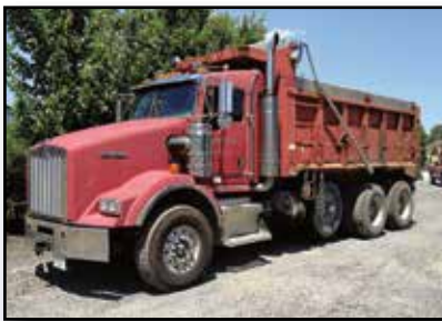
'04 KENWORTH T800

2000 FORD F-750XLT Super Duty Single Axle Dump Truck , powered by Cat 3126, 7.2L diesel engine and Spicer 7 speed transmission, equipped with 10' steel dump body, 21,000 lb rear and 12,000 lb front axle, 33,000 lb GVWR, tow package with air, air brakes, and air conditioning. In good condition with good tires.