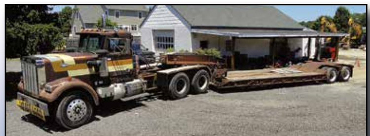
'96 AUTOCAR AND '83 ROGERS 35 TON

1983 ROGERS TH35DSF20-57-B20, 35 Ton Tandem Axle Lowboy Trailer , equipped with ground bearing hydraulic detachable and 20'x8' level deck. In fair to good condition.