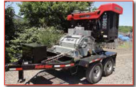
(1) OF (2) ASPHALT ZIPPERS