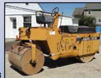
'95 GALION S3-5B

1995 GALION S3-5B, 3-5 Ton Static Roller , s/n 530075, powered by Cummins diesel engine and hydrostatic transmission, equipped with 42" smooth drums. In good condition.