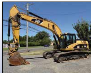
'09 CAT 329DL

2009 CATERPILLAR 329DL Hydraulic Excavator , s/n JHJ00342, powered by Cat C7 Acert diesel engine, equipped with 10'6" dipper stick with Cat hydraulic coupler, hydraulic beyond, Cat 36" digging bucket, pattern selector, cab with heat and air conditioning, and 31.5" TBG pads. In good to very good condition with good to very good undercarriage. (3,488 Hours)