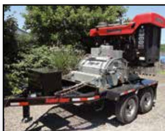
'16 ASPHALT ZIPPER AZ360 HOT ROD

2016 ASPHALT ZIPPER AZ360 Hot Rod , 36" Asphalt Mill, s/n AZ0208, powered by JD 173HP diesel engine, equipped with wireless remote and umbilical cab controls, Z-Pro cutter head, with tandem axle transport trailer. In excellent condition. (81 Original Hours)