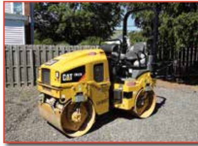
16 CAT CB22B

1440 COWPATH RD. • HATFIELD, PA 19440 215/361-9099 • Fax: 215/361-9212 www.hunyady.com