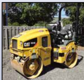
'16 CAT CB22B

2016 CATERPILLAR CB22B Tandem Vibratory Roller , s/n 2B200129, powered by Perkins diesel engine and hydrostatic transmission, equipped with 39" smooth drums, drum vibration selector, front and rear spray, and folding roll bar. In very good to excellent condition. (218 Hours)