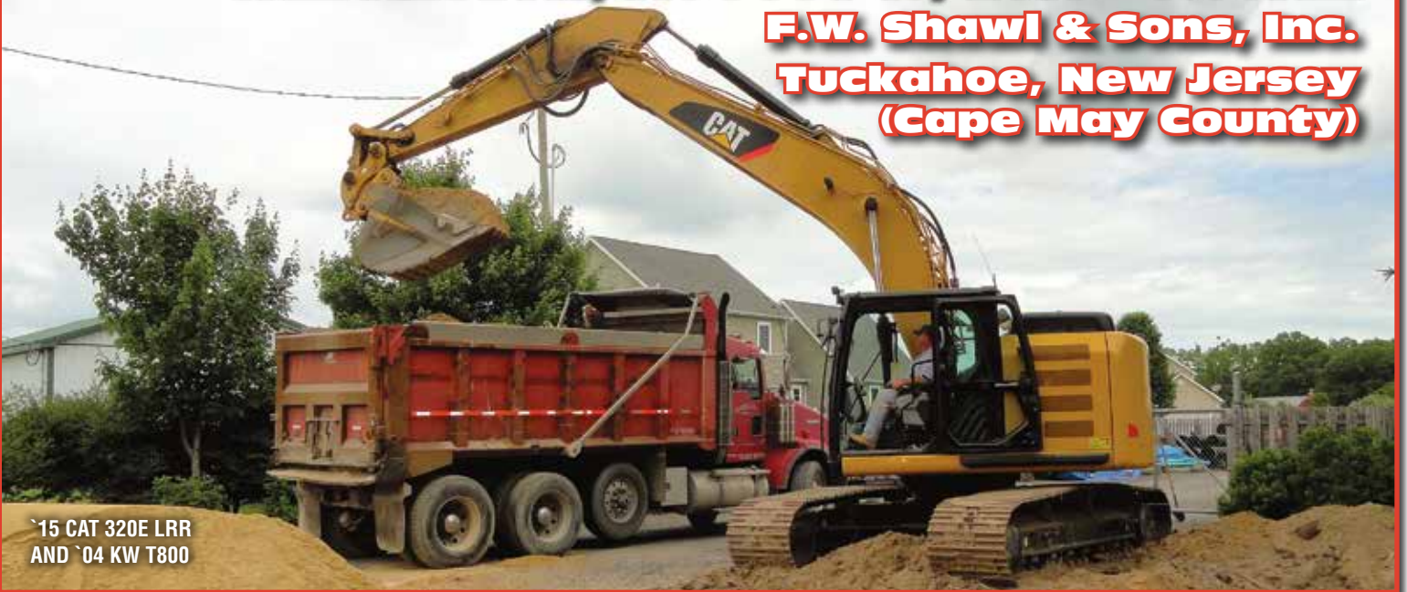
15 CAT 320E LRR AND 04 KW T800