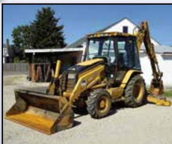
'02 CAT 420D 4X4

2002 CATERPILLAR 420D, 4x4 Tractor Loader Extend-A-Hoe , s/n FDP04735, powered by Cat 3054T diesel engine and shuttle transmission, equipped with general purpose loader bucket, 24" digging bucket, joystick backhoe controls, and enclosed ROPS cab. In good condition with good tires. (Moderate Sheet Metal/Cab Rust)