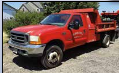
'01 FORD F-550XL SUPER DUTY

2001 FORD F-550XL Super Duty Dump Truck , powered by Powerstroke 7.3L diesel engine and automatic transmission, equipped with 9' steel dump body, behind cab toolboxes, dual rear wheels, and air conditioning. In good condition with good tires.