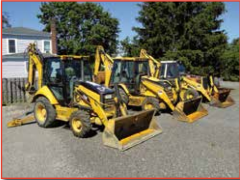
CAT 4X4 EXTEND-A-HOES

PRE-SORTED FIRST CLASS MAIL US POSTAGE PAID HAVERTOWN, PA PERMIT #45