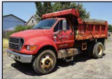
'00 FORD F-750XLT SUPER DUTY

2000 FORD F-750XLT Super Duty Single Axle Dump Truck , powered by Cat 3126, 7.2L diesel engine and Spicer 7 speed transmission, equipped with 10' steel dump body, 21,000 lb rear and 12,000 lb front axle, 33,000 lb GVWR, tow package with air, air brakes, and air conditioning. In good condition with good tires.