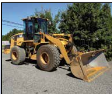
'05 CAT 938G SERIES II

2005 CATERPILLAR 938G Series II Rubber Tired Loader , s/n CRD01564, powered by Cat 3126B diesel engine and powershift transmission, equipped with Cat left side hydraulic dump bucket, Cat hydraulic coupler, ride control, enclosed ROPS cab with heat and air conditioning, and 20.5R25 tires. In fair to good condition with very good front and poor rear tires. (Moderate to severe cab rust)