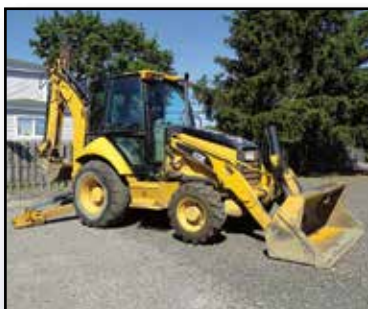
'06 CAT 420E 4X4

2006 CATERPILLAR 420E, 4x4 Tractor Loader Extend-A-Hoe , s/n HLS01557, powered by Cat 3054C diesel engine and shuttle transmission, equipped with general purpose loader bucket, 22" digging bucket, joystick backhoe controls, and enclosed ROPS cab with heat and air conditioning. In good condition with good front and fair to poor rear tires.