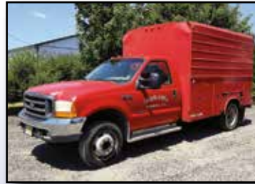
'00 FORD F-550XL SUPER DUTY

2000 FORD E-350 Utility Truck , powered by Triton V-8 gas engine and automatic transmission, equipped with Stahl 11' walk-in utility body with side boxes, dual rear wheels, and air conditioning. In fair to good condition.