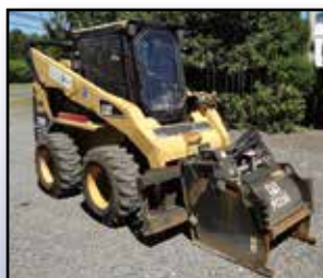
'05 CAT 268B (MILLING ATTACHMENT SOLD SEPARATELY)

2005 CATERPILLAR 268B Skid Steer Loader , s/n LBA01051, powered by Cat 3044C diesel engine and 2-speed hydrostatic transmission, equipped with 74" general purpose bucket, high flow XPS hydraulics, and enclosed ROPS cab. In good condition with good tires.