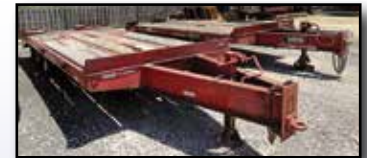
'02 AND '95 ROGERS 21 TON

(2) 8'x20' Sea Containers. In good condition.