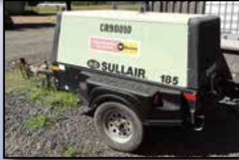
'13 SULLAIR 185CFM

FORD 340 Broom Tractor , s/n C665479, powered by diesel engine and manual transmission, equipped with Sweepster 6' hydraulic broom with angle, 3-point hitch, York rake, and water barrels. In fair to good condition.