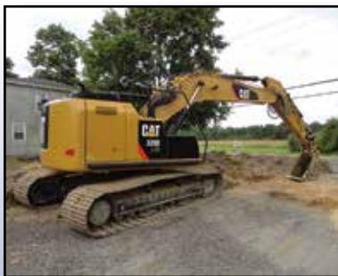
'15 CAT 320E LRR

2015 CATERPILLAR 320E LRR Hydraulic Excavator , s/n TFX01145, powered by Cat C6.6 Acert diesel engine, equipped with 9'6" dipper stick with Cat hydraulic coupler, hydraulic beyond, Cat 28" digging bucket, pattern selector, cab with heat and air conditioning, and 31" TBG pads. In very good condition with very good undercarriage. (2,485 Hours)