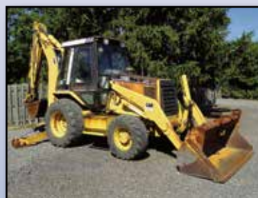
'94 CAT 426B 4X4

1994 CATERPILLAR 426B, 4x4 Tractor Loader Extend-A-Hoe , s/n 5YJ01933, powered by Cat 3054 diesel engine and shuttle transmission, equipped with general purpose loader bucket, 24" digging bucket, rear auxiliary hydraulics, joystick backhoe controls, and enclosed ROPS cab. In fair to good condition with fair to poor tires. (Cab Rust)