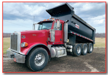
`08 PETERBILT 367