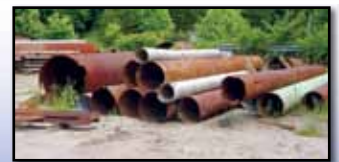
PIPE AND CASING

• (4) Guardrail Attenuators • Assorted I-Beams and Structural Steel