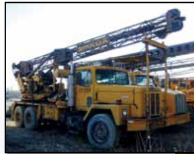
WILLIAMS MF-SPEC SOLD IN ABSENTIA