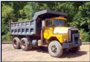
'73 MACK DM685SX

DM685S Tandem Axle Dump Truck , powered by Mack ETZ675 diesel engine (237HP) and Maxitorque extended range transmission, equipped with 16' steel dump body with air gate, 44,000# rears, 4:64 ratio, tow package, 10.00R20 front and 10.00x20 rear tires. In good condition with fair to good tires.