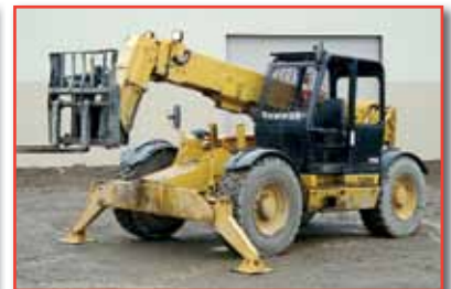
'99 CAT TH103