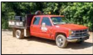
'98 CHEVY 3500

Unit #TO115 1998 CHEVROLET Model 3500 Cheyenne Crew Cab Flatbed Truck , powered by 6.5L diesel engine and 5 speed transmission, equipped with 9' wooden flatbed, side toolboxes, cross bed steel fuel tank, 12 volt electric pump, tow package, air conditioning, and 225/75R16 tires. In good condition with good tires.