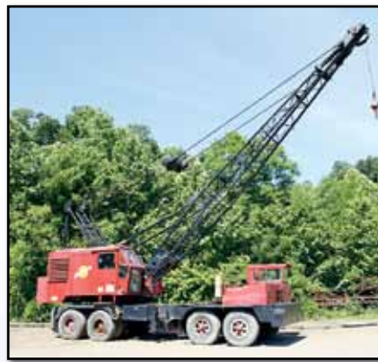
MANITOWOC 2900T II

on Hendrickson 8x4 carrier, powered by Cummins diesel engine and Fuller 5 speed transmission with 3 speed auxiliary, equipped with front bumper counterweight, walking beam suspension and 14.00x20 tires. In good condition with good tires.