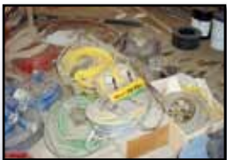
VETTER PNEUMATIC LIFTING SYSTEM