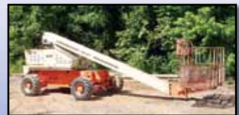
97 JLG 40H