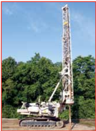
'91 WATSON 2500CM

PRE-SORTED FIRST CLASS MAIL US POSTAGE PAID HAVERTOWN, PA PERMIT #45