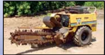
95 VERMEER V1850

Unit #LS001 1998 NEW HOLLAND Model LX865 Turbo Skid Steer Loader , s/n 100285, powered by New Holland 332T/JF, 3.2L diesel engine and hydrostatic transmission, equipped with Super Boom, quick disconnect, auxiliary hydraulics, general purpose bucket, ROPS canopy, rear side counterweights, and 12-16.5 tires. In fair condition with good tires. Unit #RT100 1995 VERMEER Model V1850 Walk Behind Rubber Tired Trencher , s/n 1VRK071M7S1000464, powered by Kohler 2 cylinder gas engine and hydrostatic transmission, equipped with 48" trencher bar, carbide tipped and c-cup trencher chain, hydraulic steer, and 16x7.50-8 front and 23x10.50-12 rear tires. In good condition with good tires.