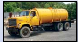
CHEVY WATER TRUCK