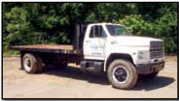
'80 FORD FLAT-DUMP

Unit #TF702 1980 FORD Single Axle Flatbed Dump Truck , powered by Cat 3208 diesel engine and 5 speed transmission with 2 speed rear, equipped with 18' steel flatbed with bulkhead, air brakes, and 10.00x20 tires. In fair to good condition with fair to good tires.