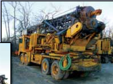
HUGHES 60T SOLD IN ABSENTIA

Unit #DL141 HUGHES Model 60T Production Digger , s/n Unknown, powered by Cat 6 cylinder diesel engine and Twin Disc torque converter, equipped with 60' drilling depth, 4" inner kelly bar-6" outer kelly bar, mounted on Hendrickson Quad Axle Carrier, powered by Cummins 6 cylinder diesel engine and Fuller Roadranger 8 speed transmission, equipped with walking beam suspension, (4) hydraulic outriggers, and 12.00R22.5 tires. In good condition with good tires. (To Be Sold In Absentia From Dayton, Ohio)