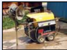
LANDA PRESSURE WASHER