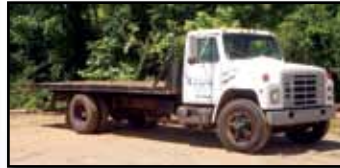
'85 IHC ROLL-BACK

10.00x20 tires. In good condition with good tires.