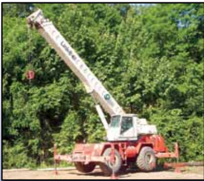
'90 LINK-BELT HSP8028S

Unit #CP202 1990 LINK-BELT Model HSP-8028S, 28 Ton Hydraulic Rough Terrain Crane, s/n 4710-0448, powered by Detroit 8.2L diesel engine and powershift transmission, equipped with 28' to 70' 3-section hydraulic boom, LSI model GS550 LMI system, single hoist, Johnson 3-sheave hook block, (4) hydraulic outriggers, and 20.5x25 tires. In good condition with good tires.