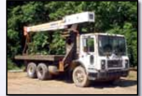
R.O. 25,000# BOOM TRUCK

FORD Model 8000 Single Axle Lube Truck , powered by Ford/Cat V636 diesel engine and 5 speed transmission with 2 speed rear, equipped with 1,800 gallon diesel tank, (4) product tanks with reels, 10.00x20 front and 11.00x20 rear tires. In fair to poor condition with fair tires.