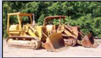
CAT 977L AND 977K

Unit #LR300 CATERPILLAR Model 988 Rubber Tired Loader , s/n 87A4388, powered by Cat diesel engine and powershift transmission, equipped with spade nose bucket with teeth, cab, and 29.5x29 tires. In fair to good condition with fair to good tires.