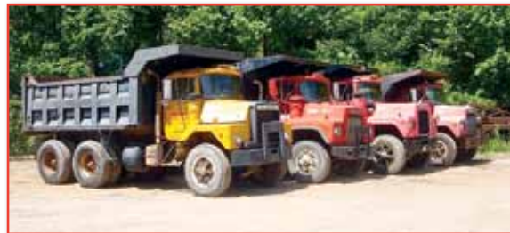
MACK DUMP TRUCKS

1440 COWPATH RD. • HATFIELD, PA 19440 215/361-9099 • Fax: 215/361-9212 www.hunyady.com