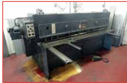
ERFURT HYDRAULIC SHEAR

1440 COWPATH RD. • HATFIELD, PA 19440 215/361-9099 • Fax: 215/361-9212