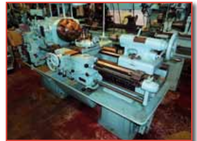
(1) OF (30) LATHES