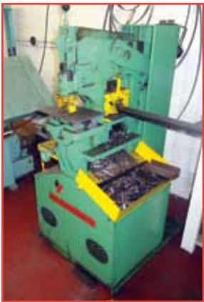
UNI-HYDRO IRON WORKER

PRE-SORTED FIRST CLASS MAIL US POSTAGE PAID HAVERTOWN, PA PERMIT #45