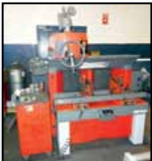
'03 SERDI 100HD

2003 SERDI 100HD Valve Seat Machine , s/n 111, 240-volt single phase electric motor, 54" bed, manual angle head stands, and pneumatic floating spindle head