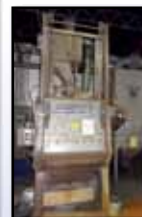
(1) OF (3) PANGBORN SHOT BLAST MACHINES

PANGBORN Rotary Shot Blast Machine , s/n 57413, 460-volt 3 phase electric motor, electric door, shot blast retrieval elevator, and dust collector