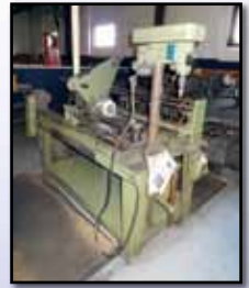
STORM VULCAN 744

115-volt single phase electric motor, Dewalt 1/2" electric drill