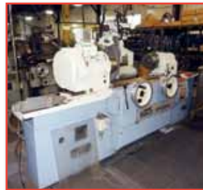
'00 BERCO 225A-40

1440 COWPATH RD. • HATFIELD, PA 19440 215/361-9099 • Fax: 215/361-9212 www.hunyady.com