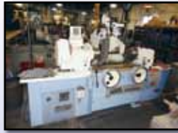
'00 BERCO 225A-40