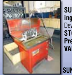
SUNNEN HS30K Crankshaft Honing Stand , s/n 1C61734, 115-volt single phase electric motor, Dewalt 1/2" electric drill

STORM VULCAN 744 Cam Shop Camshaft Polisher , s/n 50285, 56" bed, 3/4" polishing belt with .5HP single phase electric motor; camshaft rotator with .5HP single phase electric motor; and Enco 40050, 475 RPM to 2600 RPM drill press with .5HP single phase electric motor