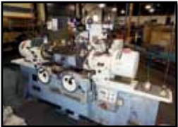
'04 BERCO RTM225A-BS 596B, 220-volt single phase electric motor, 88" bed, 24" grinding wheel, Peterson "finger tip" controlled "swing chucks", and oil bath system (Chucks Are Adjustable To Grind Both Rod & Main Bearings)

2004 BERCO RTM225A-BS Crankshaft Grinder , s/n 612B, 220-volt single phase electric motor, 88" bed, 24" grinding wheel, Peterson "finger tip" controlled "swing chucks", and oil bath system (Chucks Are Adjustable To Grind Both Rod & Main Bearings)