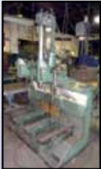
'05 BERCO ACP160A

ROTTLER FA24MAB Single Block Cylinder Boring Machine , s/n 4306R, 230-volt 3 phase electric motor, manual spindle travel (Formerly A Two-Head Machine – One Spindle Removed – Can Accommodate Two Head Clamps)