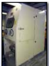
'06 EMPIRE PF3642

DONALDSON Torit V5-3000 Dust Collector & Blowout Cabinet , 480-volt 3 phase electric motor