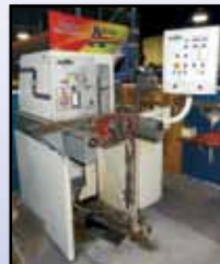
'05 SUNNEN ML-2000-DF

2005 SUNNEN ML-2000-DF Connecting Rod Hone , s/n 4D1-1187, 230-volt 3 phase electric motor, 200 to 3000 RPM spindle speed, 60 to 350 SPM stroker speed, .25 to 6.6" stroke length, AG300 precision gauge, pneumatic rod clamp, and Sunnen ML3490D oil bath system