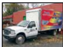
'04 FORD F-550XL SUPER DUTY

2004 FORD F-550XL Super Duty Single Axle Van Body Truck , Powerstroke 6.0L diesel engine and automatic transmission, 16" FRP van body with electric lift gate and swing rear door, curbside door, dual fuel tanks, cruise control, air conditioning, and 225/70R19.5 tires. In good condition with good tires.