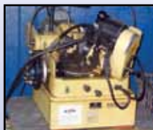
TOBIN-ARP VALVE REFAKER