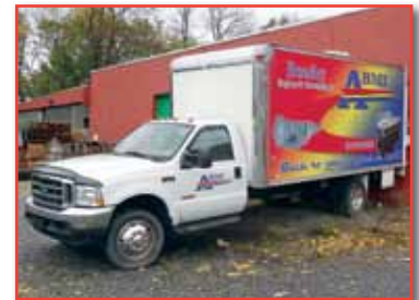
'04 FORD F-550XL SUPER DUTY

PRE-SORTED FIRST CLASS MAIL US POSTAGE PAID HAVERTOWN, PA PERMIT #45