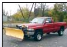
'97 DODGE RAM 1500 4X4

2004 FORD F-550XL Super Duty Single Axle Van Body Truck , Powerstroke 6.0L diesel engine and automatic transmission, 16" FRP van body with electric lift gate and swing rear door, curbside door, dual fuel tanks, cruise control, air conditioning, and 225/70R19.5 tires. In good condition with good tires.