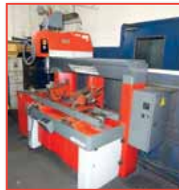
'03 SERDI 100HD