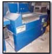
STORM VULCAN ANDERSON AB1540A

KWIK WAY Rocker Arm Refacer , 1/3HP single phase electric motor, 8" grinding wheel ULTRAMATIC OH0-1530 Vibratory Finisher , single phase electric motor, 30"x15"x12"D box