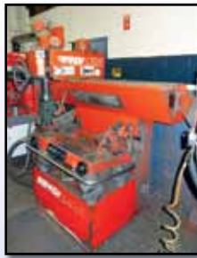
'88 SERDI 100