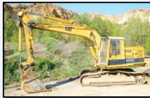
'91 CAT 225D

1987 CATERPILLAR Model 235B Hydraulic Excavator , s/n 7WC00611, powered by Cat 3306 diesel engine and hydraulic drive, equipped with 12' dipper stick, 48" digging bucket, 16" crawlers, and 36" TBG pads. In fair to good condition with fair to good undercarriage.