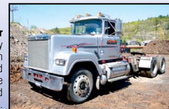
'90 MACK SUPER LINER

1994 WESTERN STAR Model 4964F Tandem Axle Truck Tractor , powered by Cat 3406C-425, 425HP diesel engine and Fuller Roadranger 13 speed transmission, equipped with 38,000# rears, 12,000# front axle, engine brake, wetline, 60" stand-up sleeper, airslide 5th wheel, aluminum wheels, heated mirrors, power passenger window, and 11R24.5 tires. In good condition with good tires.