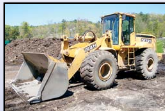
'97 JOHN DEERE 744H

1997 JOHN DEERE Model 744H Rubber Tired Loader , s/n DW744HX563863, powered by John Deere diesel engine and powershift transmission, equipped with general purpose loader bucket with bolt-on cutting edge, hydraulic quick disconnect, enclosed ROPS cab with heat and air conditioning, and 26.5-25 tires. In good condition with fair front and good rear tires.