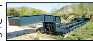
'87 FRUEHAUF 50 TON LOWBOY

1987 FRUEHAUF 50 Ton Tri-Axle Lowboy Trailer , equipped with ground bearing detachable goose-neck, 8'6"x24'6" level deck, 13' over axles, spring suspension, wetline, chain dogs, and outriggers. (Restoration In Progress, Sandblasted and Painted, But No Decking and Missing Tires On Two Axles) 2000 MAC 45' Tandem Axle Walking Floor Trailer , equipped with Keith walking floor, spring suspension, manual roll tarp, rear swing door, 80,000# GVWR, and 285/75R24.5 tires. In good condition with good tires.