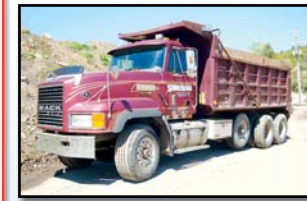
'96 MACK CL713

1996 MACK Model CL713 Tri-Axle Dump Truck , powered by Mack E7-454 diesel engine and Maxitorque T2180, 18 speed transmission, equipped with Bibeau 17' steel dump body with electric tarp, single chute, 44,000# rears, 20,000# front axle, engine brakes, tow package, aluminum wheels, air conditioning, 385/65R22.5 front and airlift 3rd axle tires and 11R24.5 rear tires. In good condition with fair tires.