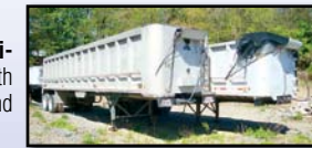
(2) OF (3) DUMP TRAILERS

1996 MACK Model CL713 Tri-Axle Dump Truck , powered by Mack E7-454 diesel engine and Maxitorque T2180, 18 speed transmission, equipped with Bibeau 17' steel dump body with electric tarp, single chute, 44,000# rears, 20,000# front axle, engine brakes, tow package, aluminum wheels, air conditioning, 385/65R22.5 front and airlift 3rd axle tires and 11R24.5 rear tires. In good condition with fair tires.