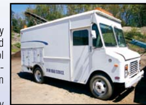
'86 CHEVY SERVICE VAN

1986 GMC Model Brigadier Single Axle Fuel Truck , powered by Cat 3208 diesel engine and 5 speed transmission with 2 speed rear, equipped with 2,000 gallon aluminum fuel tank, hose with reel, Midcom meter, 21,000# rears, 12,000# front axle, 33,000# GVWR, air brakes, and 11R22.5 tires. In good condition with good tires.