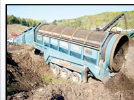
'00 POWERSCREEN 830

2000 POWERSCREEN Model 830 Portable Trommel Screen , s/n 9202224, powered by Deutz diesel engine, equipped with 46"x16" hopper with bottom conveyor, 8"x30" trommel screen, 40"x22" side discharge conveyor, mounted on tri-axle trailer, with 11R22.5 tires. In good condition with good tires.