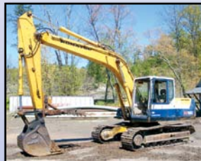
'92 KOMATSU PC150-5

1990 KOMATSU Model PC220LC Hydraulic Excavator , s/n A70078, powered by Komatsu SA6D diesel engine and hydraulic drive, equipped with 10' dipper stick, Pemberton 30" digging bucket, auxiliary hydraulics, 14'10" crawlers, and 32" TBG pads. In fair condition with poor to fair undercarriage. (Boom Welds) 1992 KOMATSU Model PC150-5 Hydraulic Excavator , s/n 6691, powered by Komatsu 56D95L-1 diesel engine and hydraulic drive, equipped with 8'4" dipper stick, Esco 30" digging bucket, auxiliary hydraulics, mechanical thumb attachment, 12' crawlers, and 24" TBG pads. In fair to good condition with fair to good undercarriage.