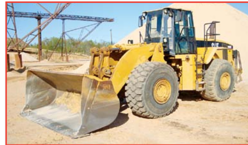
'96 CAT 980G