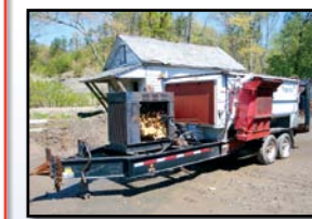
FECON BMD1000 DYE MIXER

FECON Model BMD1000 Portable Mulch Dye Mixer , s/n 2223, powered by John Deere 4039 diesel engine, equipped with 66"x12" hopper, paddle mixer with 14" and 16" augers, (3) 9' auger discharges, and 9.50-16.5 tires. In good condition with good tires. (3) Totes of Mulch Dye (1 Red, 2 Brown)