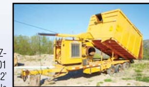
TARRANT LEAF VAC

FECON Model BMD1000 Portable Mulch Dye Mixer , s/n 2223, powered by John Deere 4039 diesel engine, equipped with 66"x12" hopper, paddle mixer with 14" and 16" augers, (3) 9' auger discharges, and 9.50-16.5 tires. In good condition with good tires. (3) Totes of Mulch Dye (1 Red, 2 Brown)