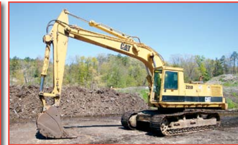
'92 CAT 235D