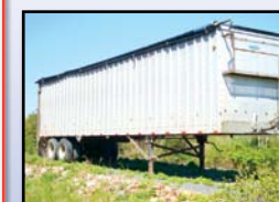
'95 PEERLESS 42' WALKING FLOOR

1995 PEERLESS Model 42-CTS, 42' Tandem Axle Aluminum Walking Floor Trailer , equipped with Keith walking floor, spring suspension, sliding tandems, manual roll tarp, rear swing doors, and 11R24.5 tires. In good condition with fair to good tires. 1998 TRAILING Model TKT50-2800, 25 Ton Tri-Axle Tilt Deck Trailer , equipped with 8'6"x4' stationary deck, 24' level tilting deck, 12" folding beavertail, chain dogs, air brakes, and 215/75R17.5 tires. In good condition with fair to good tires. Tandem Axle Tag-A-Long Trailer , equipped with 6'x14' steel level deck and 225/75R15 tires. In fair condition with fair tires. (No Title) 1957 FRUEHAUF 6,525 Gallon Aluminum Tank Trailer (4) Van/Storage Trailers • Office Trailer. In fair to poor condition.