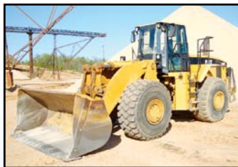
'96 CAT 980G 2KR00732

1996 CATERPILLAR Model 980G Rubber Tired Loader , s/n 2KR00732, powered by Cat 3406 diesel engine and powershift transmission, equipped with general purpose loader bucket with bolt-on cutting edge, bucket scale, Command steering, enclosed ROPS cab with heat and air conditioning, light package, and 29.5R25 tires. In good condition with good to very good front and good rear tires.