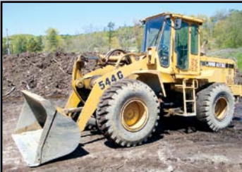
'95 JOHN DEERE 544G

1995 JOHN DEERE Model 544G Rubber Tired Loader , s/n DW544GD551721, powered by John Deere diesel engine and powershift transmission, equipped with general purpose loader bucket, auxiliary hydraulics, enclosed ROPS cab with heat, and 20.5-25 tires. In good condition with very good front and fair and good rear tires.