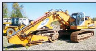
'97 SAMSUNG SE450LC

CATERPILLAR Model 225 Hydraulic Excavator , s/n 51U2184, powered by Cat diesel engine and hydraulic drive, equipped with 10' dipper stick, 36" digging bucket, auxiliary hydraulics, 147" crawlers, and 21.5" TBG pads. In fair condition with fair to good undercarriage. (Swivel Out-Needs Replaced)