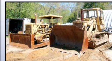
CAT D6 AND 977K

INTERNATIONAL Model TD20C Crawler Tractor , s/n 4260125V026132, powered by International diesel engine and powershift transmission, equipped with semi-U blade with tilt, drawbar, 3rd valve, open ROPS canopy, and 22" SBG pads. In fair to good condition with fair undercarriage.