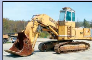
'88 LIEBHERR R952HD

HALA Model AE280LC Hydraulic Excavator , s/n 2005, powered by Cummins C8.3-C diesel engine and hydraulic drive, equipped with 10'4" dipper stick, auxiliary hydraulics, 16'3" crawlers, and 32" TBG pads. In fair condition with fair to good undercarriage. (Bad Engine - Not Running)