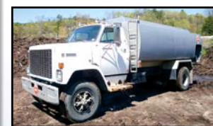
'86 GMC FUEL TRUCK

1986 GMC Model Brigadier Single Axle Fuel Truck , powered by Cat 3208 diesel engine and 5 speed transmission with 2 speed rear, equipped with 2,000 gallon aluminum fuel tank, hose with reel, Midcom meter, 21,000# rears, 12,000# front axle, 33,000# GVWR, air brakes, and 11R22.5 tires. In good condition with good tires.