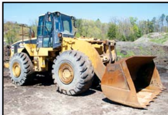
96 CAT 980G 2KR00775

1996 CATERPILLAR Model 980G Rubber Tired Loader , s/n 2KR00775, powered by Cat 3406 diesel engine and powershift transmission, equipped with general purpose loader bucket with teeth, bucket scale, Command steering, enclosed ROPS cab with heat and air conditioning, and 29.5-25 tires. In good condition with fair front and good rear tires.