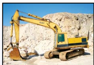
'87 CAT 235B

1987 CATERPILLAR Model 235B Hydraulic Excavator , s/n 7WC00611, powered by Cat 3306 diesel engine and hydraulic drive, equipped with 12' dipper stick, 48" digging bucket, 16" crawlers, and 36" TBG pads. In fair to good condition with fair to good undercarriage.