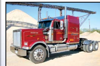
'94 WESTERN STAR 4964F

1994 WESTERN STAR Model 4964F Tandem Axle Truck Tractor , powered by Cat 3406C-425, 425HP diesel engine and Fuller Roadranger 13 speed transmission, equipped with 38,000# rears, 12,000# front axle, engine brake, wetline, 60" stand-up sleeper, airslide 5th wheel, aluminum wheels, heated mirrors, power passenger window, and 11R24.5 tires. In good condition with good tires.