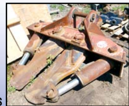
(1) OF (2) HYDRAULIC STUMP SPLITTERS

STUMP SPLITTERS, DEMO HAMMERS, AND BUCKETS Hydraulic Stump Splitter Attachment (Cat 235D) • Hydraulic Stump Splitter Attachment (Komatsu PC220LC) • JRB Hydraulic Quick Coupler (Komatsu PC220) • 1990 NPK Model 16X Hydraulic Demo Hammer , s/n 27210, with quick disconnect. In good condition. (Cat 225D) • KENT Hydraulic Demo Hammer . In fair to good condition. (Cat 225) • ALLIED 5-Tine Grapple (Hala AE280LC) • DIGGING BUCKETS: 52" (Cat 235B) • 24" (Cat 225DL) • 42" Digging Bucket (Komatsu PC150) • CAT 225 Digging Buckets: 28", 32", 40", 24" Trenching Bucket