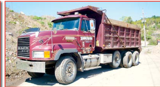
'96 MACK CL713