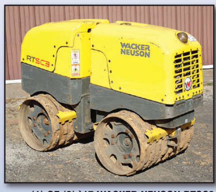
(1) OF (2) `17 WACKER NEUSON RTSC3