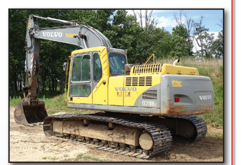
03 VOLVO EC210BLC

Volvo EC210BLC: NPK Model GH-7 Hydraulic Demolition Hammer, s/n 103321. In good condition. (Purchased New) • 5-Tine Grapple • GEITH 30" Digging Bucket Komatsu PC138's: 2014 BTI Model BX20 Hydraulic Demolition Hammer, s/n 239B20. In good condition. (Purchased New) • 2017 STRIKER SC80 Hydraulic Plate Compactor, s/n 143T138 (Purchased New) • WB 24" Digging Bucket • STRICKLAND 24" Digging Bucket Cat 305E: CAT 30" Digging Bucket