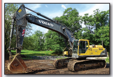
04 VOLVO EC460BLC

s/n HPD00223, powered by Cat C13 diesel engine and hydraulic drive, equipped with 12'6" dipper stick, Cat 72" digging bucket with side cutters, Topcon 3D-GPS prepped, rearview camera, enclosed ROPS cab with heat and air conditioning, and 35.5" TBG pads. In good condition with good undercarriage. (Purchased New)