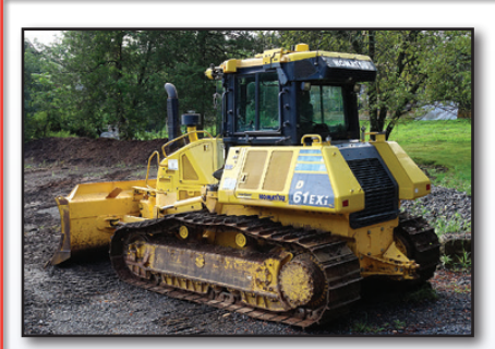
17 KOMATSU D61EXI-24