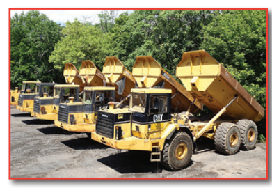
(5) OF (7) CAT D350E'S