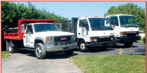
DUMP AND FLATBED TRUCKS

Elysburg, Pennsylvania (Danville/Shamokin Area)