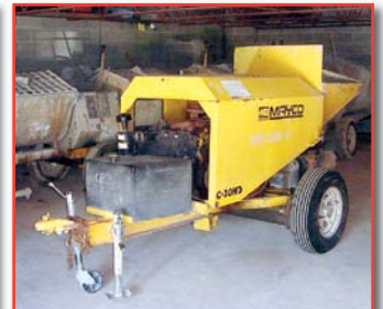
MAYCO GROUT PUMP