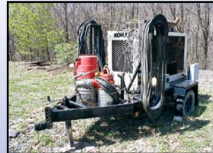
GENERATOR AND SUBMERSIBLE PUMPS

GORMAN RUPP Model 14A2-TS2S/G, 4" Self Priming Centrifugal Pump , s/n 1014744, powered by Lister Petter diesel engine, trailer mounted with P235/75B15 tires. In good condition with good tires.