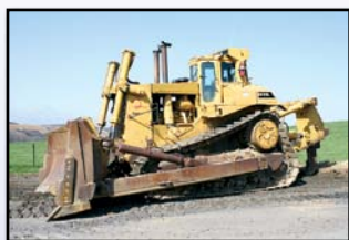
#2 CAT D10

(Unit #1) CATERPILLAR Model D10 Crawler Tractor , s/n 84W00621, powered by Cat D348 diesel engine and powershift transmission, equipped with U blade with hydraulic tilt, 4-barrel single shank ripper with hydraulic pin puller, 6.5" rail height, ROPS over enclosed cab with heat and air conditioning, light package, and 32" SBG pads. In good