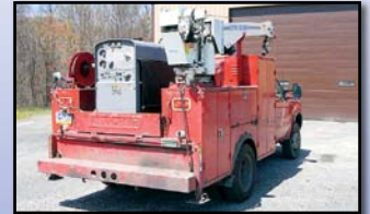
'98 FORD F-450 4X4

GODWIN Model CD150 Dri-Prime, 4" Centrifugal Pump , s/n 943718-34, powered by John Deere diesel engine, trailer mounted with F78x15 tires. In good condition with good tires.