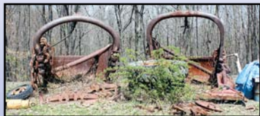
ESCO AND HENDRIX 7 CUBIC YARD

1981 MANITOWOC Model 4600 Vicon Crawler Dragline , s/n 46544, powered by Cummins KTA-19-600 and Cummins N-855-C235 diesel engines and torque converters, equipped with 140' of bolt-together boom, Esco 7 cubic yard bucket, air controls, fairlead, Detroit diesel light plant, heat and air conditioning, and 60" pads. In good condition with good