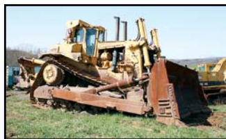
#1 CAT D10

condition with good undercarriage. (Rebuilt Engine; Torque; Steering Valve @ 1,489 Hours; Left Final @ 4,747 Hours)