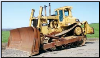
#3 CAT D10

(Unit #2) CATERPILLAR Model D10 Crawler Tractor , s/n 84W00947, powered by Cat D348 diesel engine and powershift transmission, equipped with U blade with hydraulic tilt, 4-barrel single shank ripper, s/n 82W00789, 6.5" rail height, ROPS over enclosed cab with heat and air conditioning, light package, and 32" SBG pads. In good condition with fair to good undercarriage.