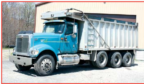
02 IHC 9900i