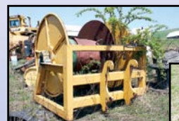
CAT IT12 HOSE REEL